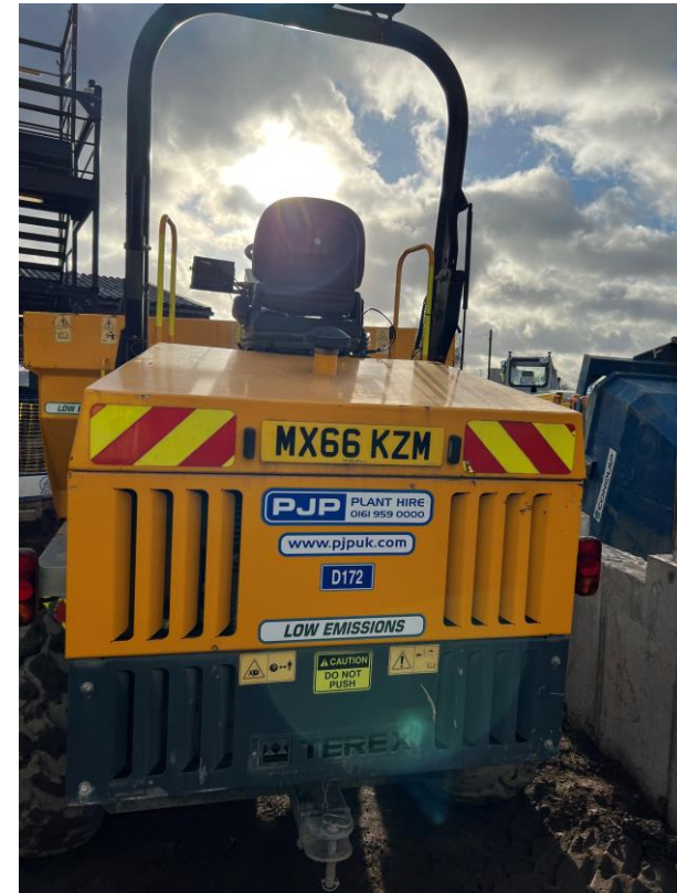
Block A – Site plant