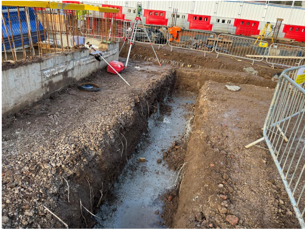
Block B – Capping beam concrete poured