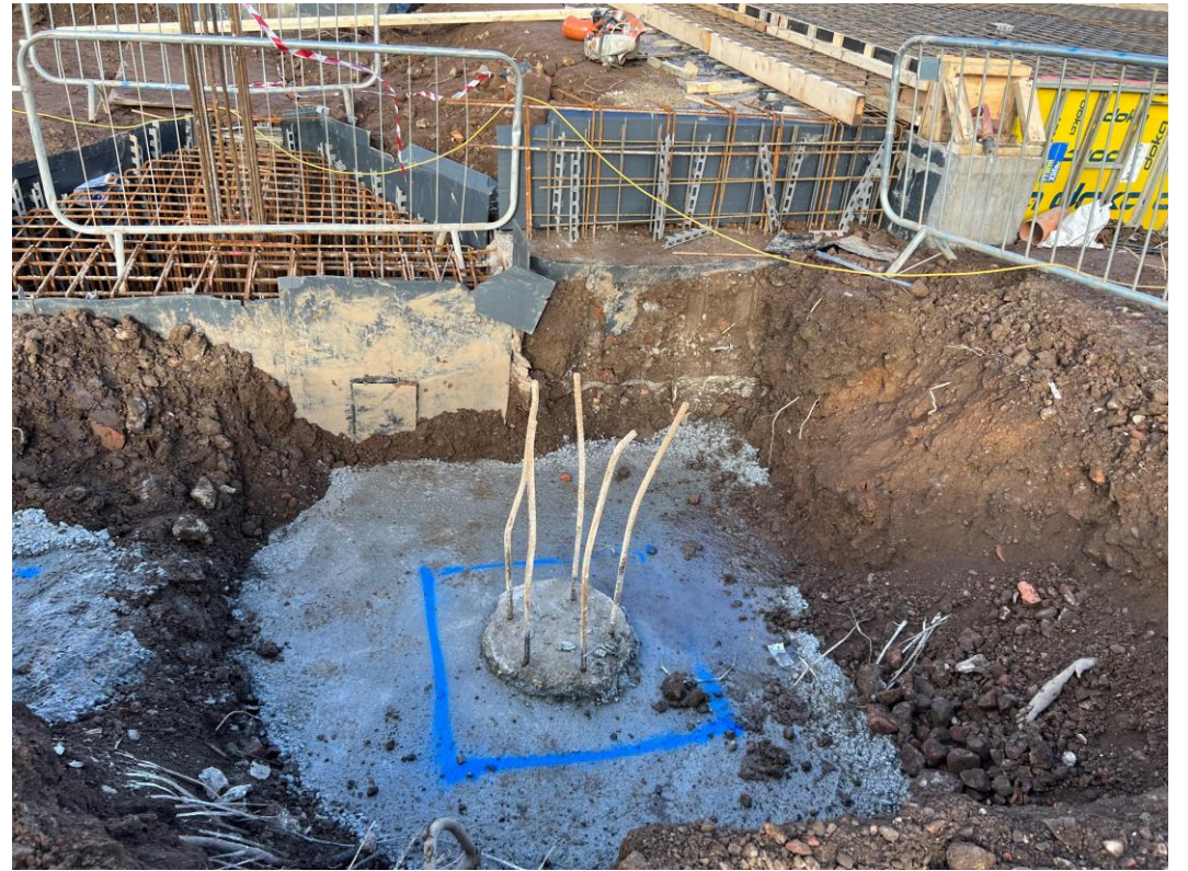
Block B – Pad foundation concrete poured