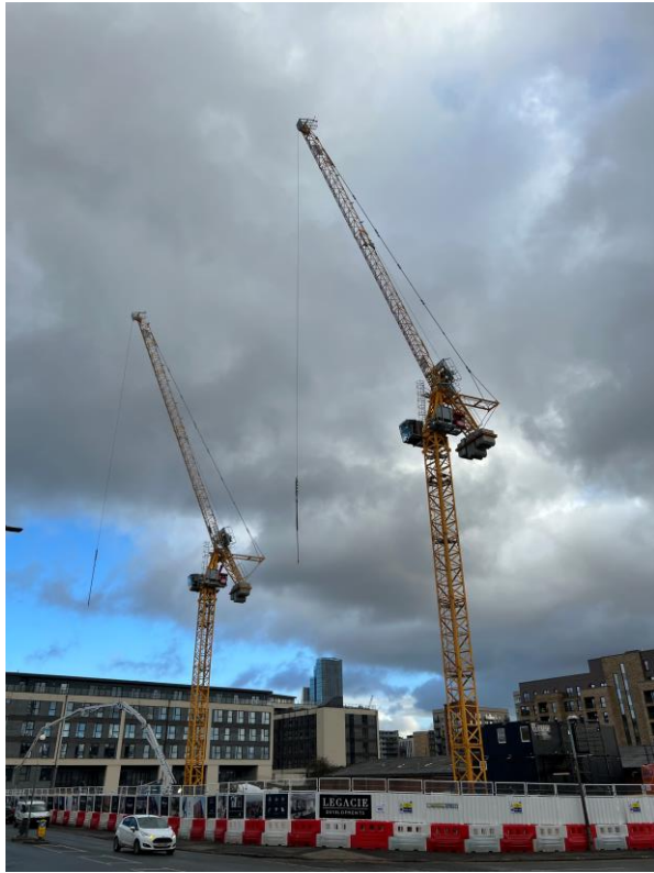
Ordsall Lane site view