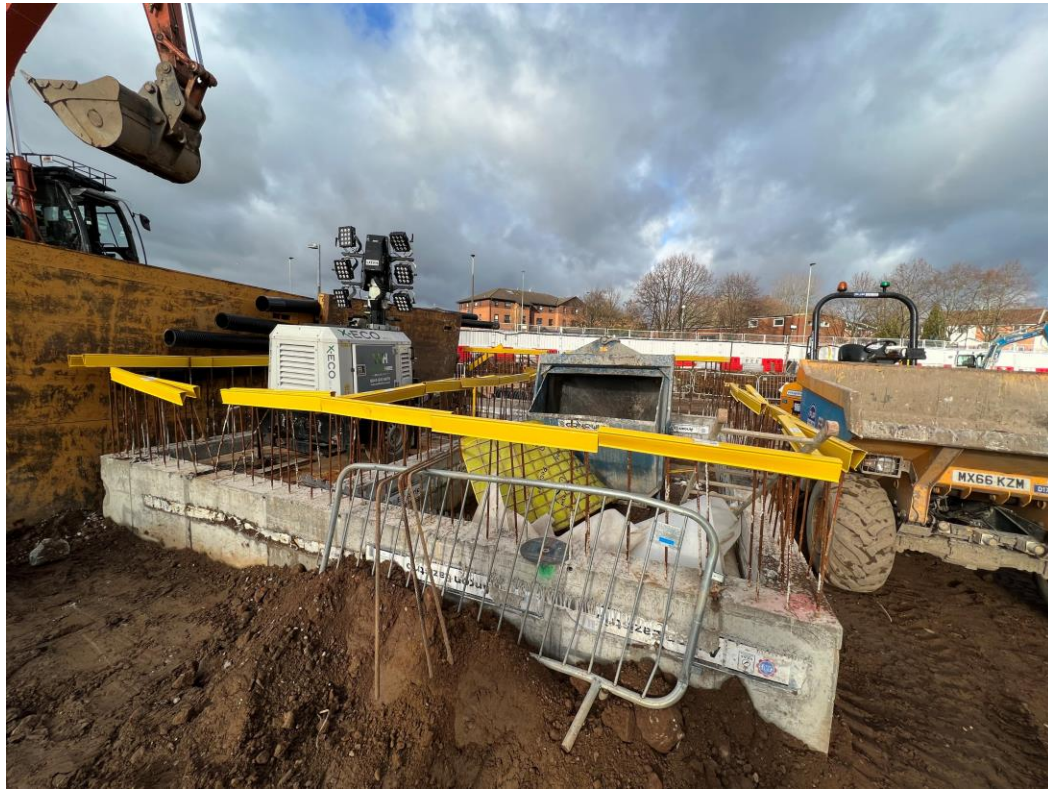
Block A – Stair core