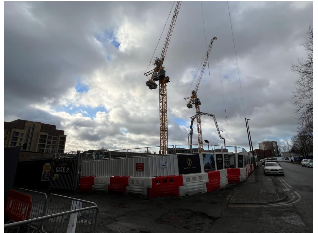
Ordsall Lane site view