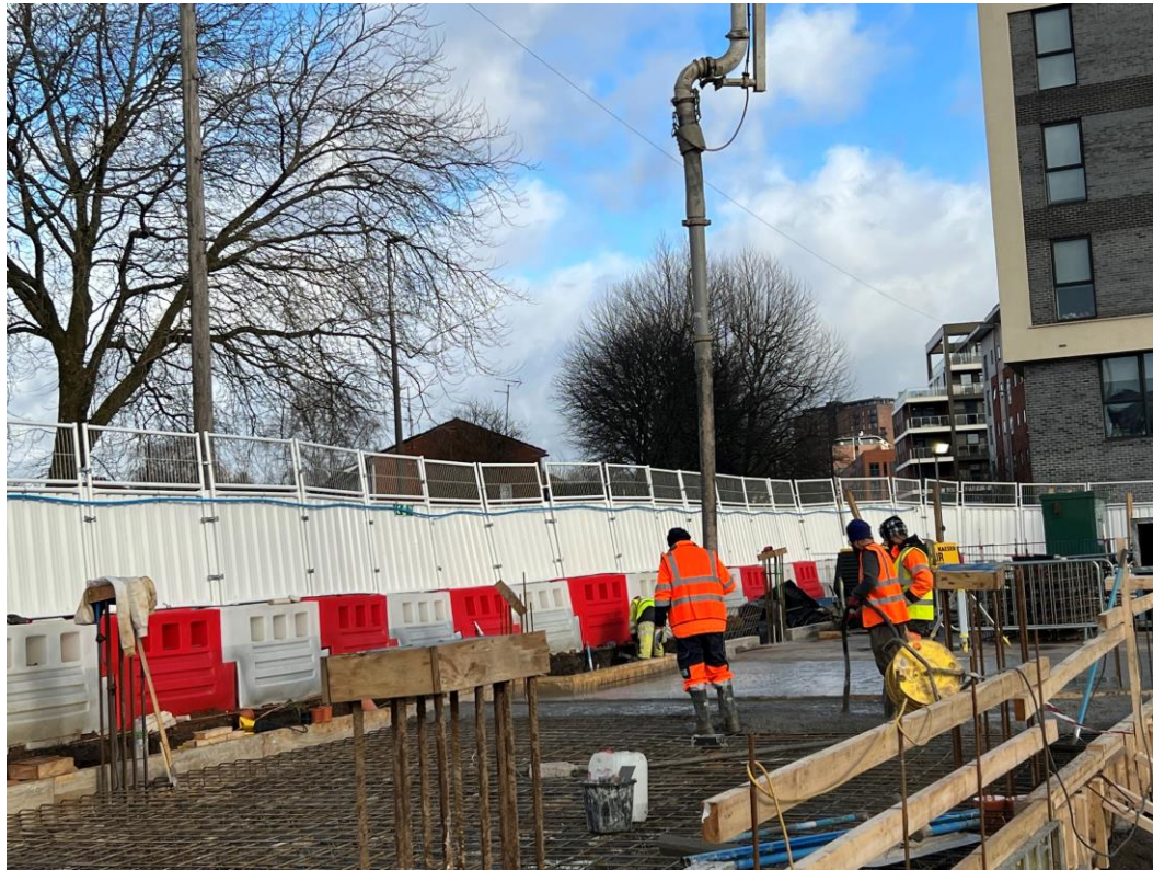
Block B – Floor slab under construction