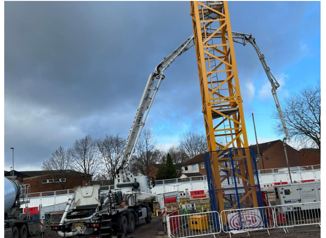
Block B – Floor slab under construction