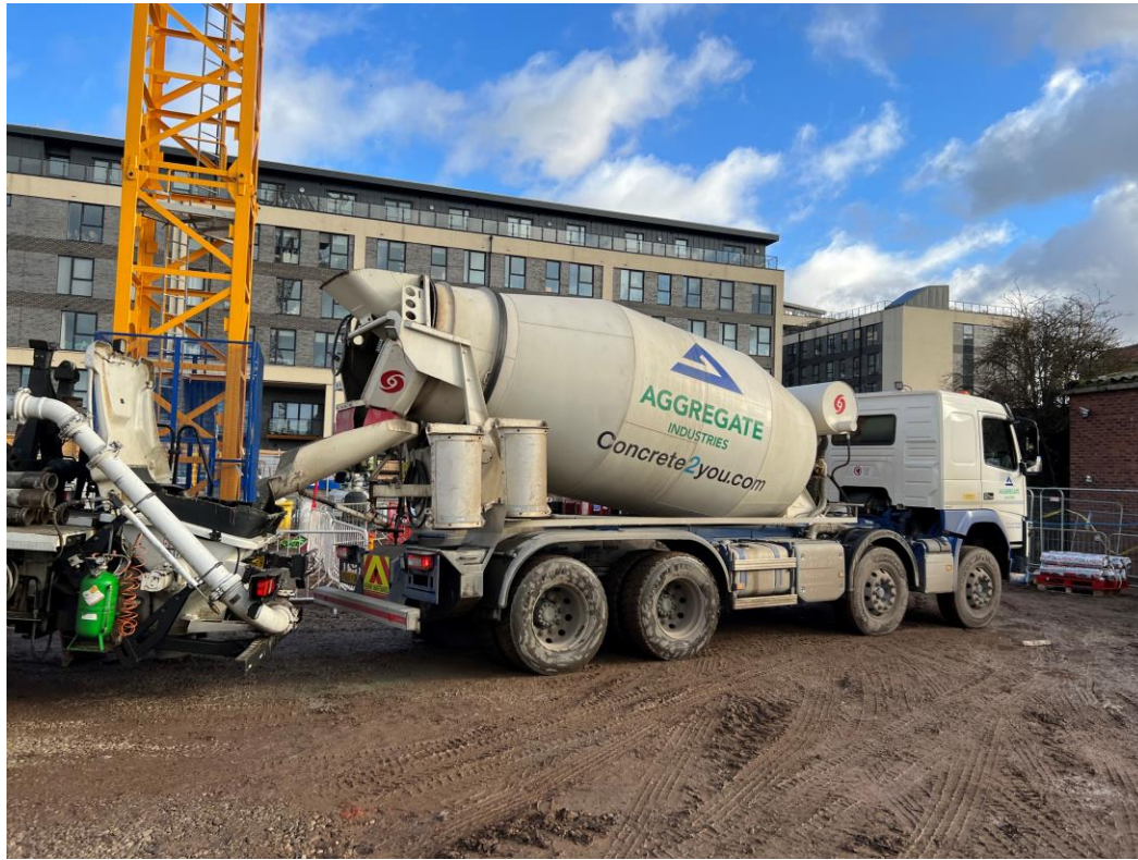
Block B – Floor slab under construction