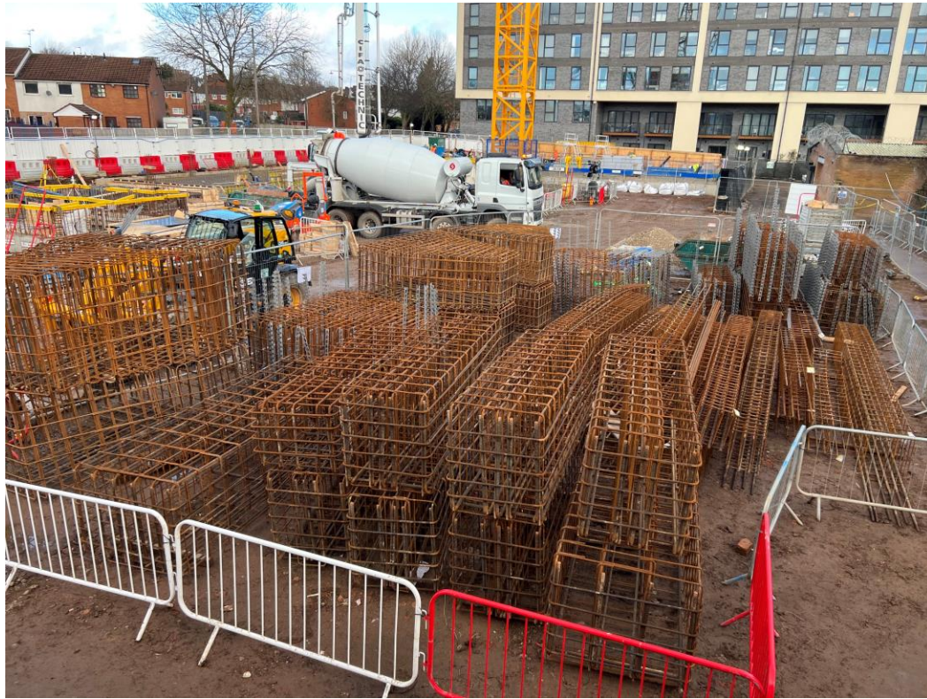
Reinforcement cages pad foundations, capping beams & columns