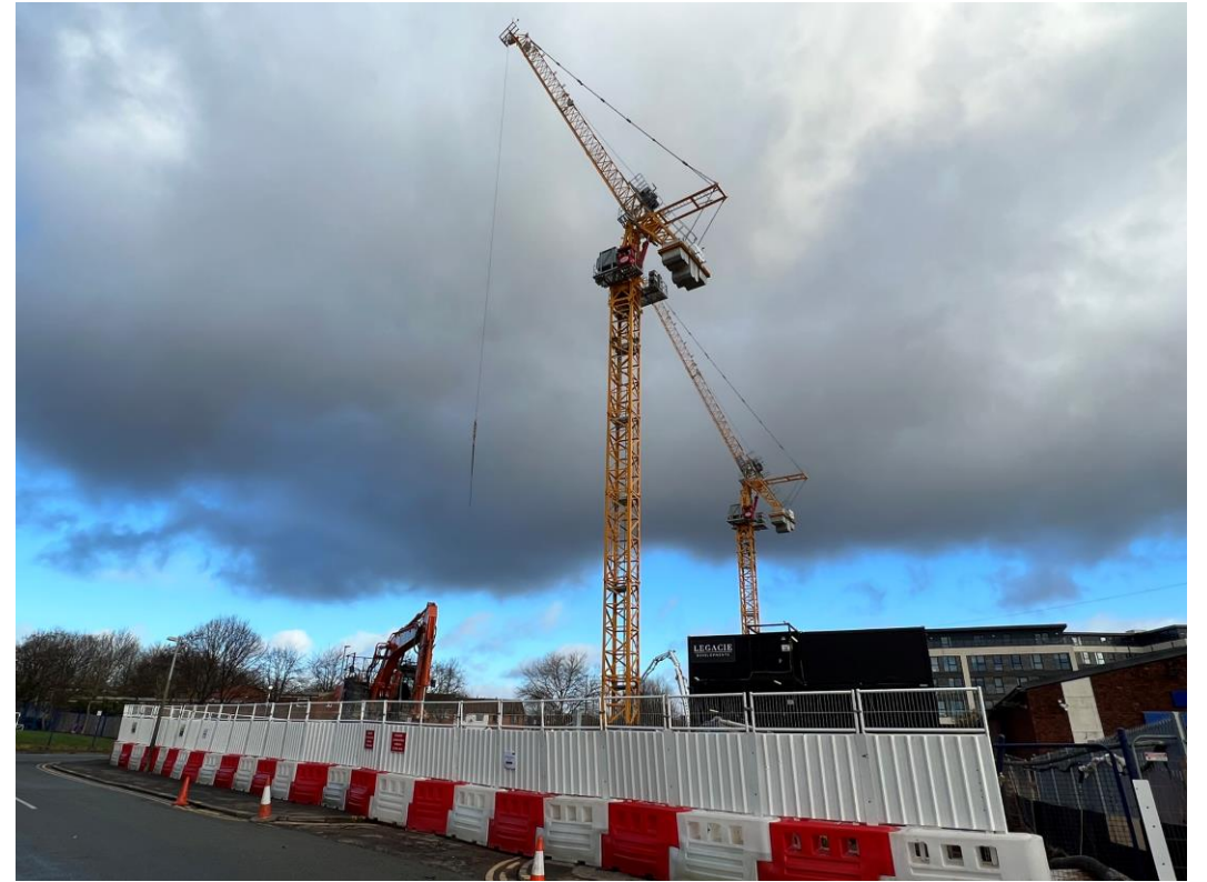
Worrall Street site view