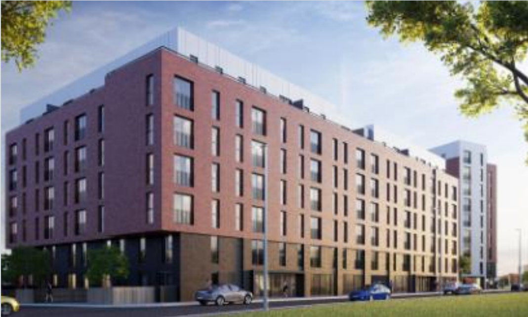
Land at corner of Ordsall Lane, Dyer Street & Worrall Street, Salford, Manchester M5