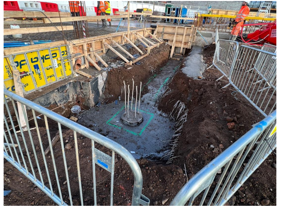
Block B – Pad foundation and capping beam concrete poured