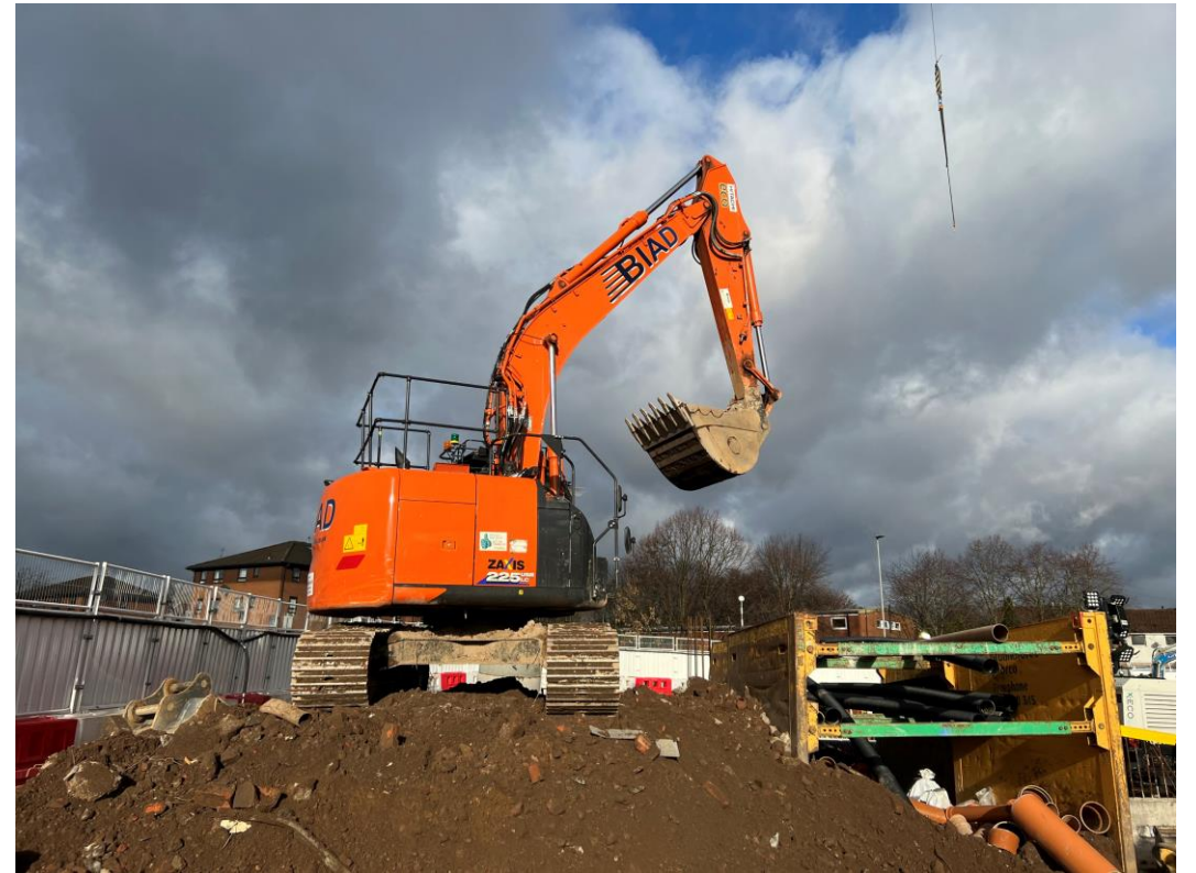
Block A – Site levelling