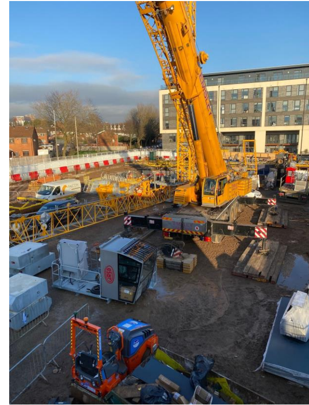
Crane under construction