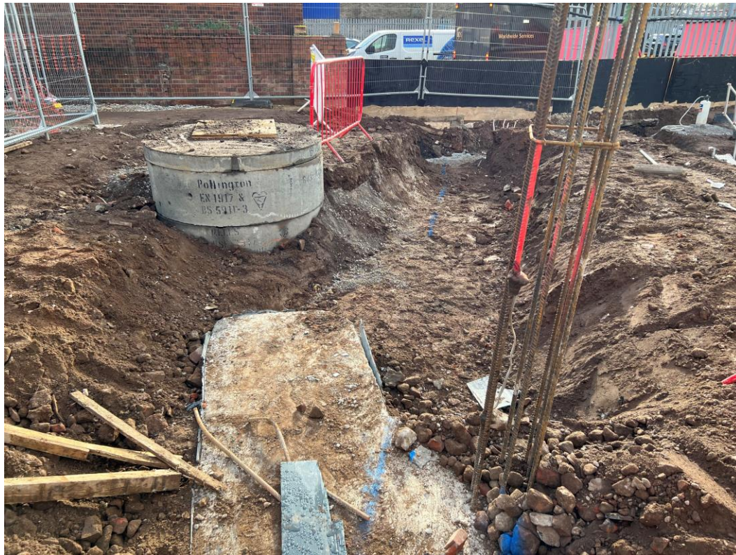
Block A – Drainage