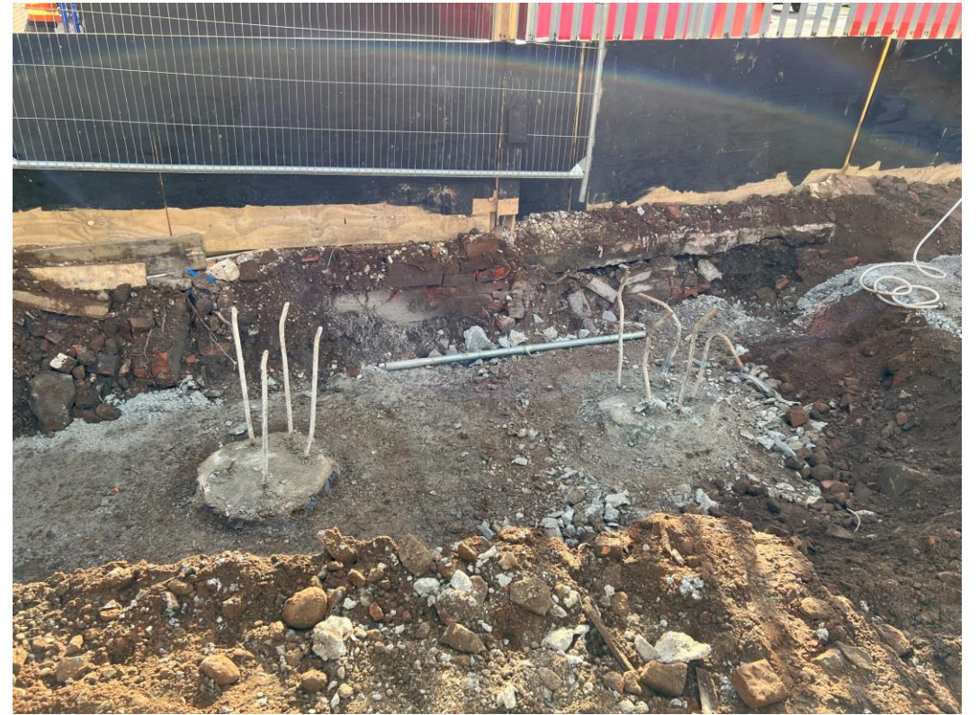
Block A - Capping under construction