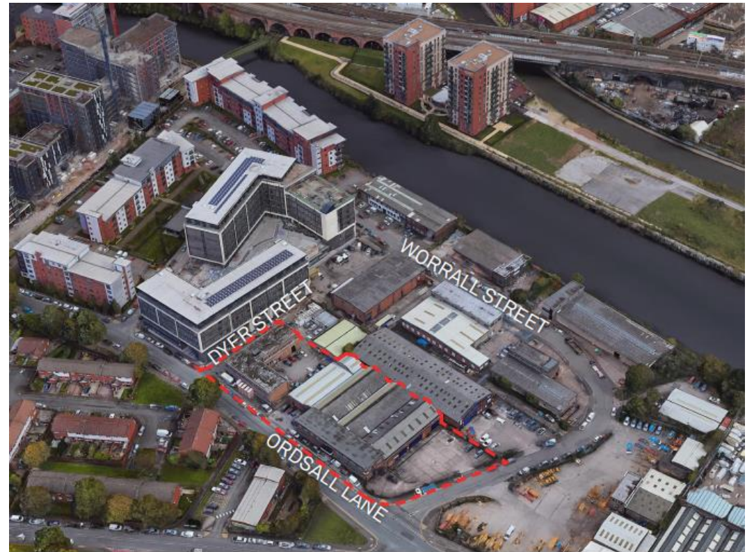
Aerial view of Merchant's Wharf site location