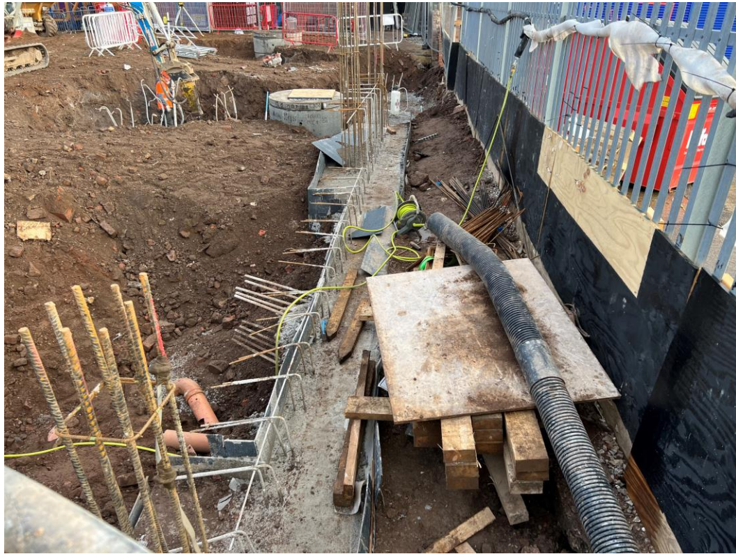
Block A - Capping beam installed