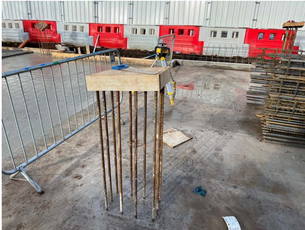
Block B – Column starter bars