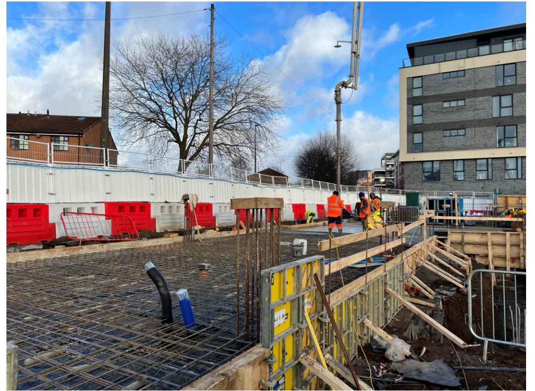
Block B – Floor slab under construction