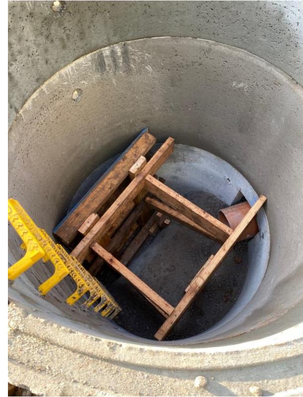
Below ground drainage