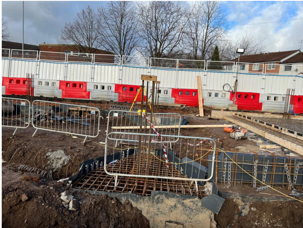
Block B – Pad foundation under construction