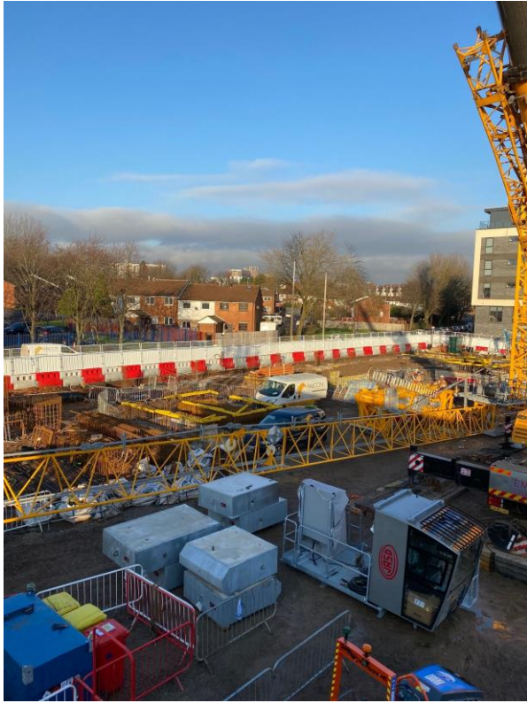
Crane under construction