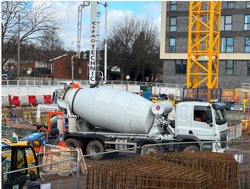
Block B – Floor slab under construction