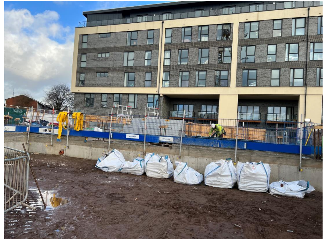
Block B – Pile capping under construction