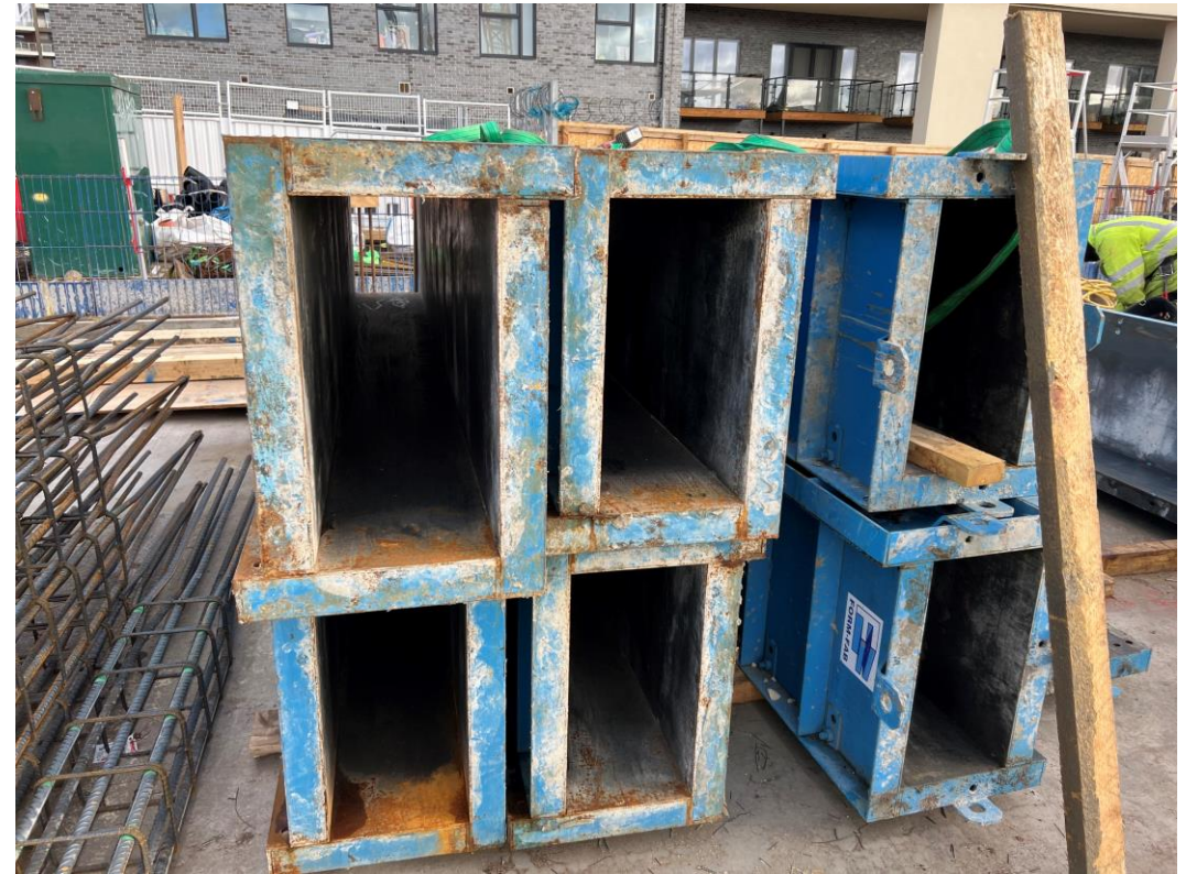
Block B – Column shuttering