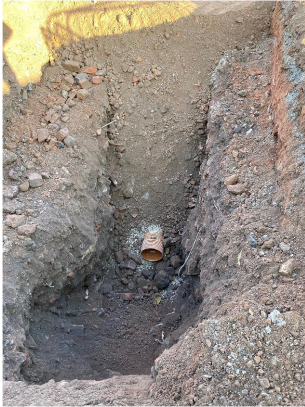
Below ground drainage