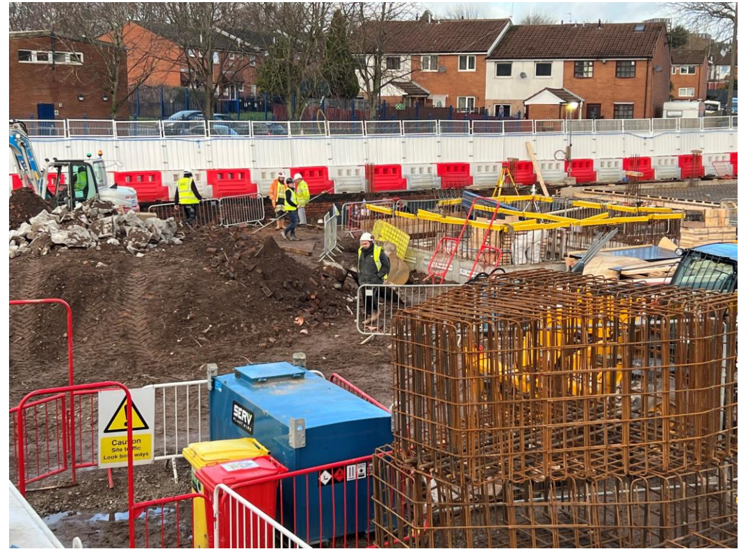
Reinforcement cages pad foundations