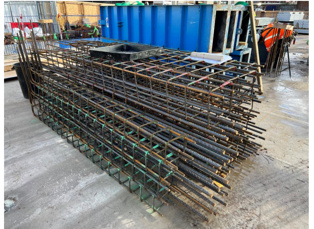
Block B – Column reinforcement cages