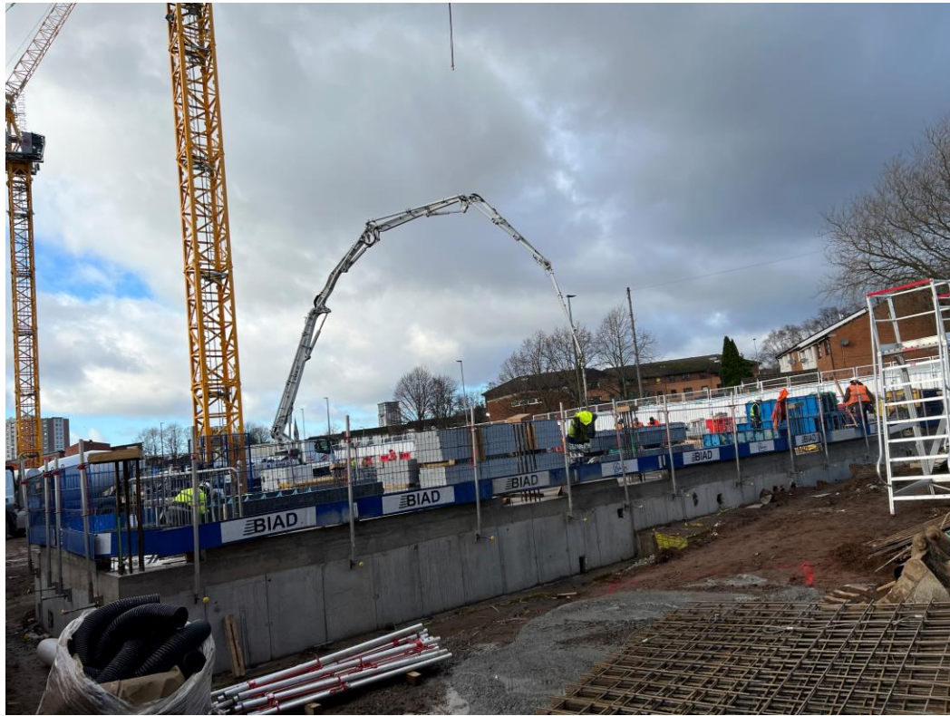
Block B – Floor slab under construction