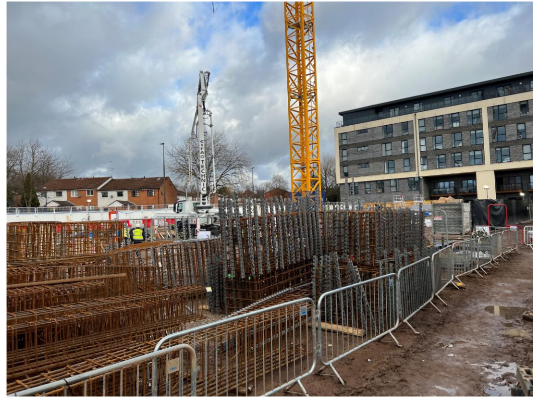
Reinforcement cages capping beams & columns