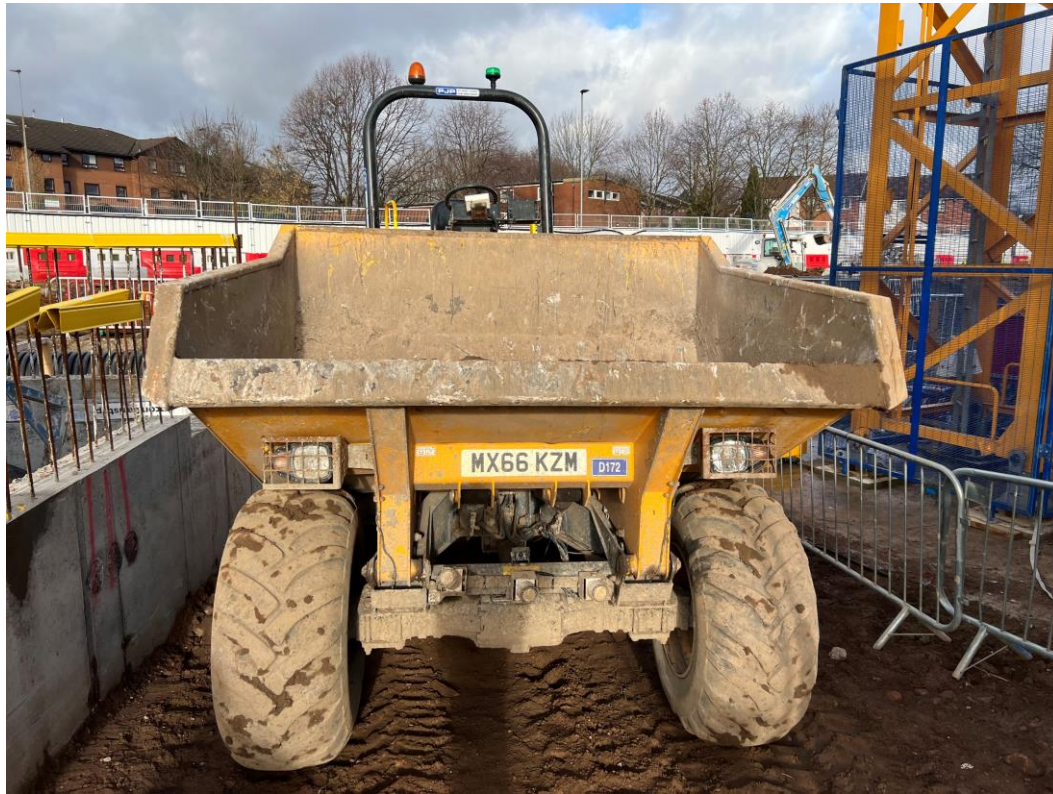
Block A – Site plant