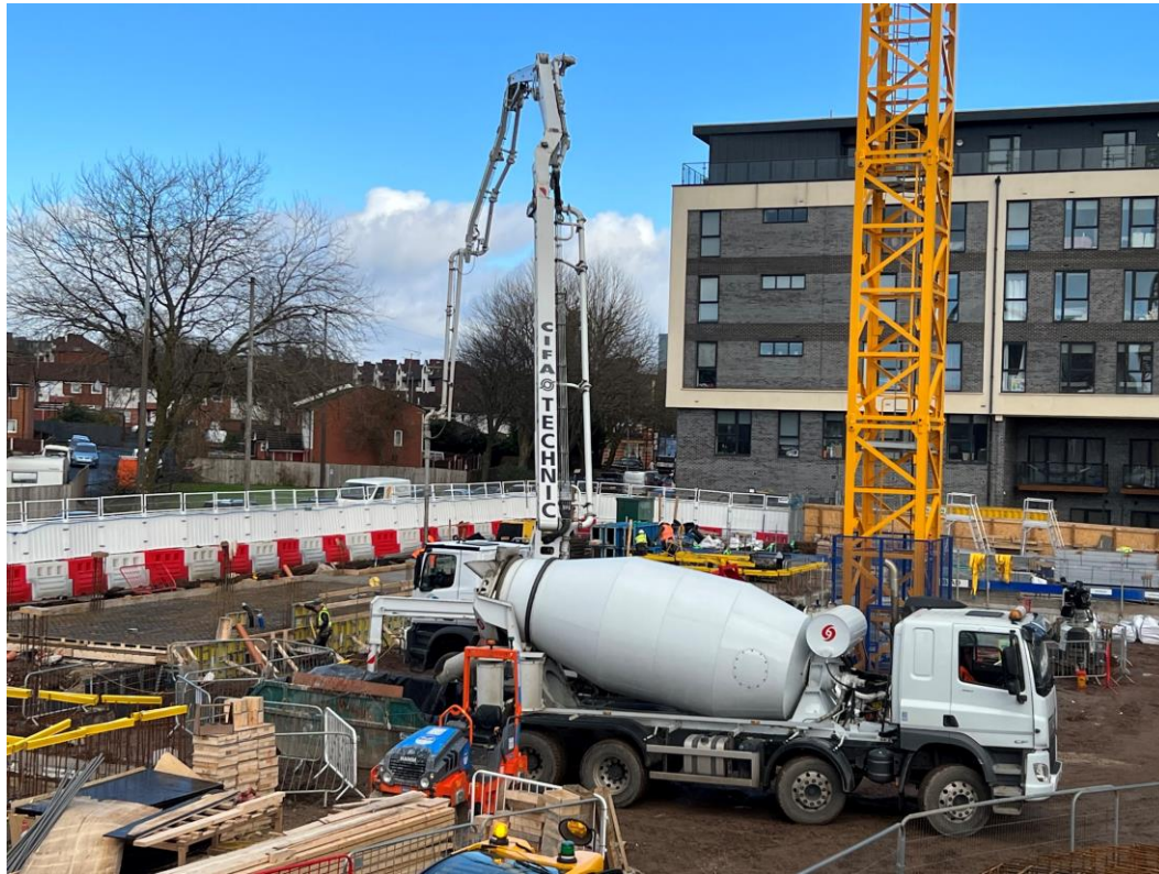
Block B - General site activity constructing capping beams and slab