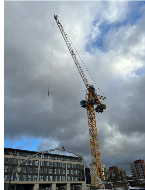
Ordsall Lane site view