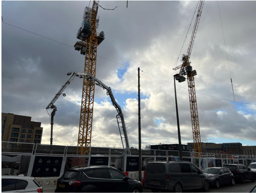
Ordsall Lane site view