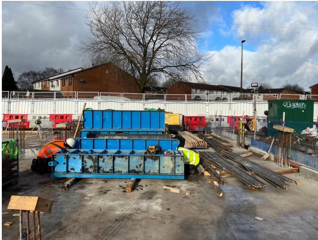
Block B – Column shuttering