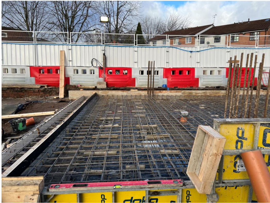
Block B – Floor slab under construction