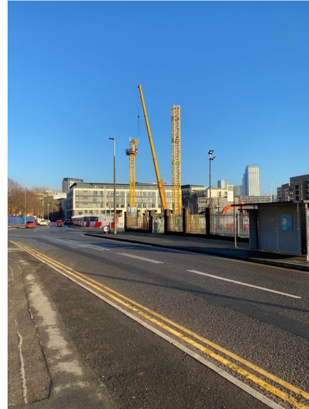
Ordsall Lane site view