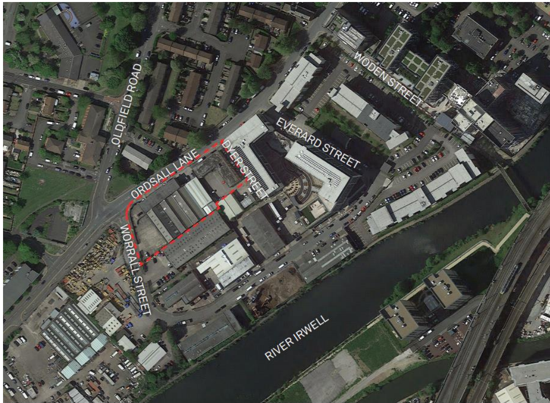
Aerial view of Merchant's Wharf site location