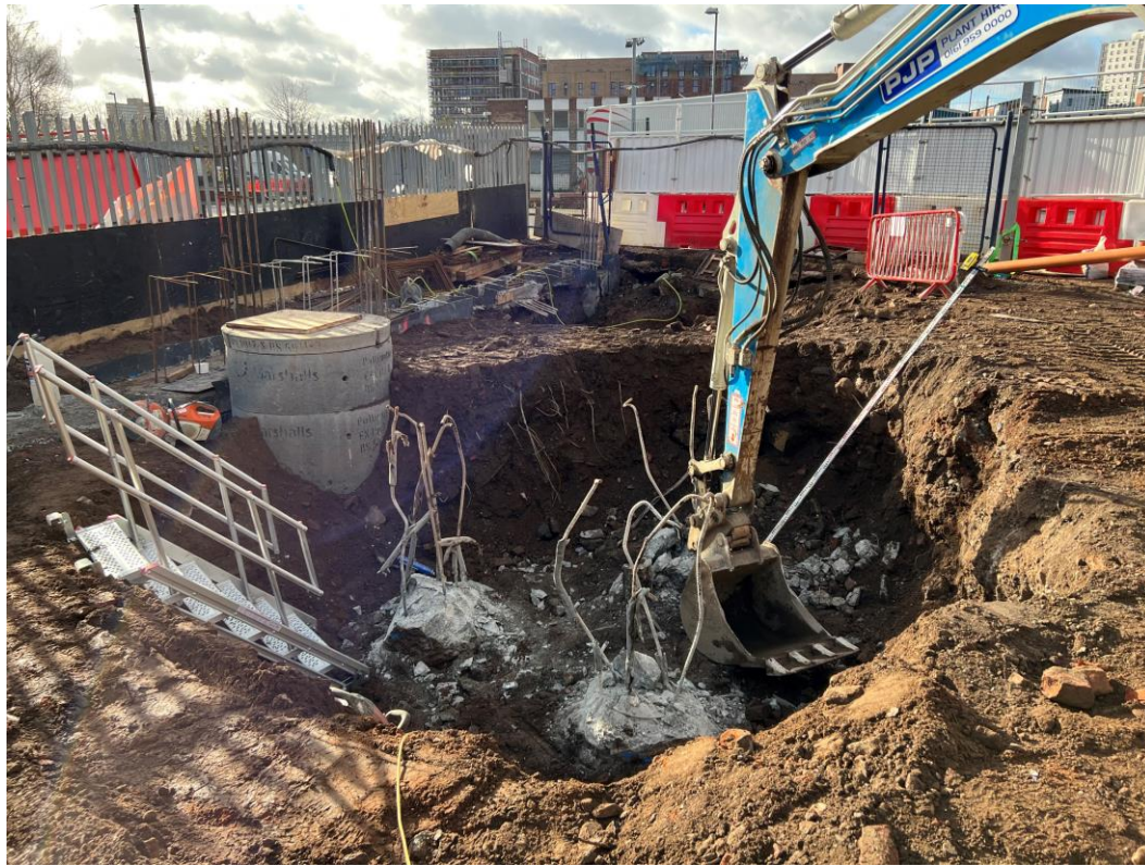
Block A – Pile Capping