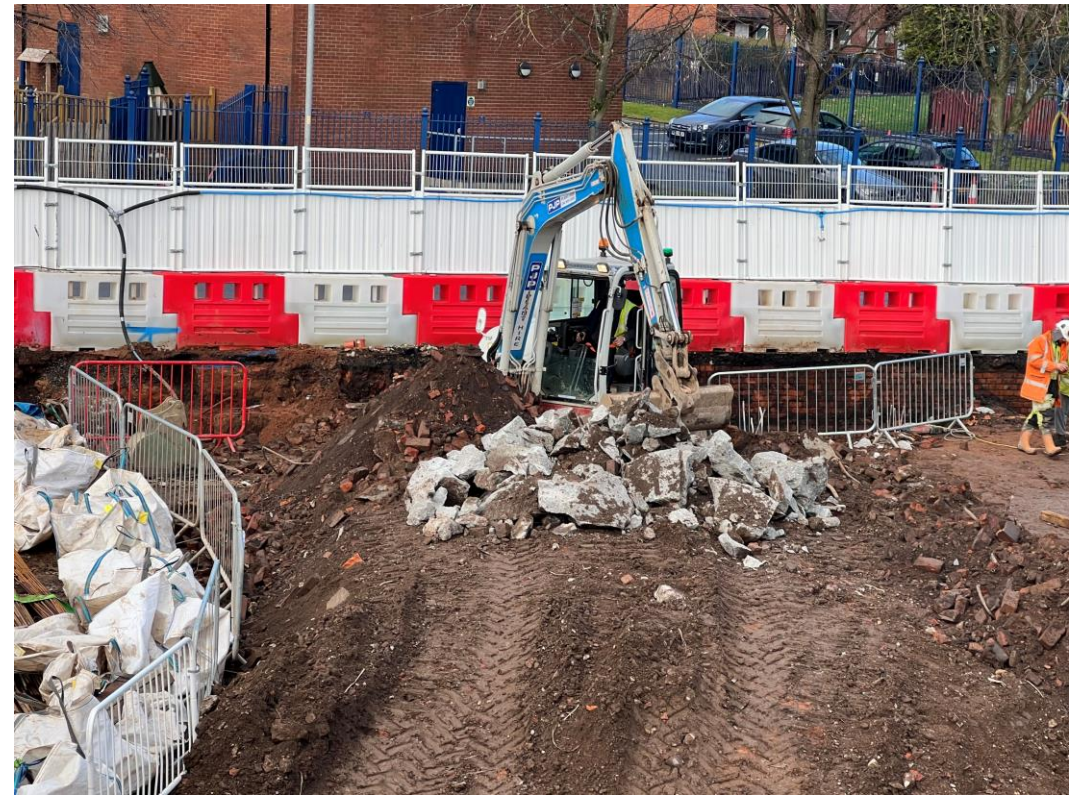
Block B – Pile capping under construction