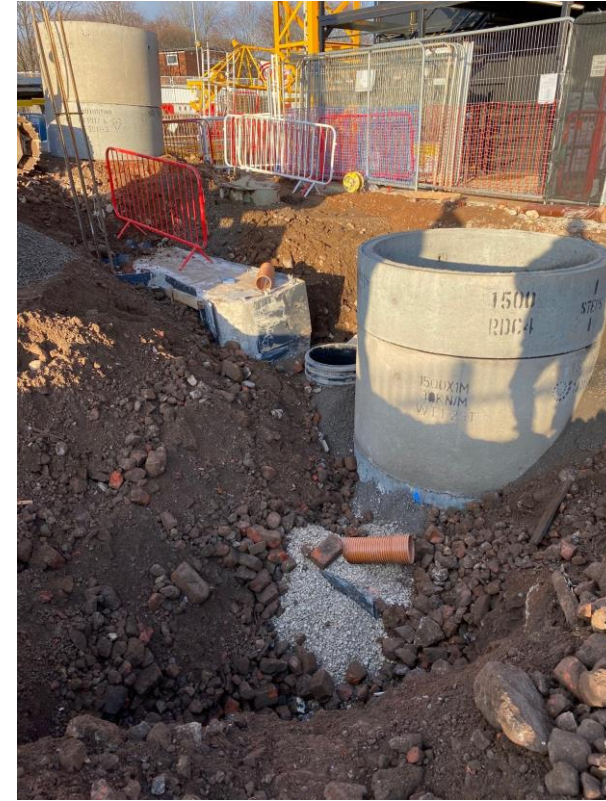
Below ground drainage