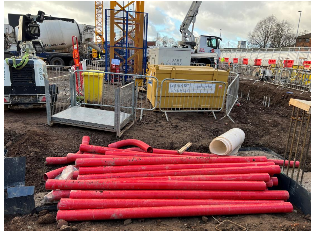
Block B – Services ducting