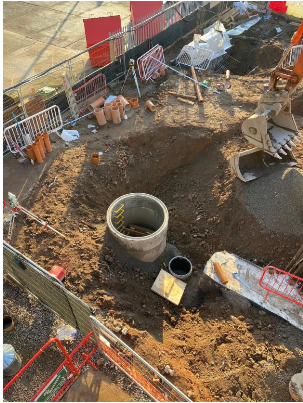
Below ground drainage