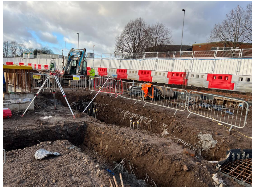
Block B – Capping beam under construction