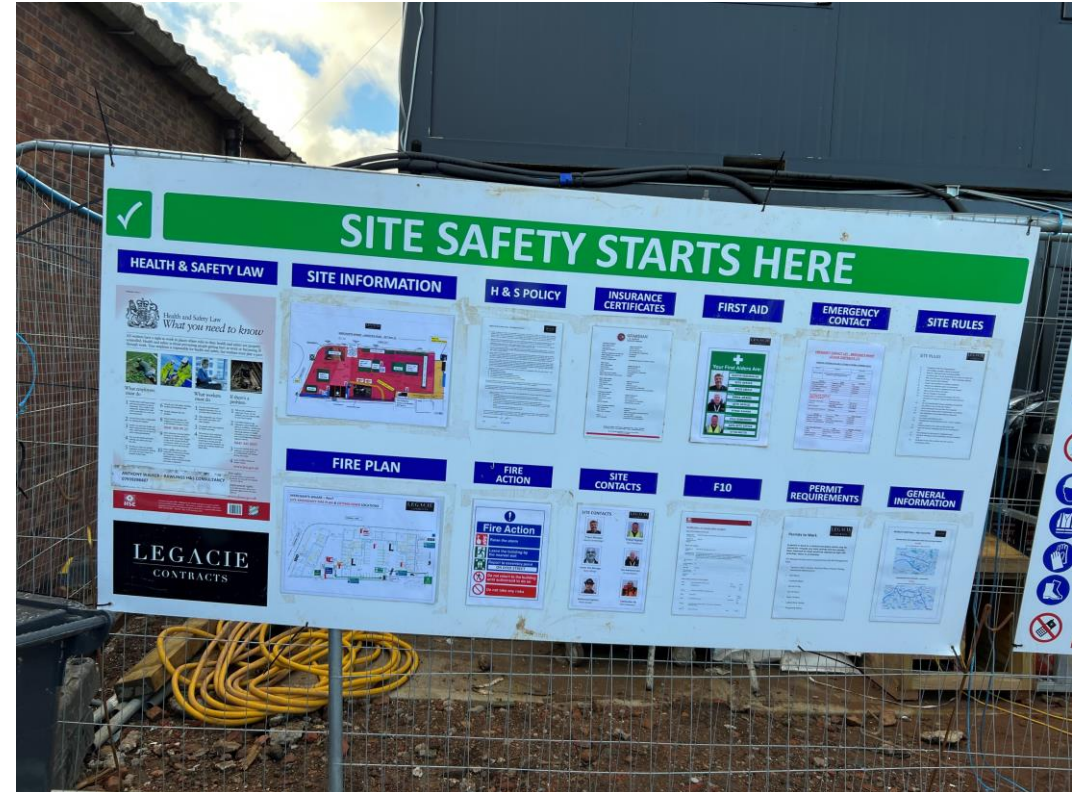
Site safety information