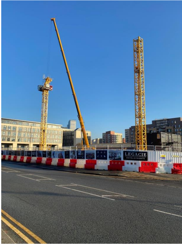
Ordsall Lane site view