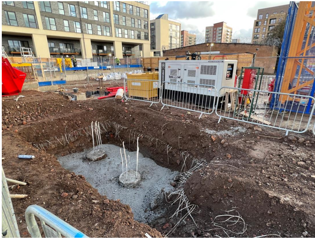
Block B – Pad foundation concrete poured