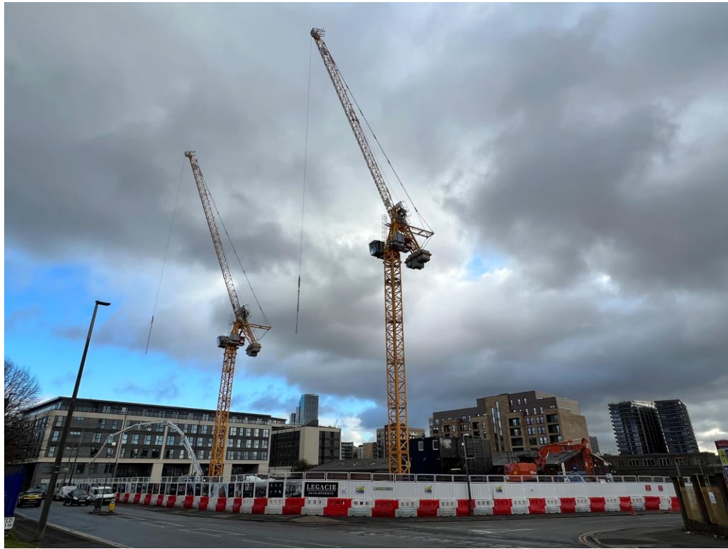
Ordsall Lane site view