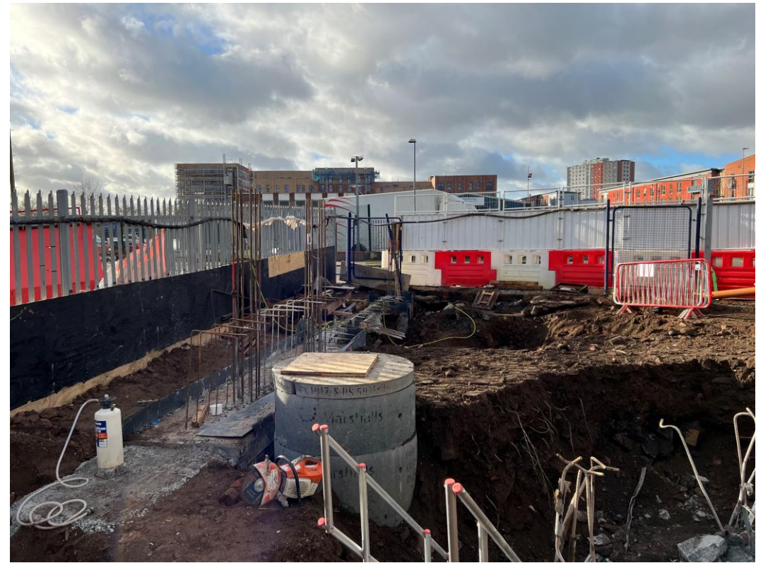
Block A - Capping under construction