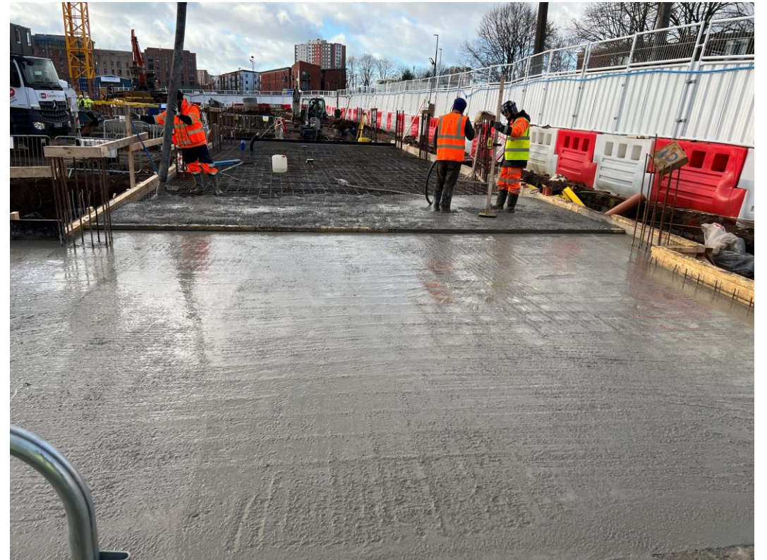
Block B – Floor slab under construction