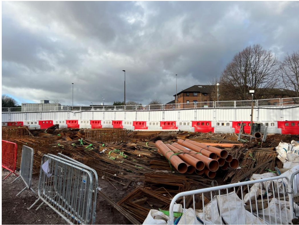
Block A – Drainage & reinforcement materials