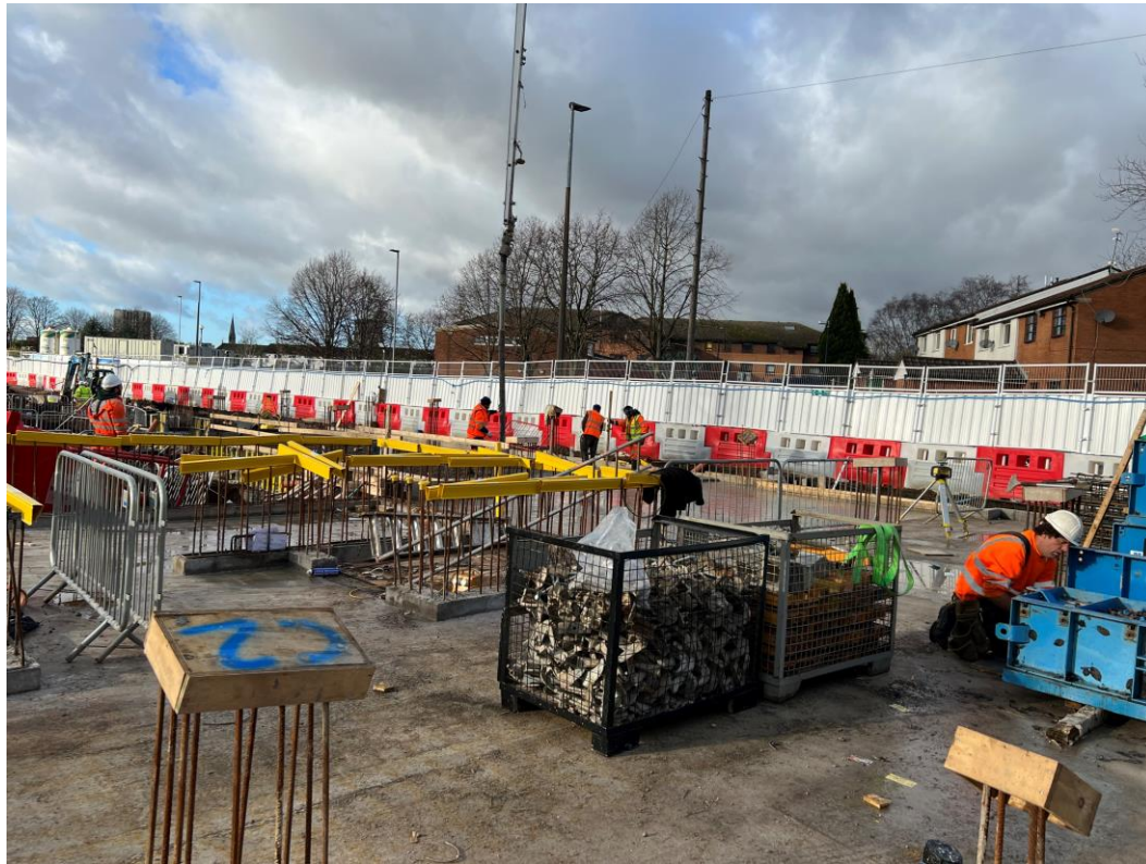
Block B – Floor slab under construction