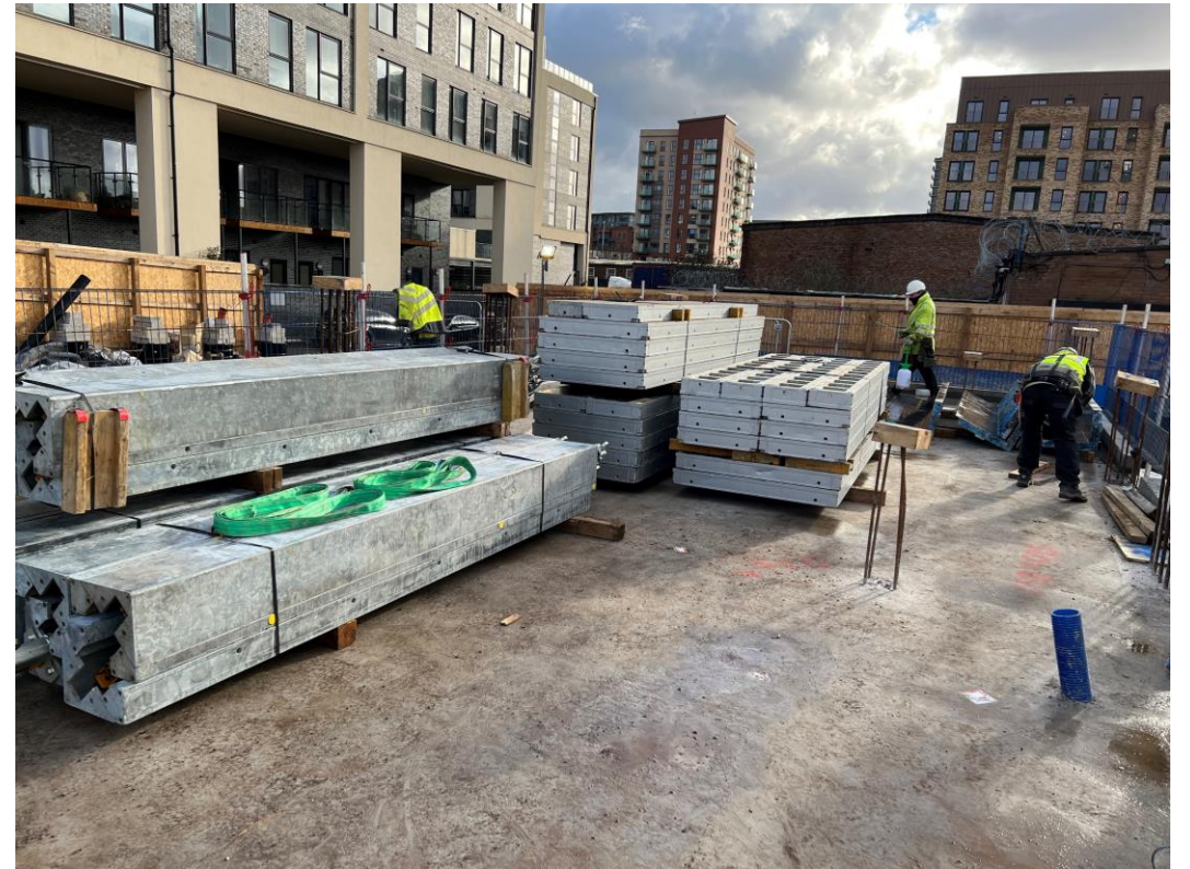
Block B – Pile capping under construction