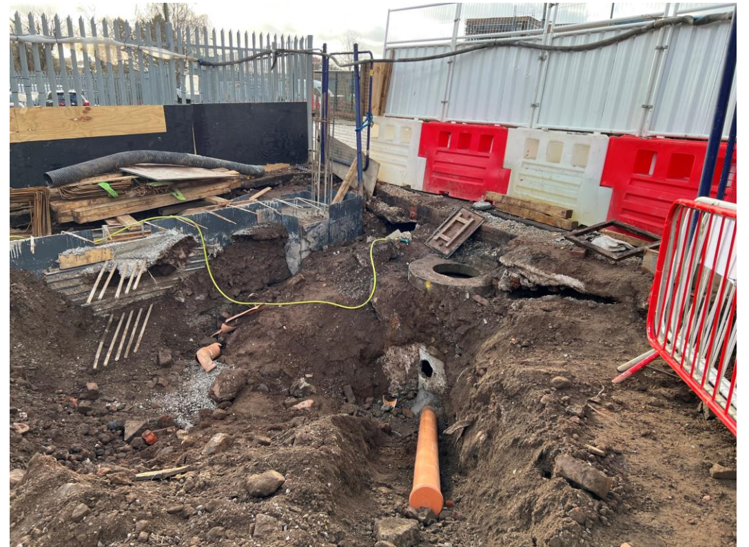
Block A - Drainage