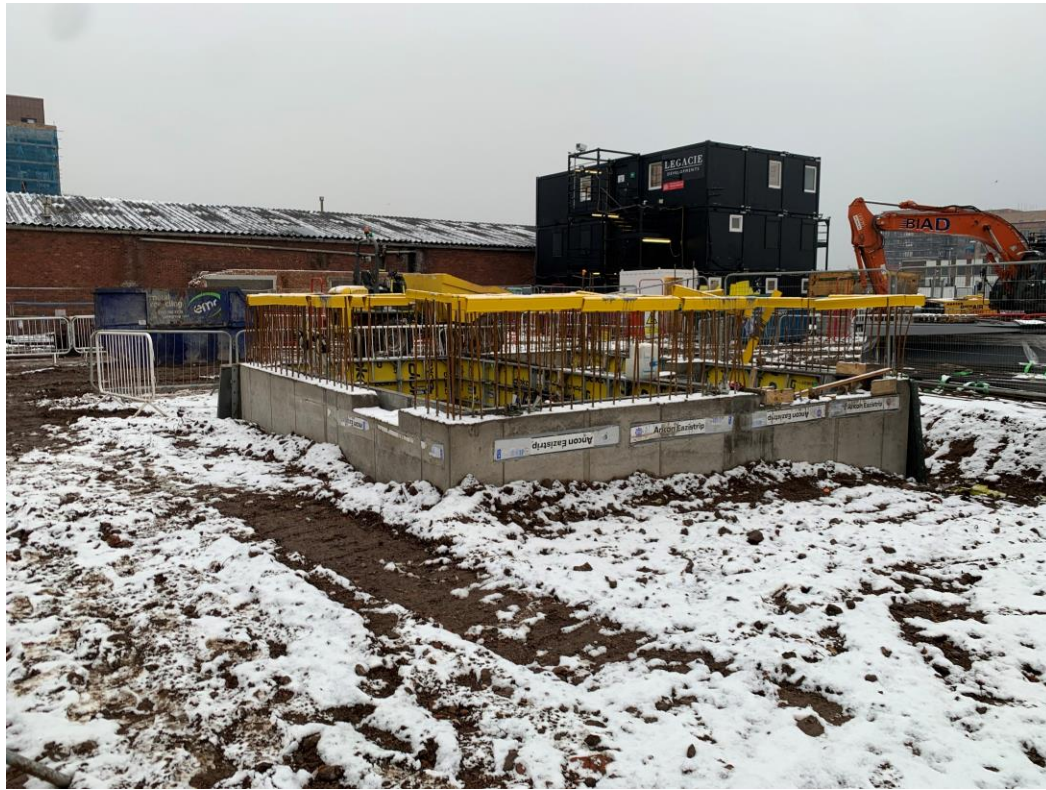
Block B – Core substructure