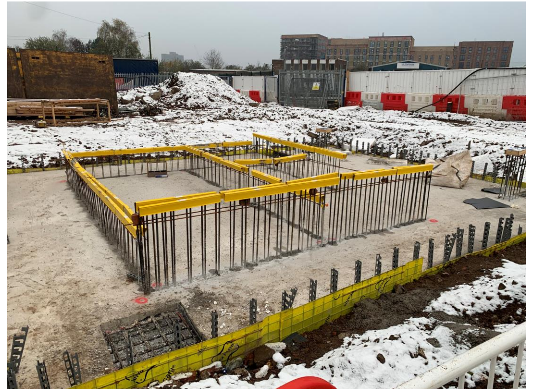
Block A - Core substructure