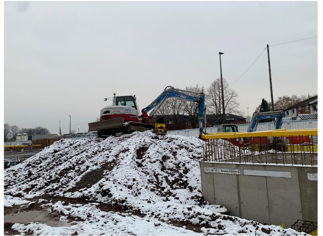
Site activity plant and machinery