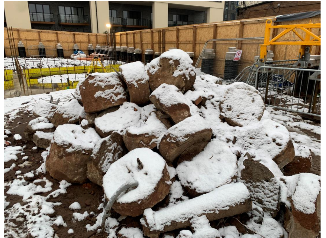
Block B – Piling tops removed