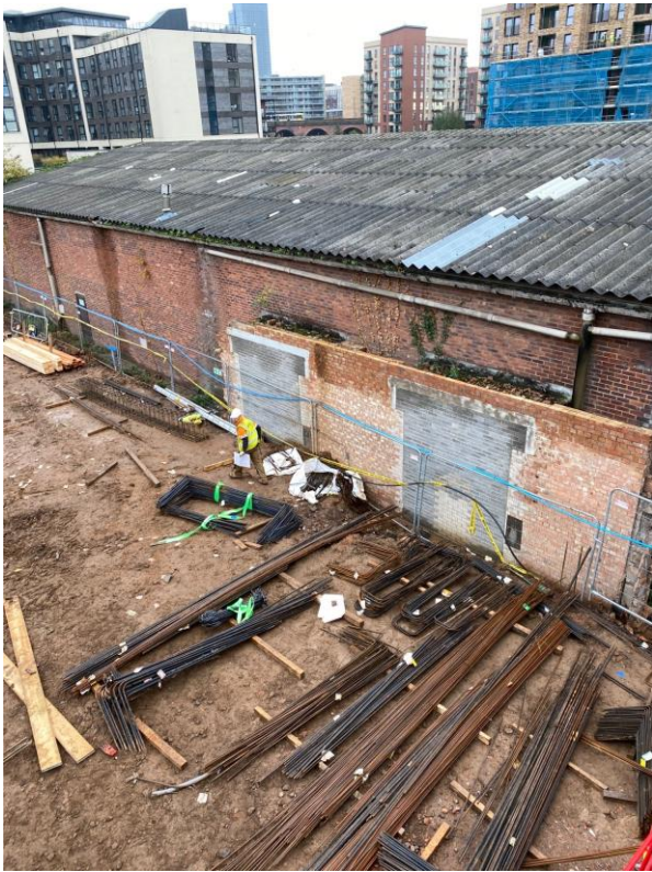
Foundation reinforcement stored