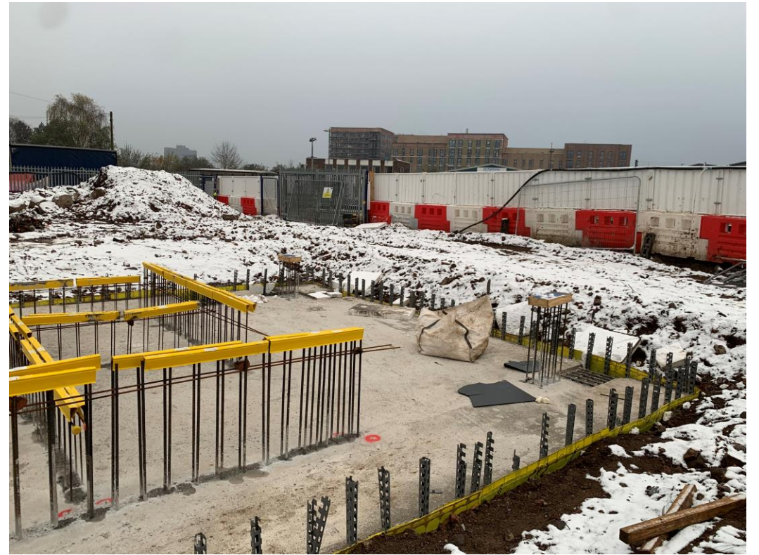
Block A - Core substructure