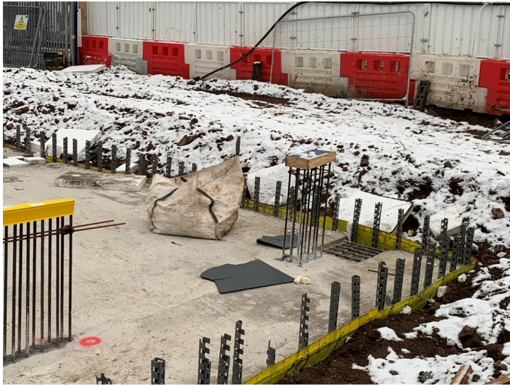
Block A - Core substructure