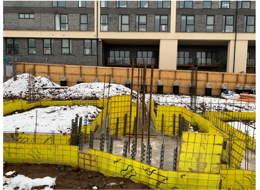
Block B – Ground beam substructure