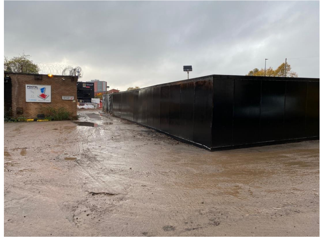
Worrall Lane site plant & deliveries entrance