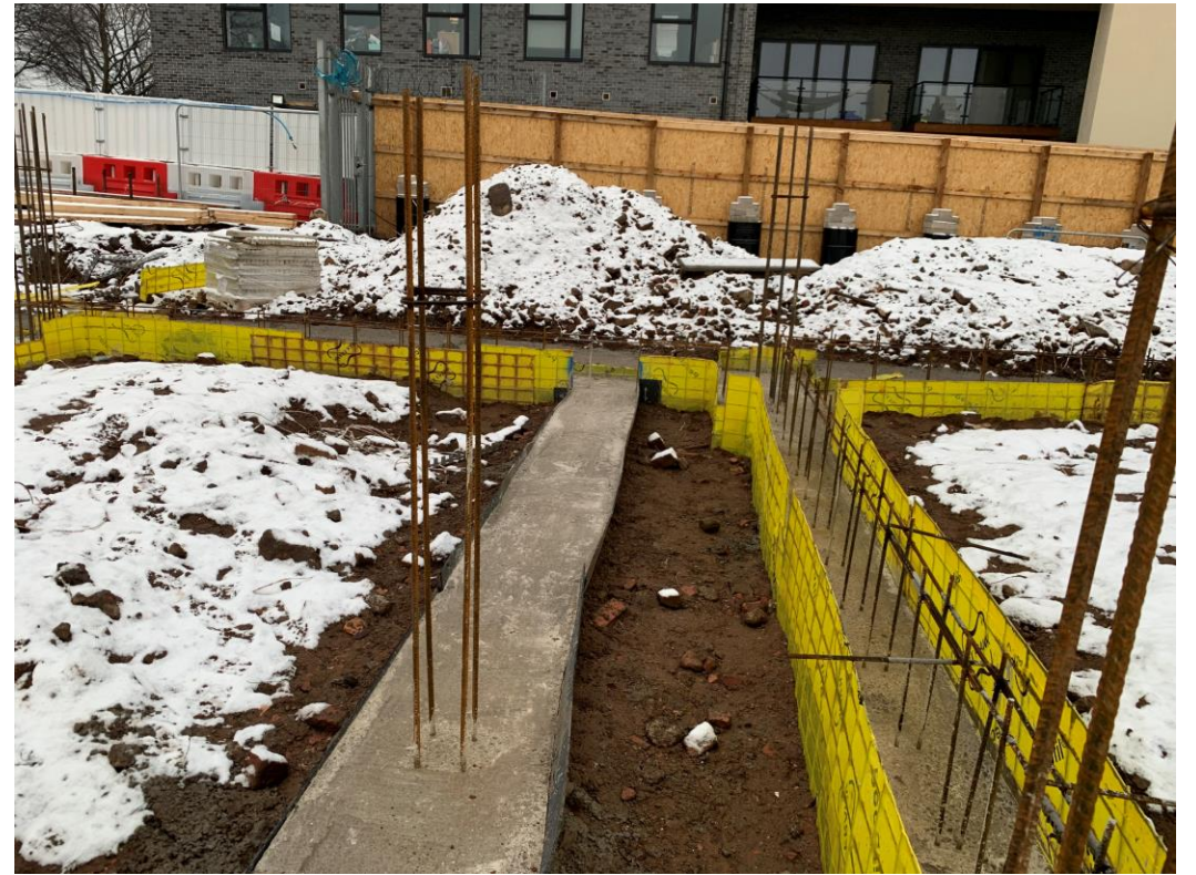
Block B – Ground beam substructure