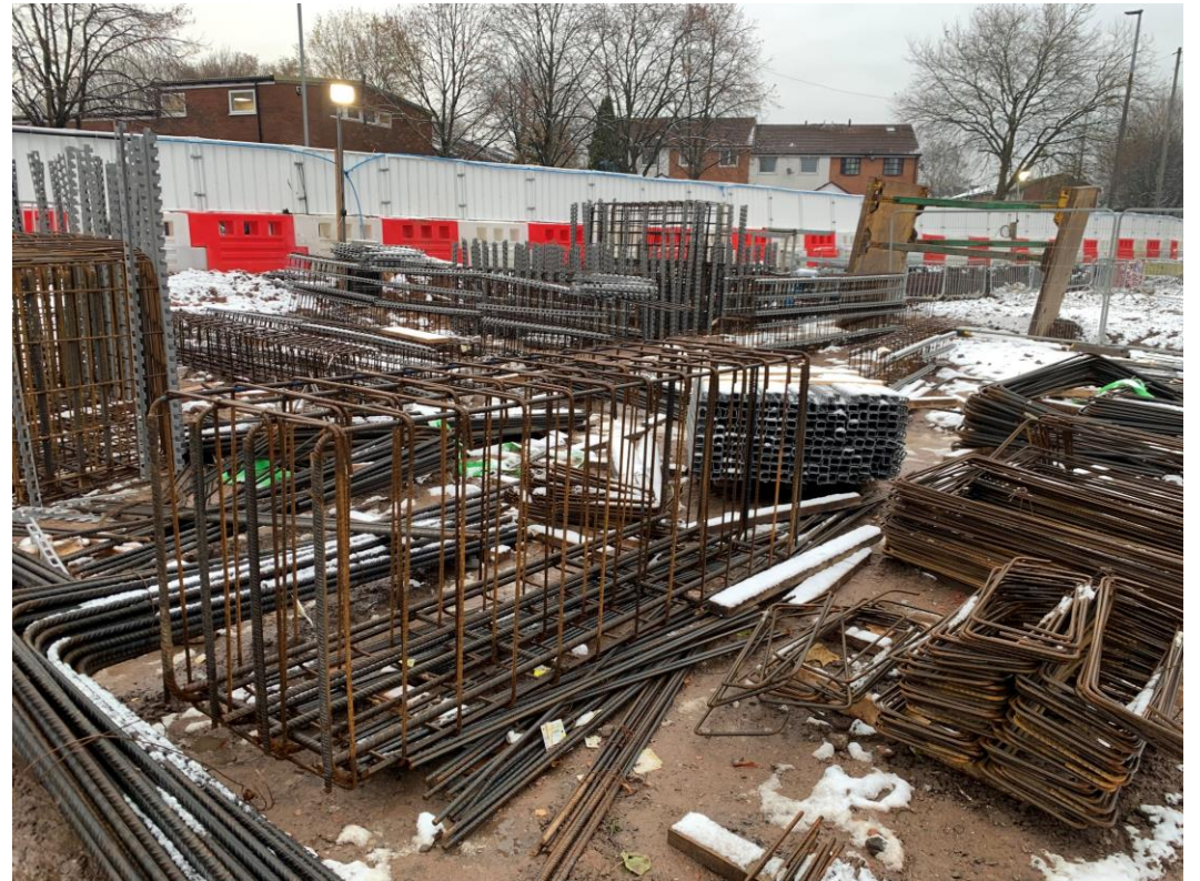
Foundation reinforcement cages being formed and stored