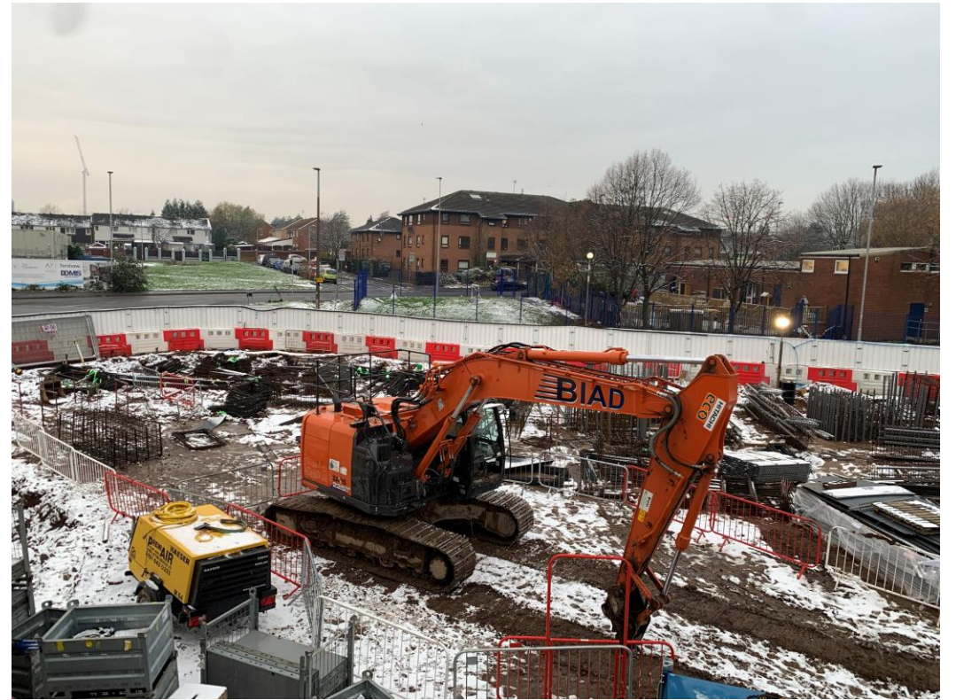
Site activity plant and machinery