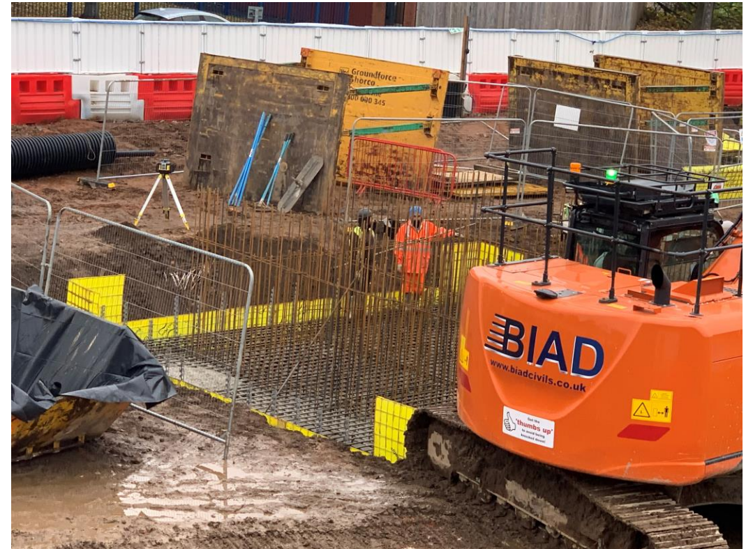
Site activity forming core foundation