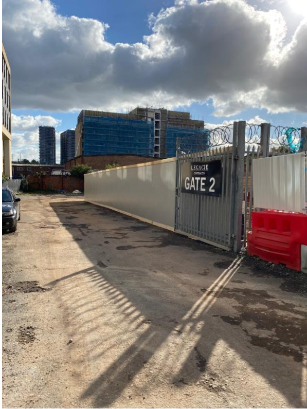
Worrall Lane site plant & deliveries entrance