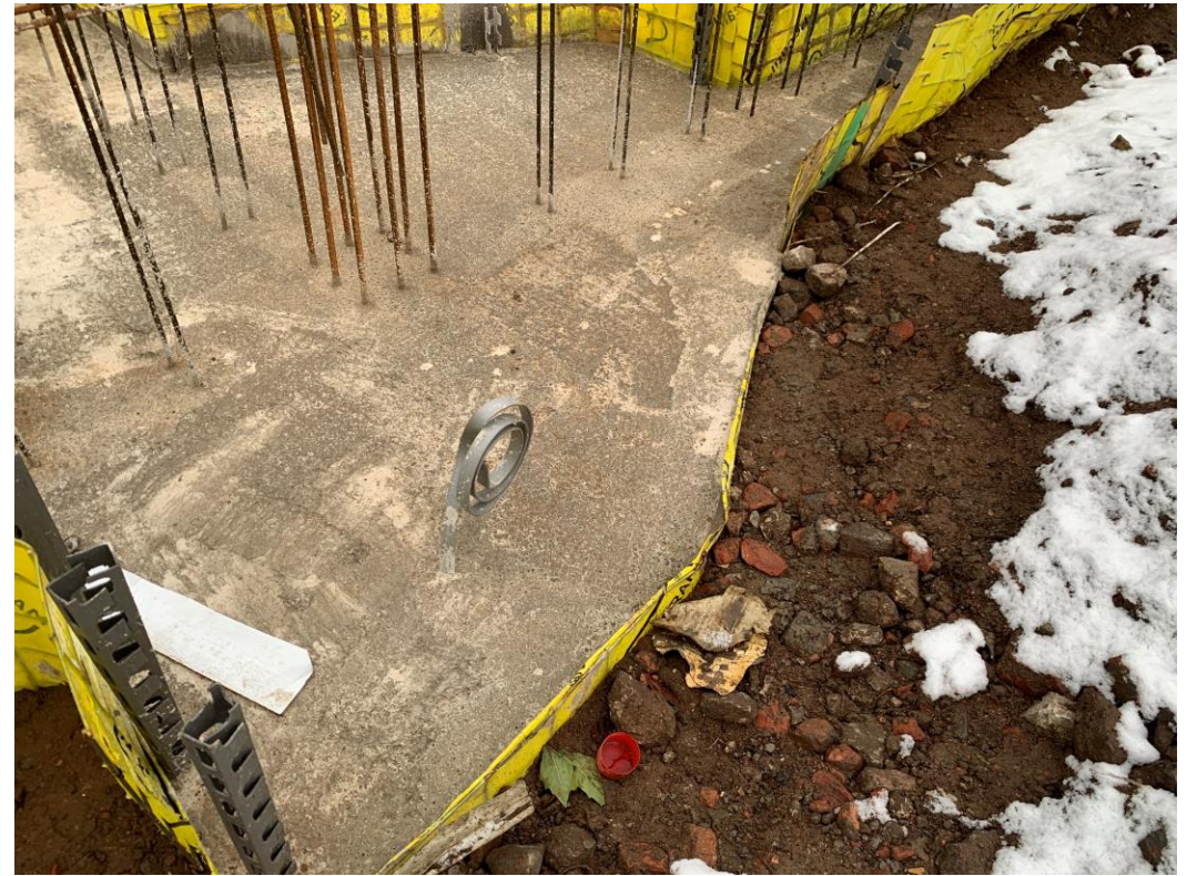
Block B – lighting tape