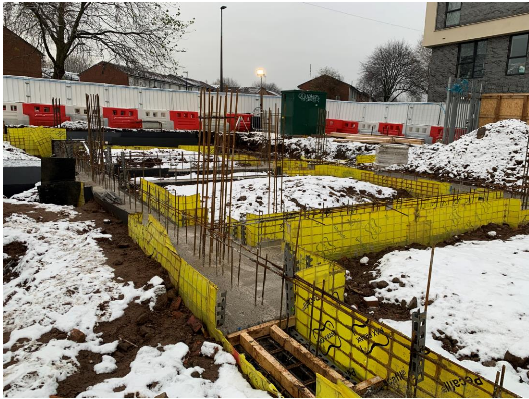
Block B – Ground beam substructure