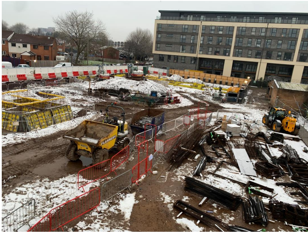
Site activity plant and machinery