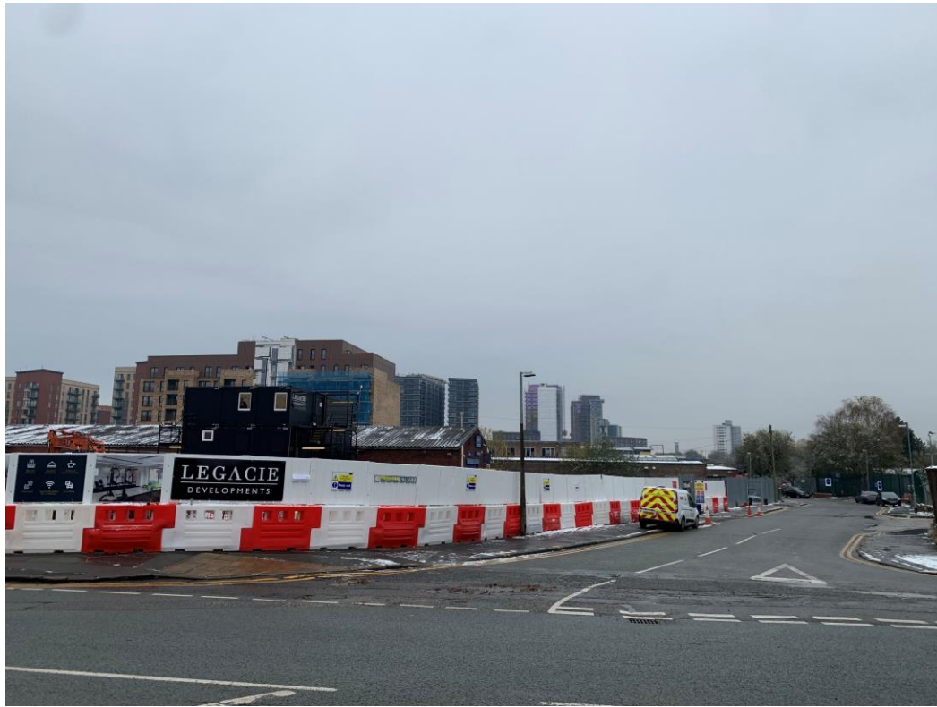
Ordsall Lane site view – buildings removed