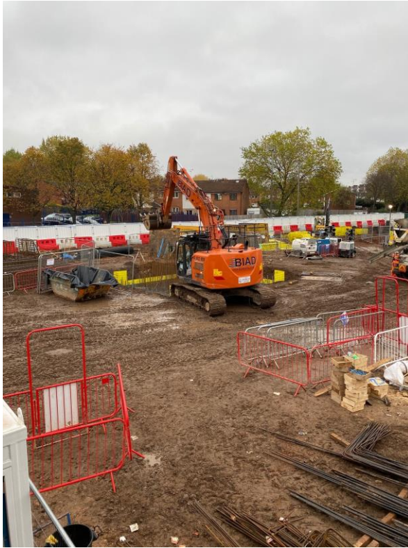
Site activity forming core foundation