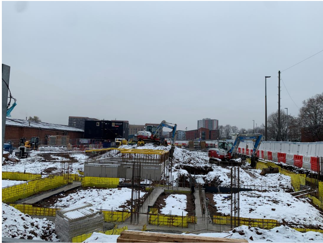
Block B – Foundation substructure