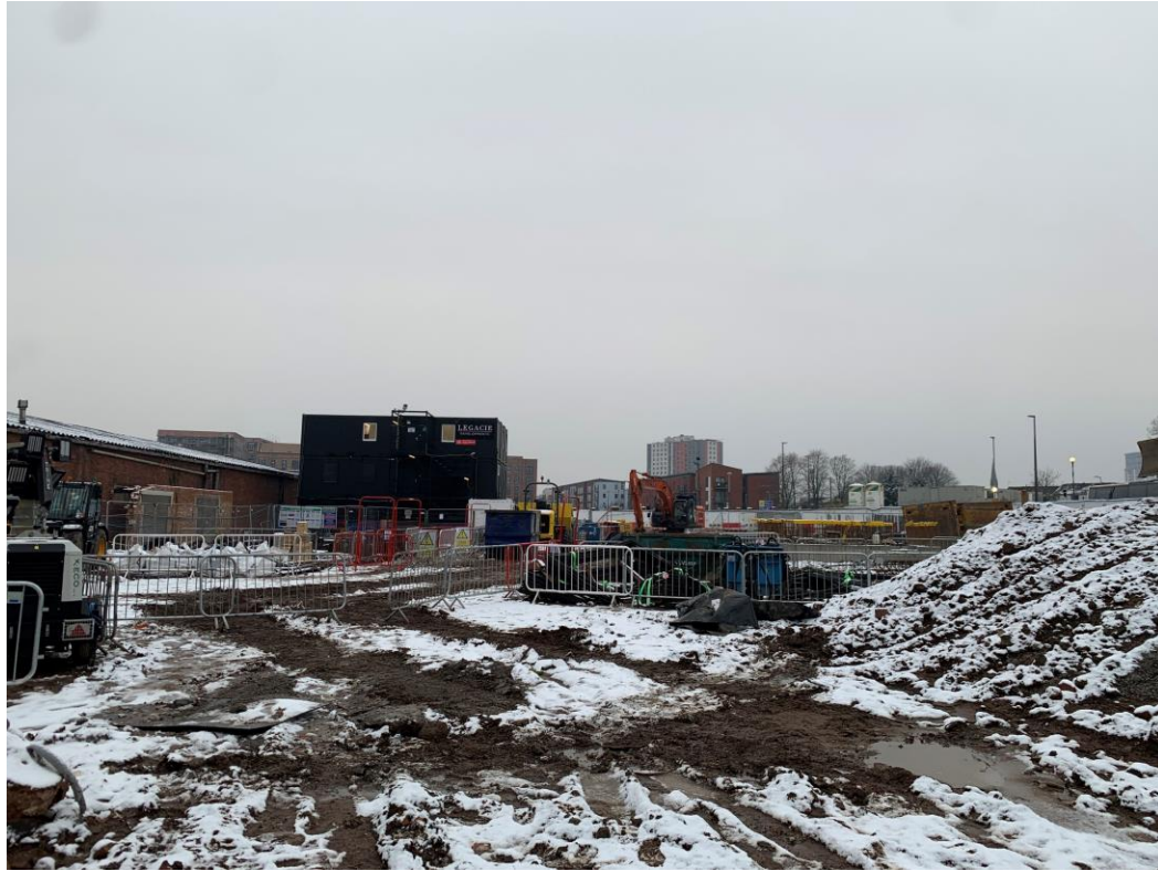
Site activity plant and machinery