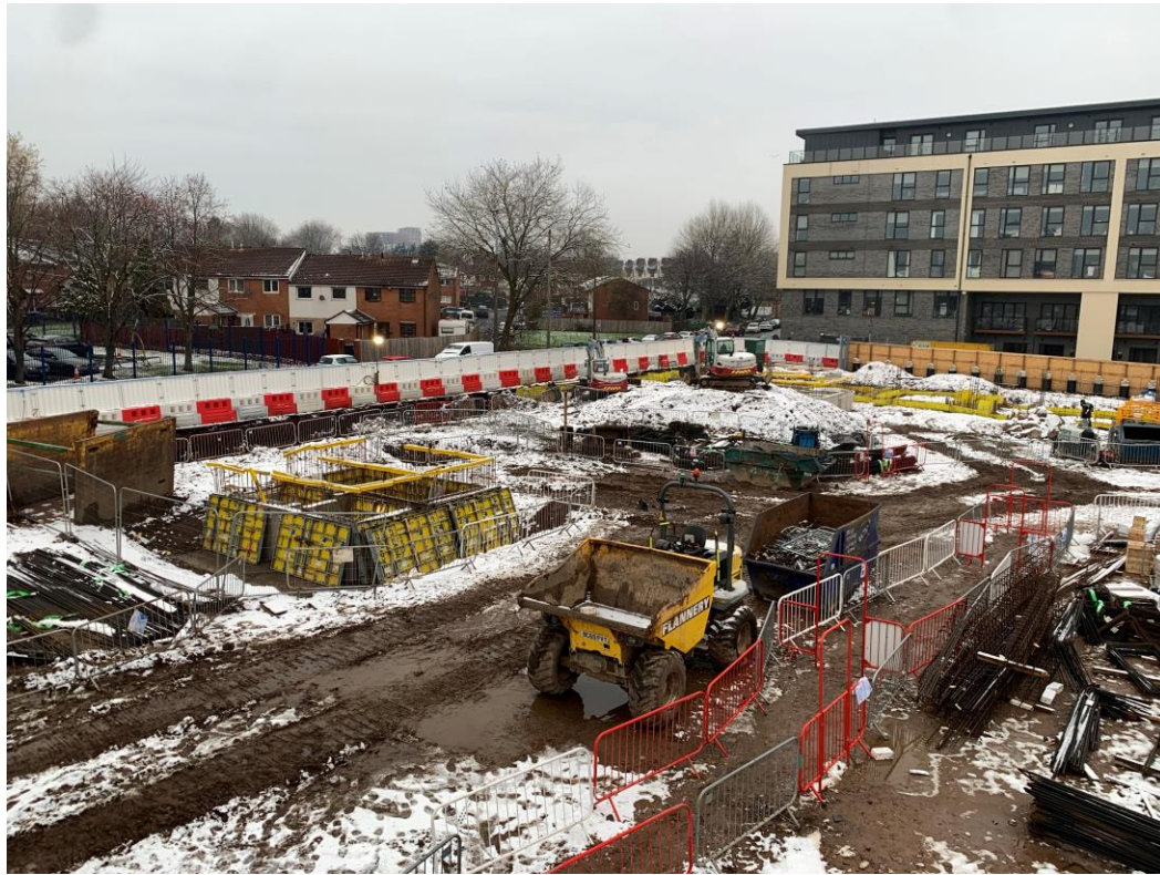
Site activity plant and machinery