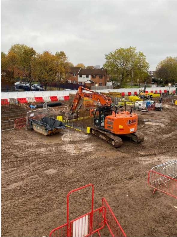
Site activity formation levelling