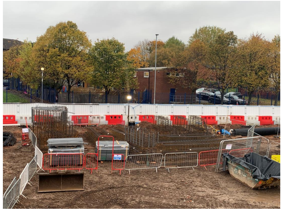
Reinforcement cages formed pads and ground beams