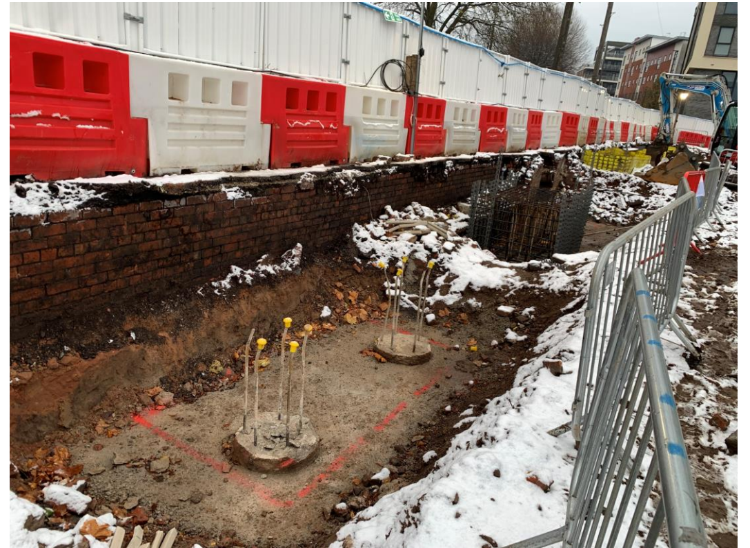
Block B – Piling capping commenced