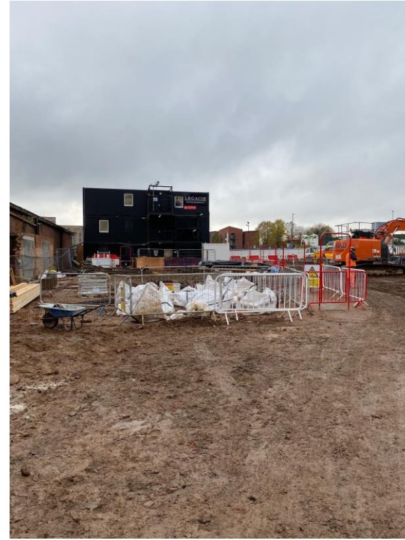
Site access barriers