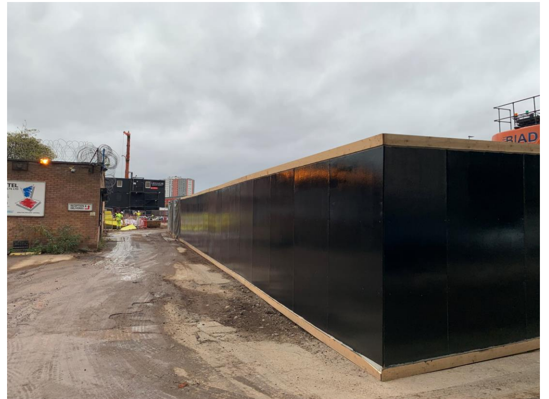
Worral Lane site plant & deliveries entrance