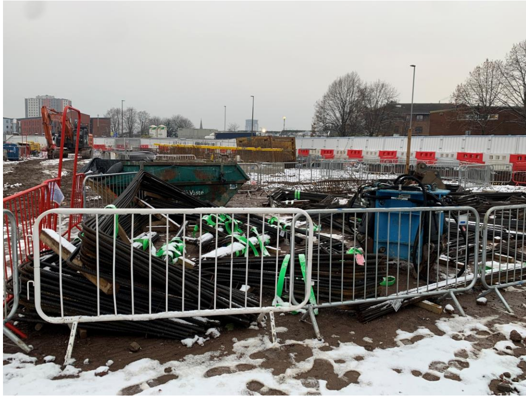
Foundation reinforcement stored