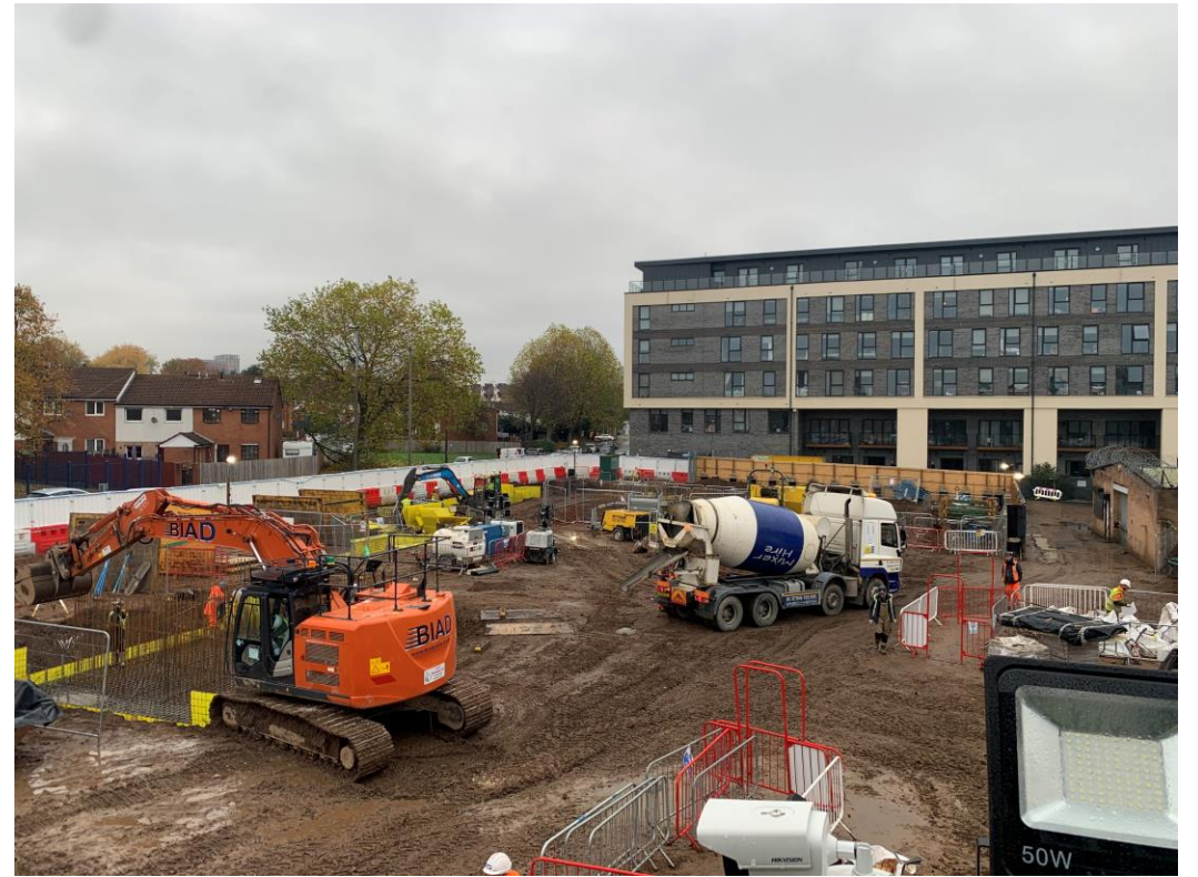
Site activity plant and machinery