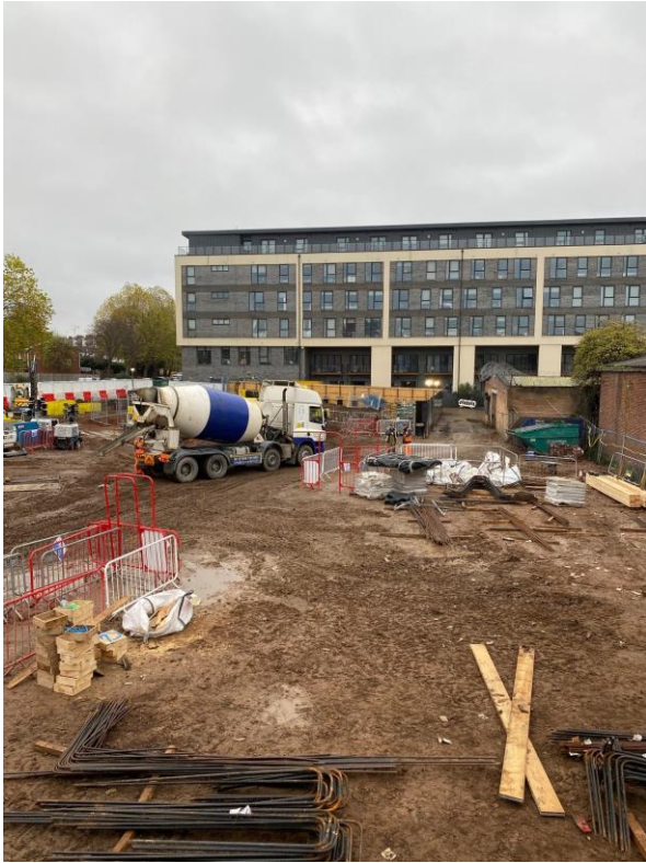
Foundation reinforcement stored