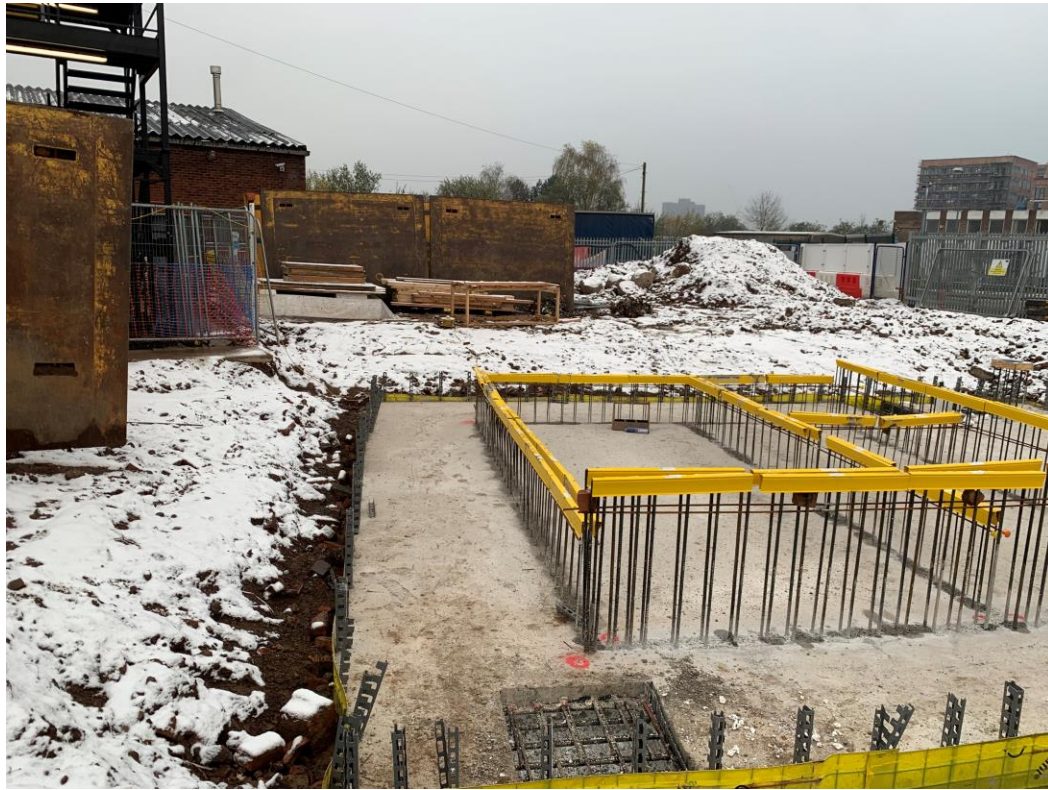
Block A - Core substructure