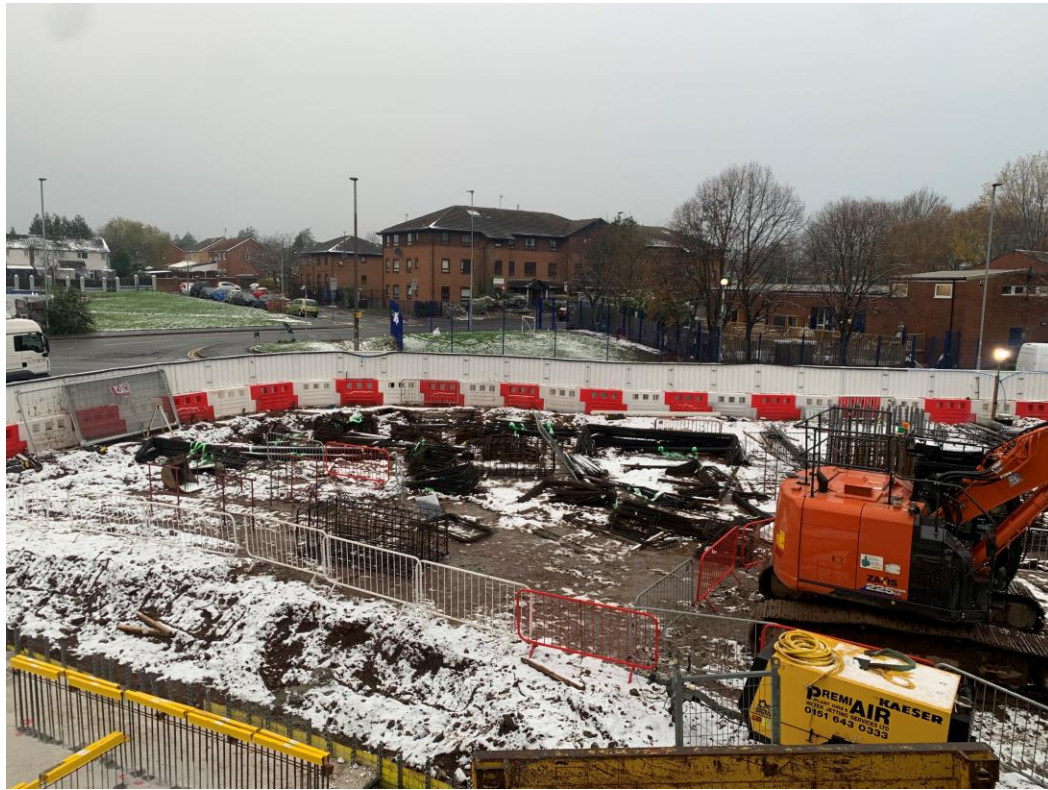
Foundation reinforcement cages being formed and stored