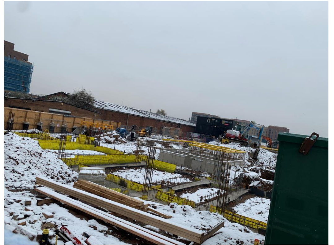
Block B – Foundation substructure