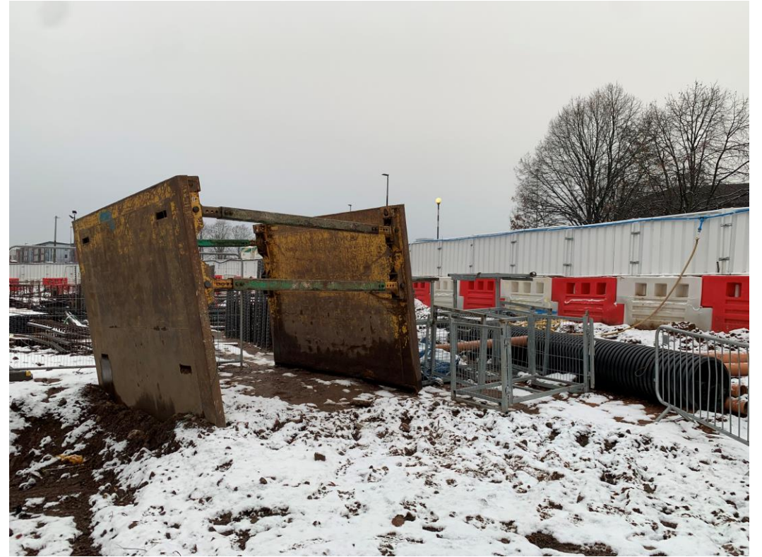
Site activity plant and machinery