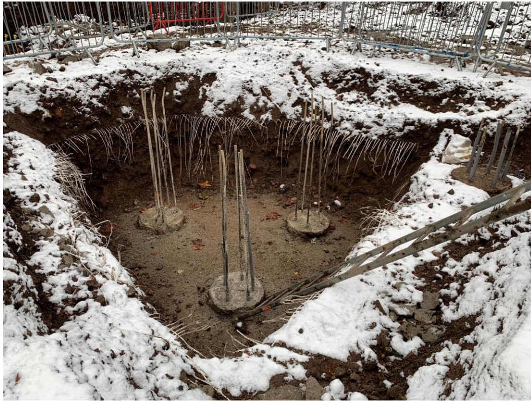
Block B – Pad foundation excavation