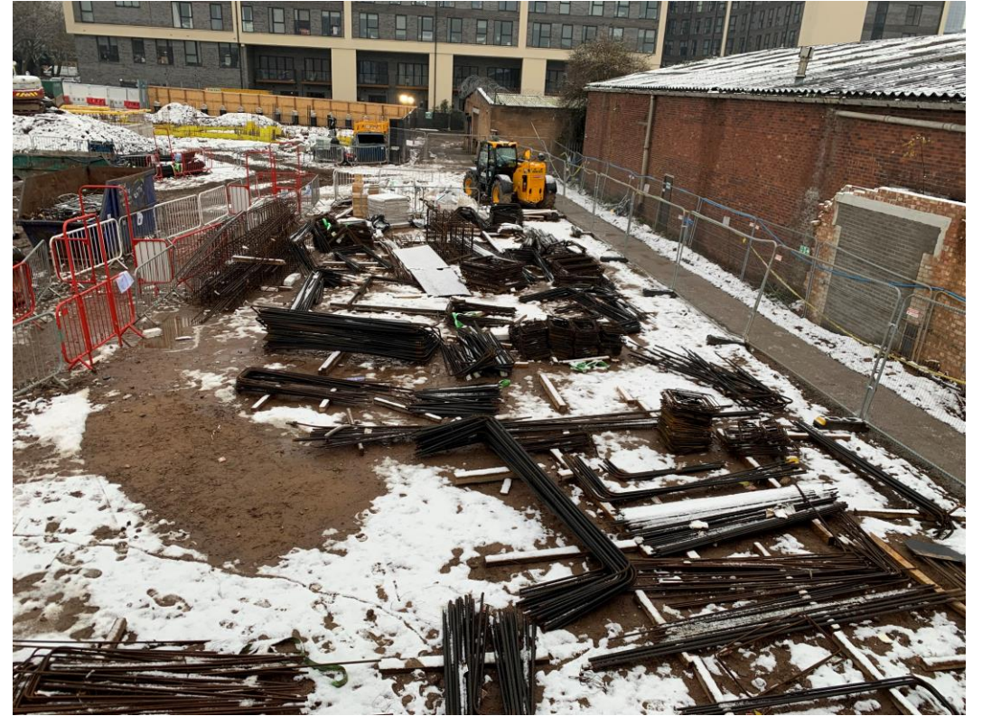
Foundation reinforcement stored