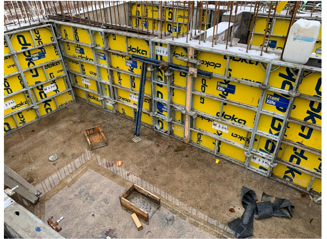
Block B – Core substructure