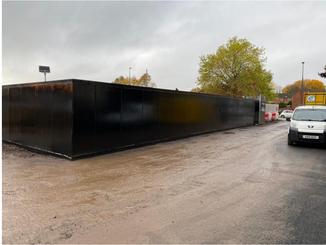
Worrall Lane site plant & deliveries entrance