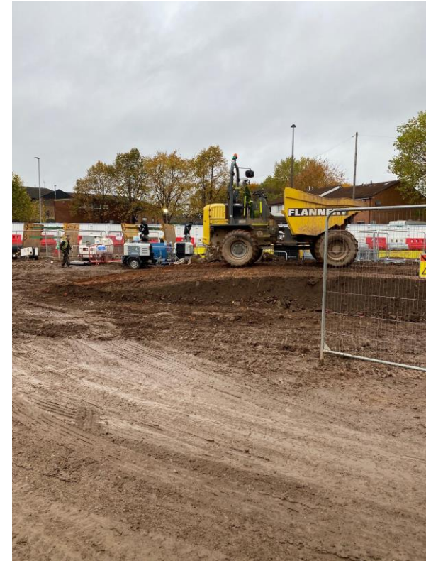
Site activity plant and machinery