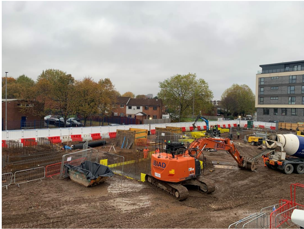
Site activity plant and machinery