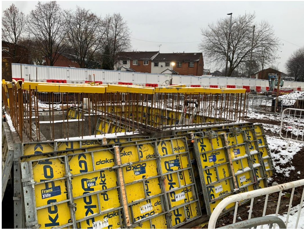
Block B – Core substructure