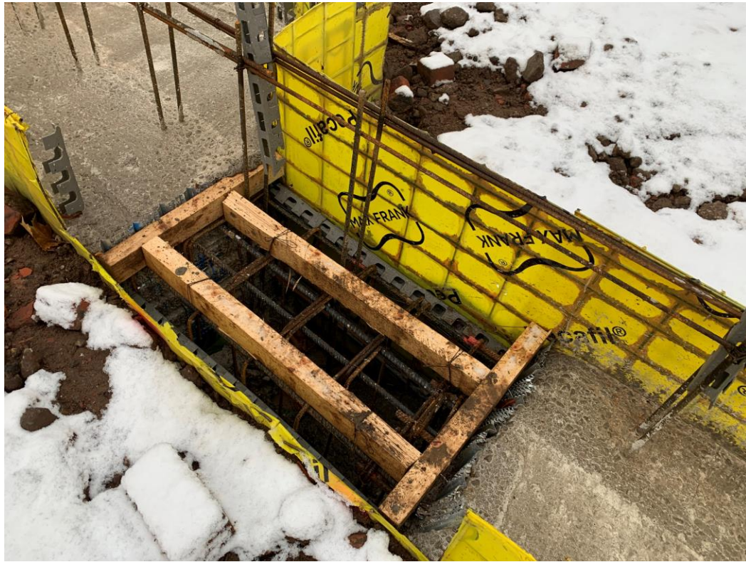
Block B – Ground beam substructure