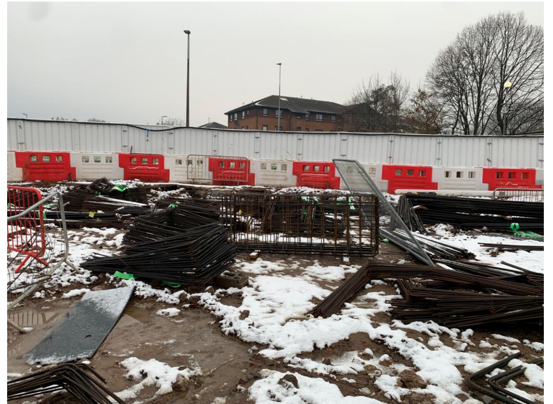
Foundation reinforcement cages being formed and stored