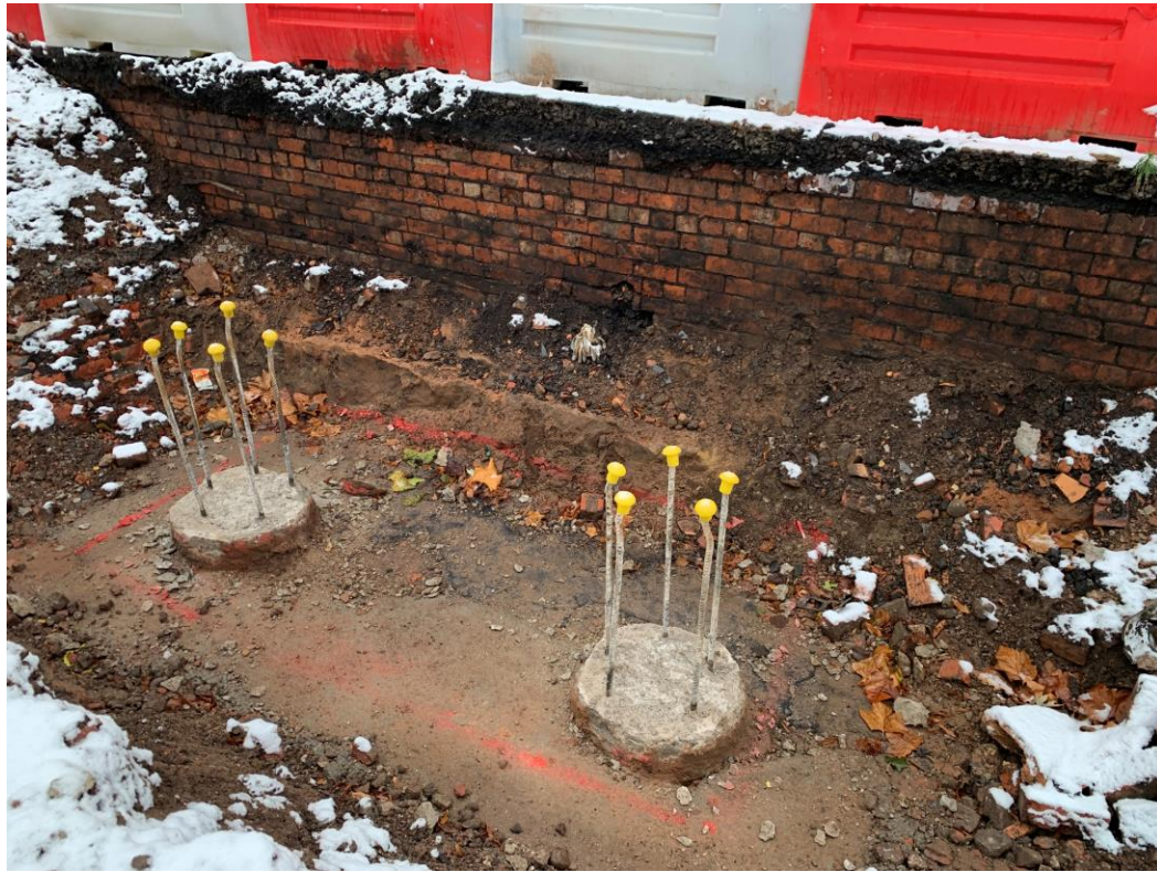
Block B – Pad foundation excavation