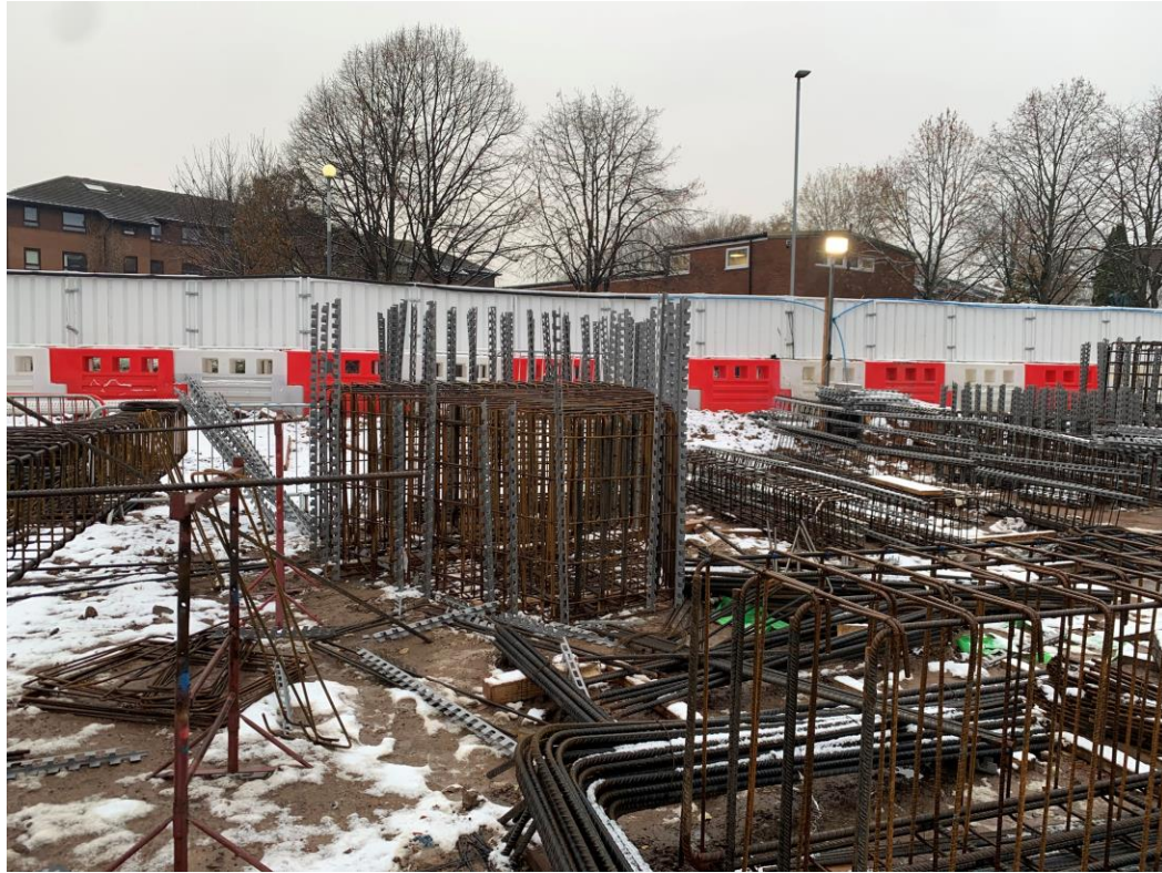
Pad reinforcement cages formed and stored