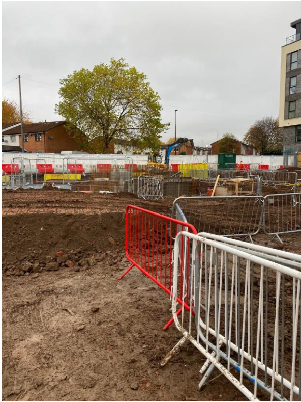
Site access barriers