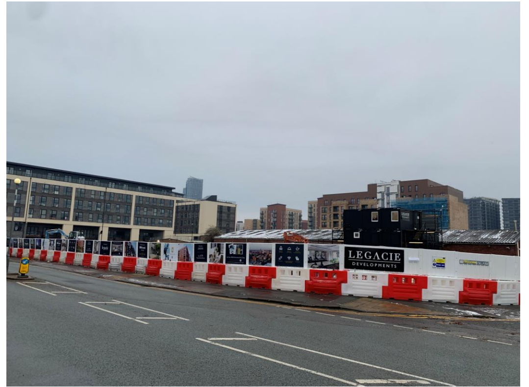
Ordsall Lane site view – buildings removed