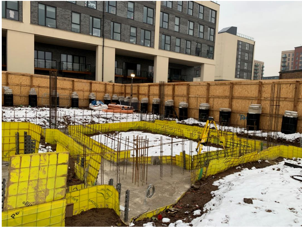
Block B – Ground beam substructure