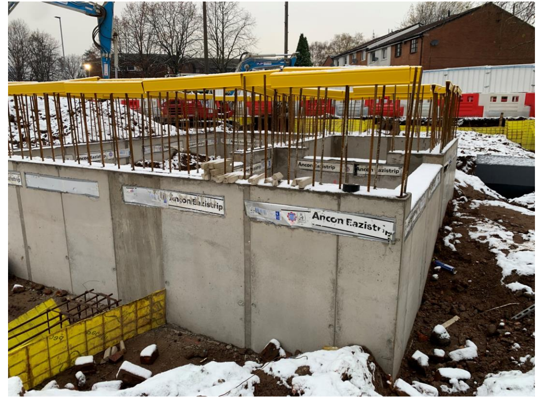
Block B – Core substructure