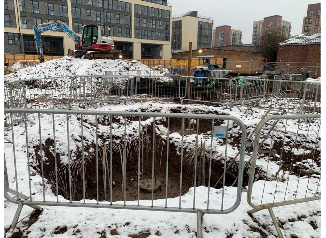
Excavation for pad foundation