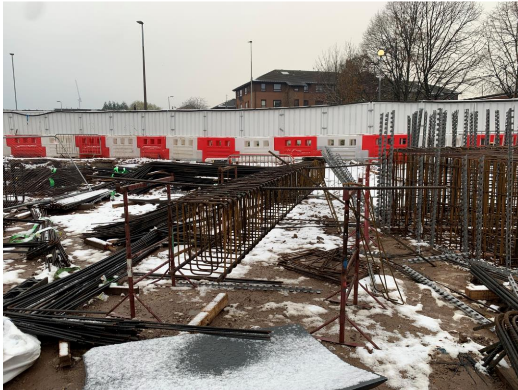
Foundation reinforcement cages being formed and stored