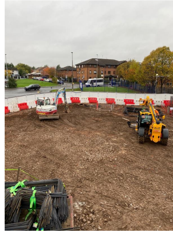
Site activity plant and machinery