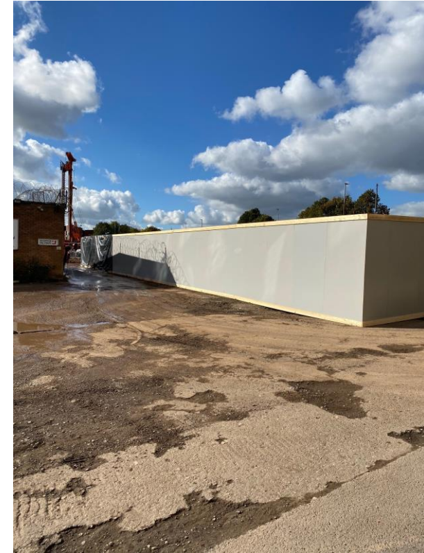
Worrall Lane site plant & deliveries entrance