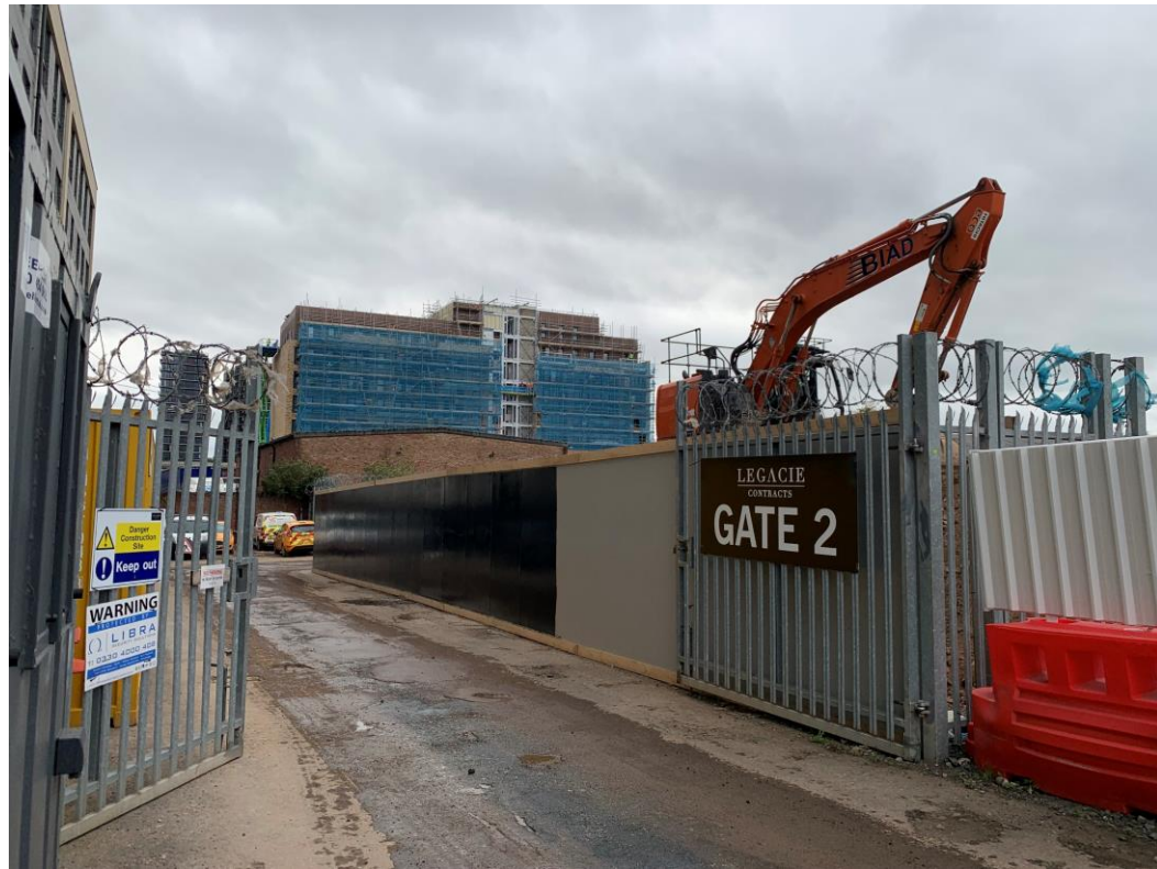
Dyer Street site plant & deliveries entrance