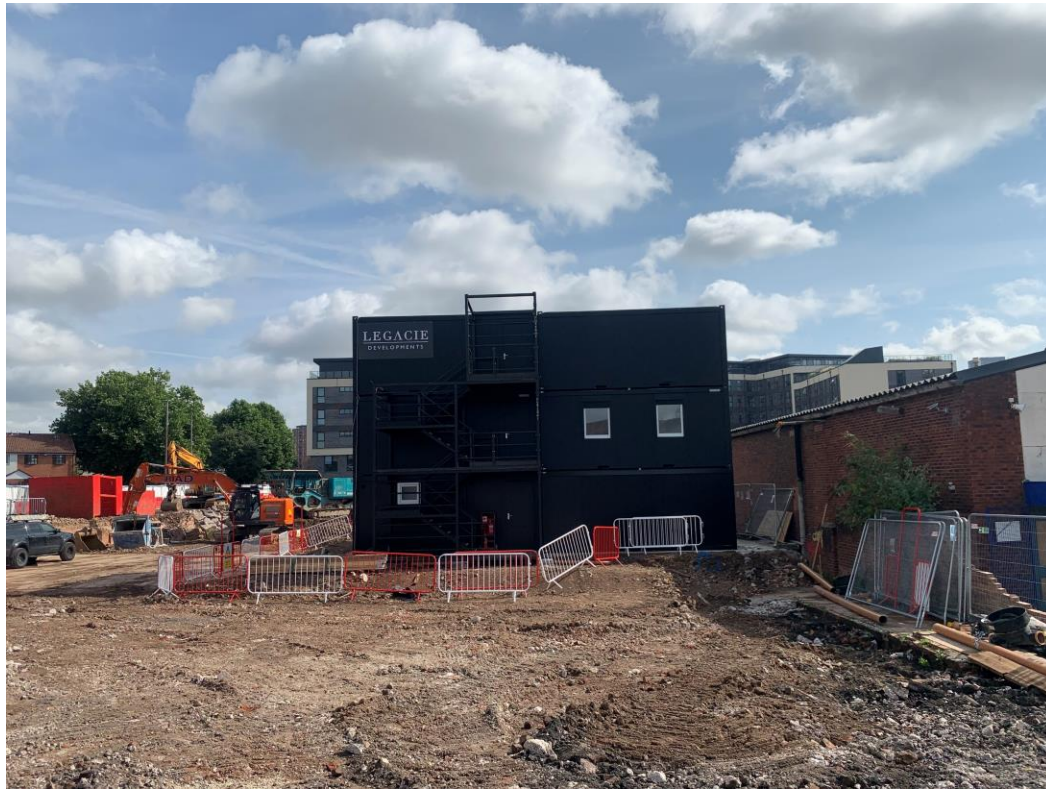
New site cabins