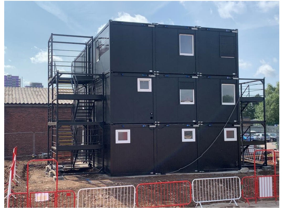
New site cabins