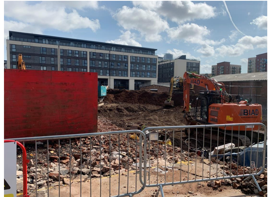
Site activity site levelling and stock piling