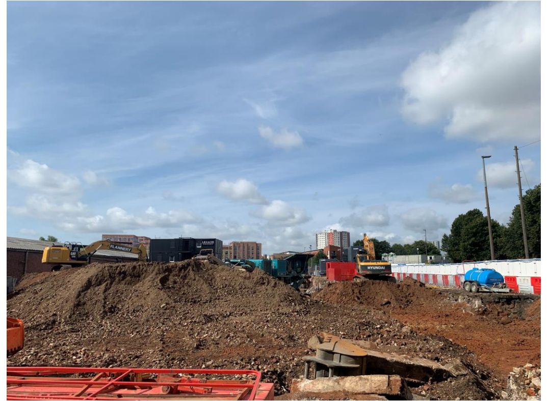
Site activity site levelling and stock piling