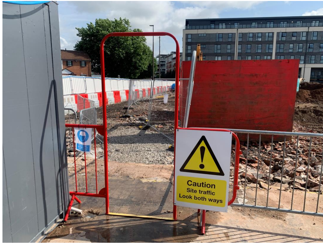
New site access