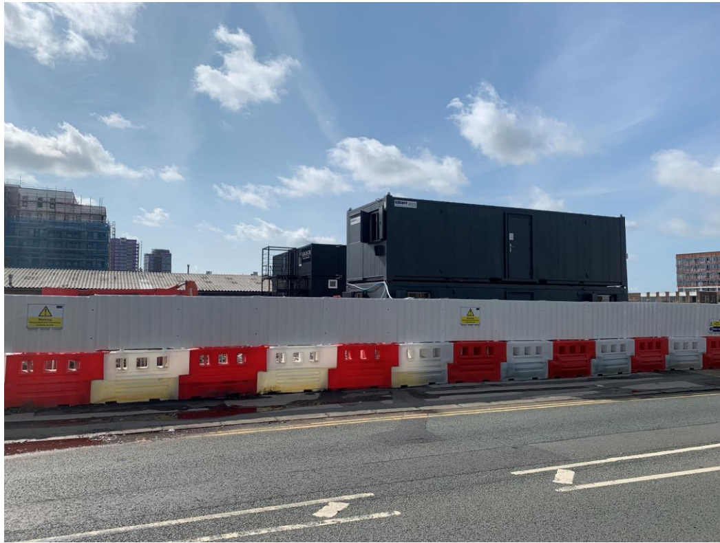
Ordsall Lane site view – site cabins