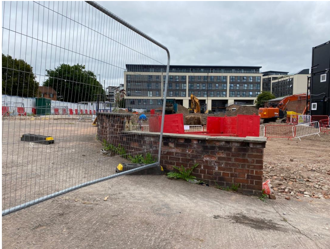
Site cabins removed