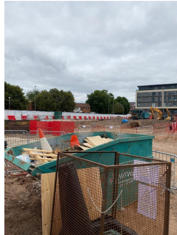
Site cabins removed