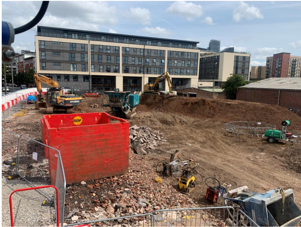
Site activity site levelling and stock piling