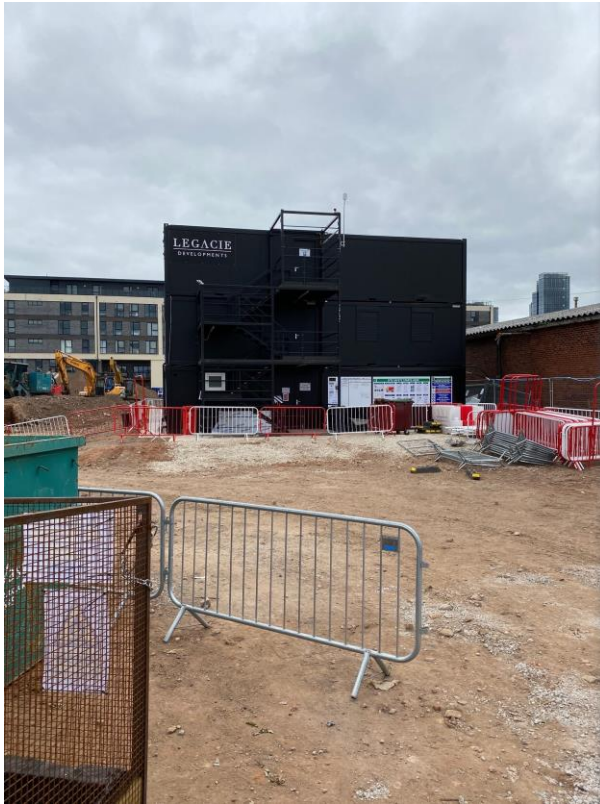
Site cabins access