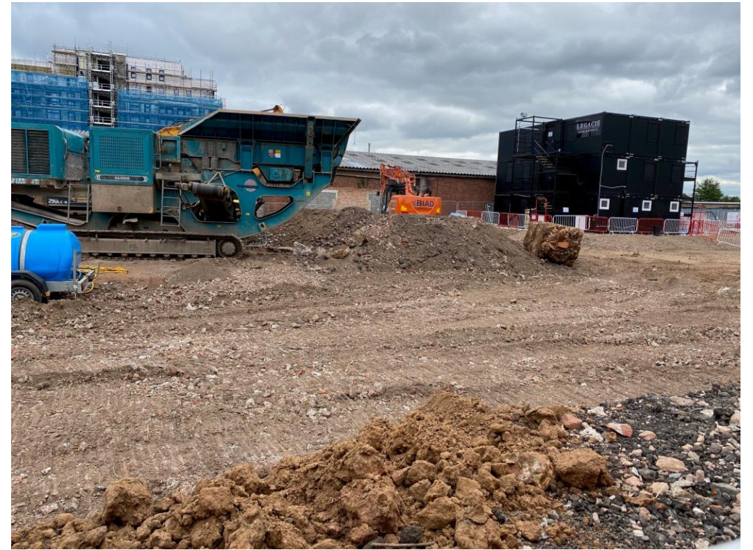
Site plant material crusher