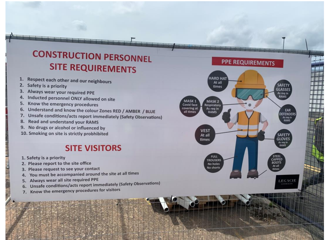
New site access