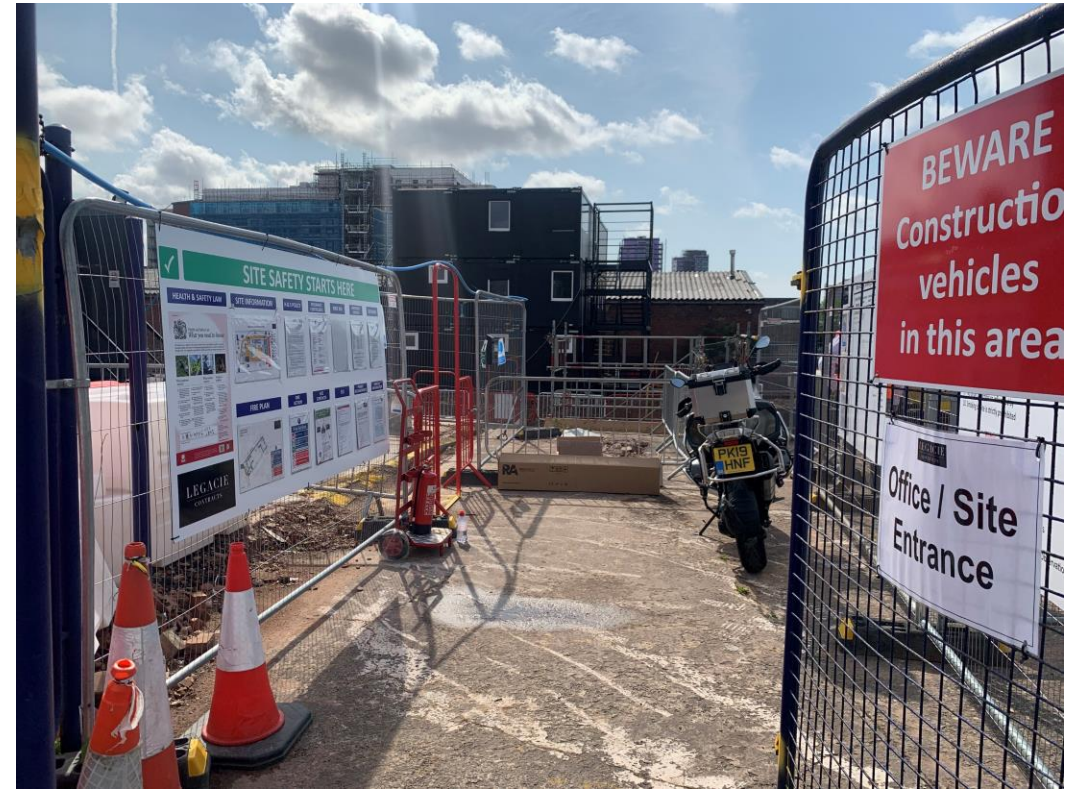
Ordsall Lane – New site access