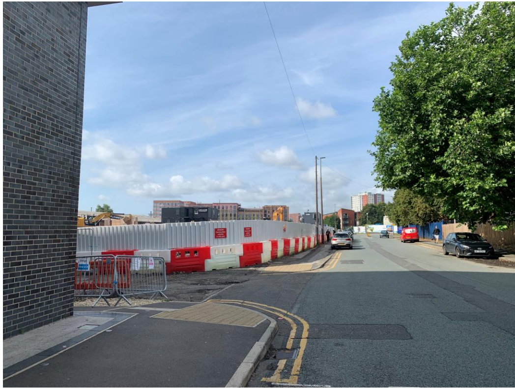
Ordsall Lane site view – buildings removed