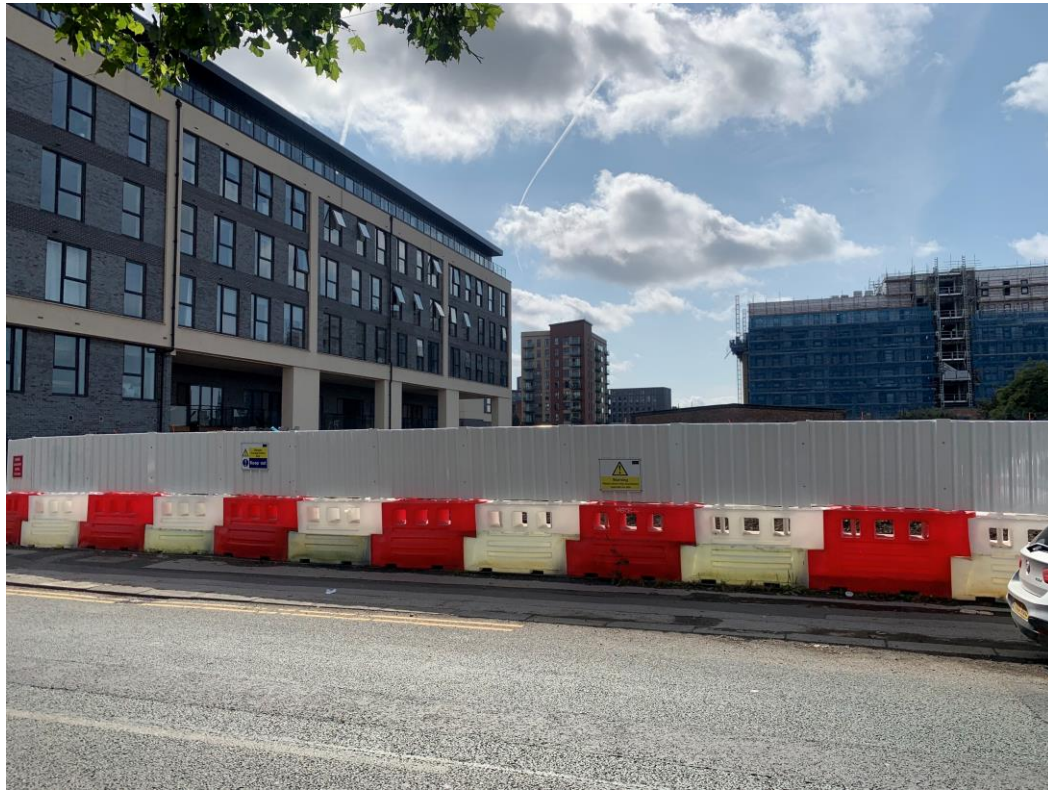
Ordsall Lane site view – buildings removed