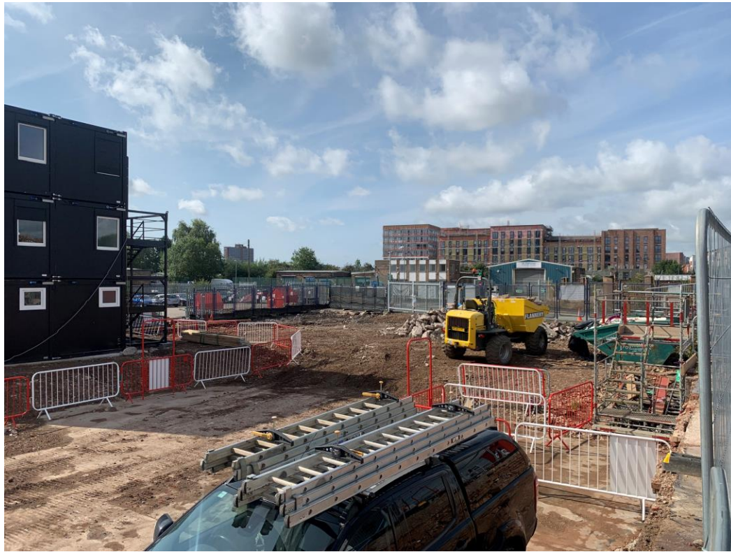
Site activity site levelling and stock piling