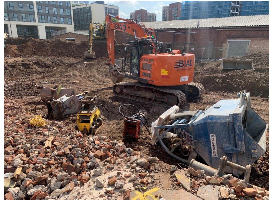
Site activity site levelling and stock piling