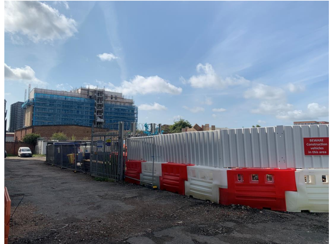
Dyer Street site view – buildings removed