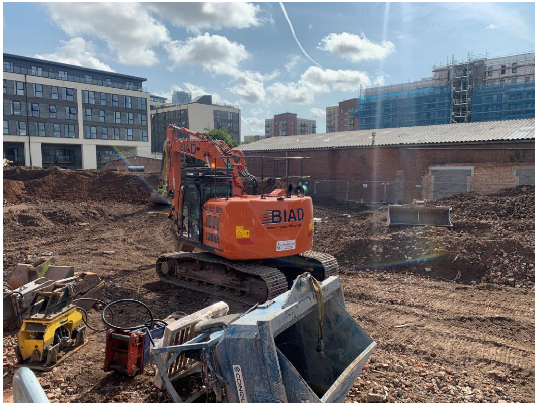
Site activity site levelling and stock piling