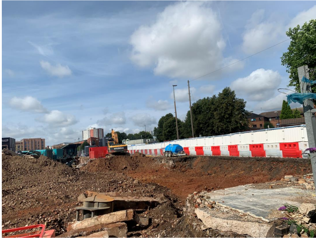
Site activity site levelling and stock piling