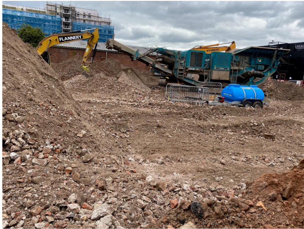
Site plant material crusher