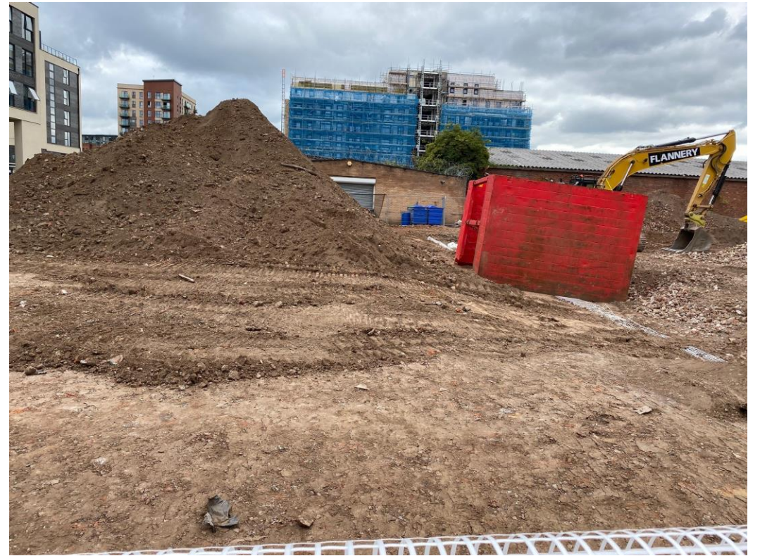
Site activity site levelling and stock piling