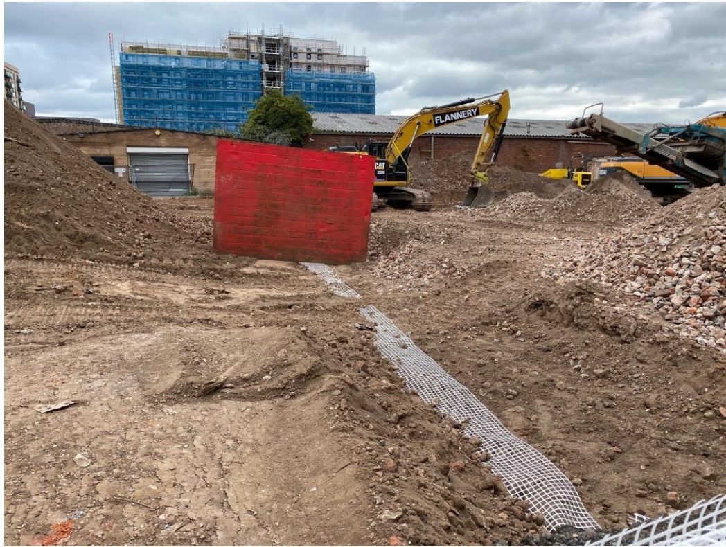
Site activity site levelling and stock piling