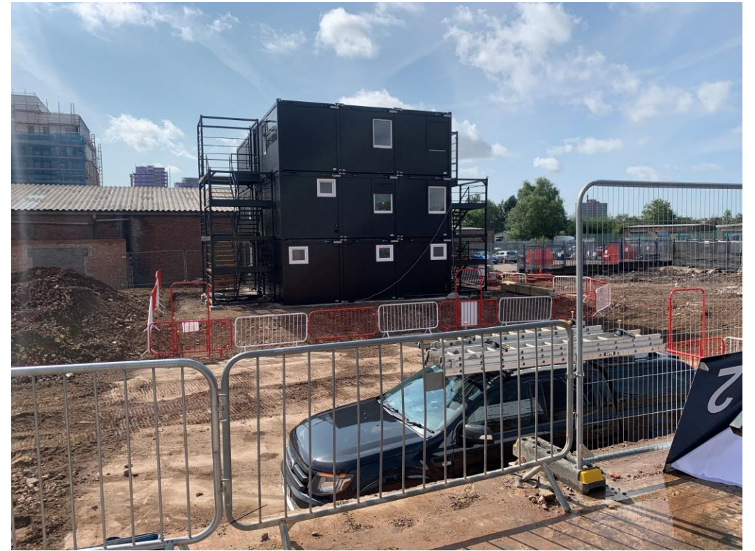
New site access & cabins