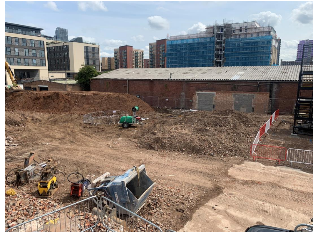
Site activity site levelling and stock piling