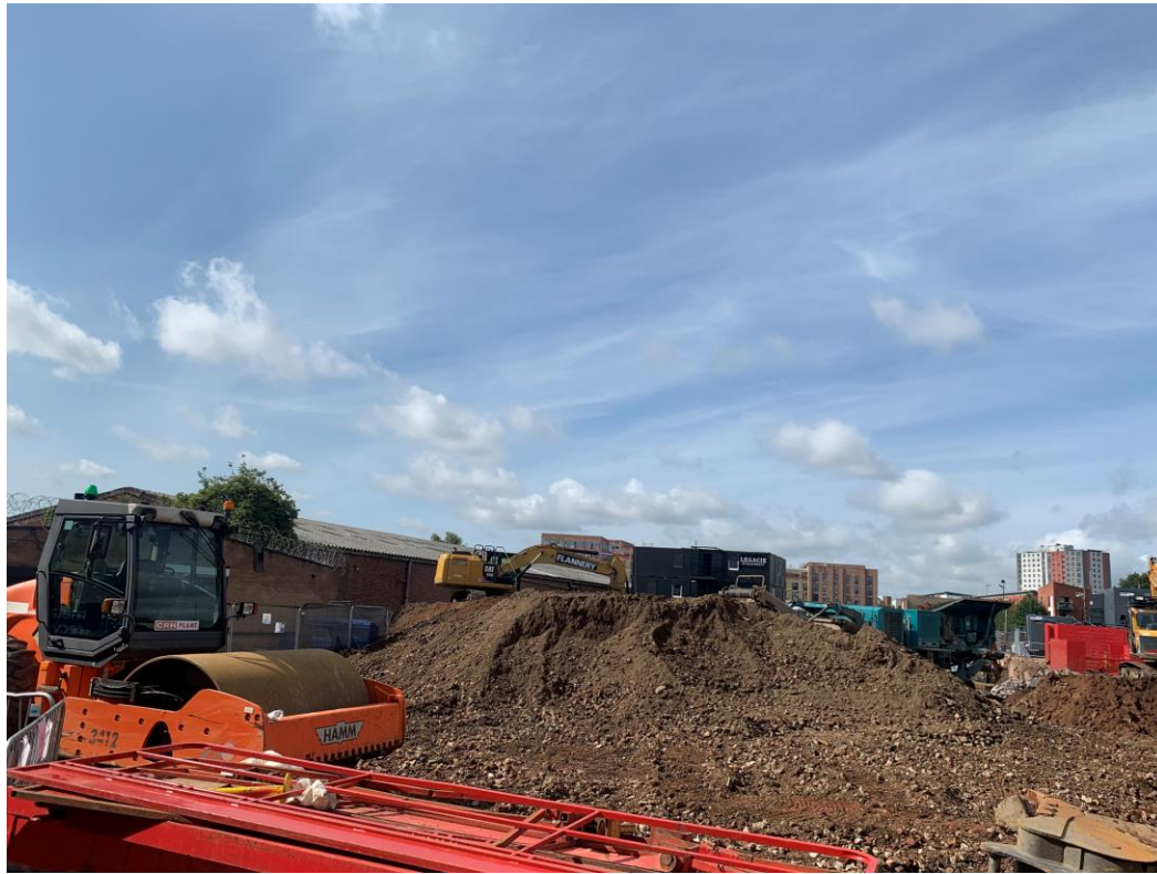
Site activity site levelling and stock piling