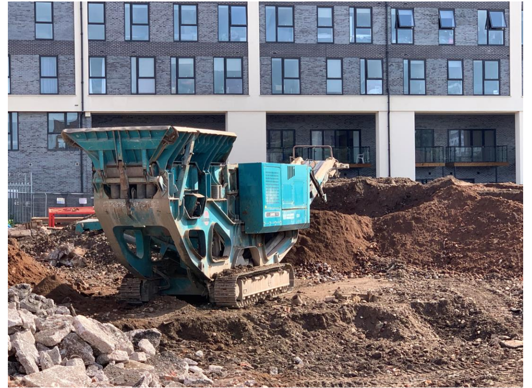
Site plant material crusher