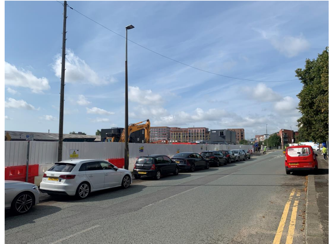
Ordsall Lane site view – buildings removed