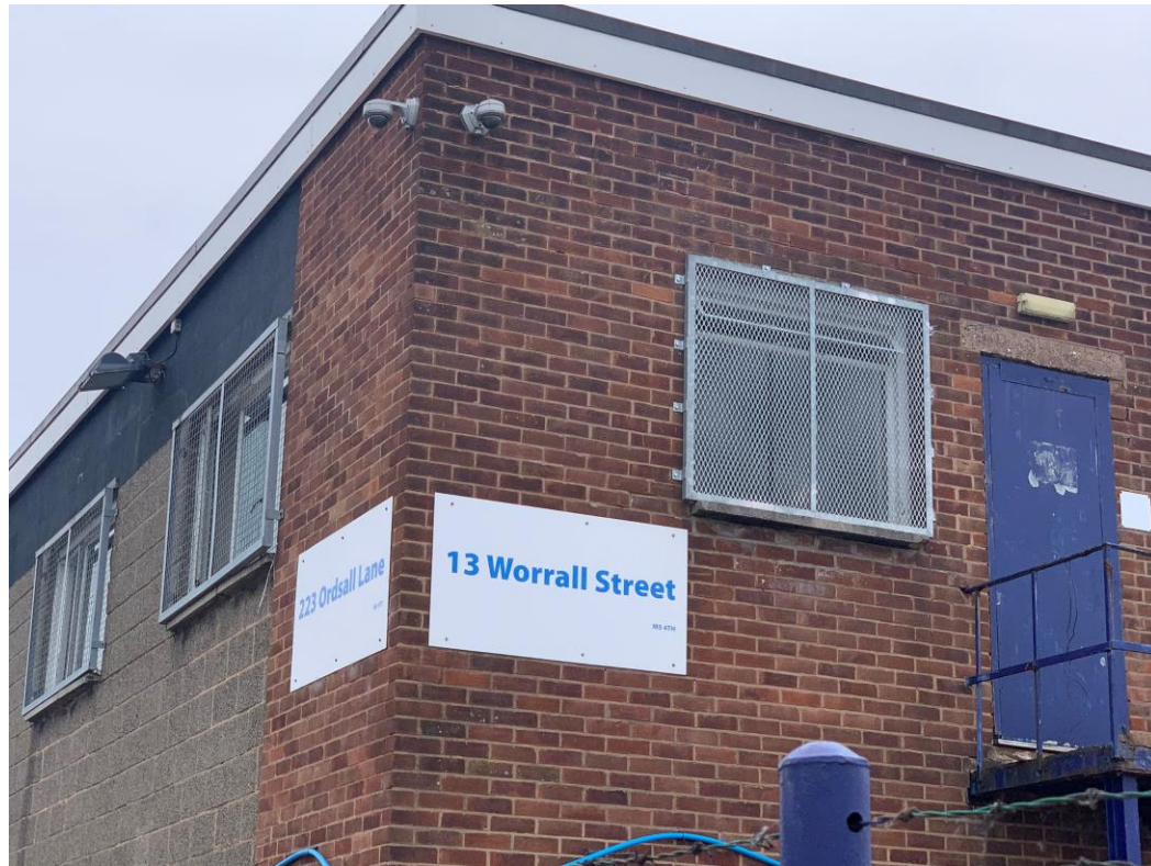
Building to be demolished