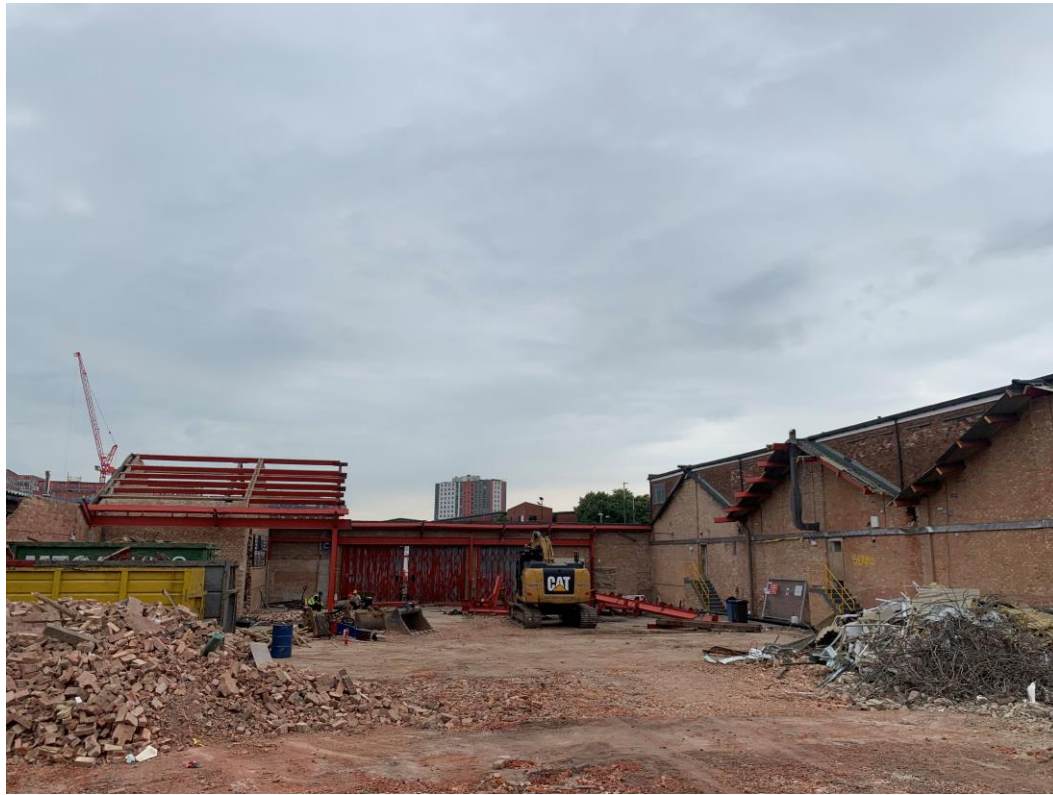
Site view – buildings demolished