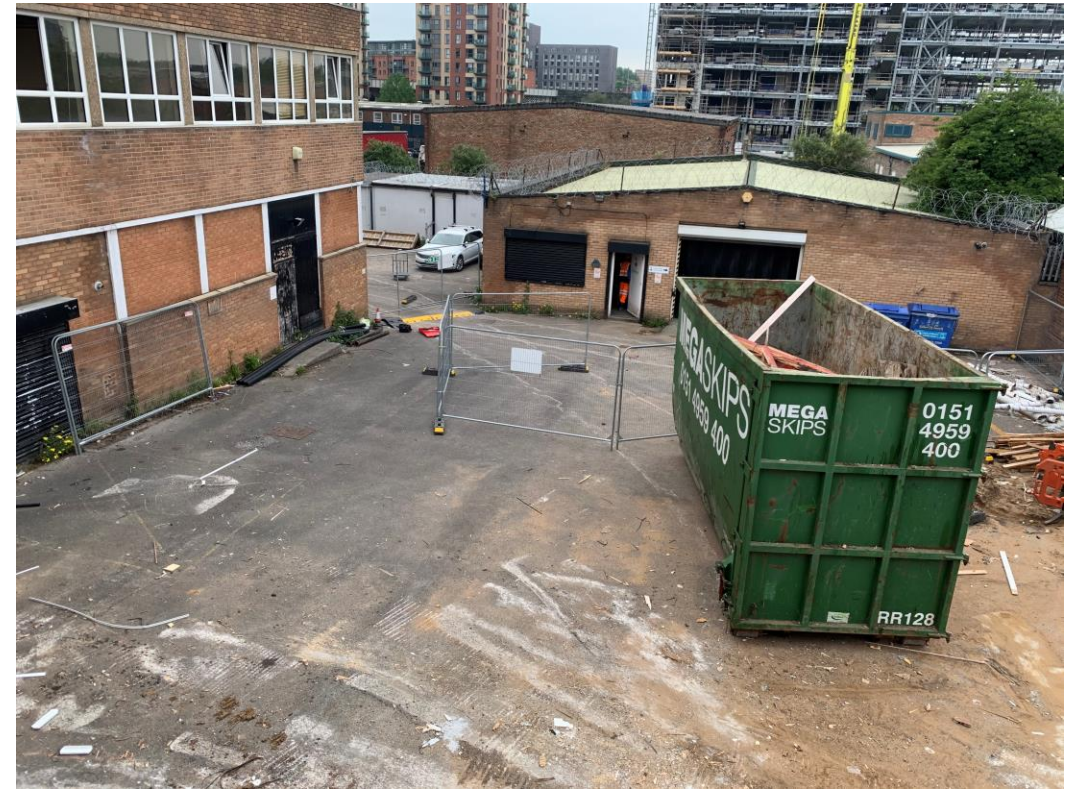
Building to be demolished