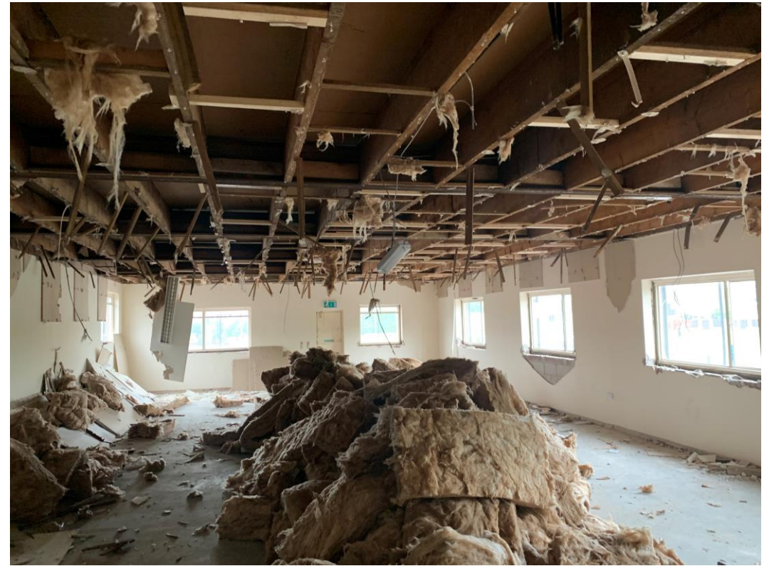
Building to be demolished