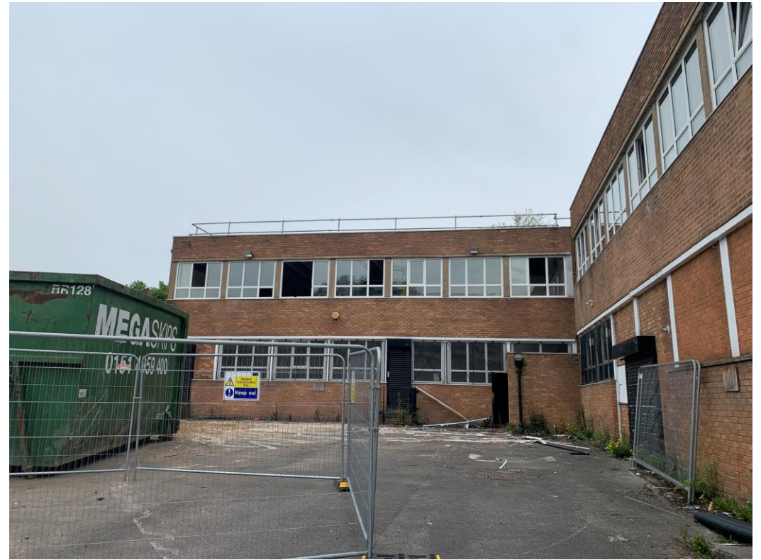
Dyer Street site view – buildings to be demolished