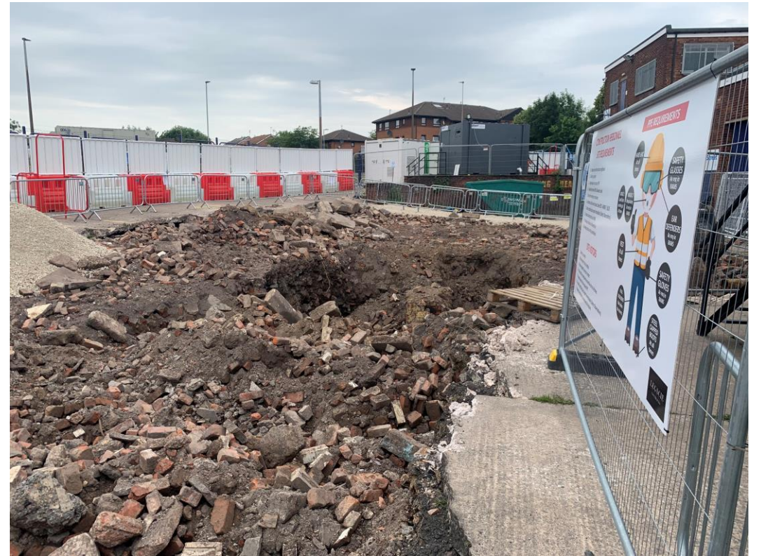
Site Compound adjacent excavation