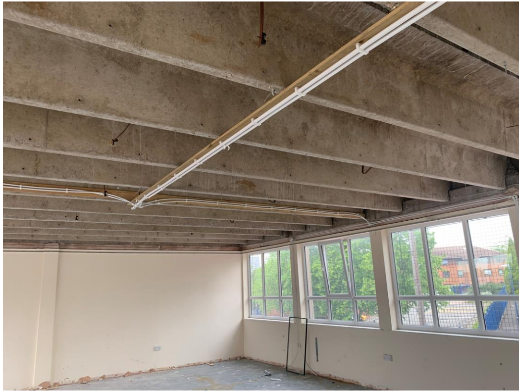
Building being demolished