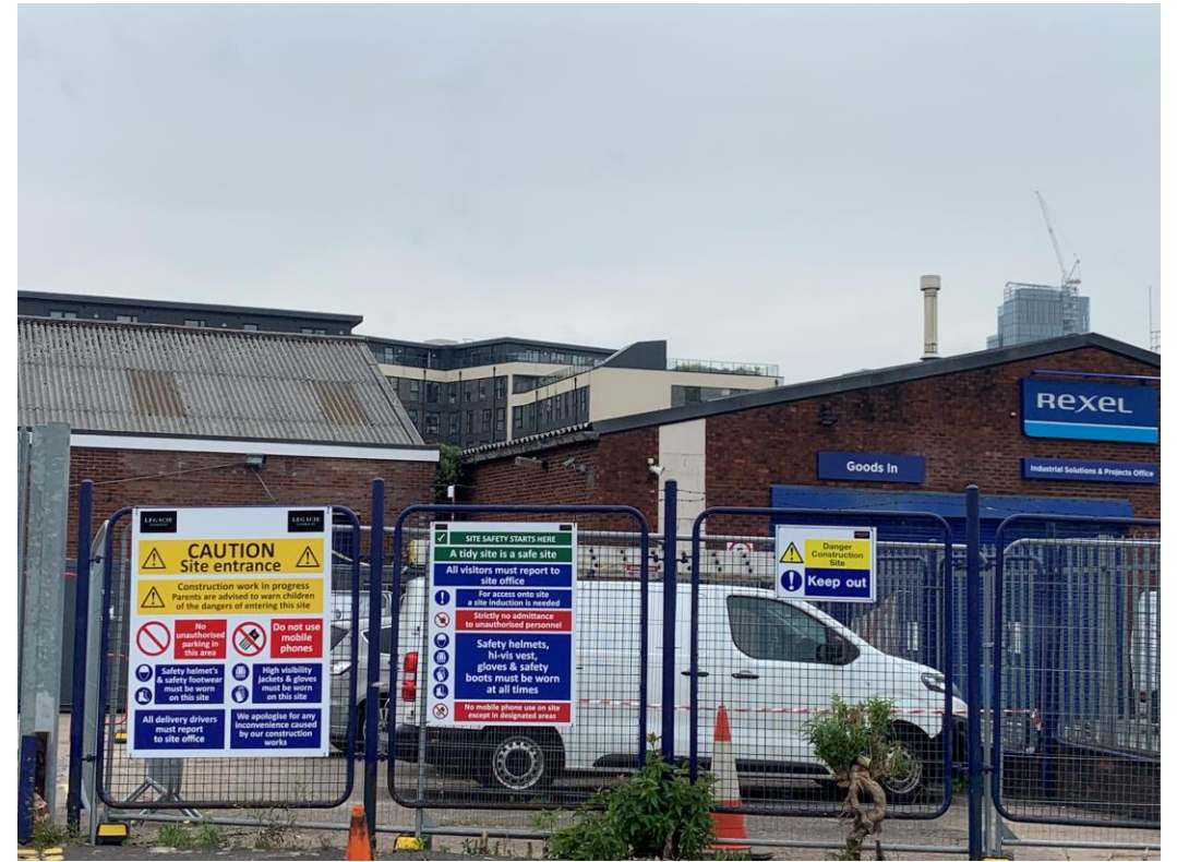
Worrall Street site view – buildings to be demolished