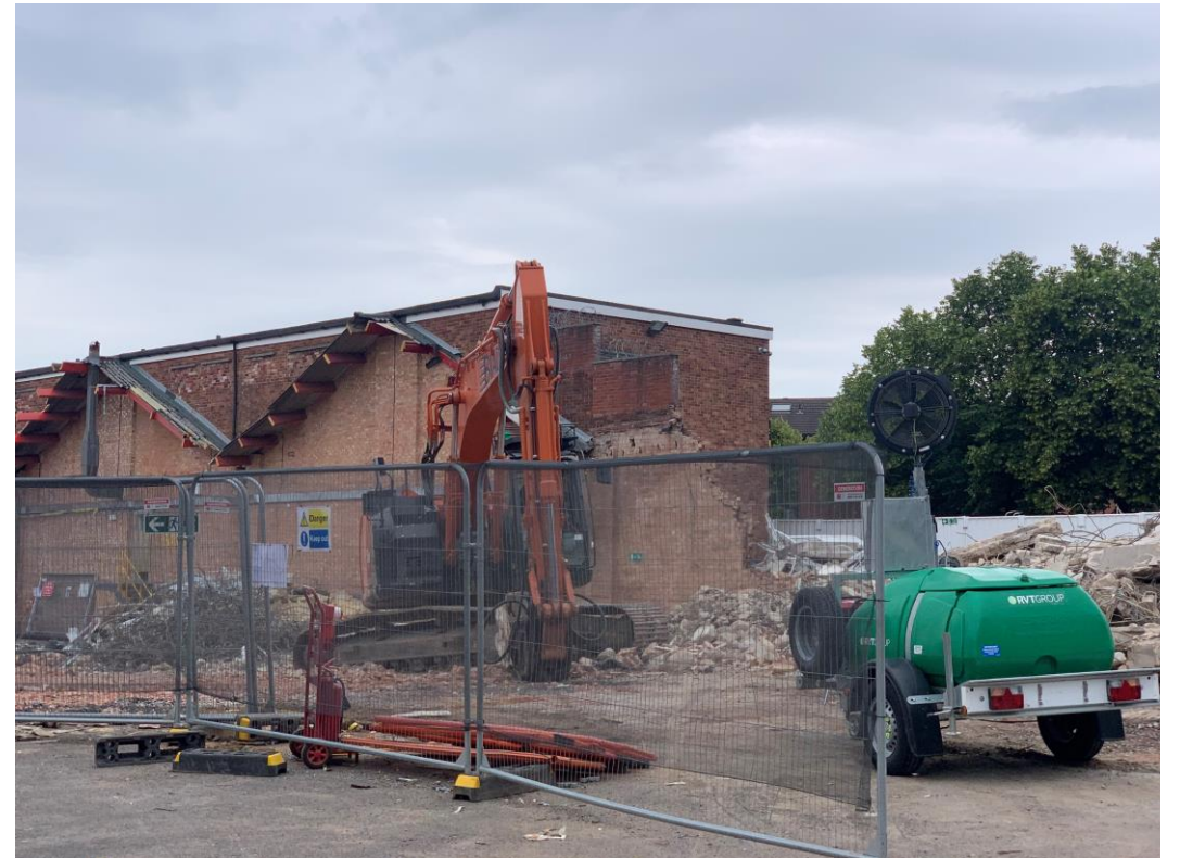
Site view – buildings demolished