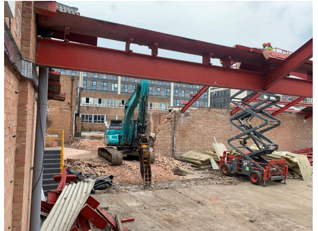
Building to be demolished