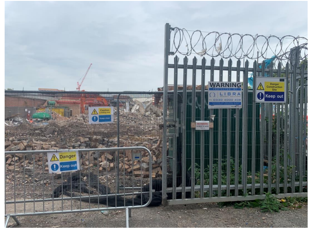
Dyer Street site view – buildings demolished