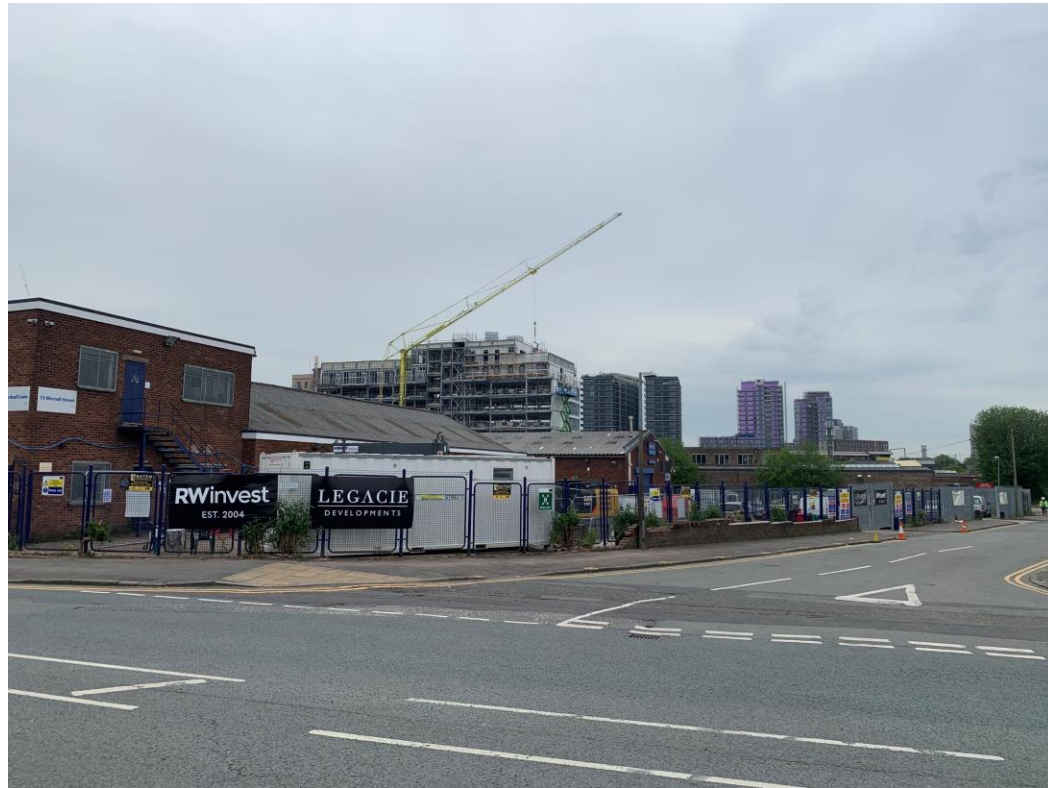
Ordsall Lane site view – buildings to be demolished