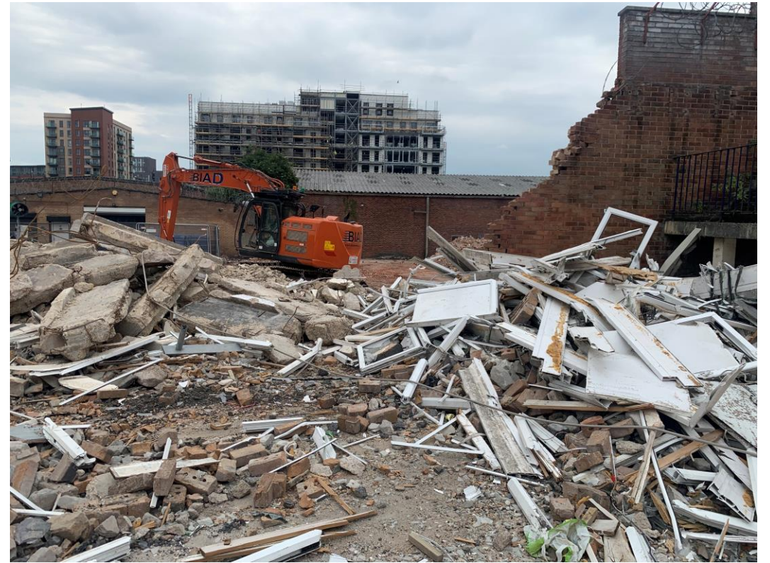
Site view – buildings demolished