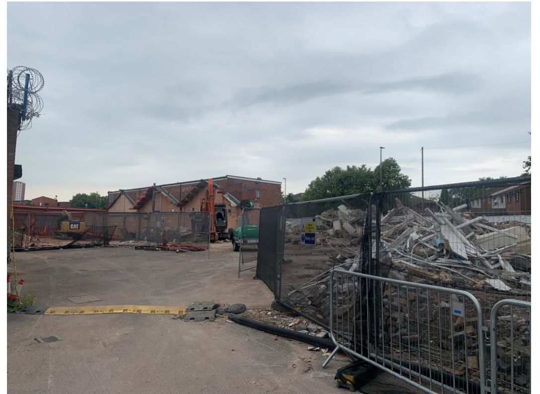
Dyer Street site view – buildings demolished