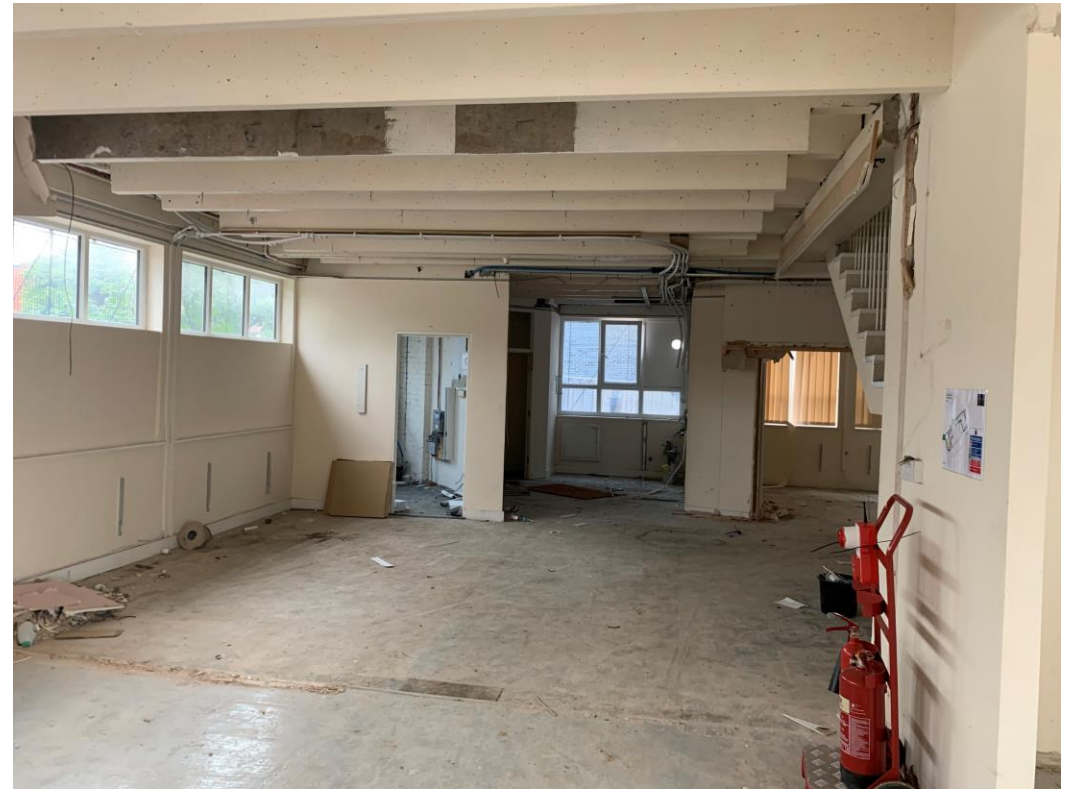
Building to be demolished