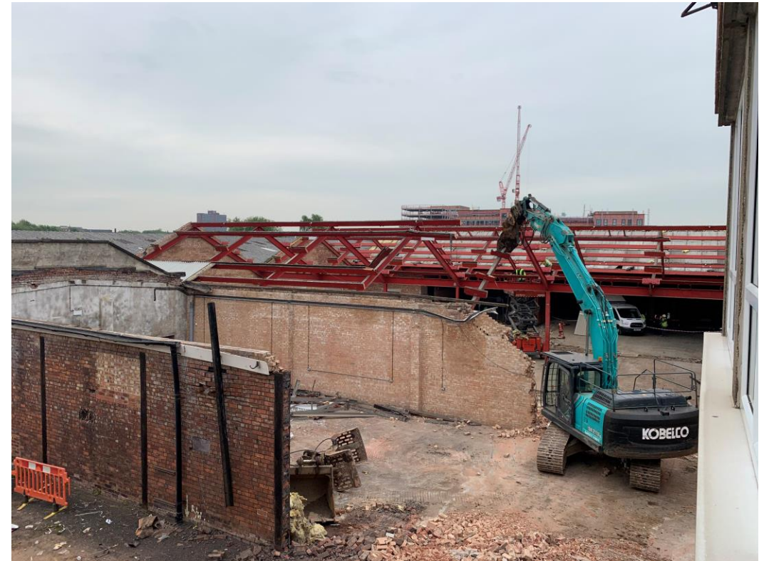
Building to be demolished