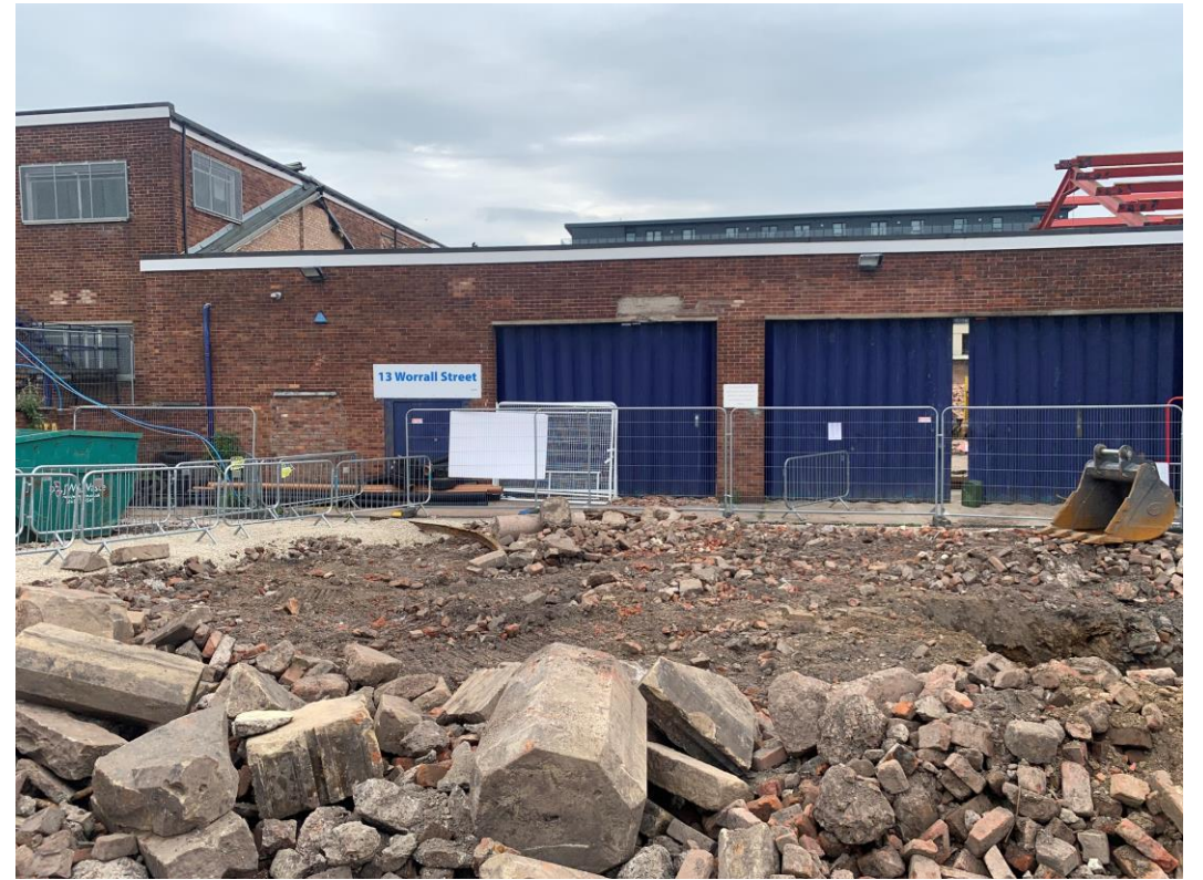
Site view – buildings to be demolished