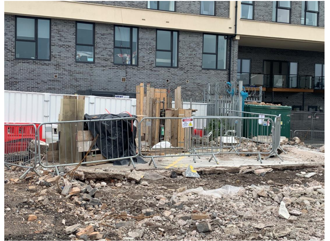
Site view – buildings demolished