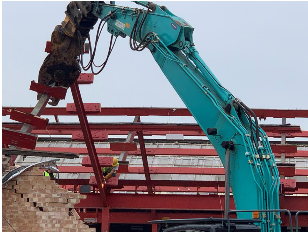
Building being demolished