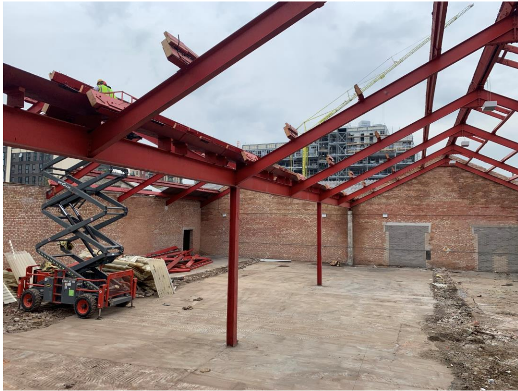
Building being demolished