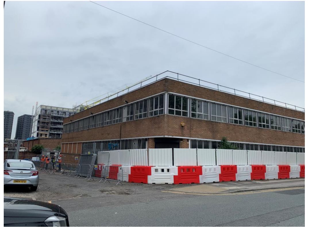
Ordsall Lane site view – buildings to be demolished