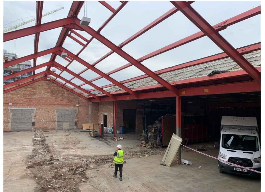
Building to be demolished