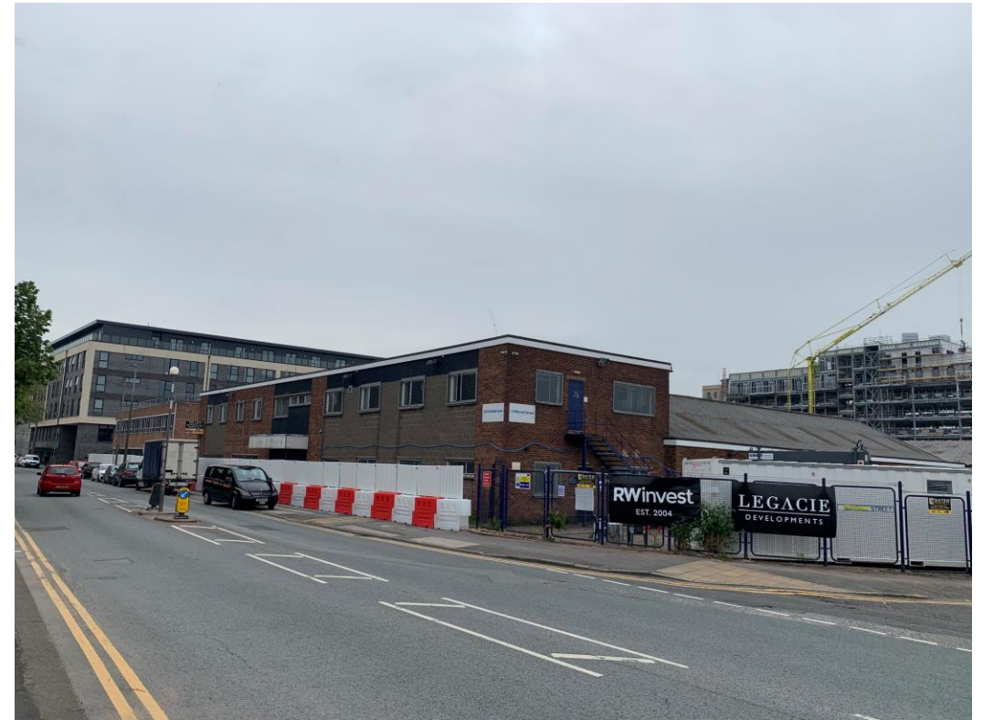
Ordsall Lane site view – buildings to be demolished