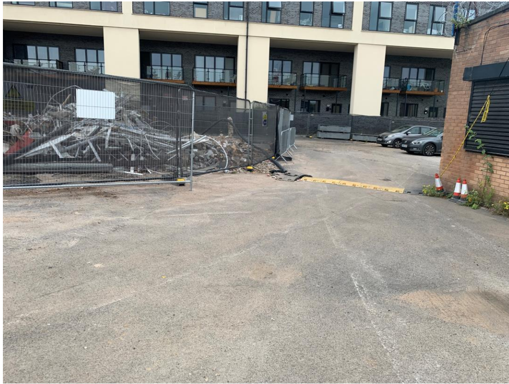
Dyer Street site view – buildings demolished