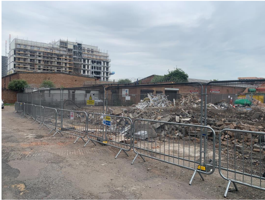
Dyer Street site view – buildings demolished