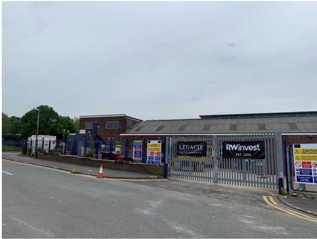
Worrall Street site view – buildings to be demolished