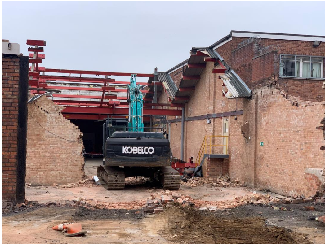
Building being demolished