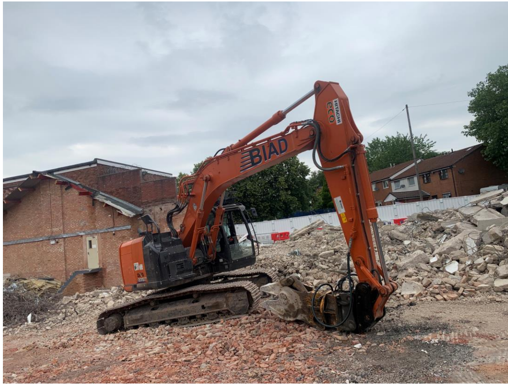
Site view – buildings demolished