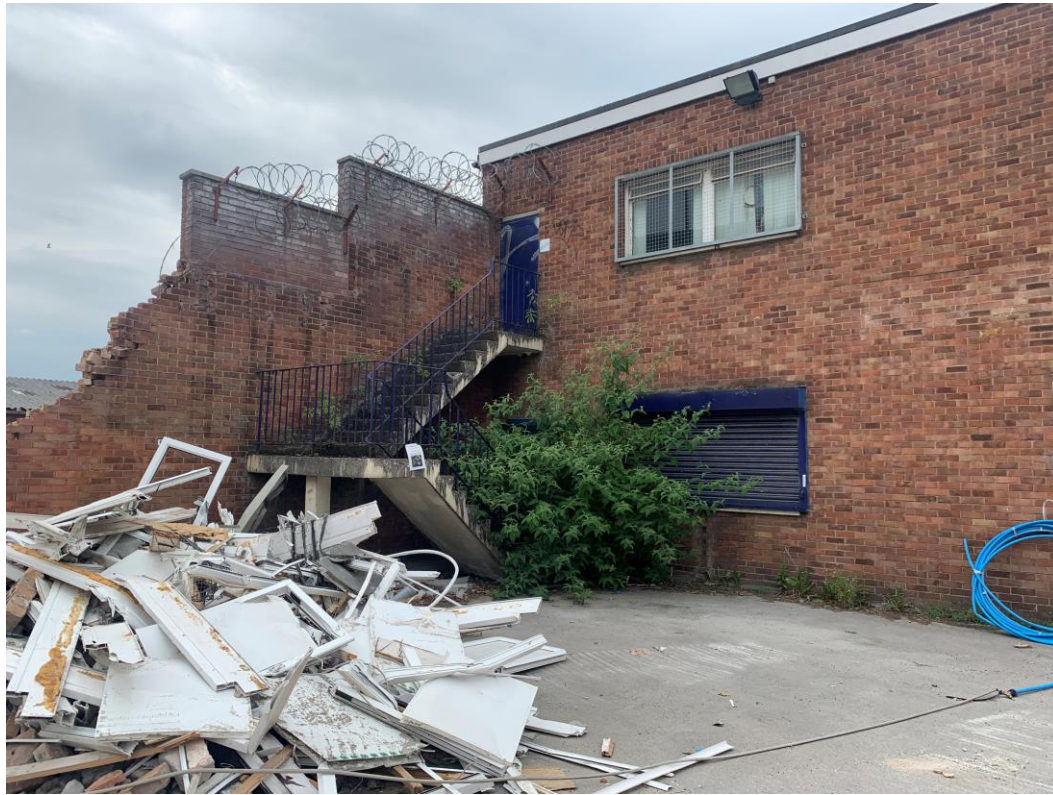
Site view – buildings demolished