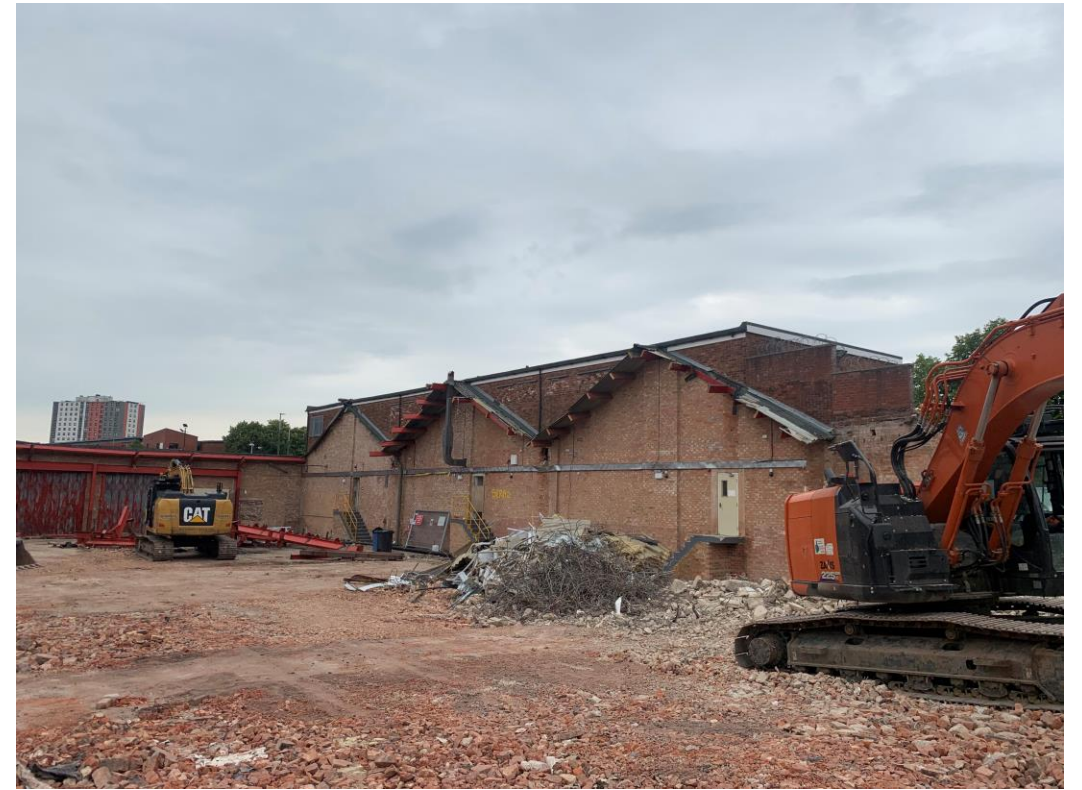
Site view – buildings demolished