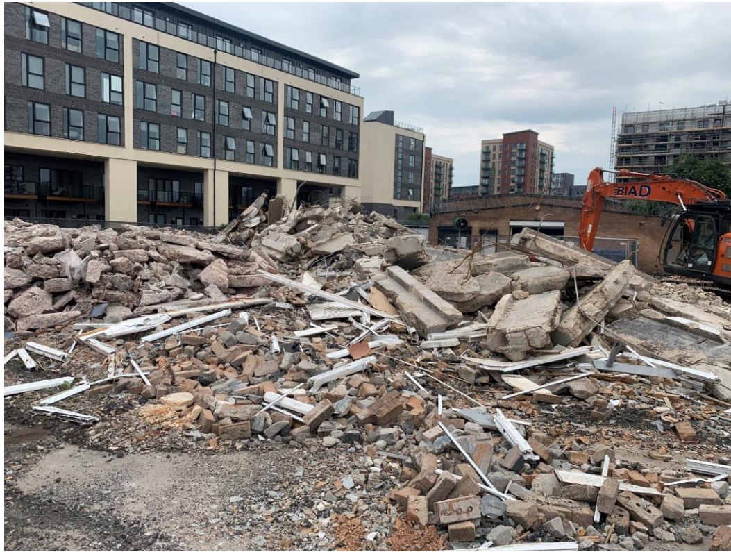
Site view – buildings demolished