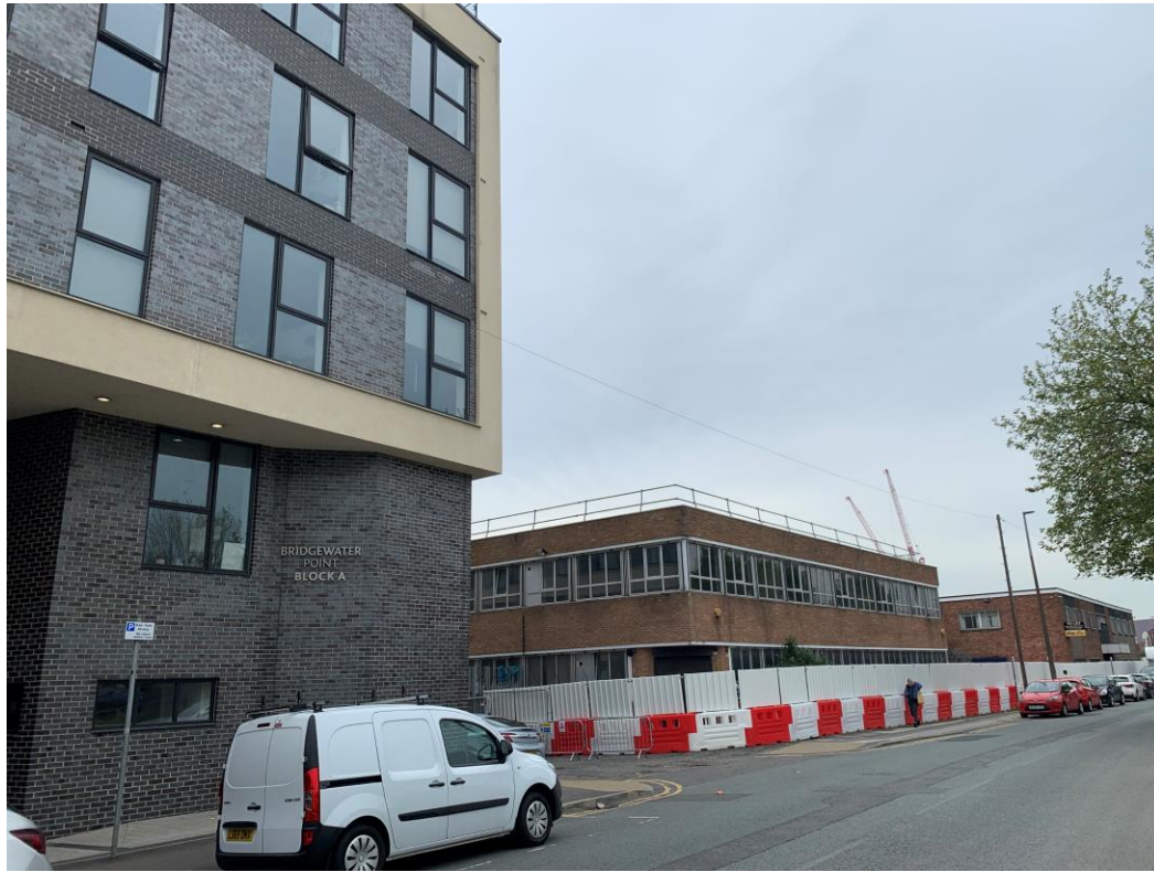
Ordsall Lane site view – buildings to be demolished