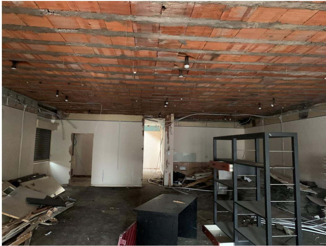
Building being demolished