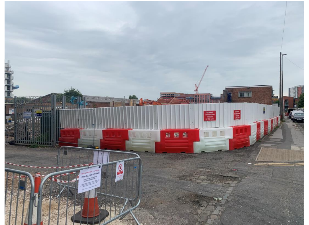
Ordsall Lane site view – buildings demolished