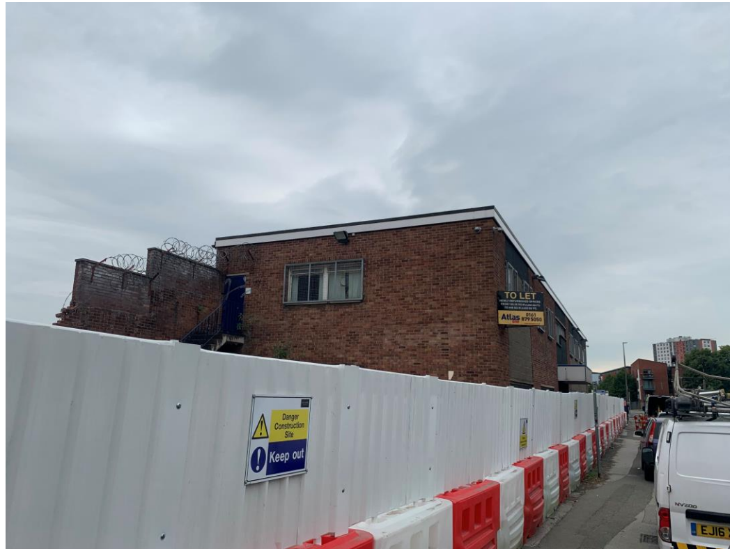
Ordsall Lane site view – buildings demolished