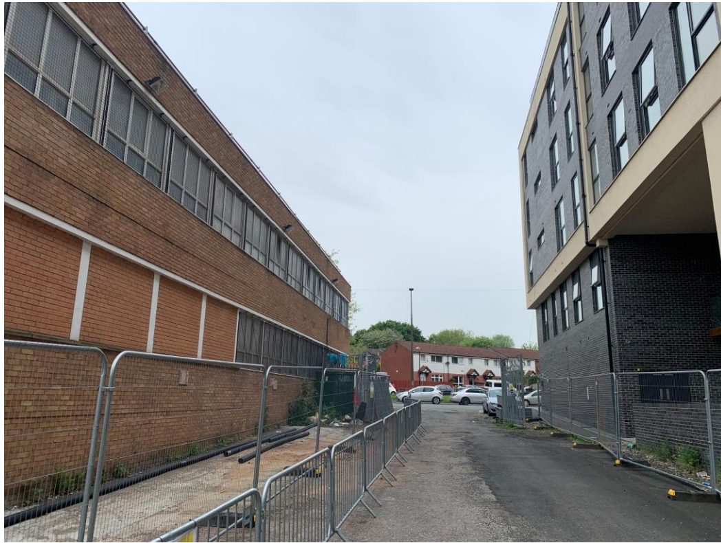
Dyer Street site view – buildings to be demolished