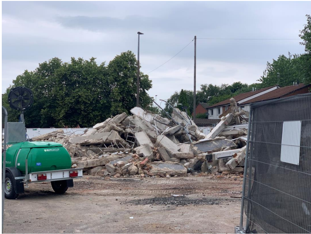
Site view – buildings demolished