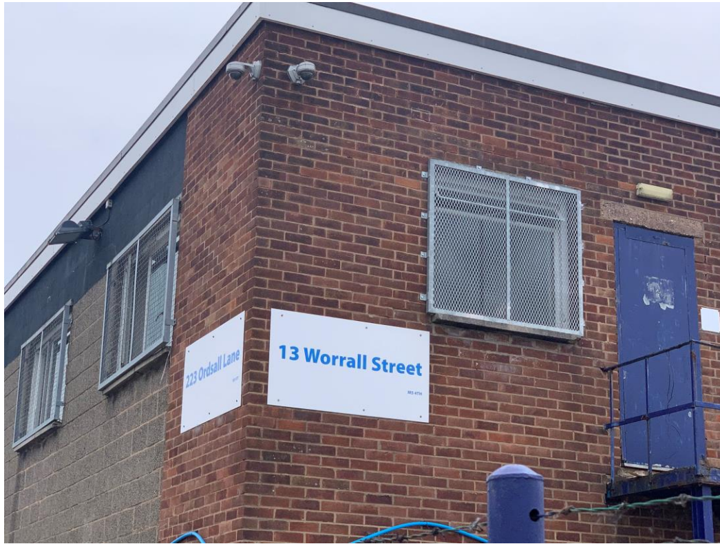
Building to be demolished