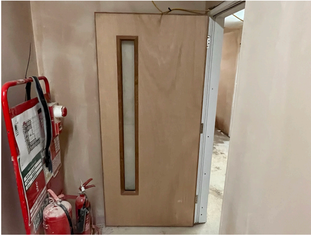
Communal internal door installed