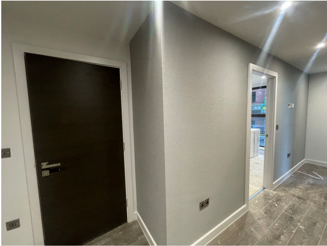
Wallpaper installation complete