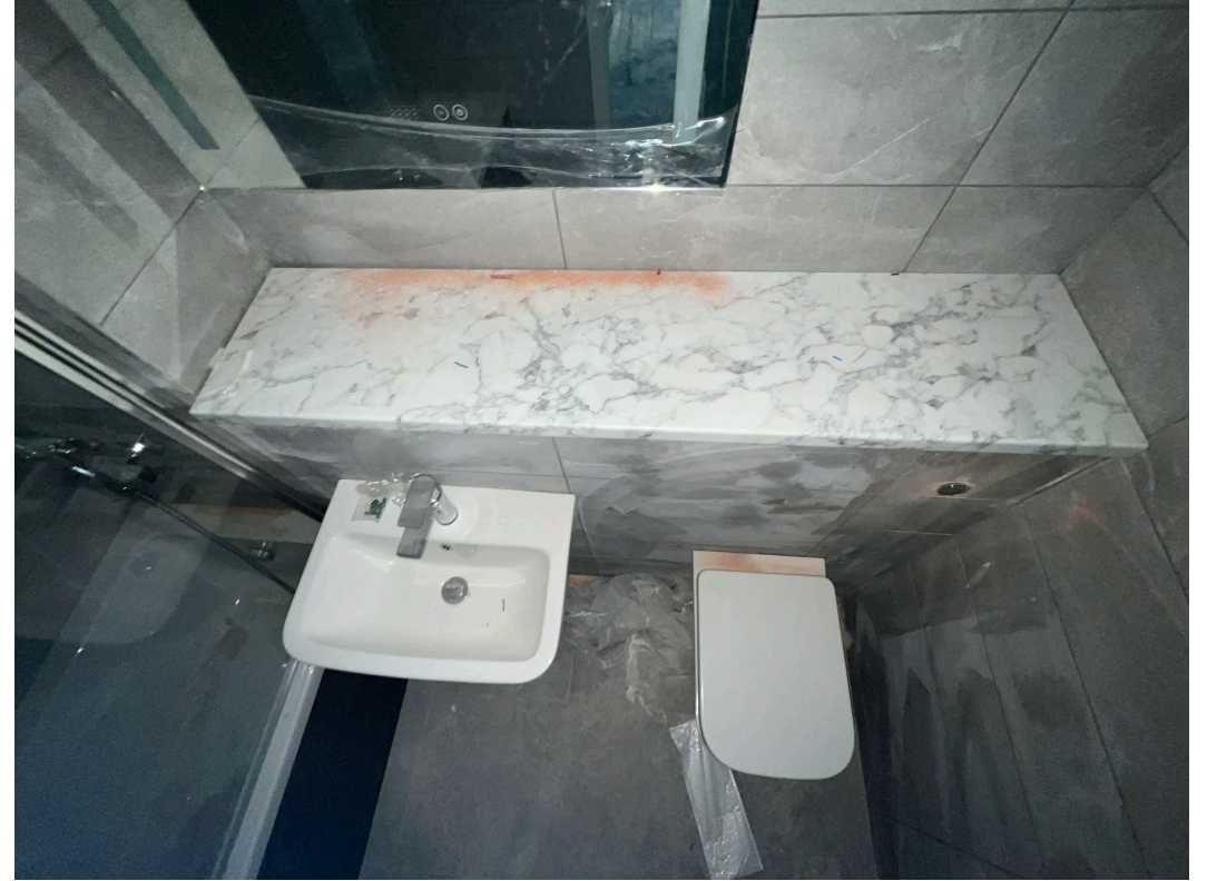
Vanity lid installed