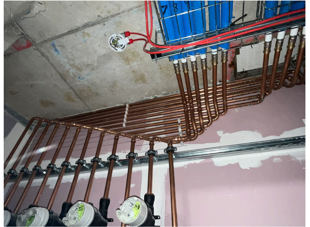
Apartment water mains distribution installed