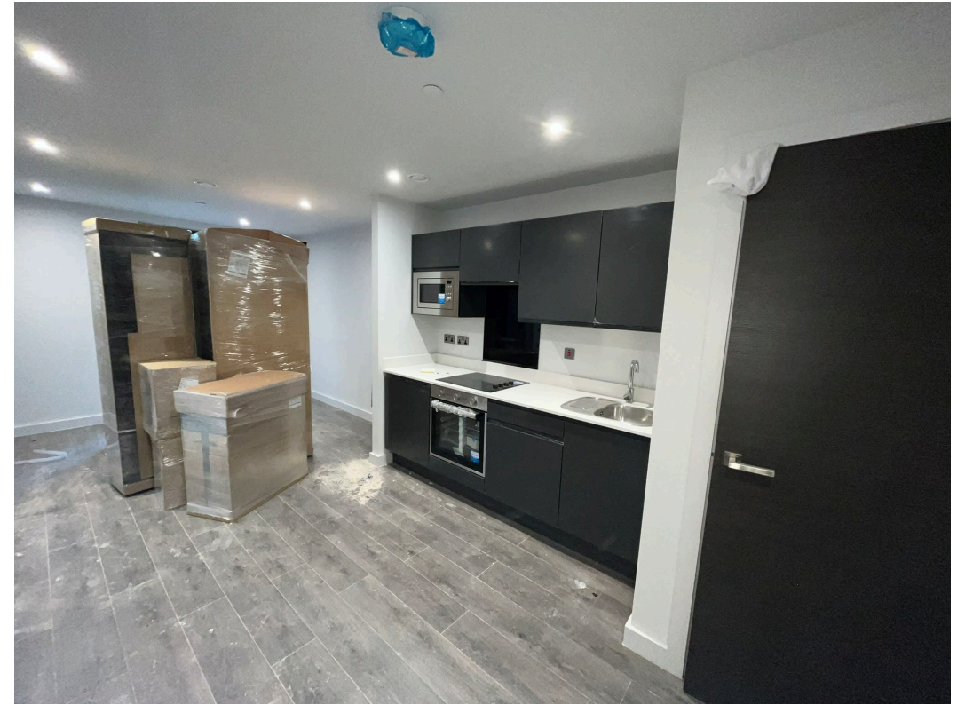
Kitchen installation complete