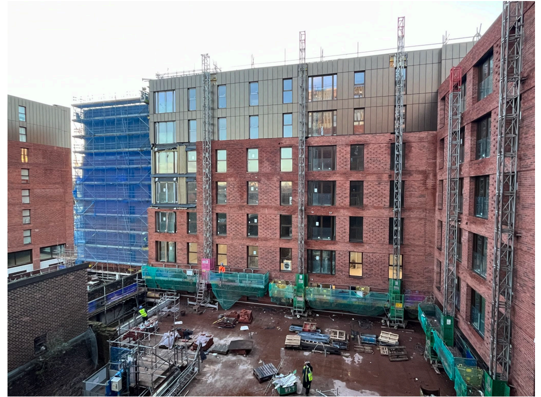
Block D Section B – Façade works complete to Elevation 7