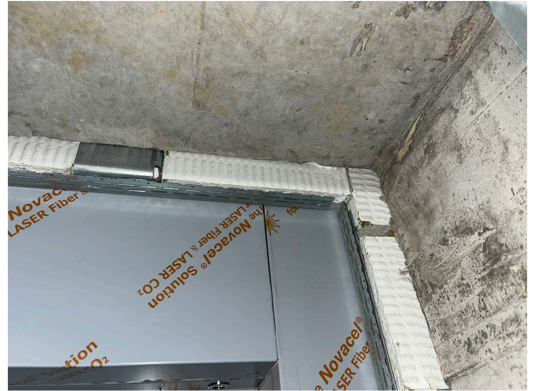
Fire stopping installed