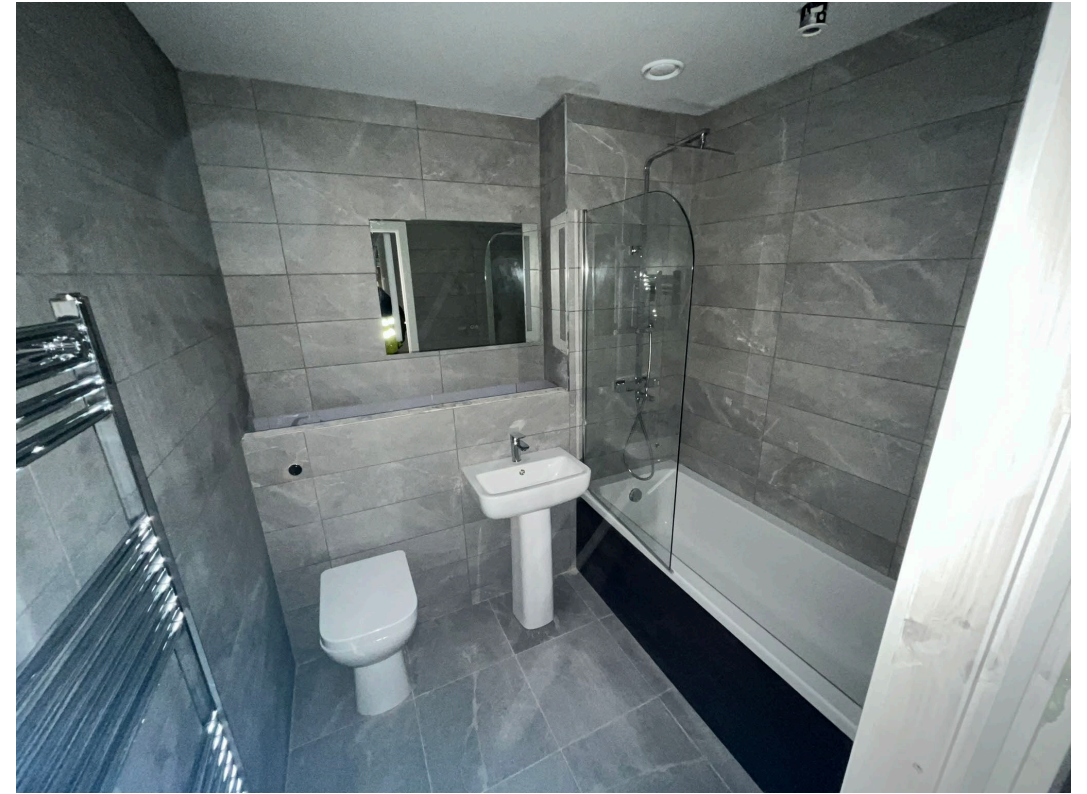
Sanitary installation complete