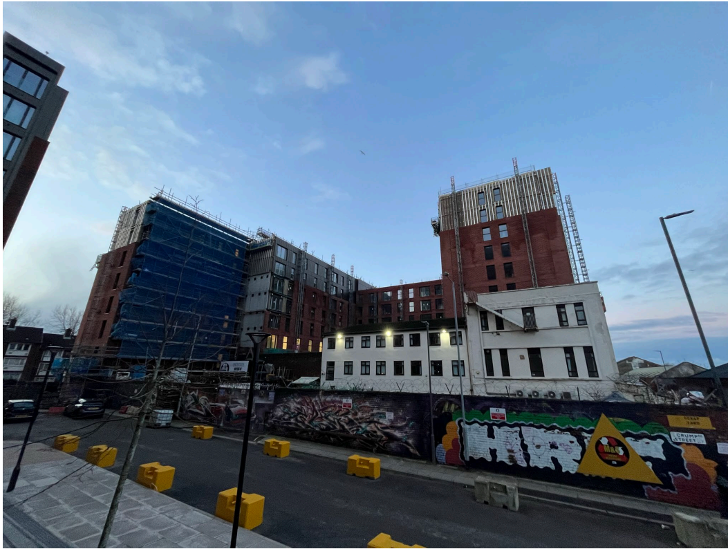
Block D – Viewed from Crump Street