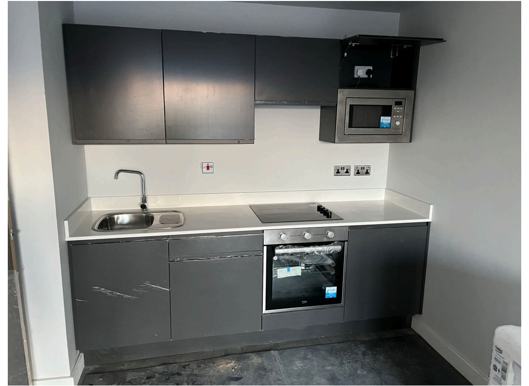
Kitchen installation complete