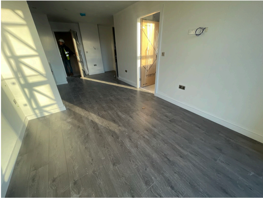
Laminate flooring installation complete