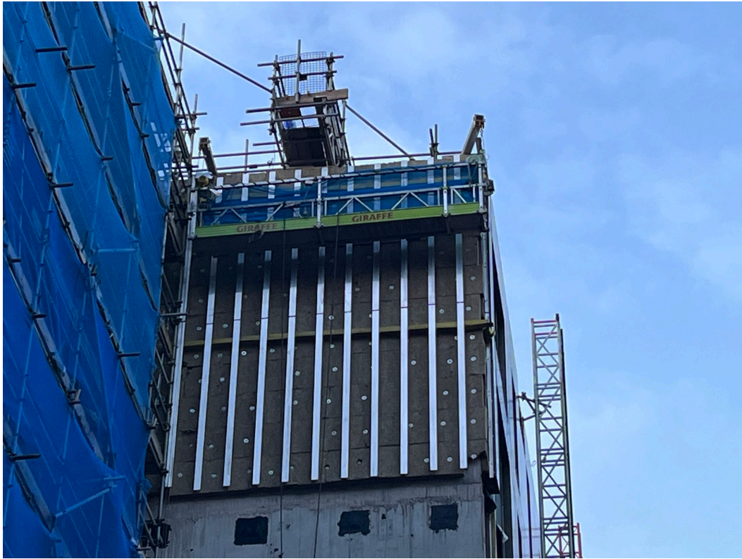
Block D Section B – Cradle in place for façade works