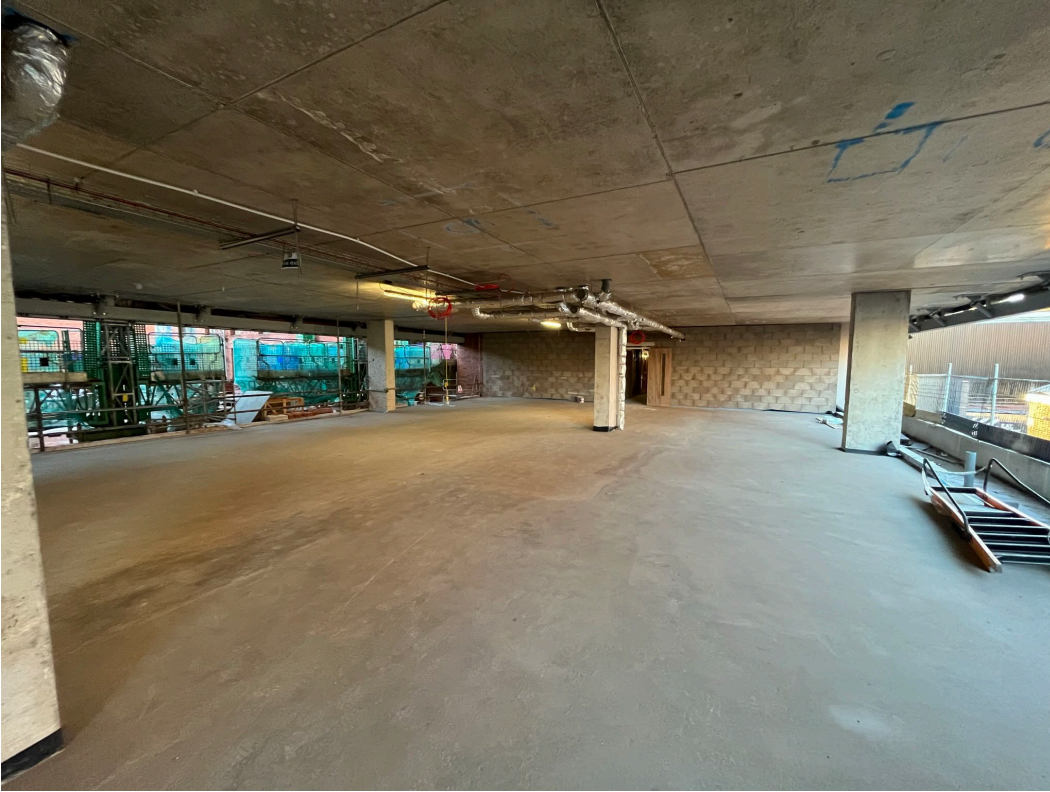
Floor screed installed to amenity area