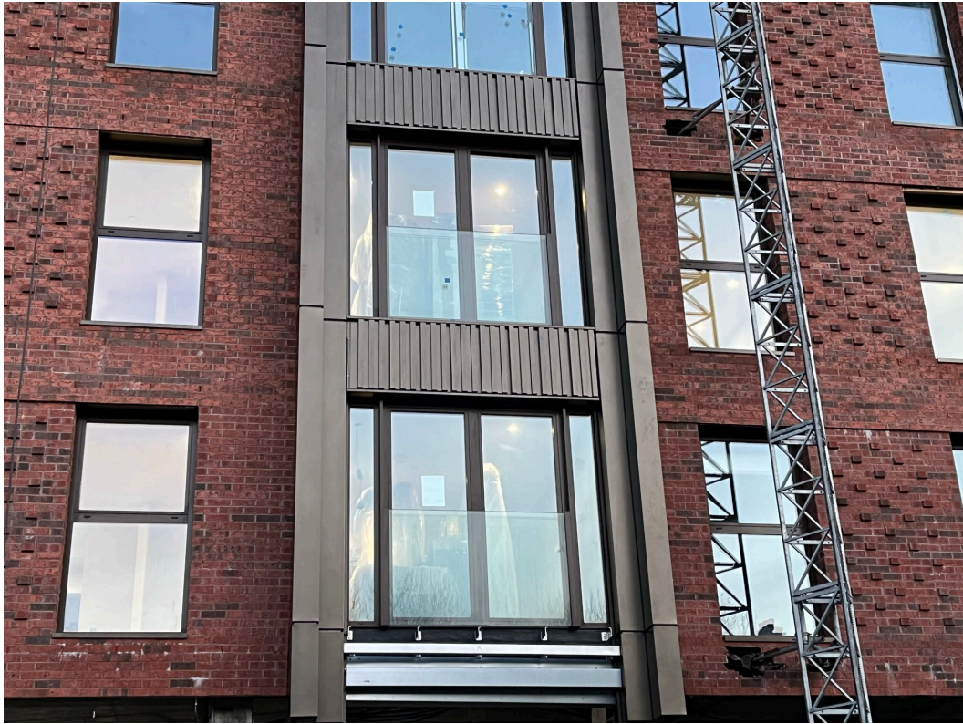
Oriel cladding installed