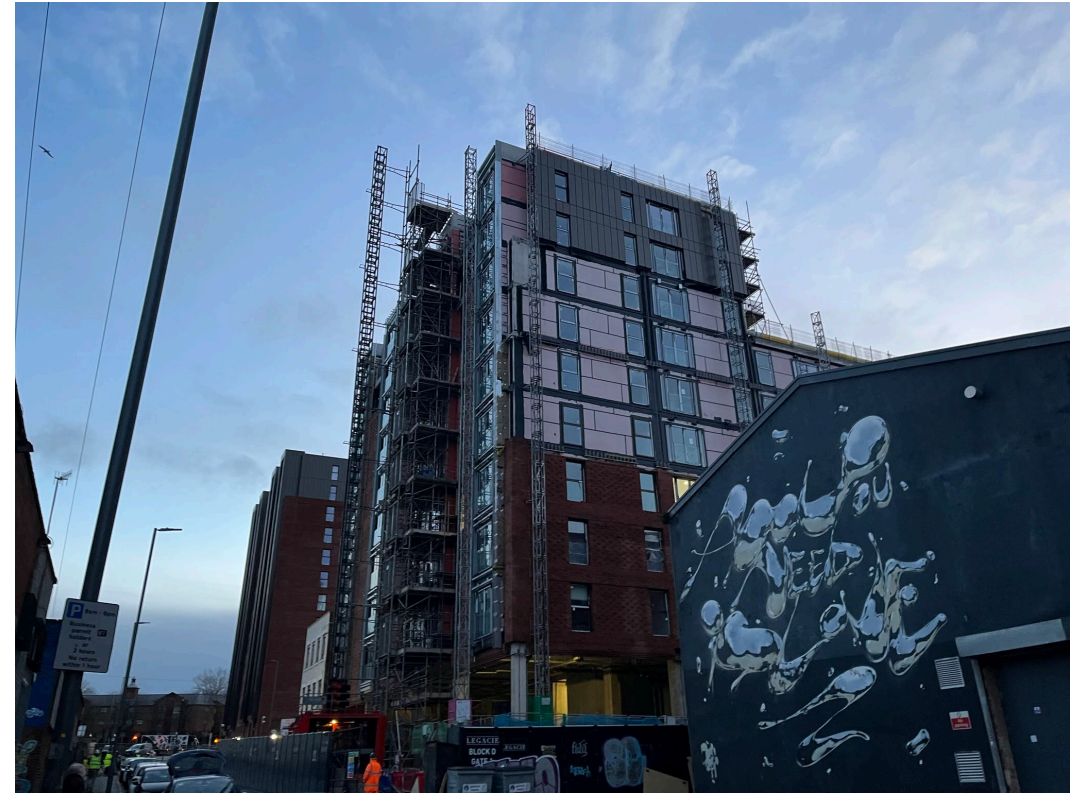
Block D Section A – Viewed from Greenland Street