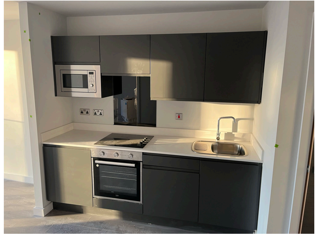
Kitchen installation complete