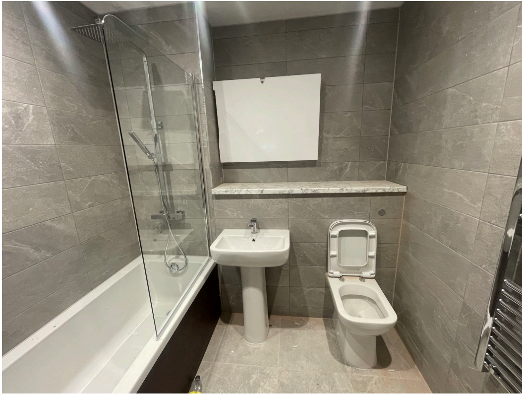
Sanitary installation complete