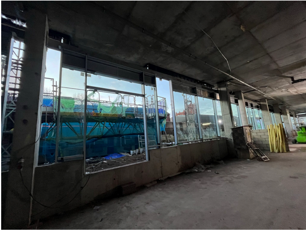
Curtain wall installation commenced