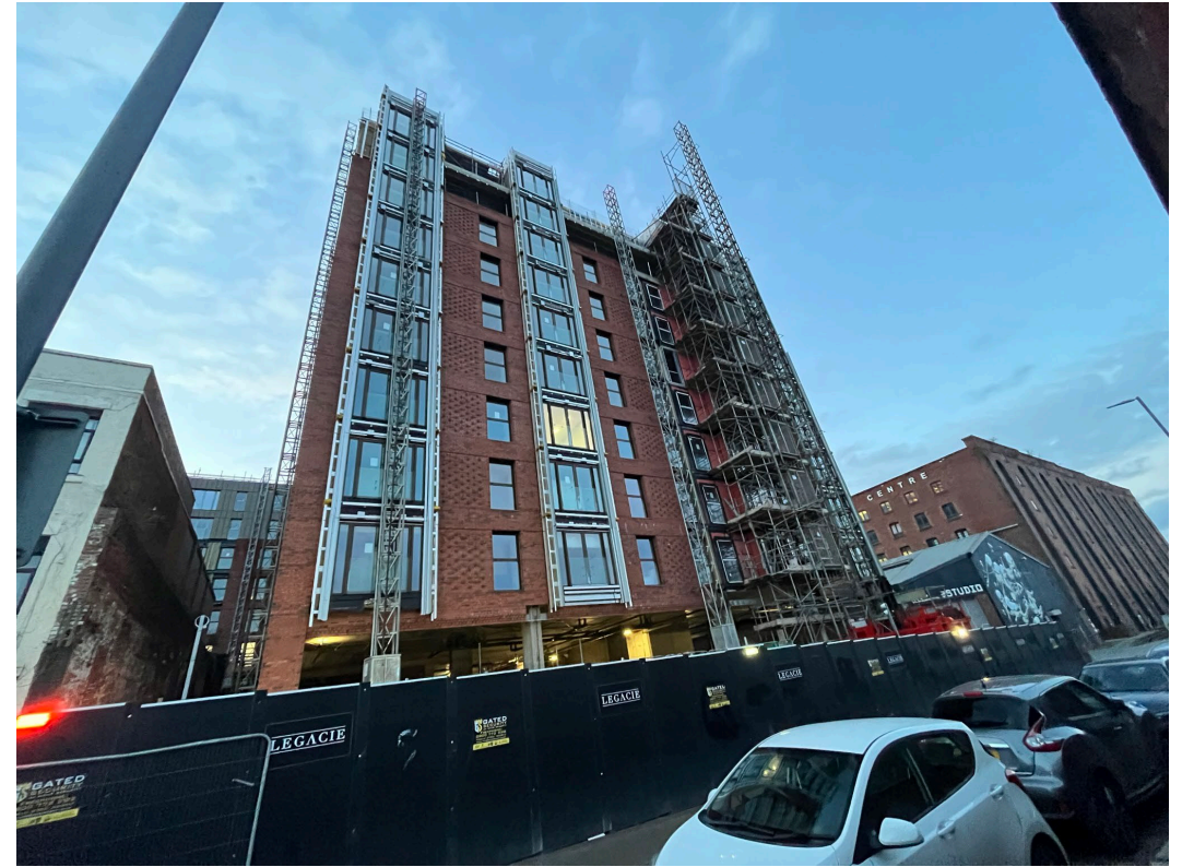
Block D Section A – Viewed from Greenland Street