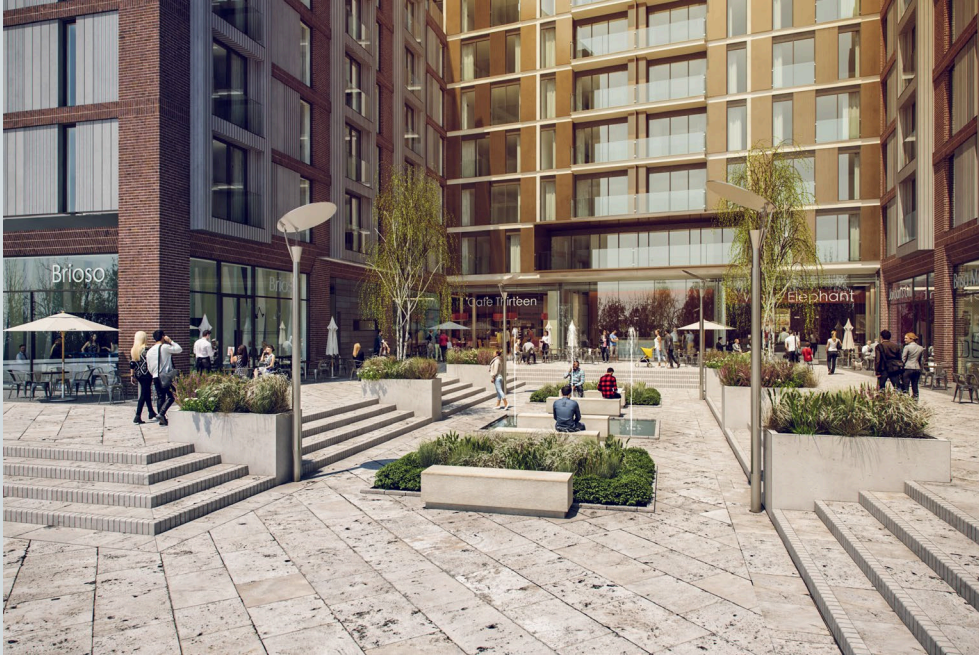
Land at corner of Upper Parliament Street & Great St George Street, Liverpool L1