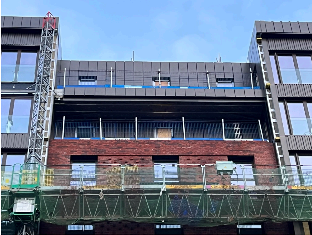
Block D Section B – Cladding to balconies ongoing