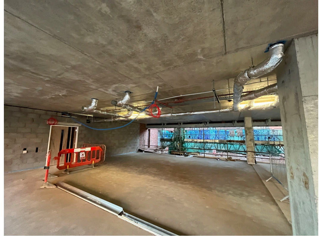
Gym partitions set-out