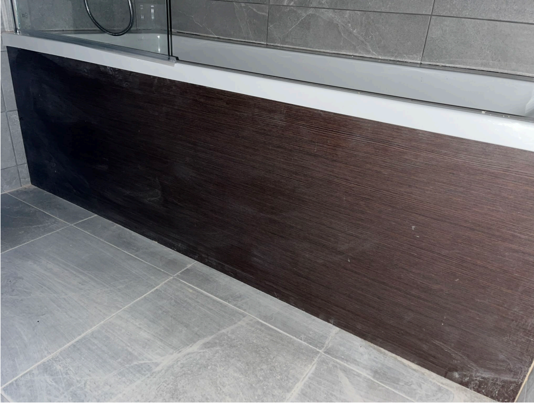
Bath panel installed