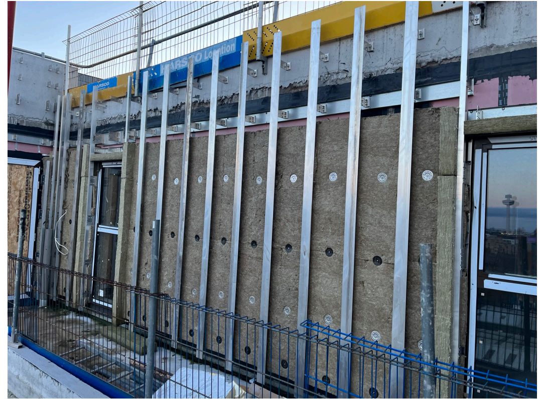
Cladding rails installed to balconies