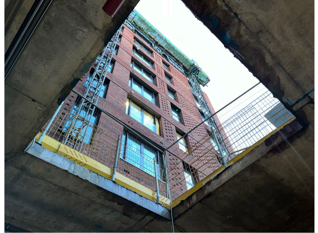
Block D Section A – Brickwork installation complete