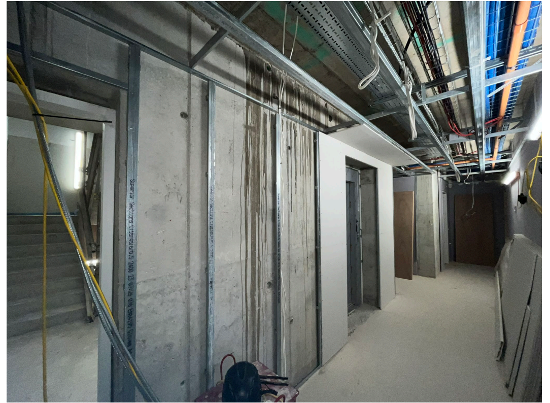
Communal area fit out ongoing