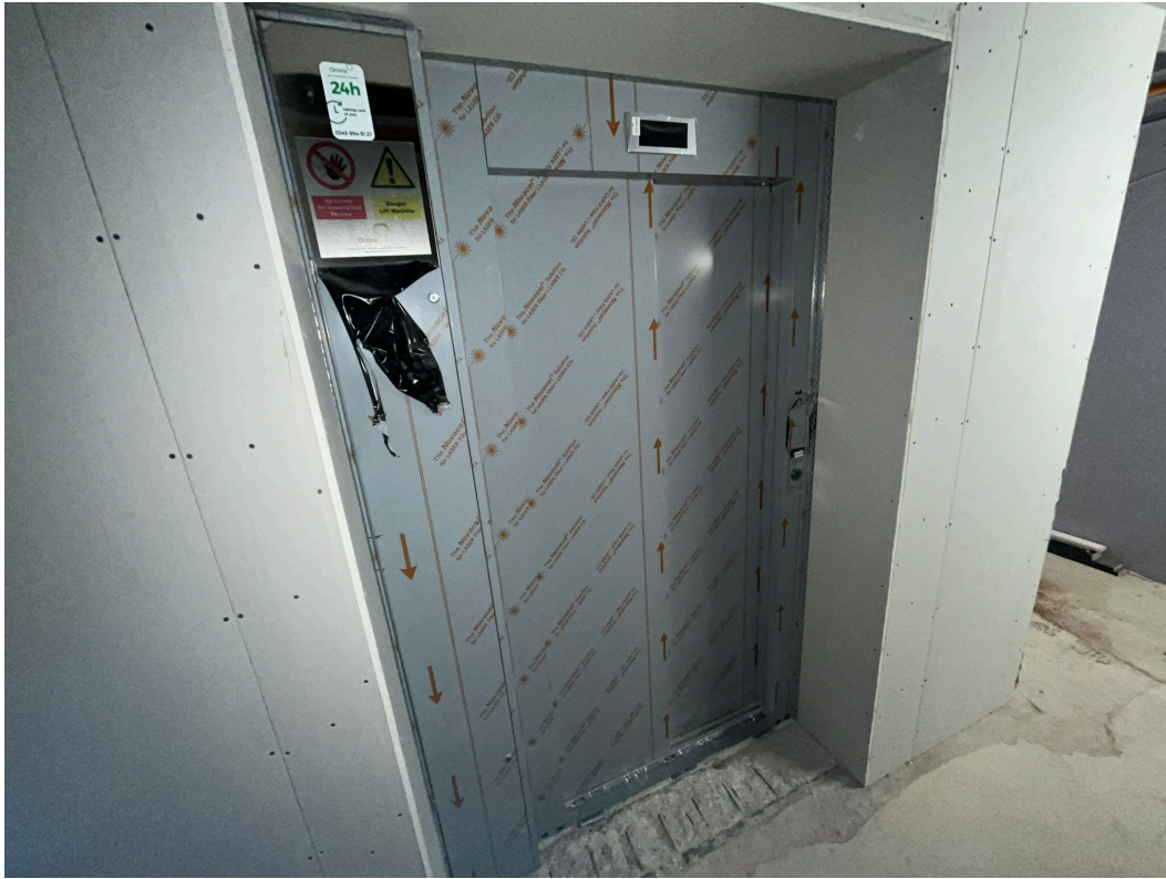
Lift installation ongoing