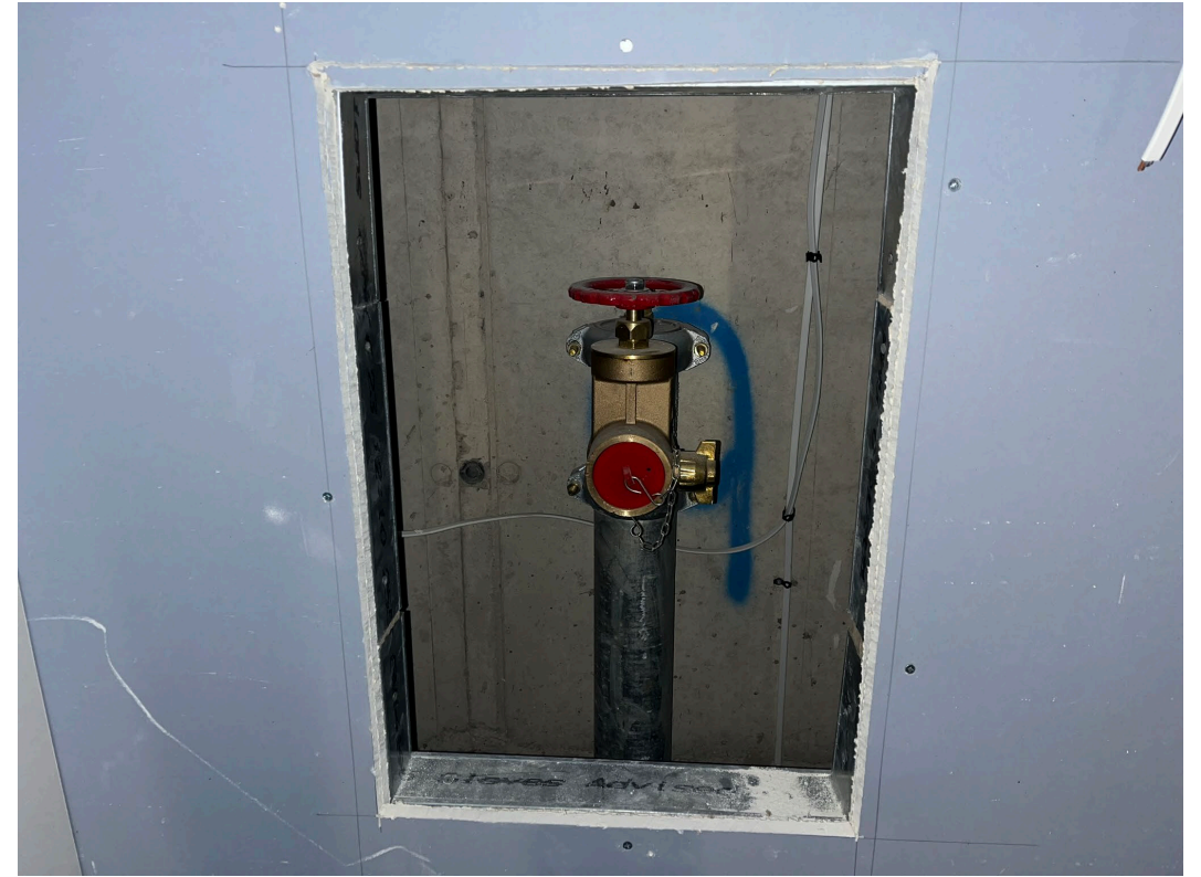
Wet riser installed