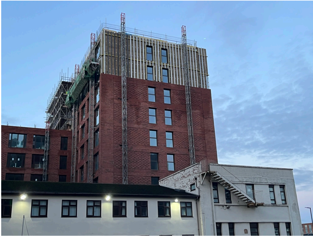
Block D Section A – Viewed from Crump Street