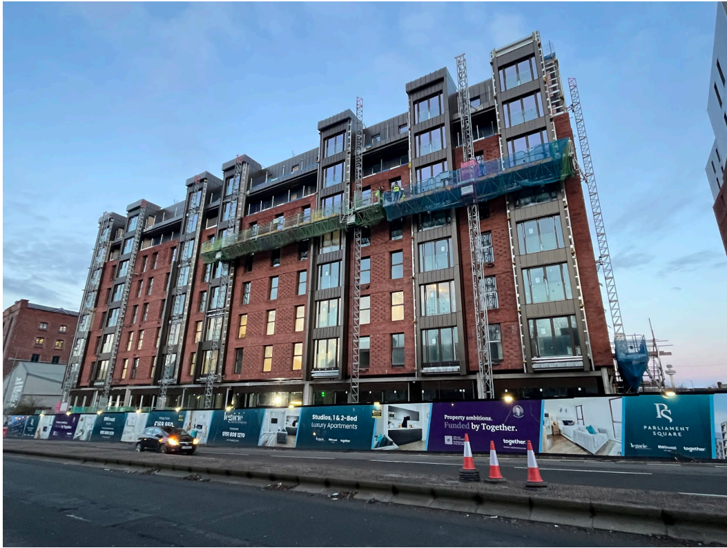
Block D Section B – Viewed from Parliament Street