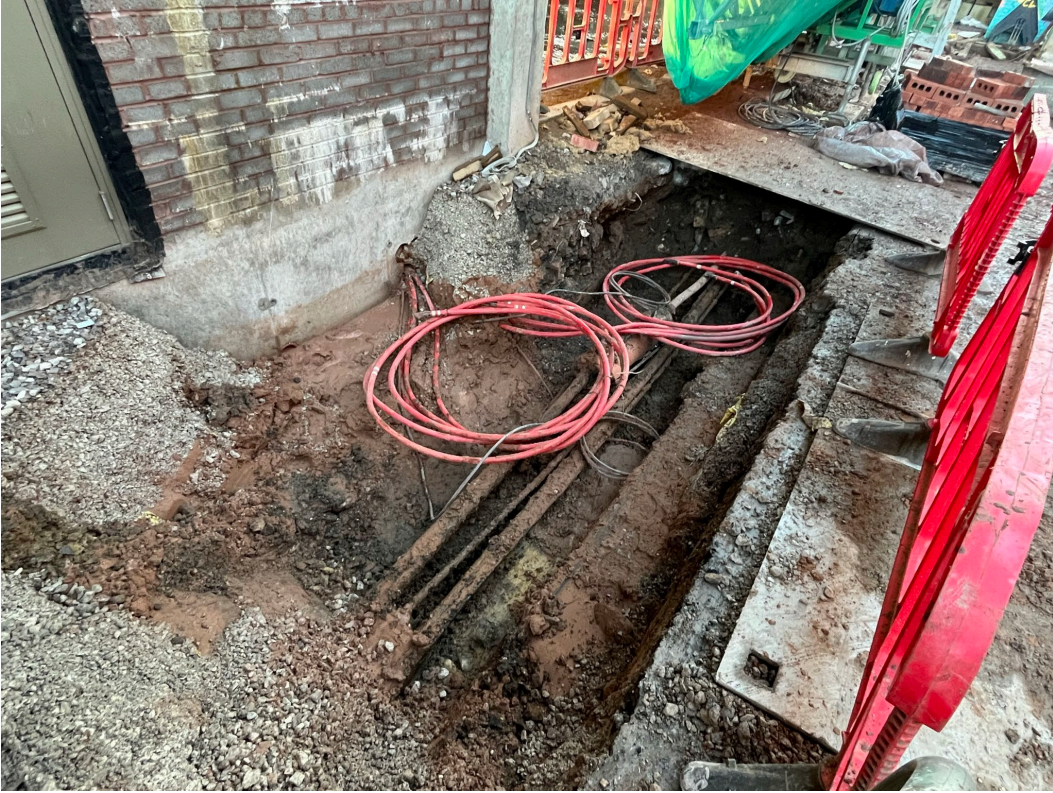
Excavation complete for electrical connection works