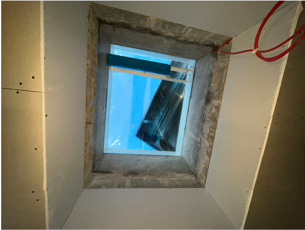
Rooflight installed to staircore