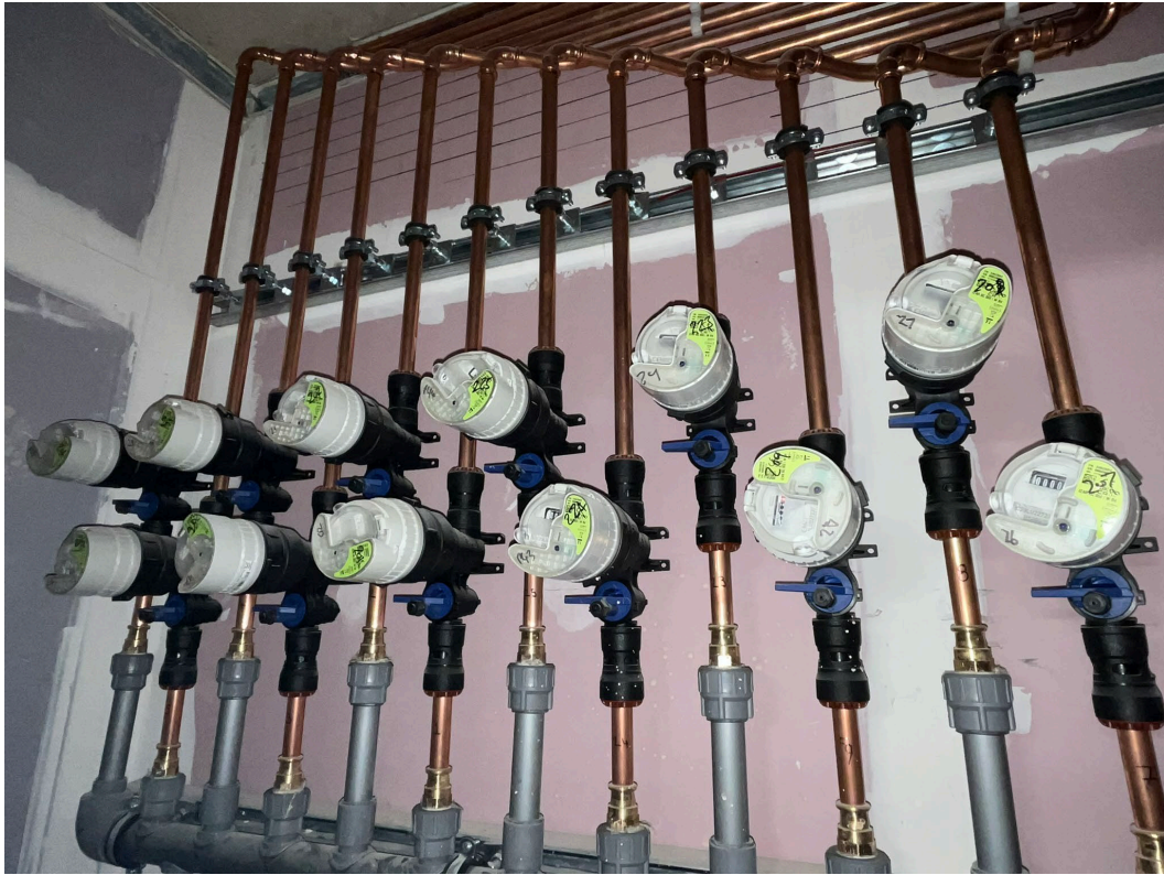
Water meters installed