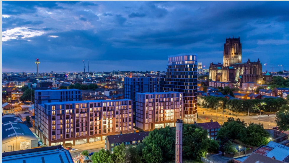
Land at corner of Upper Parliament Street & Great St George Street, Liverpool L1