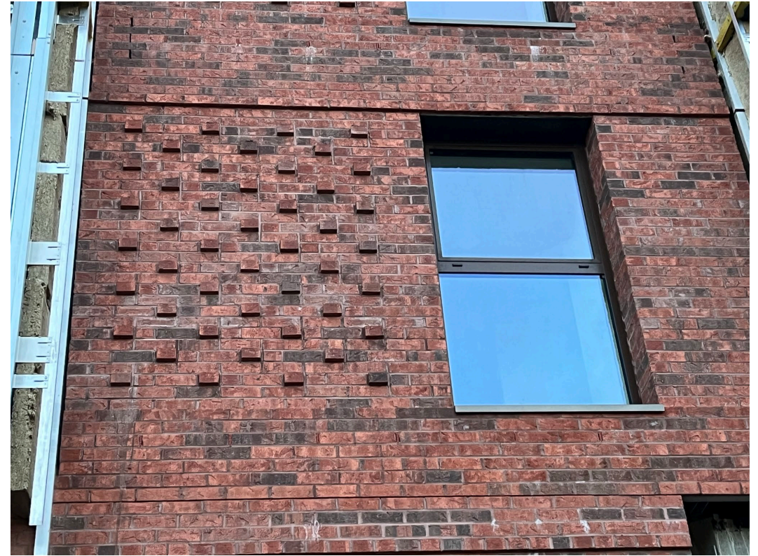
Flemish bond brickwork detail