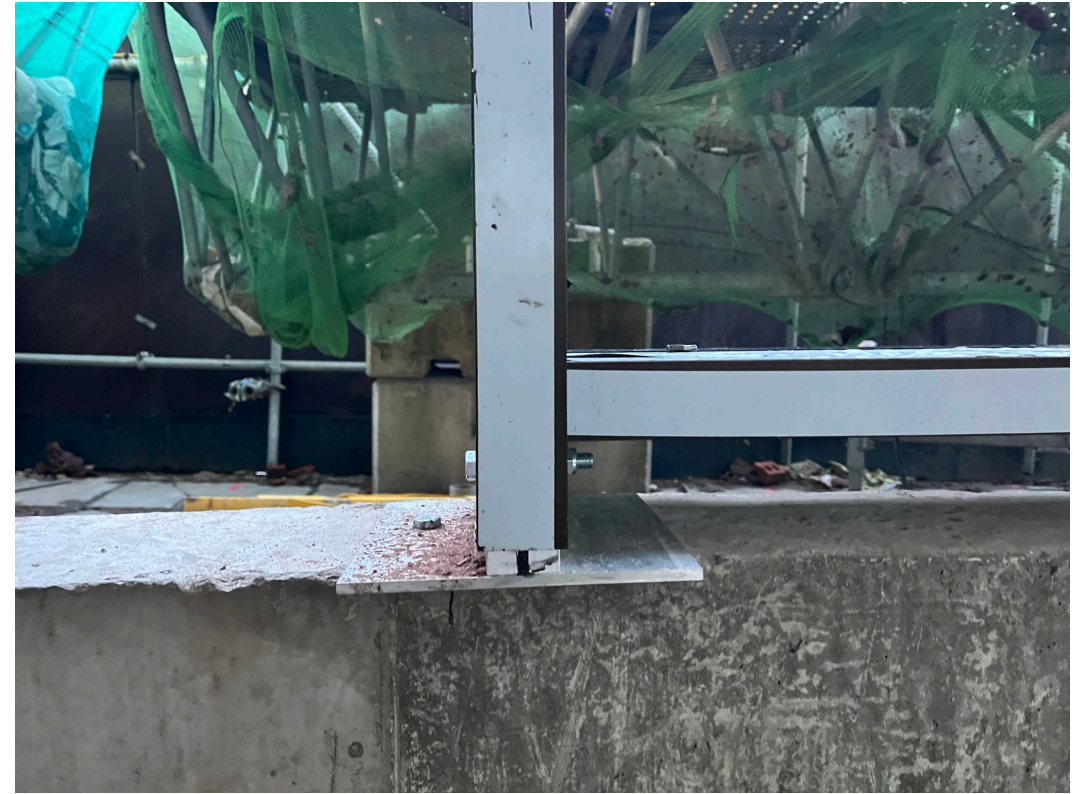
Curtain wall fixing detail