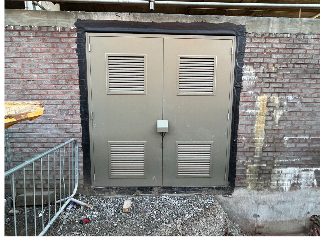
Substation door installed