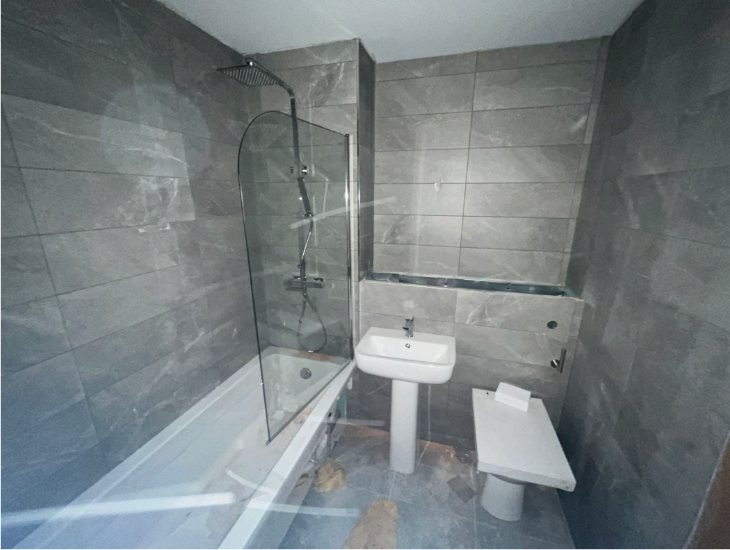
Sanitary installation ongoing