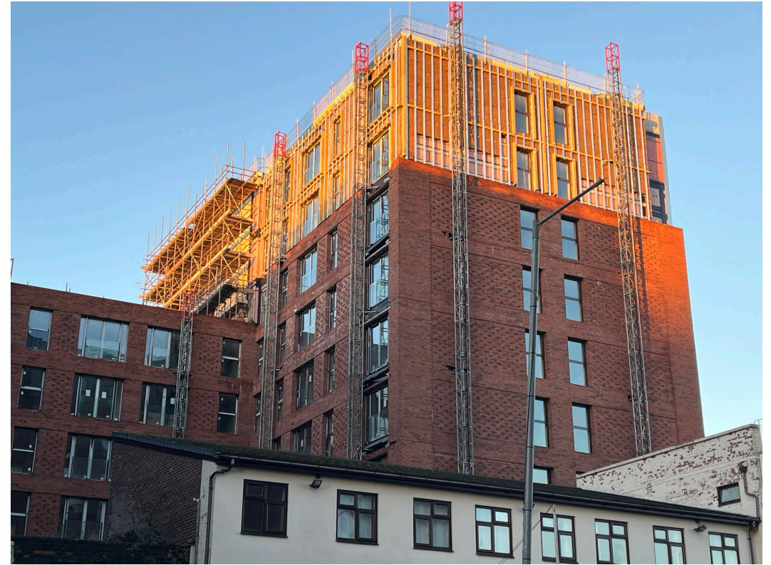
Section A - cladding installation progressing