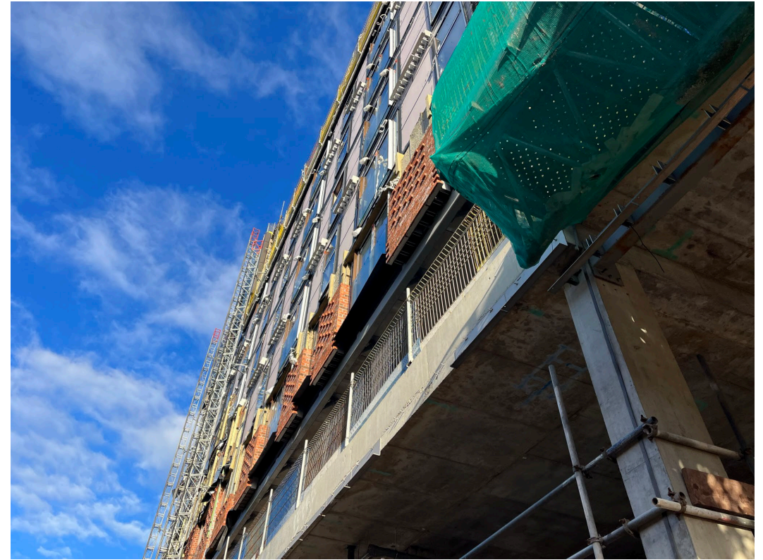
Block D Section A, B and C – Viewed from Greenland Street