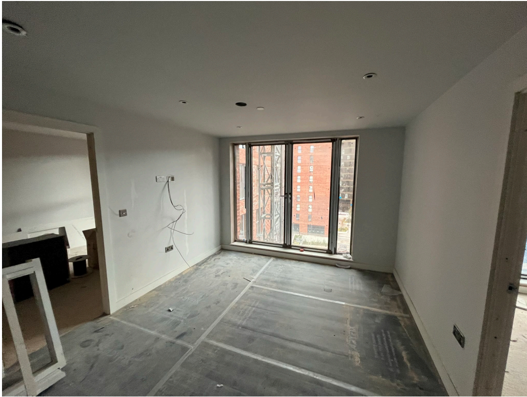
Apartment fit-out ongoing