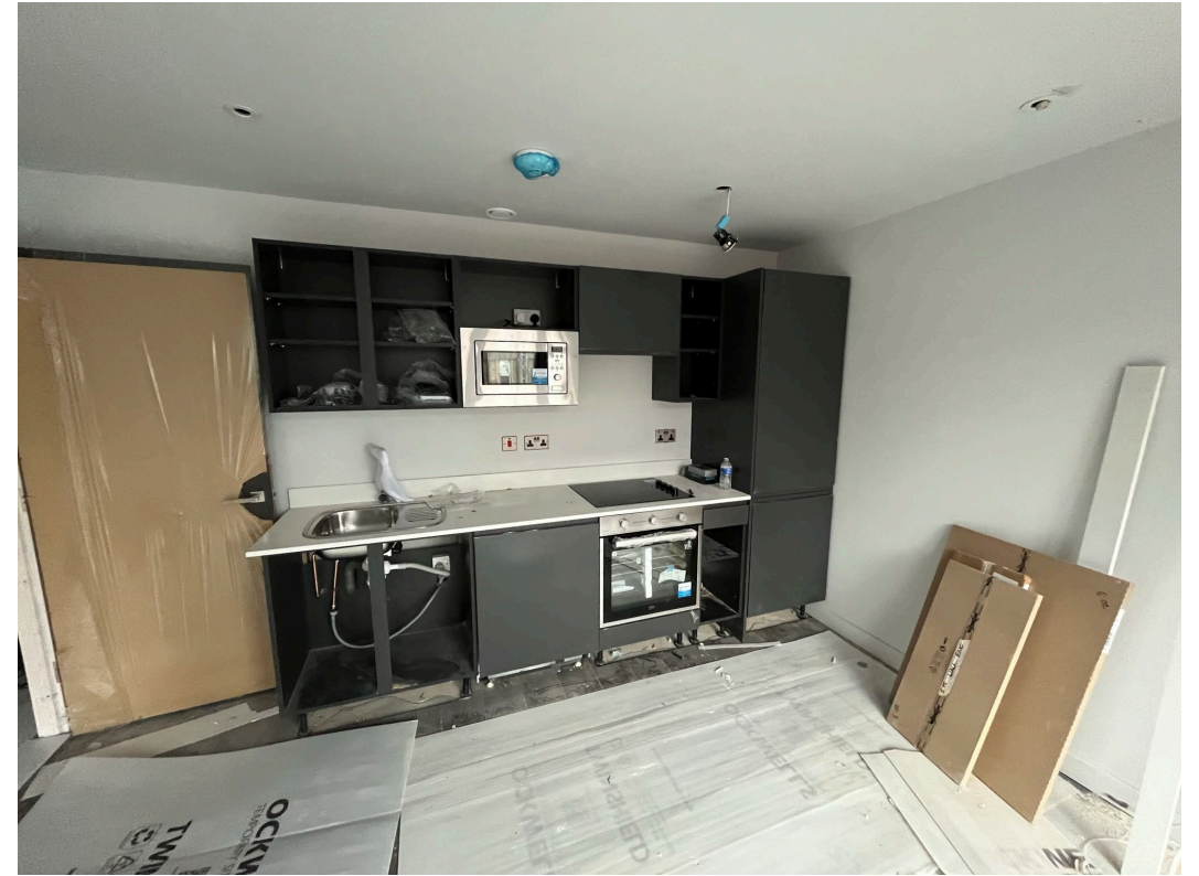
Kitchen installation ongoing