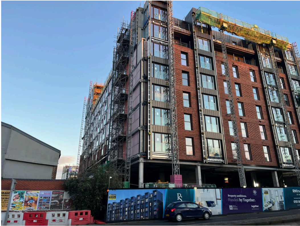
Block D Section B and C – Viewed from Parliament Street