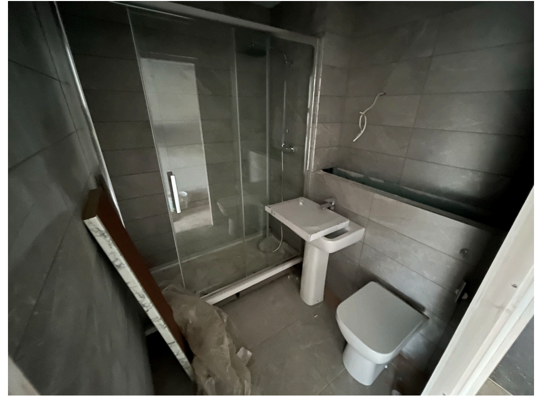
Sanitary installation ongoing