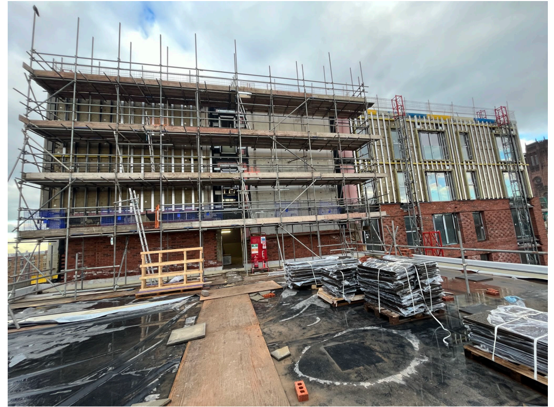
Section A – cladding installation progressed