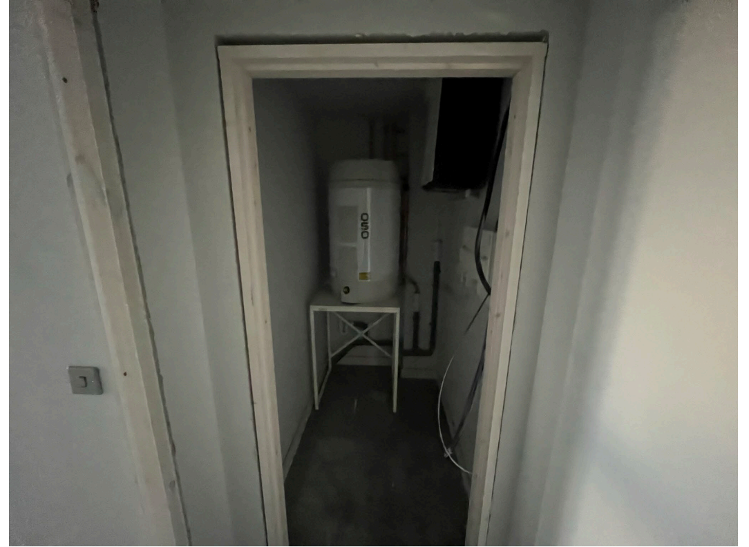
Second fix mechanical ongoing