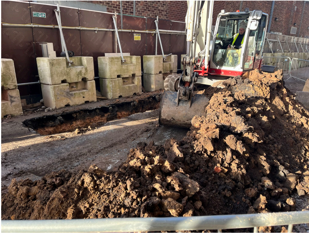
Drainage connection works ongoing