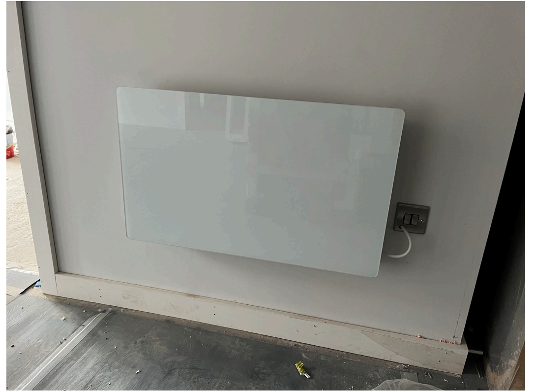
Panel heater installation progressing