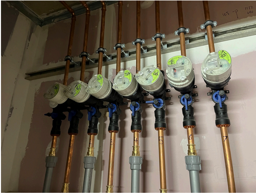
Water meters installed