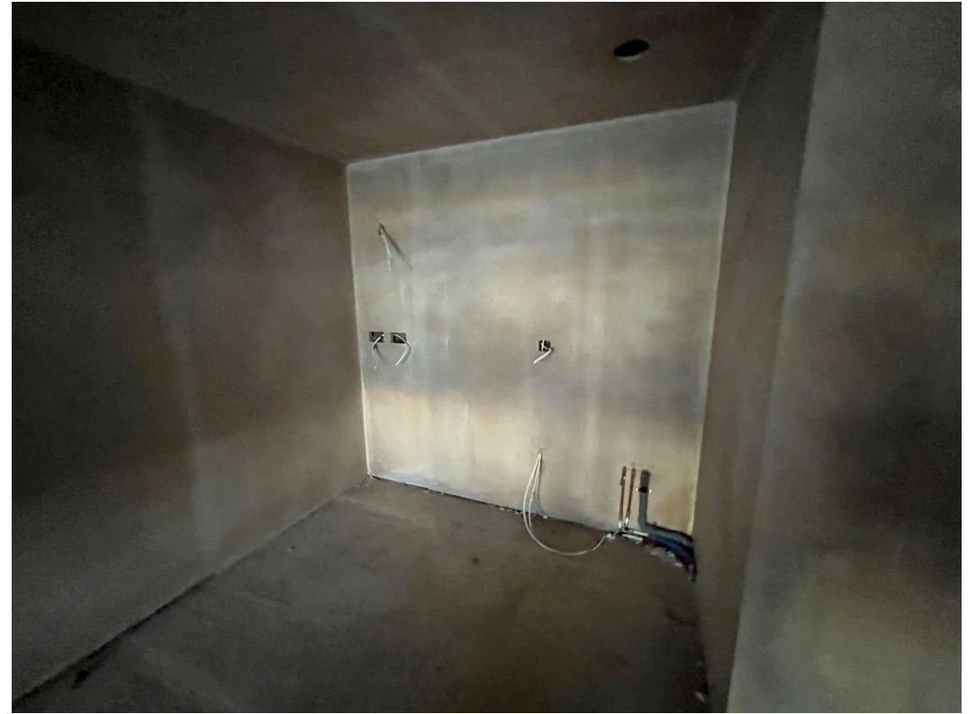
Plaster skim coat ongoing