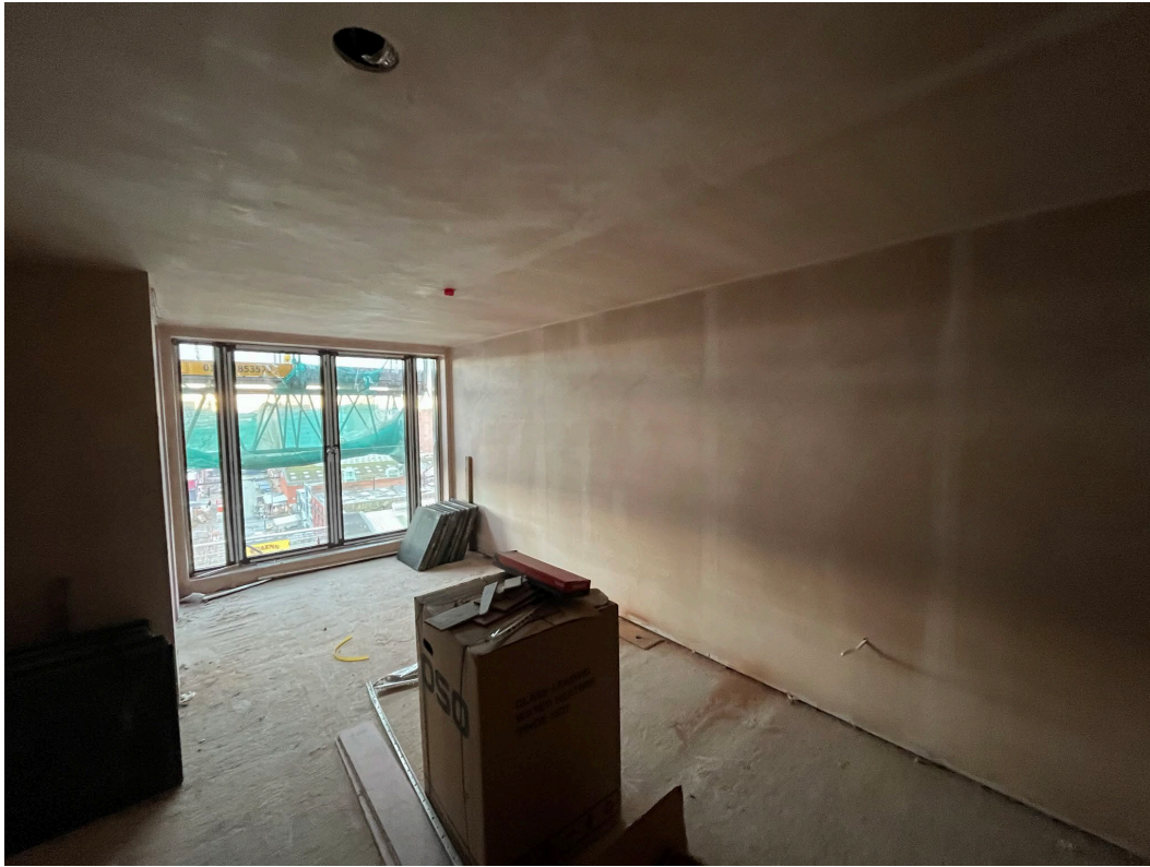
Plaster skim coat ongoing