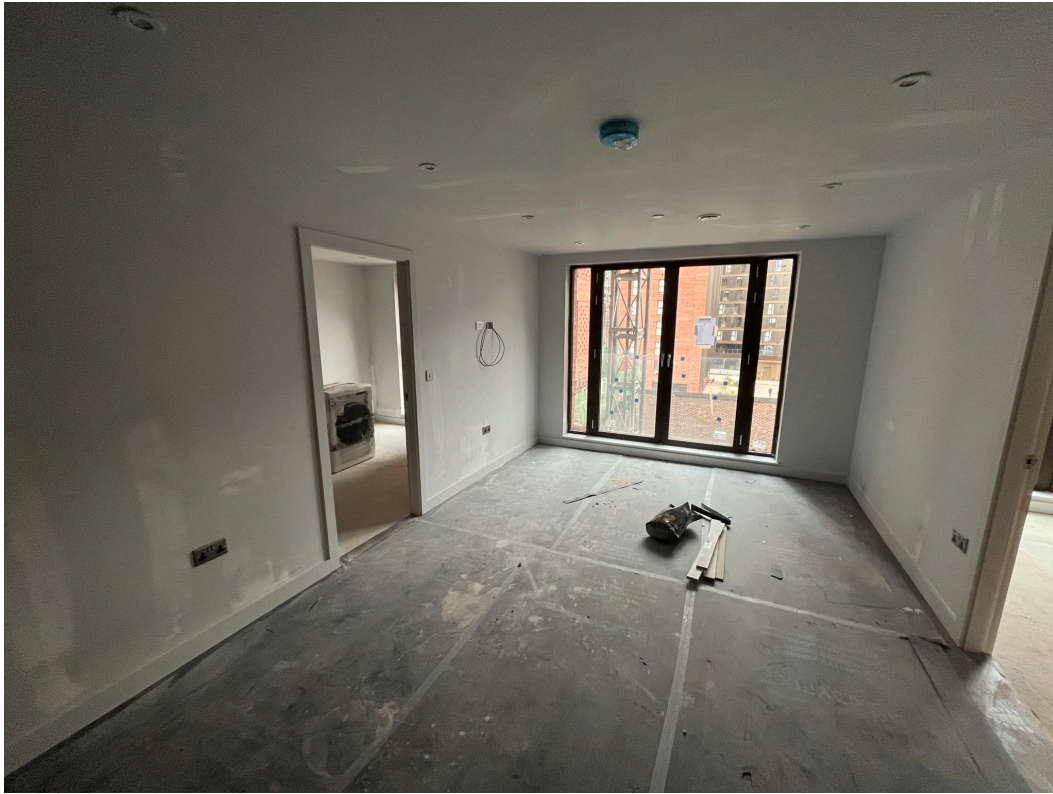
Apartment fit-out ongoing