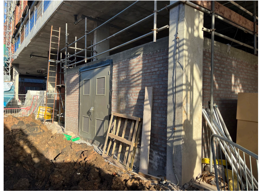
Substation construction complete