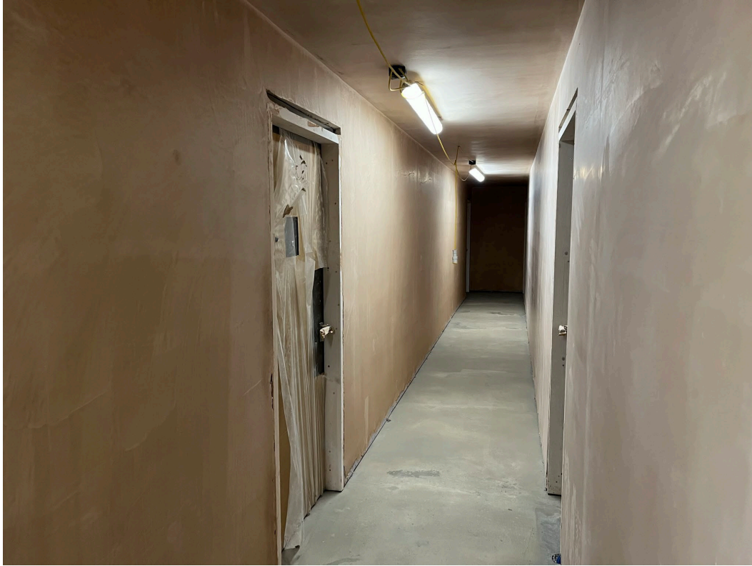
Plaster skim coat ongoing