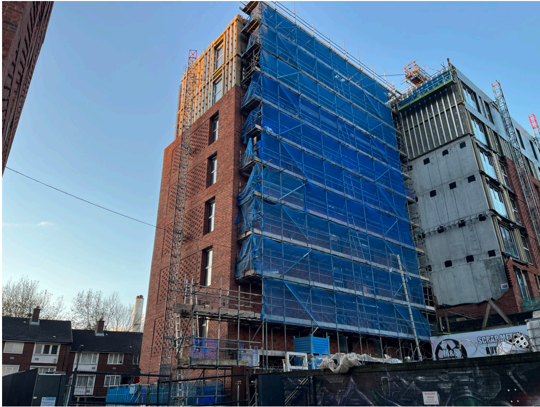
Block D Section B – Viewed from Crump Street