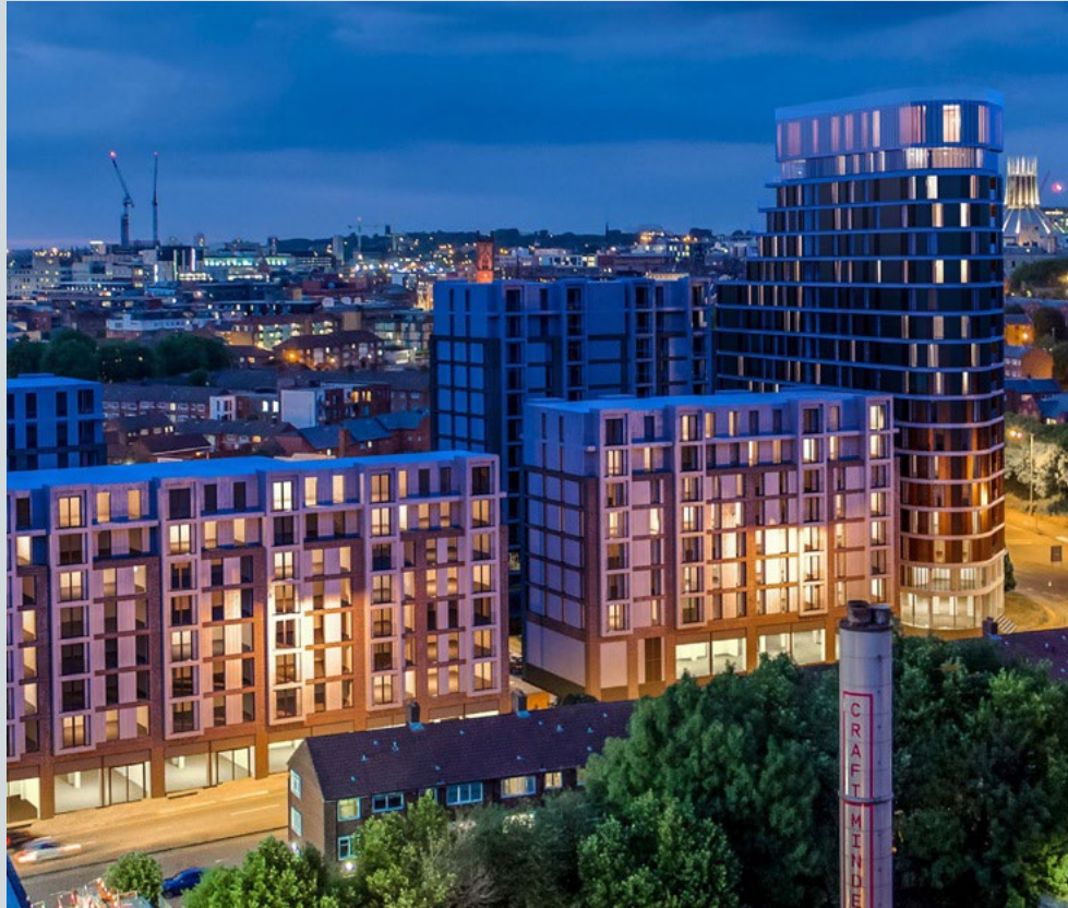
Land at corner of Upper Parliament Street & Great St George Street, Liverpool L1