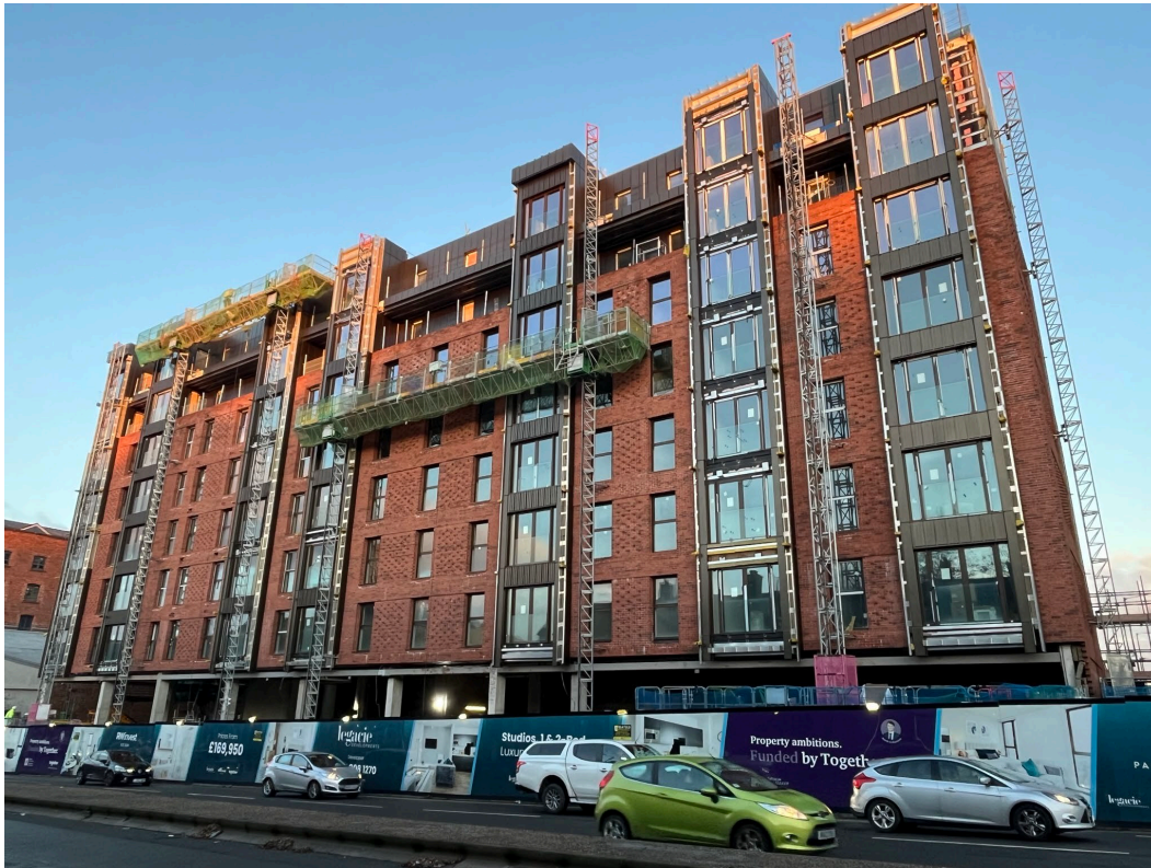
Block D Section B – Viewed from Parliament Street