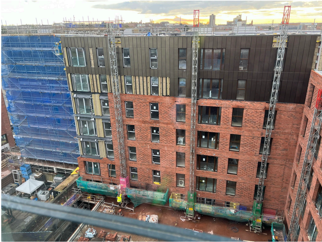
Section B – cladding installation progressing