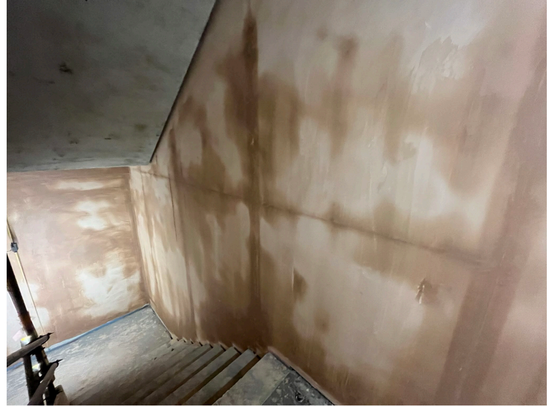
Plaster skim coat ongoing