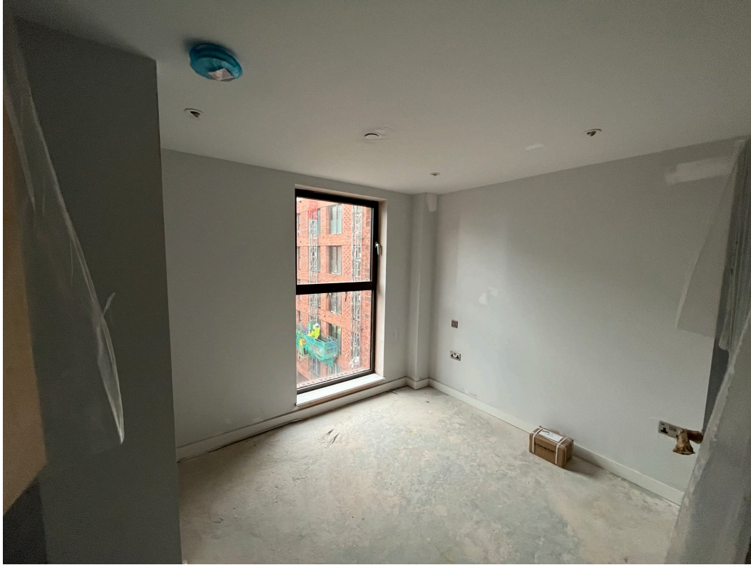
Apartment fit-out ongoing