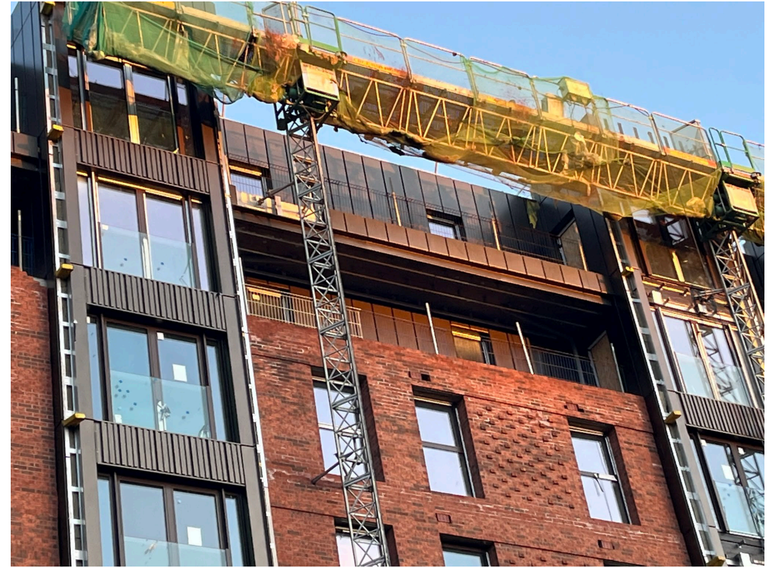
Balcony cladding installation progressed