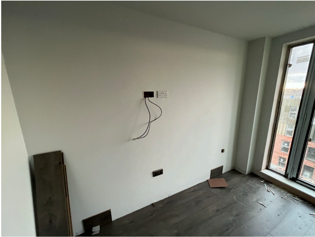
Second fix electrical ongoing