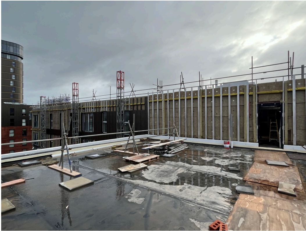
Section B – cladding installation progressed