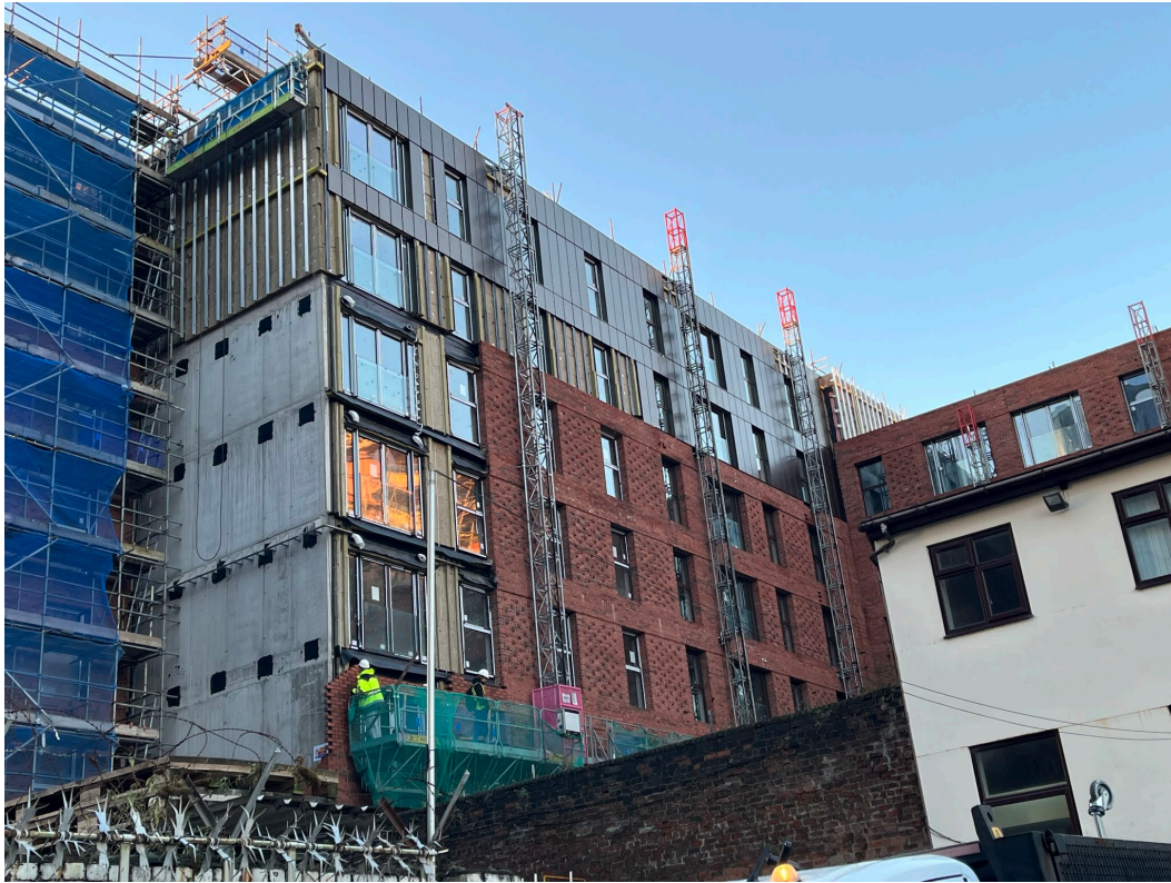
Section B - cladding installation progressing