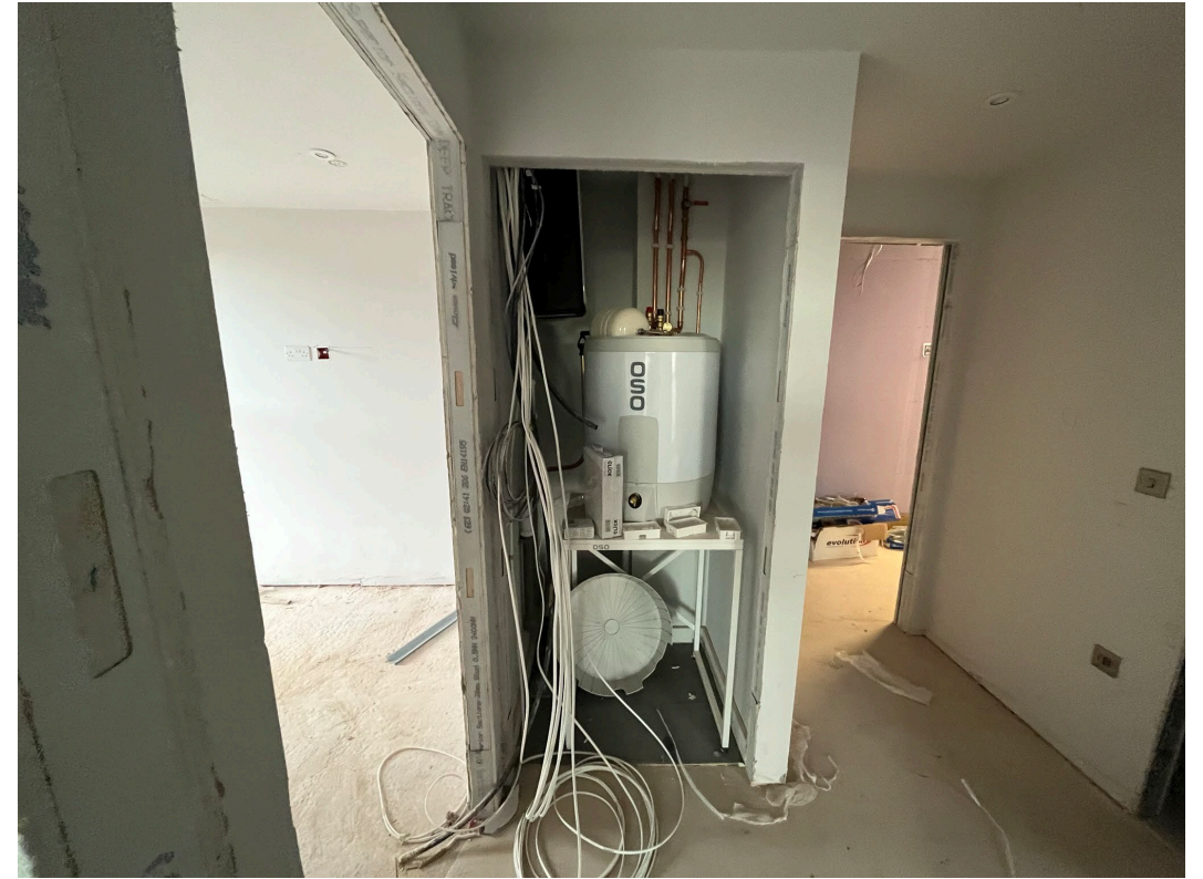
Second fix mechanical ongoing