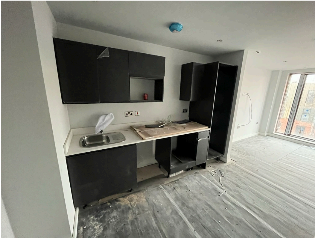
Kitchen installation ongoing