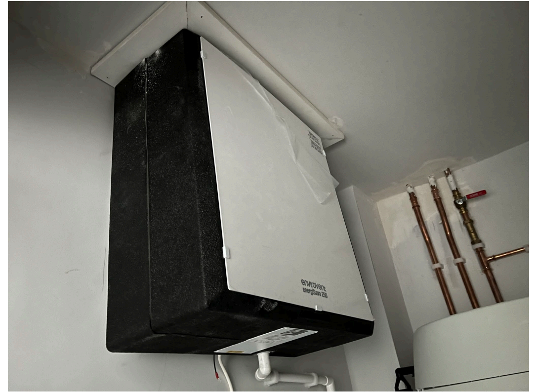
Ventilation system installed