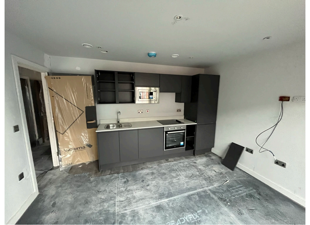
Kitchen installation progressing