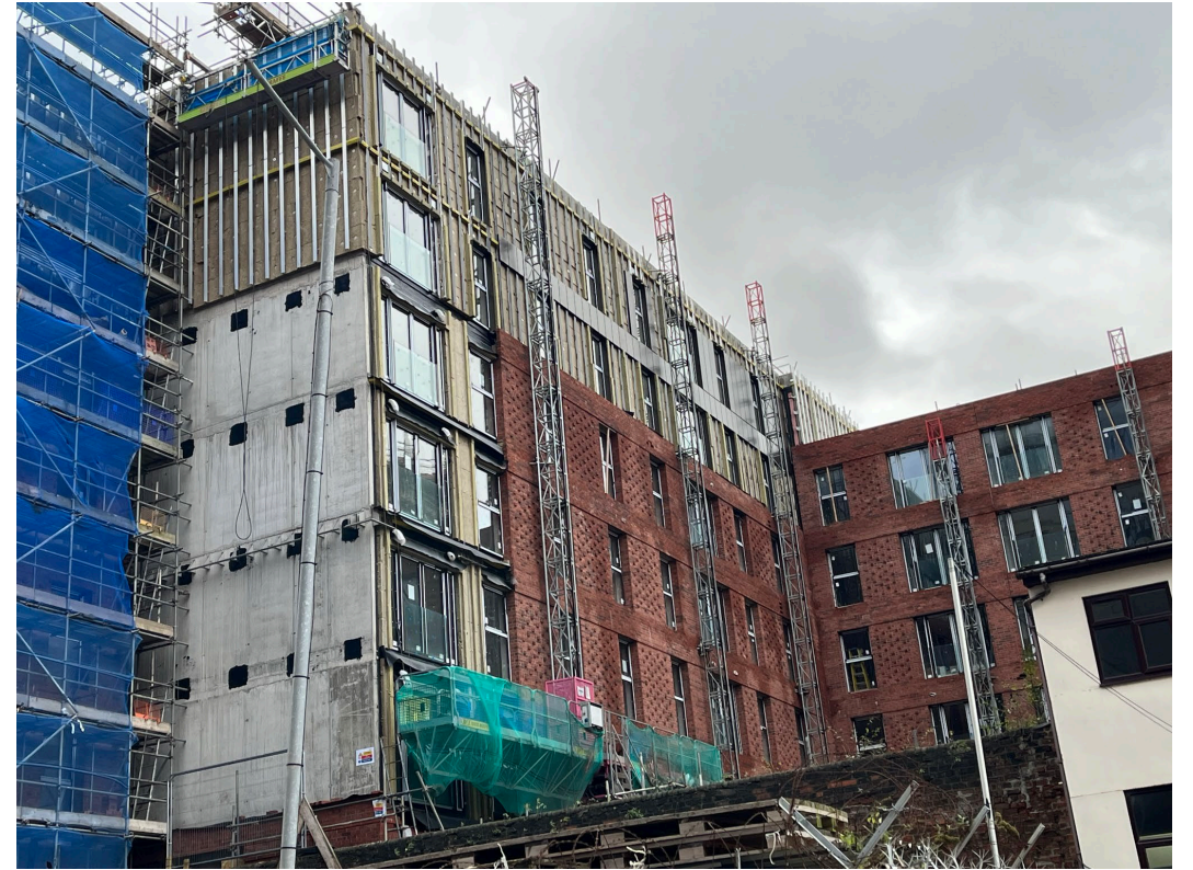
Section B – brickwork and cladding installation progressing