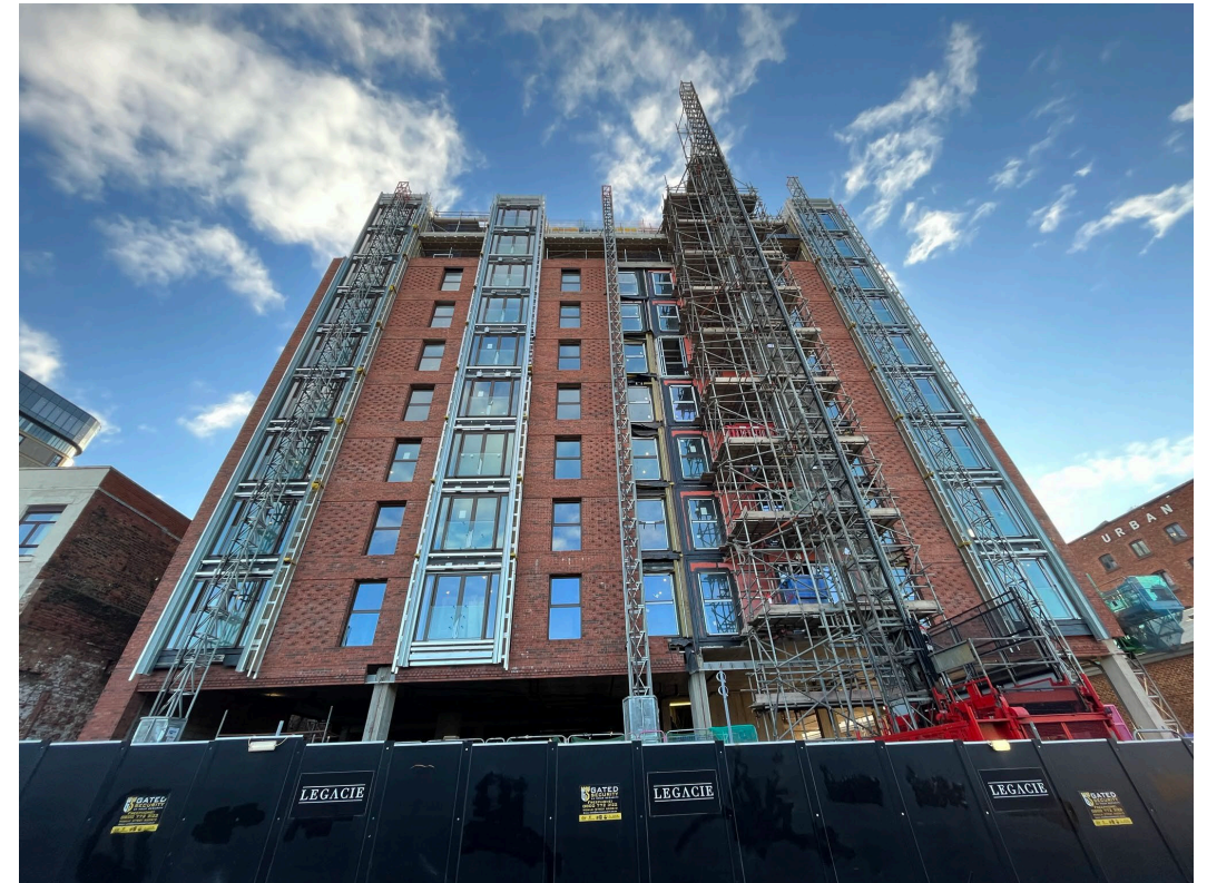
Block D Section A – Viewed from Greenland Street