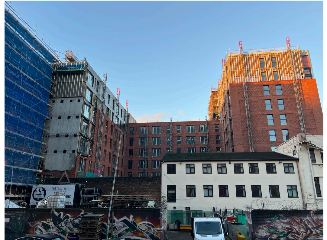
Block D Section A & C – Viewed from Crump Street