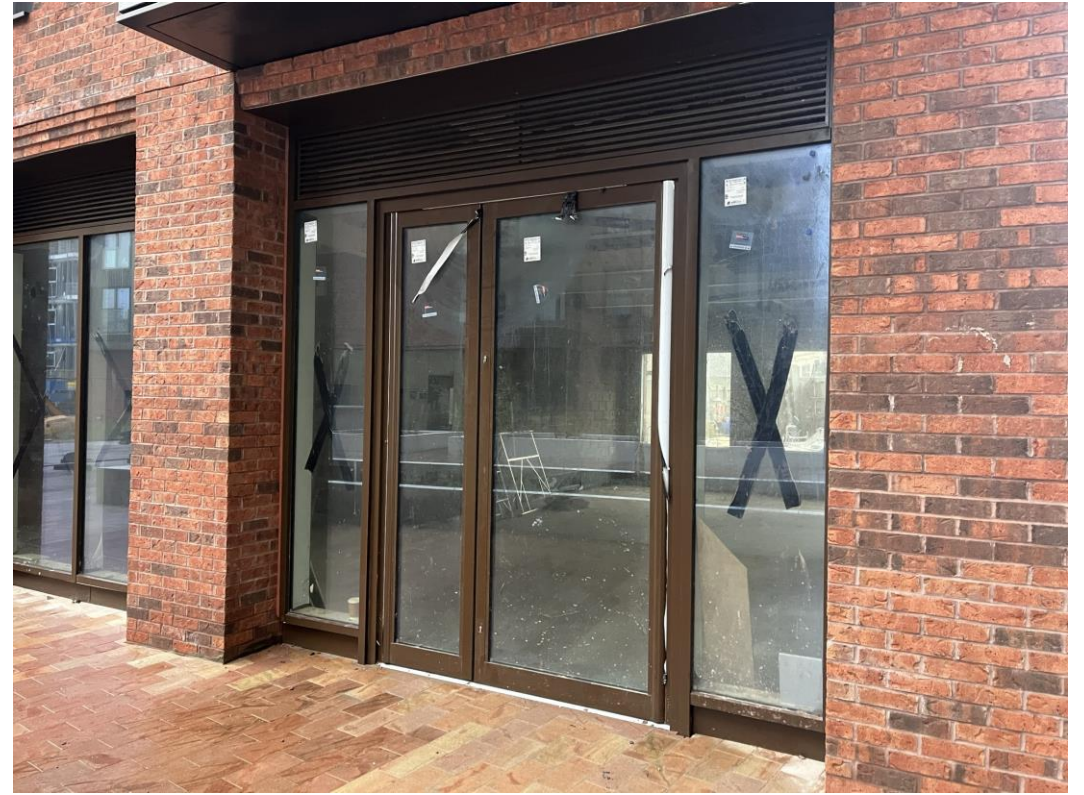
Main entrance door installation complete