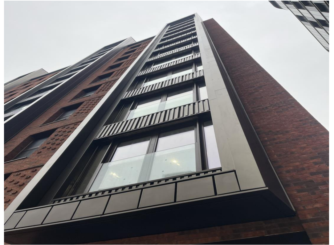
Juliet balustrades installed