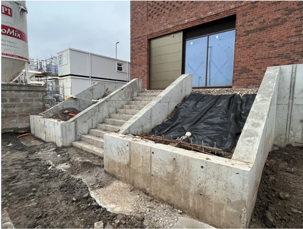
Steps and sloped planters formed