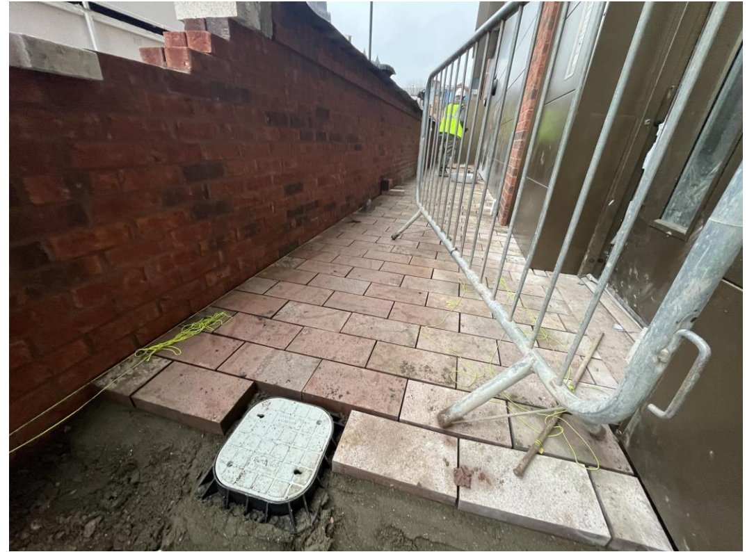
Installation of paving flags ongoing