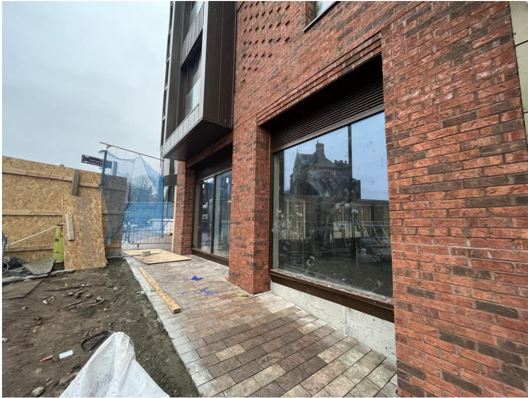
Installation of paving flags ongoing