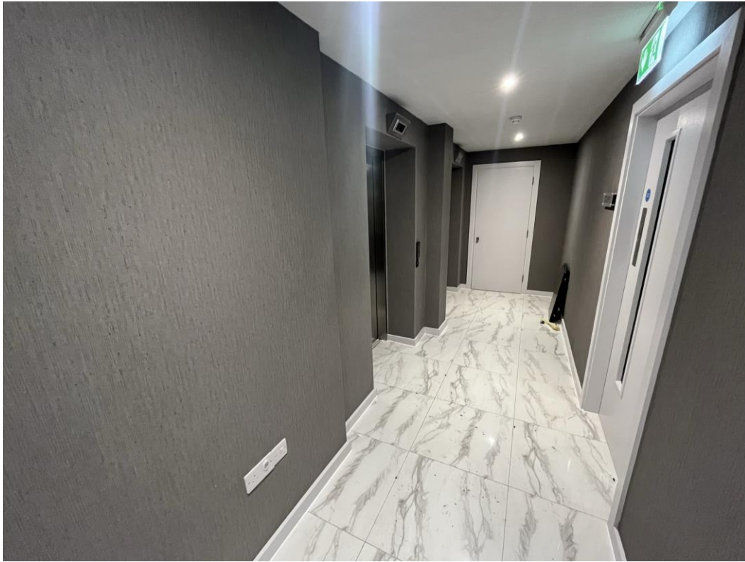
Lift lobby finishes complete