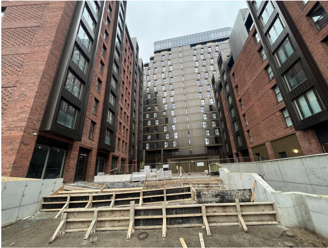
Formwork in place for casting of podium main steps