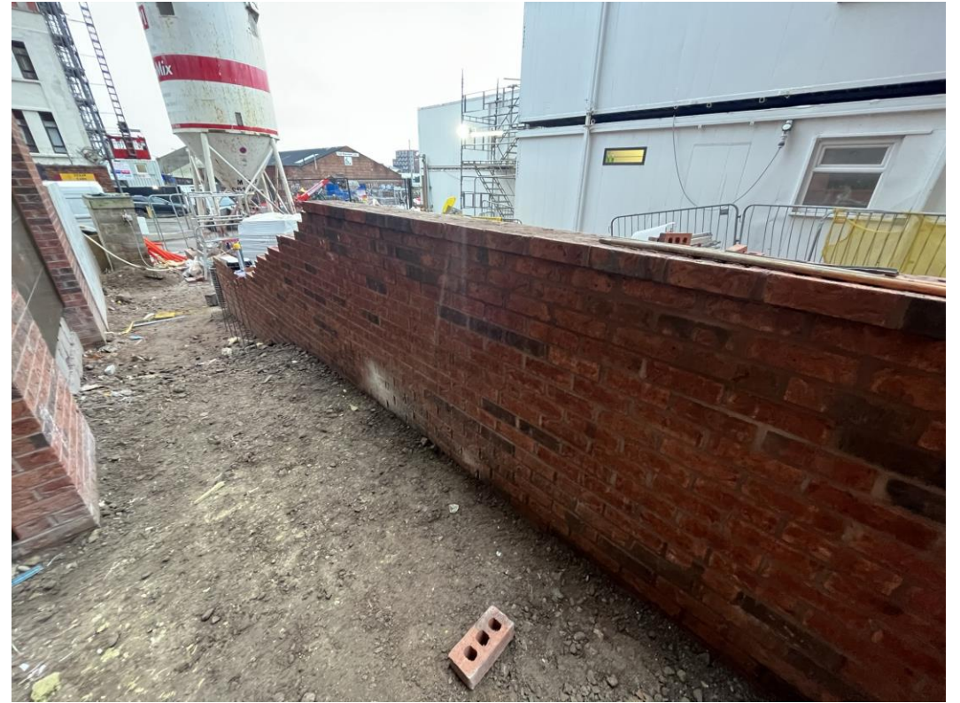
Retaining wall installation ongoing