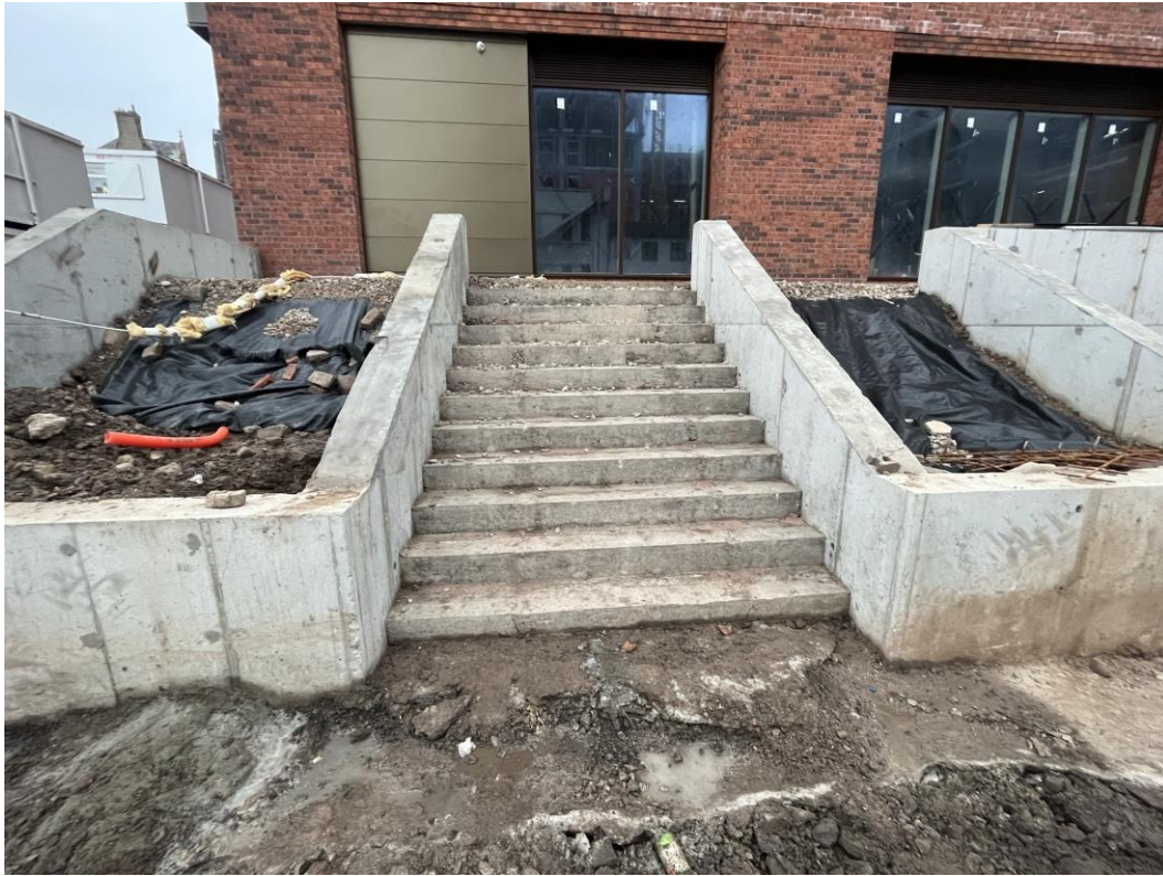
Steps and sloped planters formed