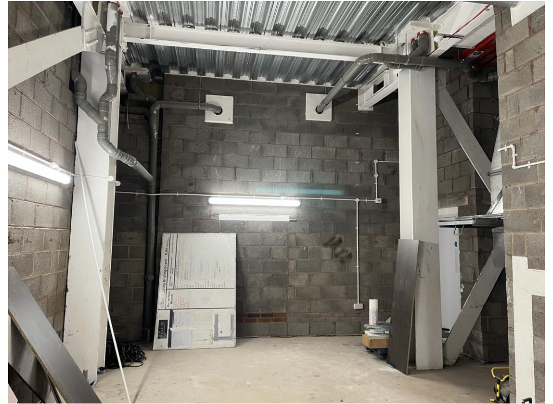
Bin store area