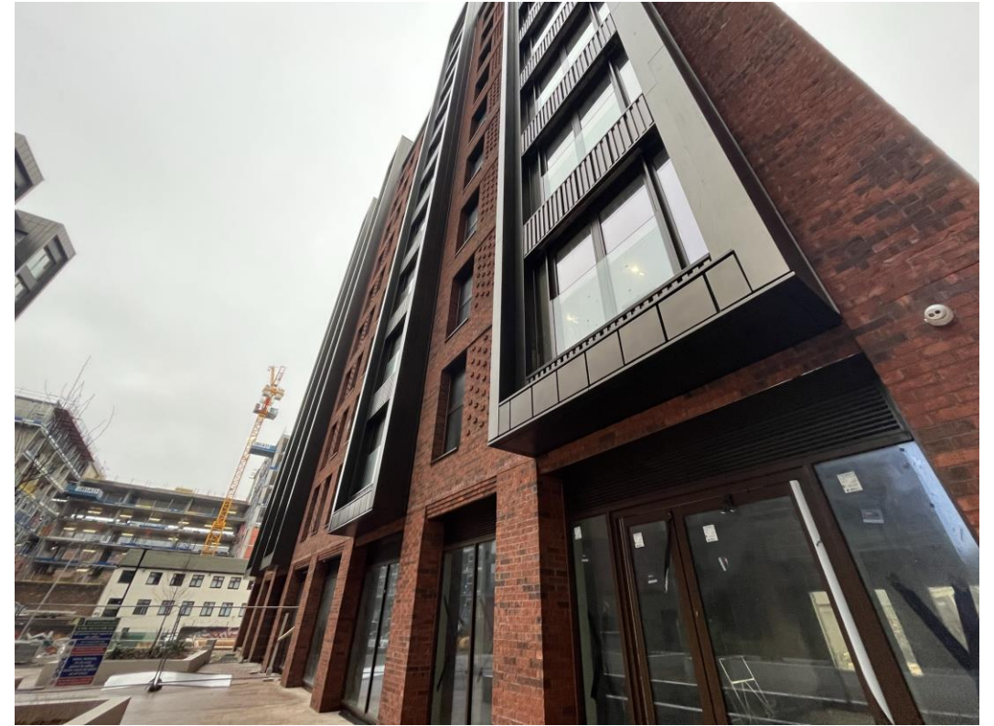
Block B – Viewed from site compound