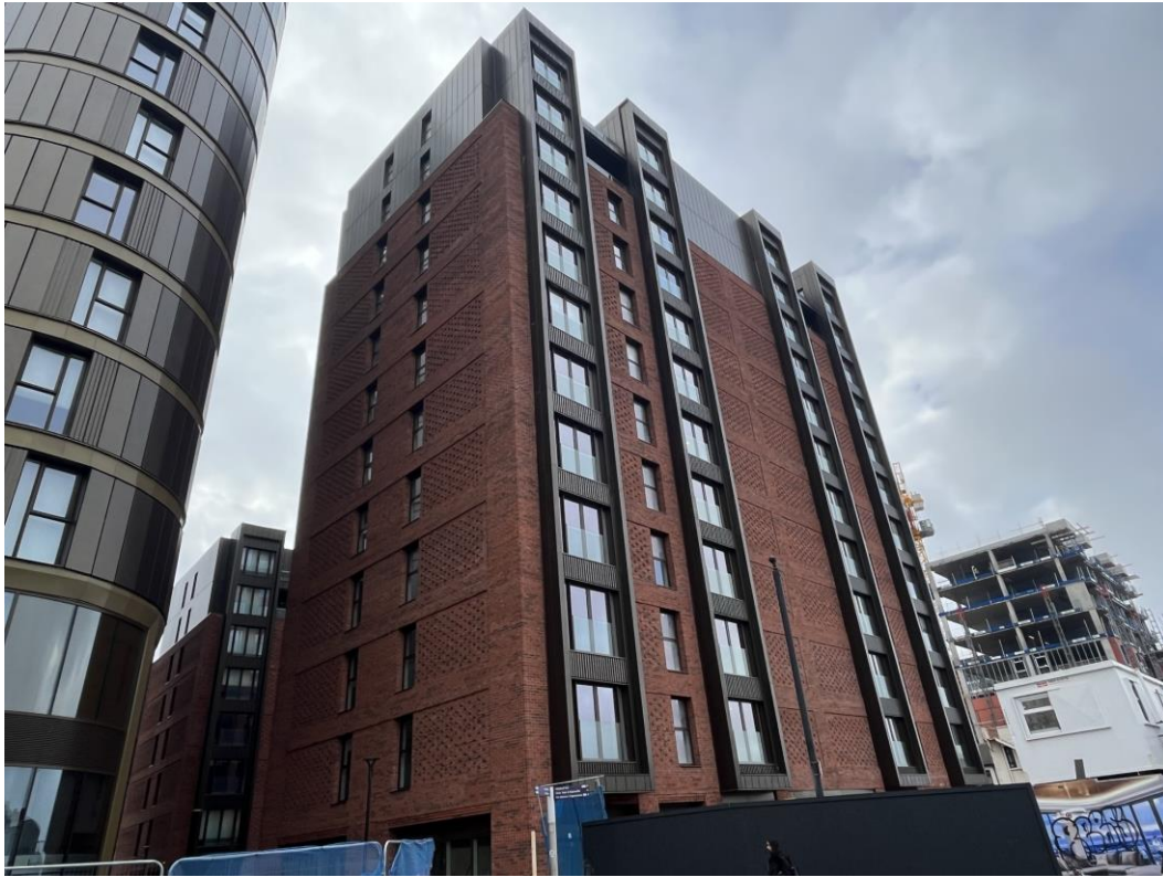
Block B – Viewed from St James Street