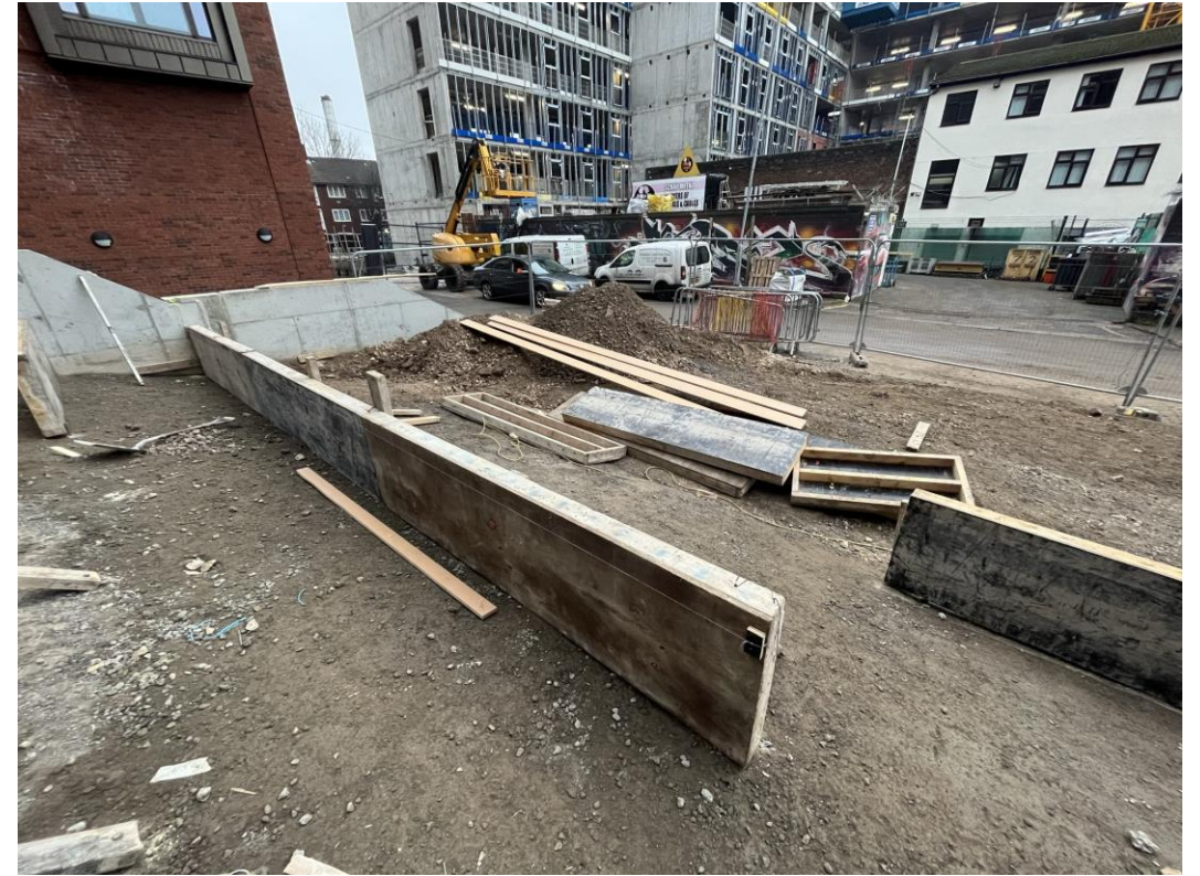
Formwork in place for casting of podium main steps