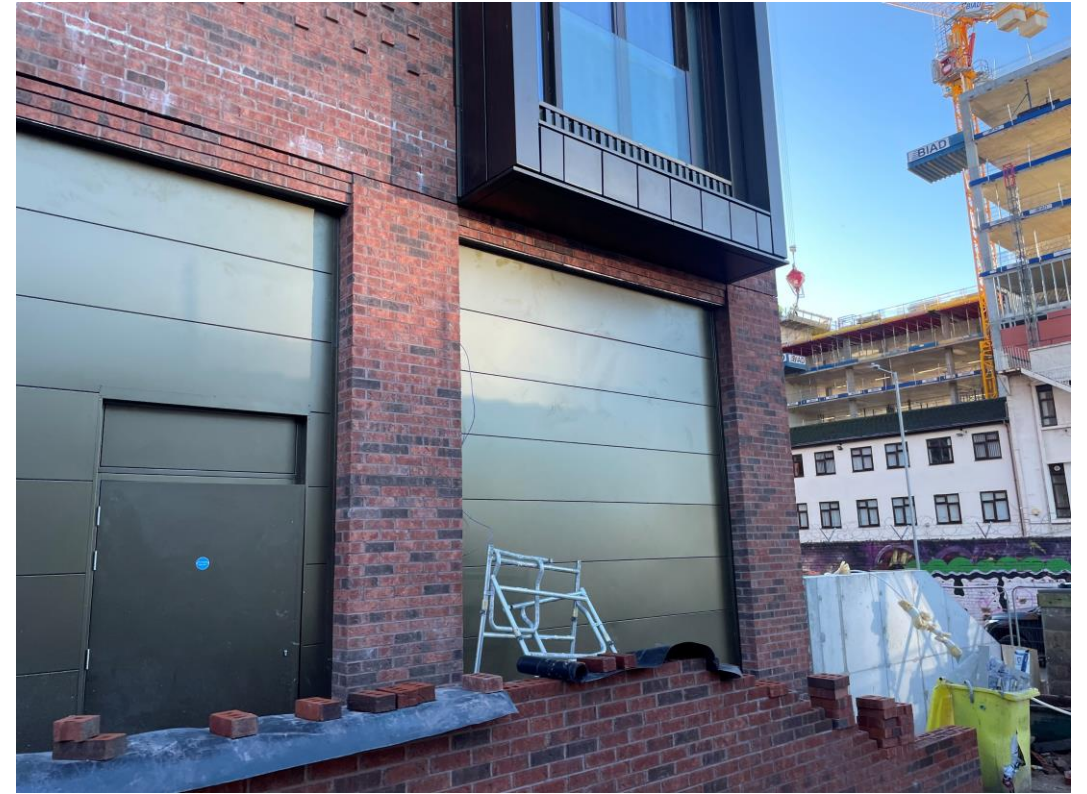
Cladding installation complete