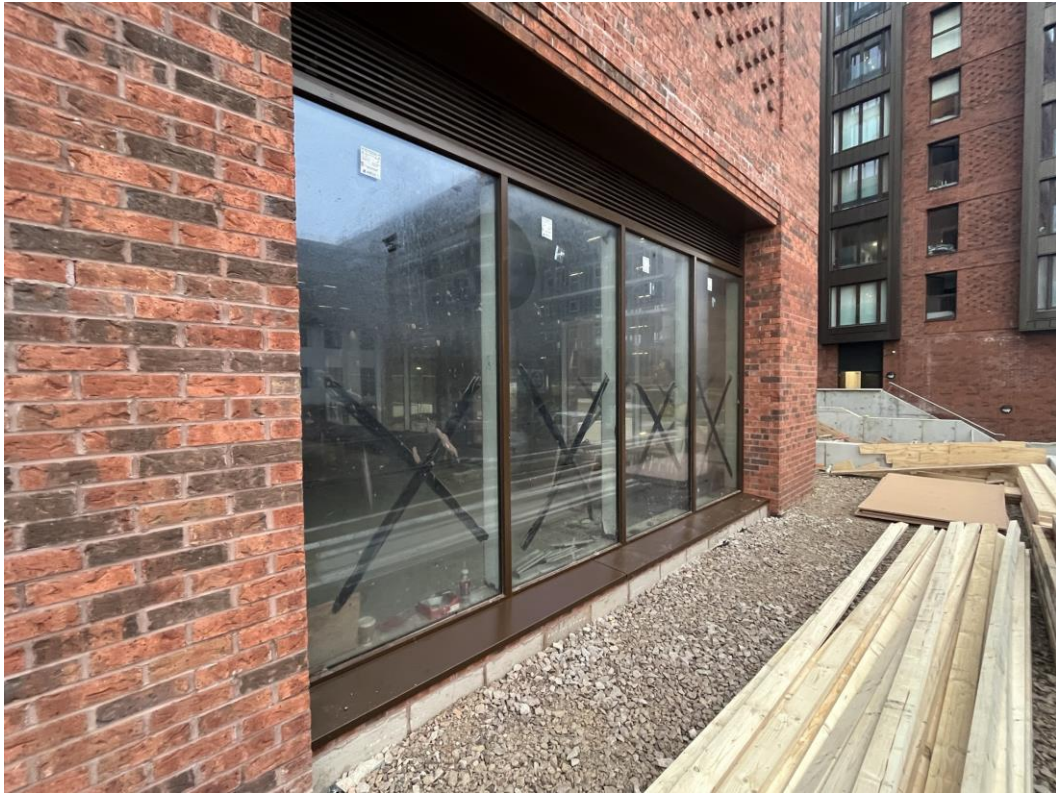
Curtain wall installation complete