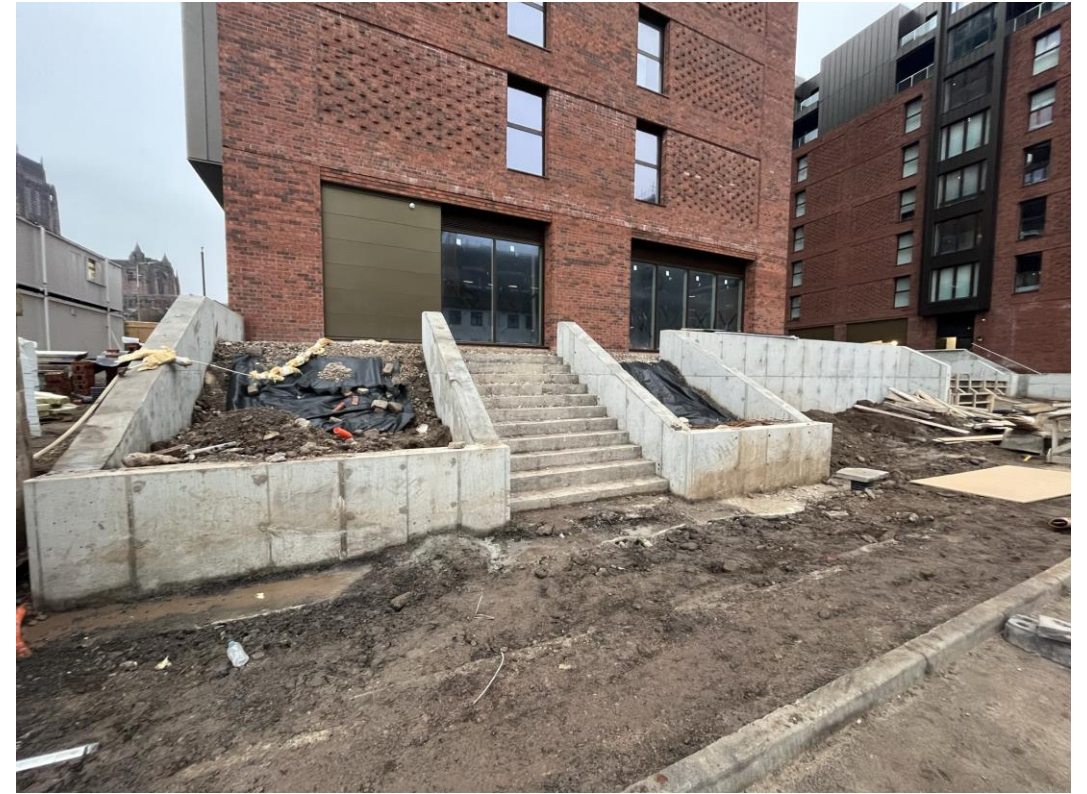
Block B – Viewed from Crump Street