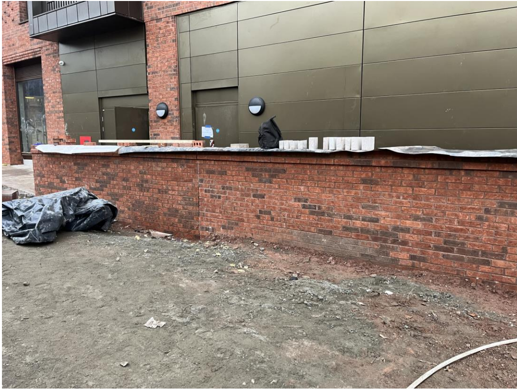
Retaining wall installation ongoing