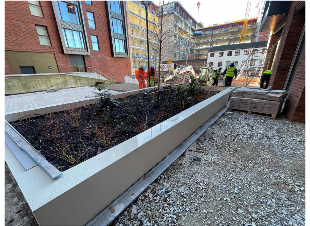
Landscaping works ongoing