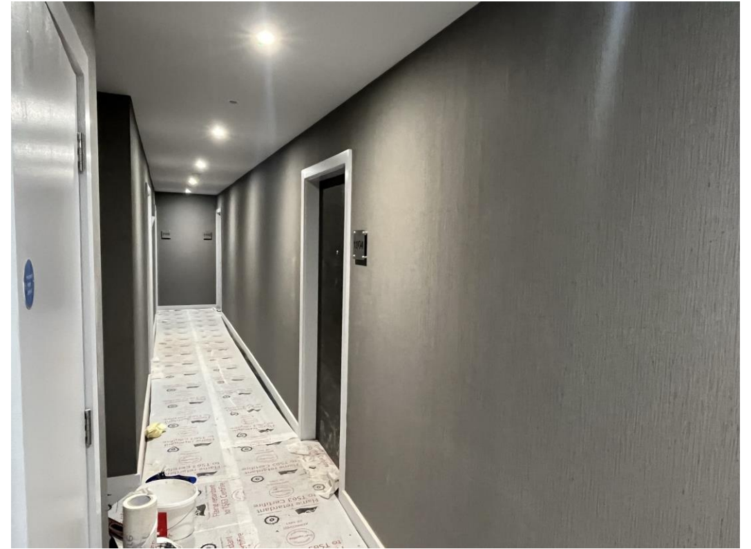
Corridor nearing completion