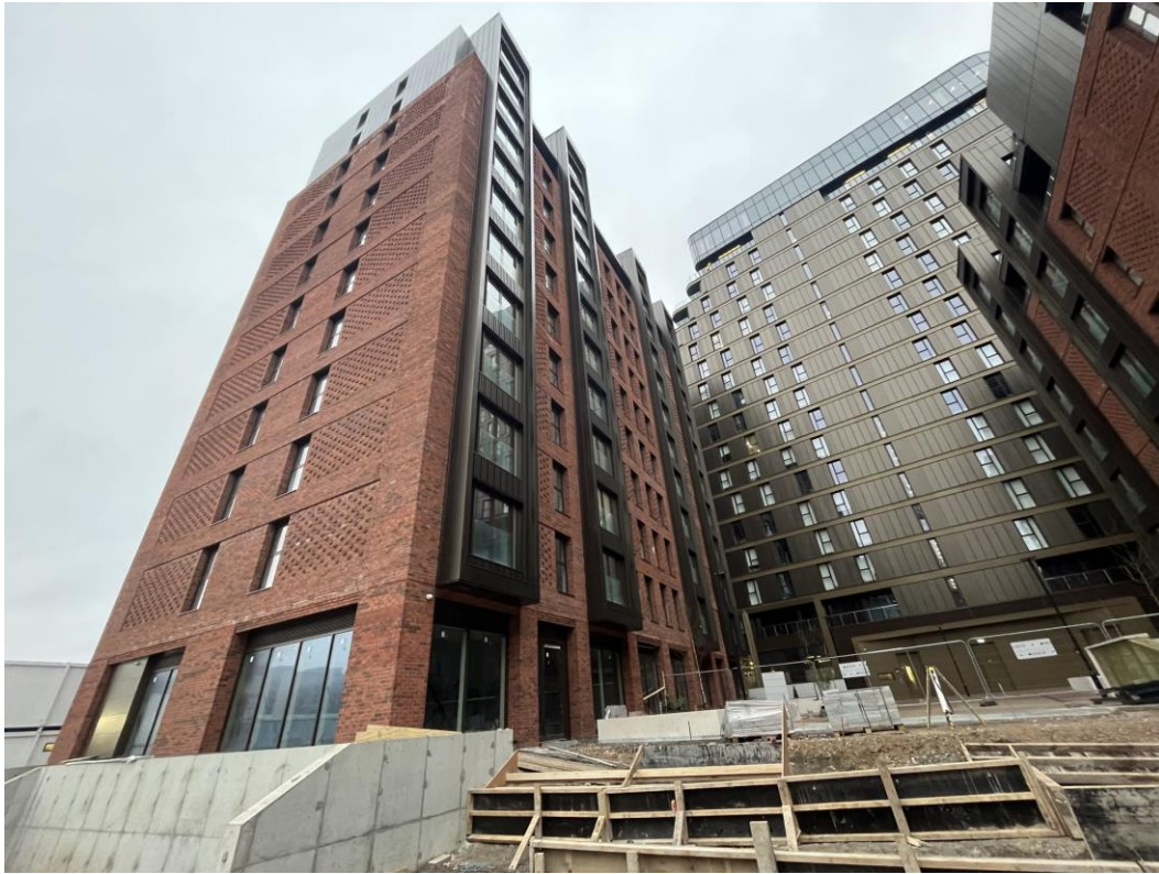
Block B – Viewed from Crump Street