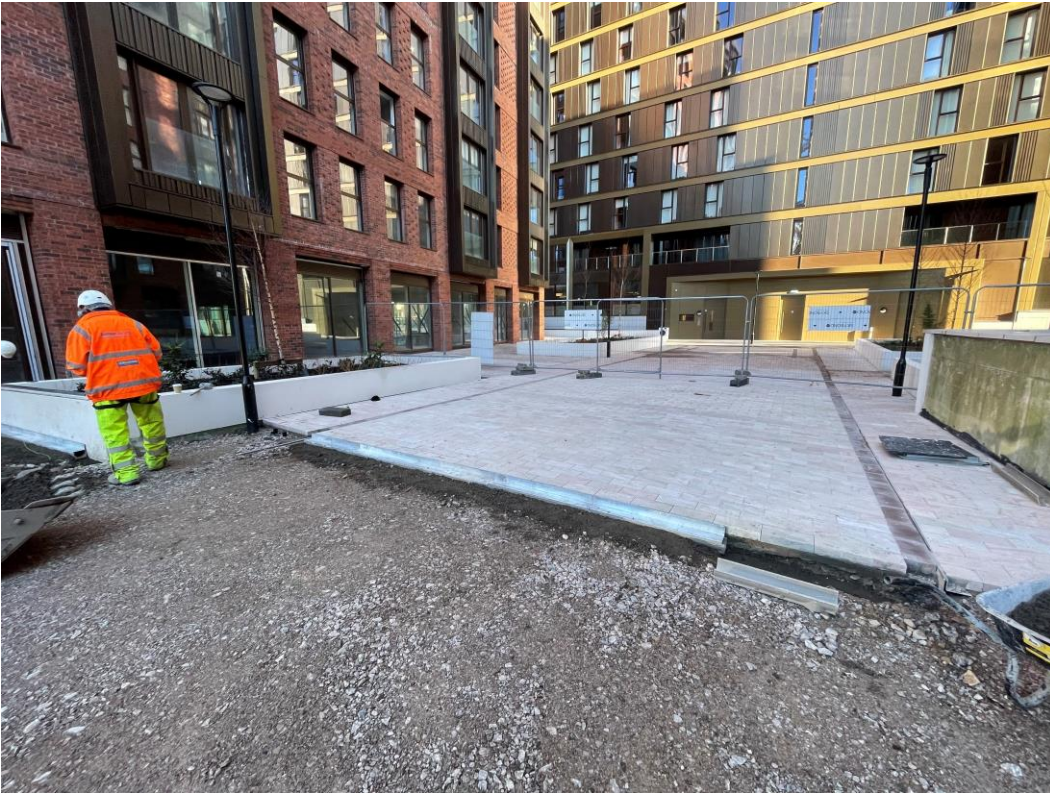
Installation of paving flags ongoing