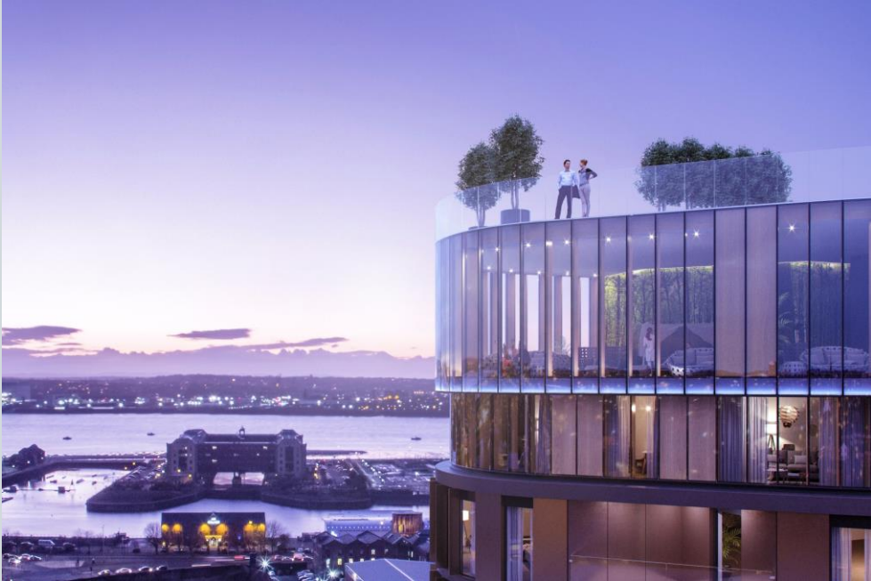
Land at corner of Upper Parliament Street & Great St George Street, Liverpool L1