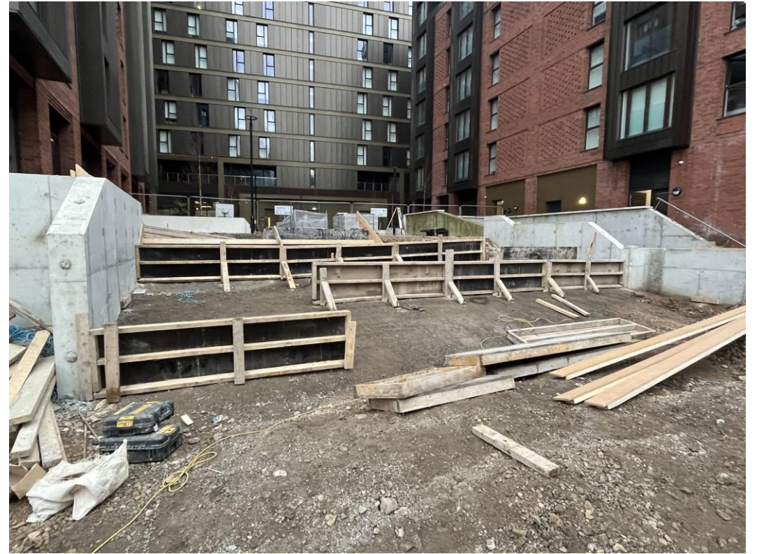
Formwork in place for casting of podium main steps