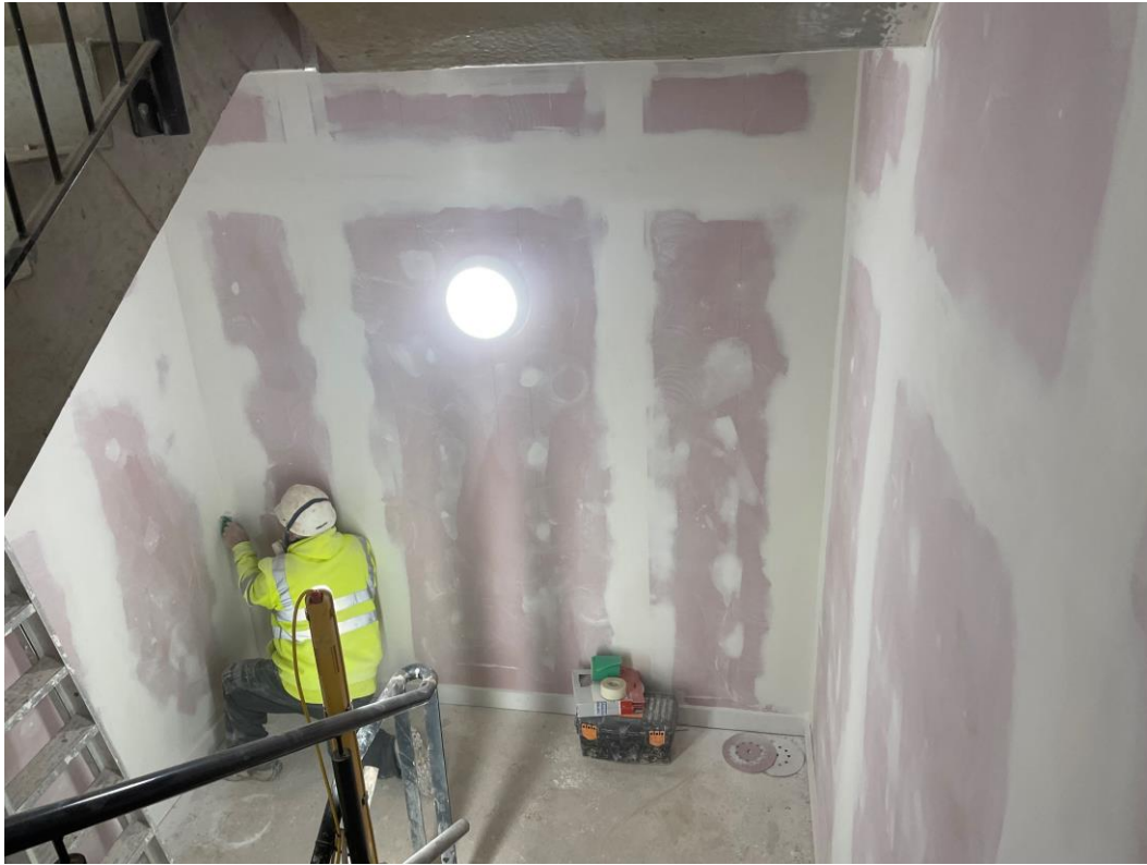
Stairwell decoration works ongoing