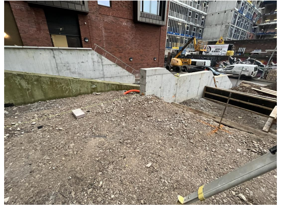
Casting of retaining wall complete