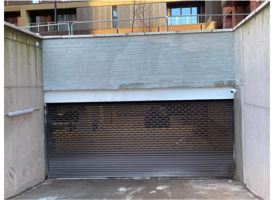
Rendering works ongoing