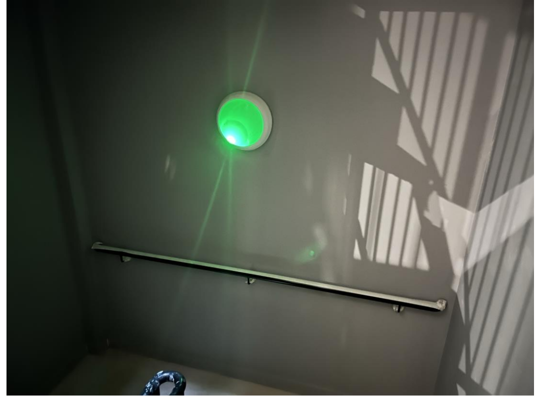
Stairwell decoration works ongoing