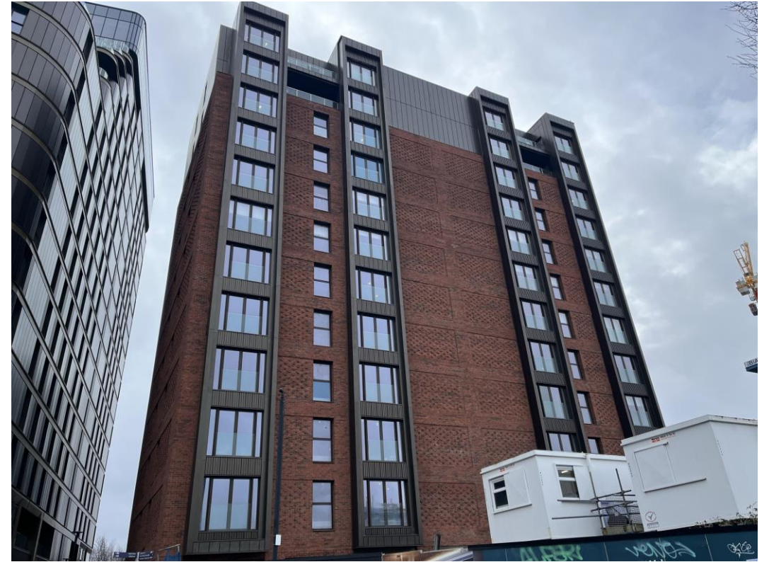
Block B – Viewed from St James Street