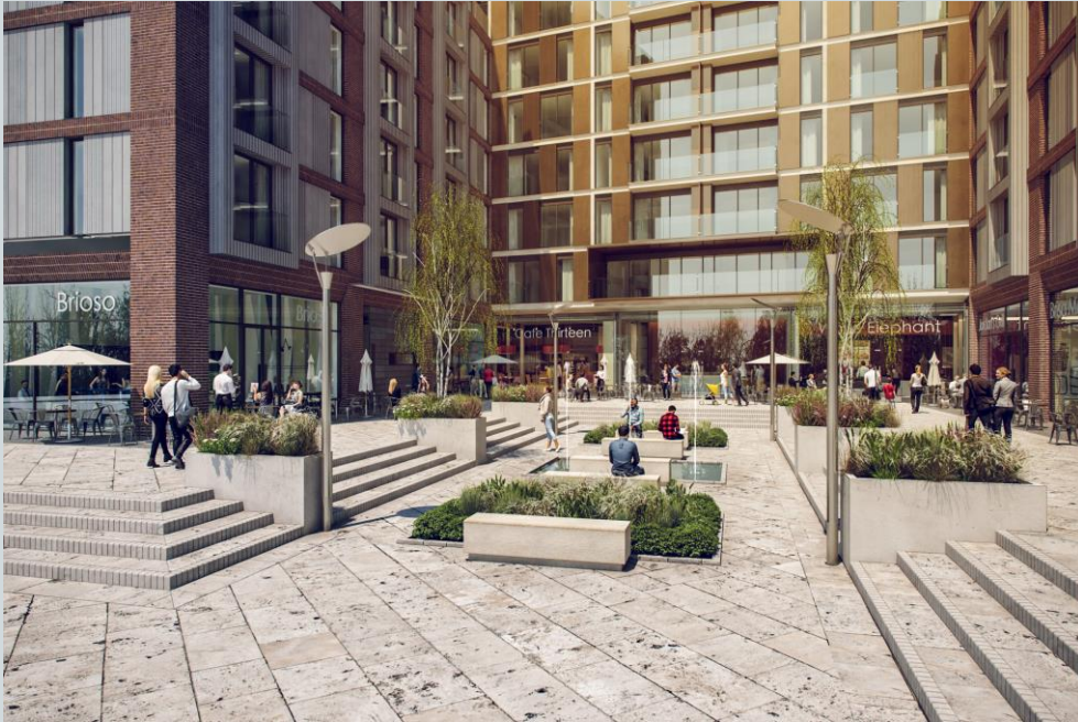
Land at corner of Upper Parliament Street & Great St George Street, Liverpool L1