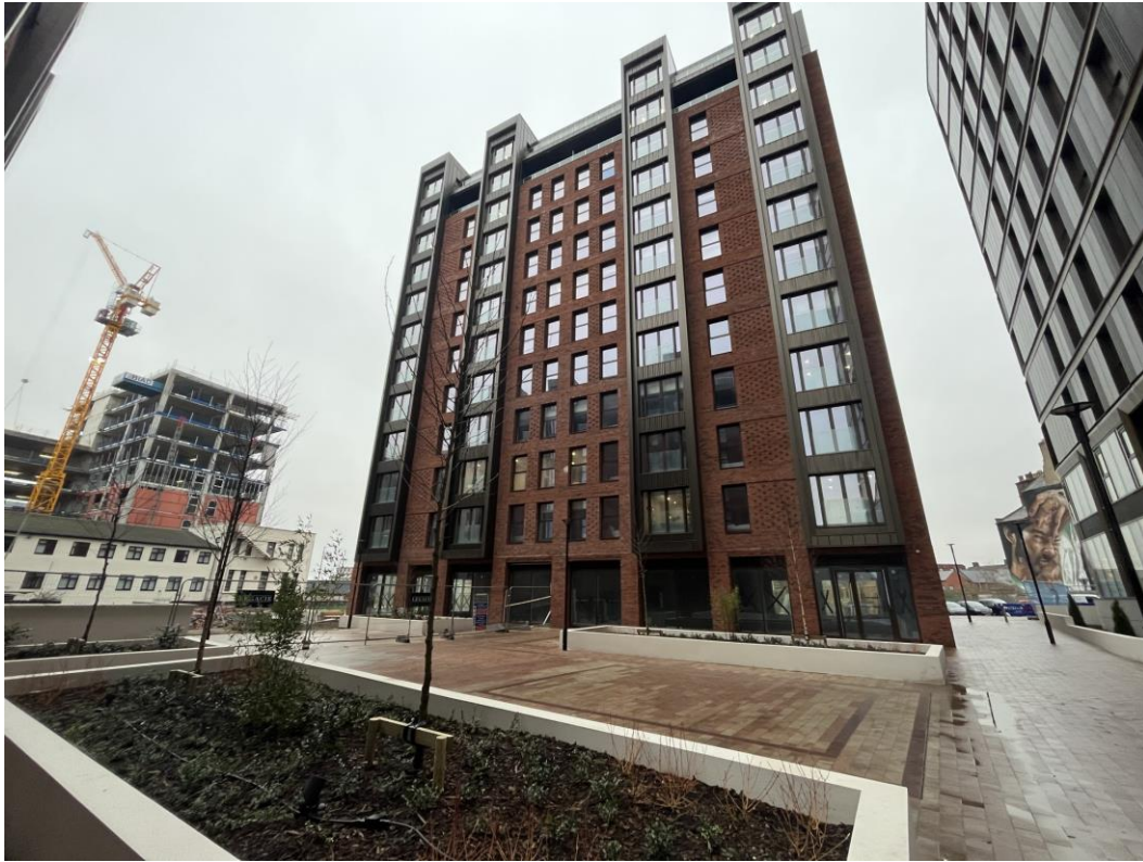
Block B – Viewed from site compound