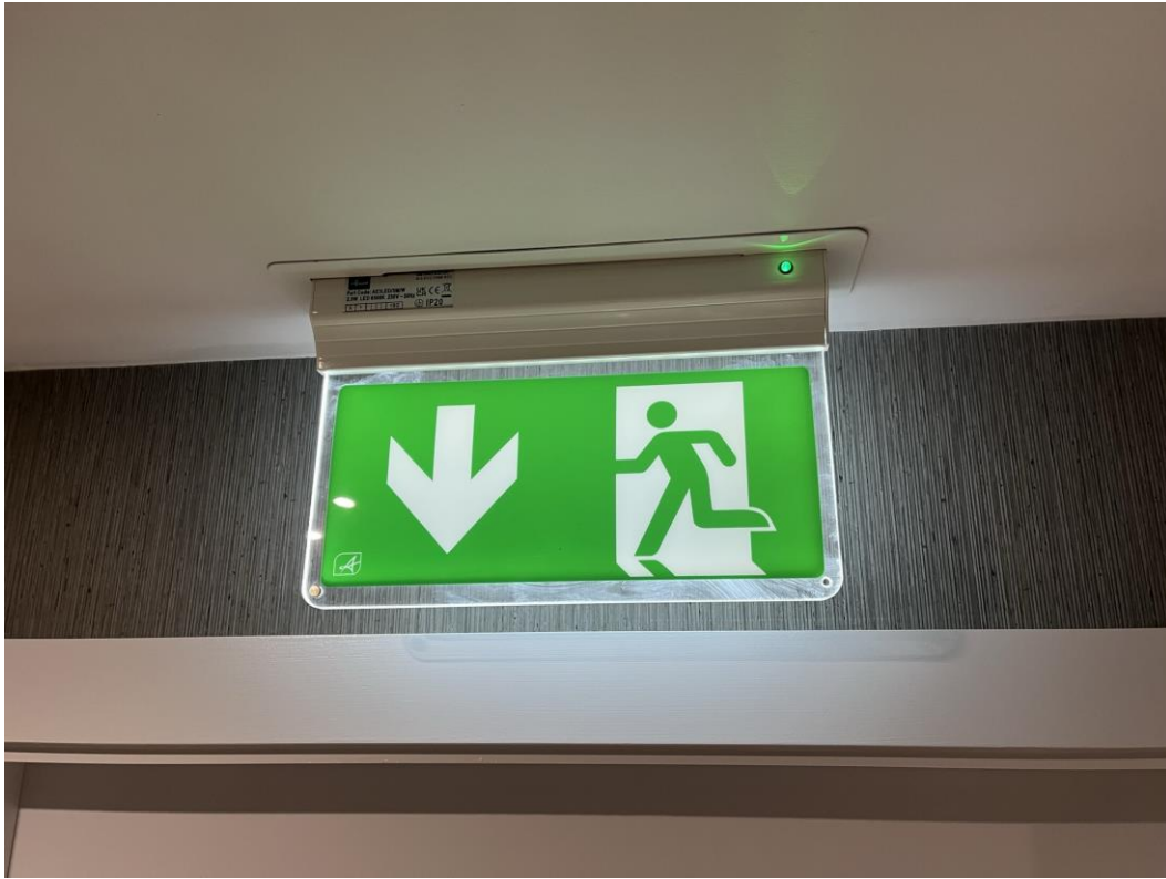
Fire exit signage installed