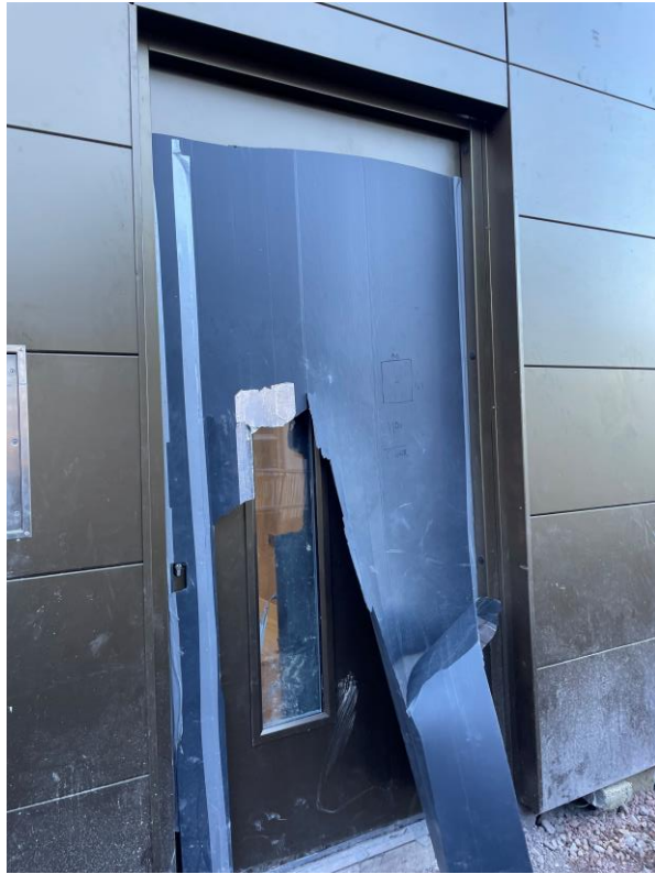
Main entrance doors installed