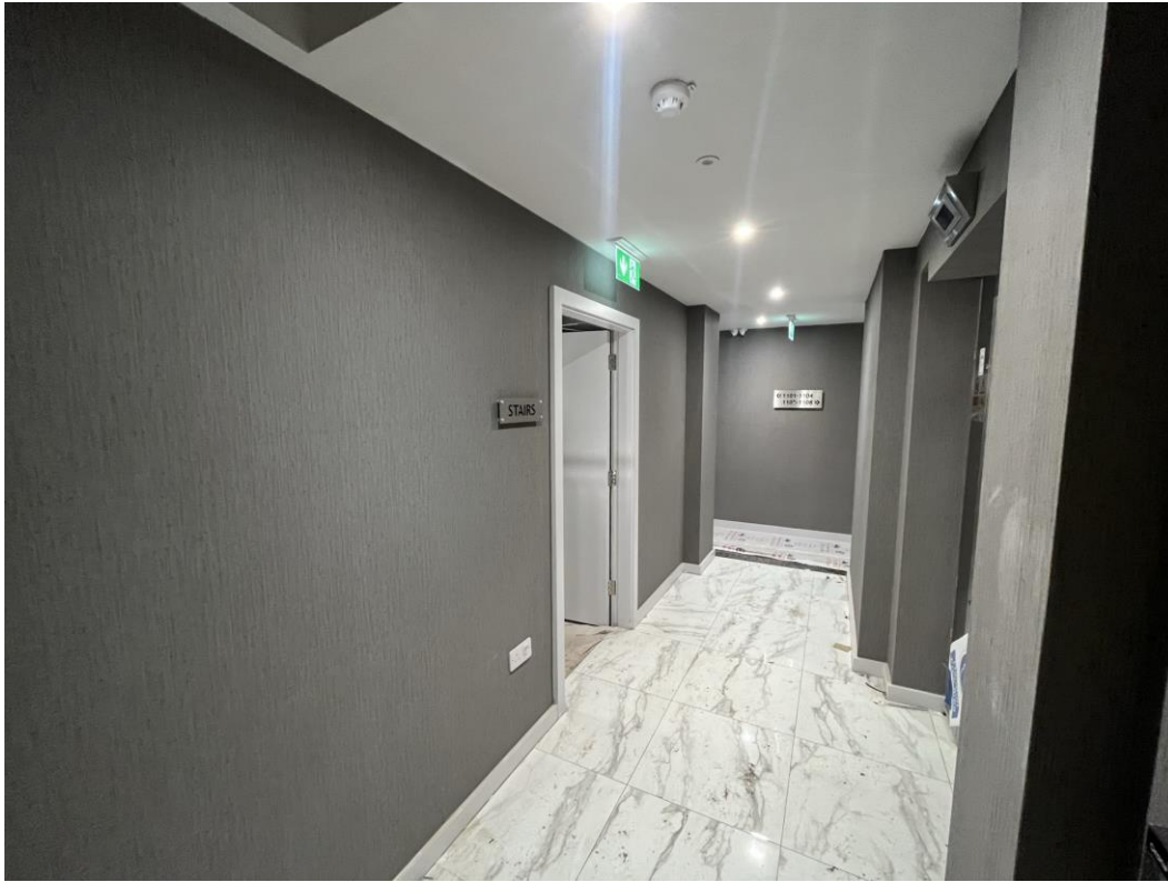
Lift lobby finishes complete