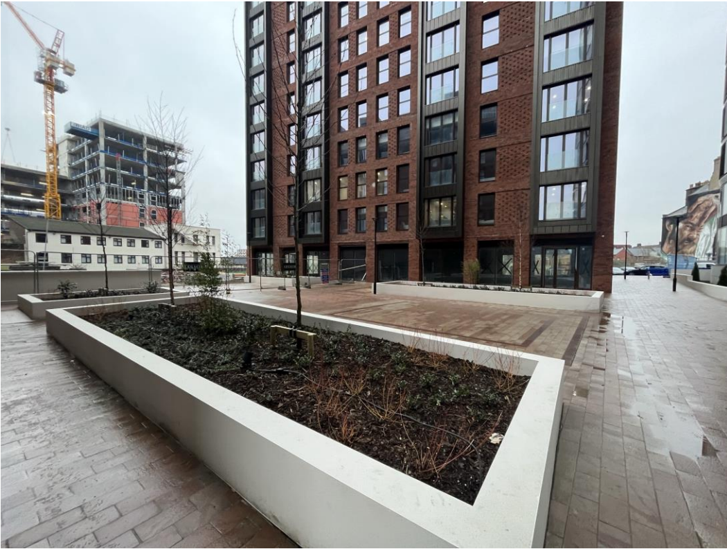
Block B – Viewed from site compound