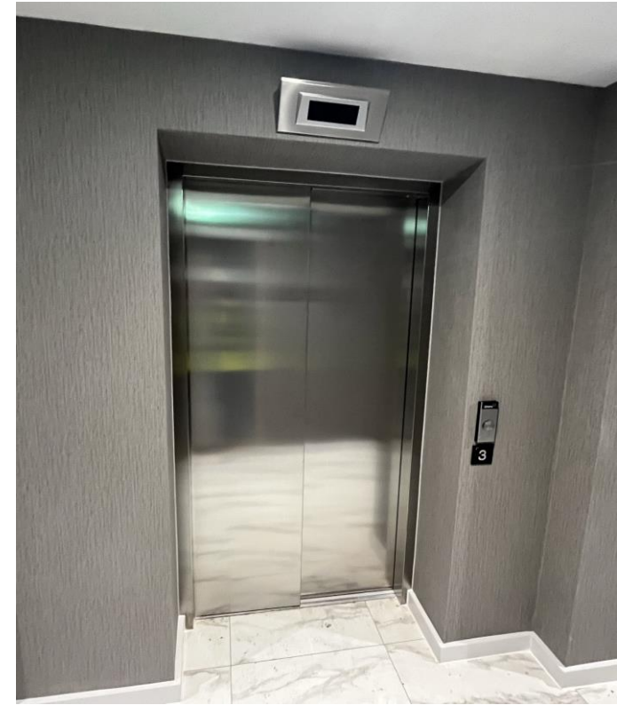
Lift finishes complete