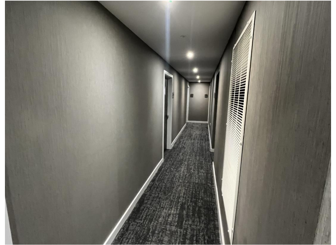
Corridor finishes complete