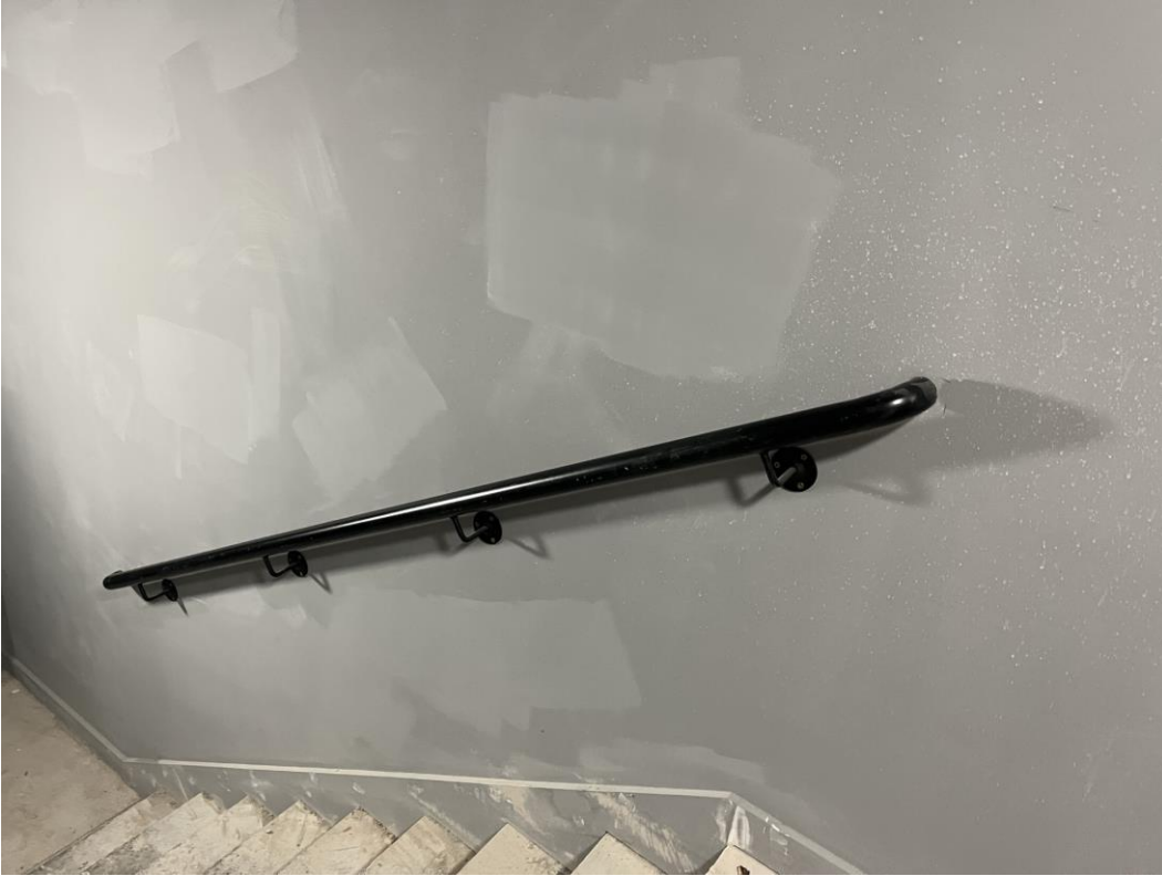
Stairwell decoration works ongoing