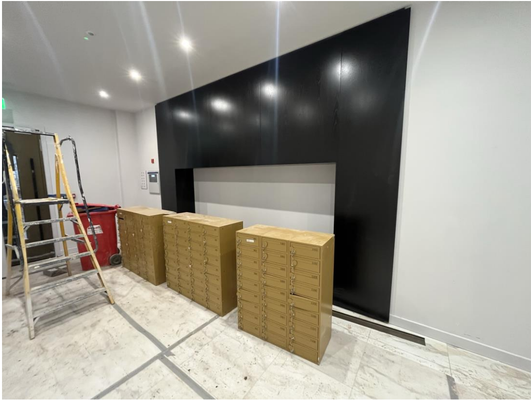
Apartment letter boxes