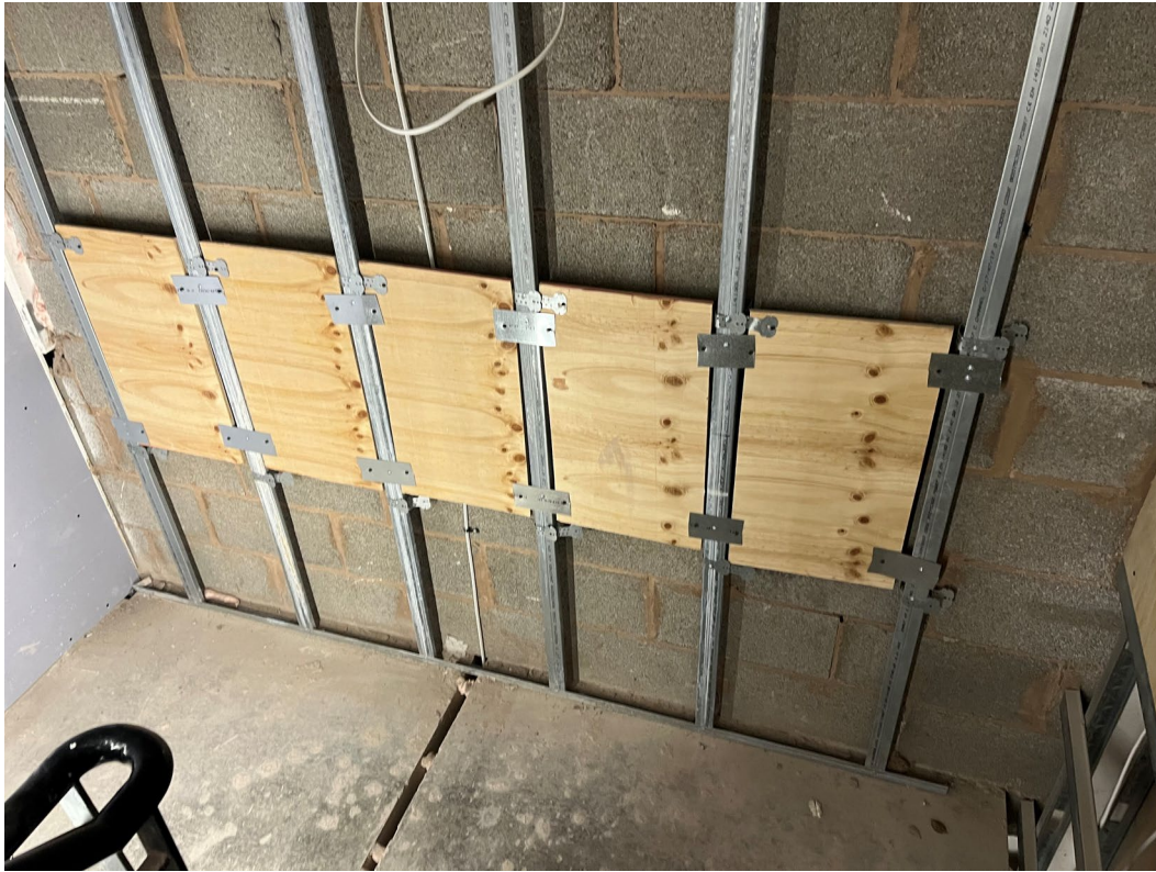
Staircase pattrass installed