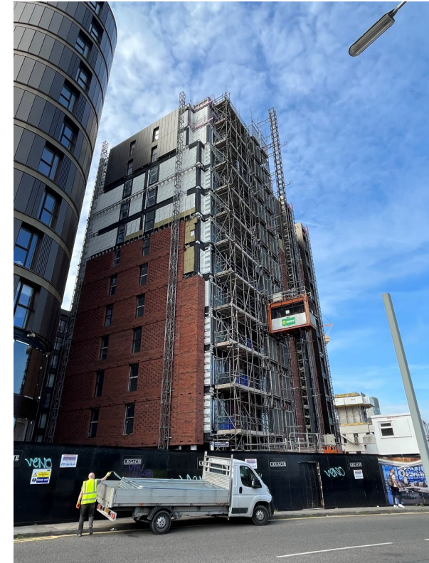
Block B – Viewed from Great George Street