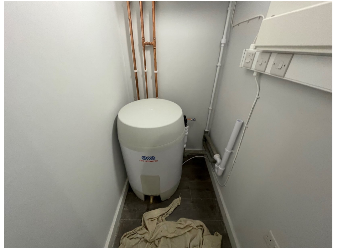
Water cylinder installed