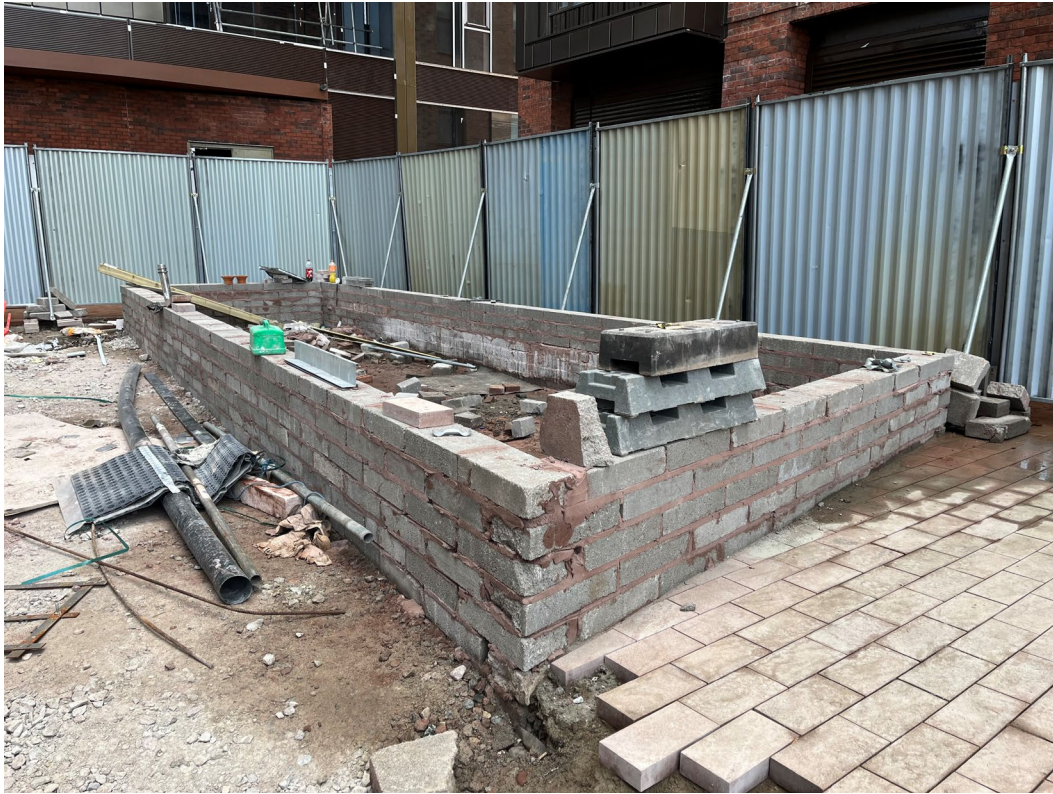
Planter installation ongoing