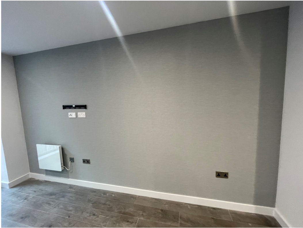
Wall coverings installed