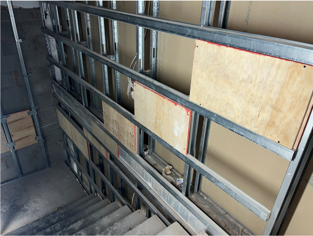
Staircase pattress installed