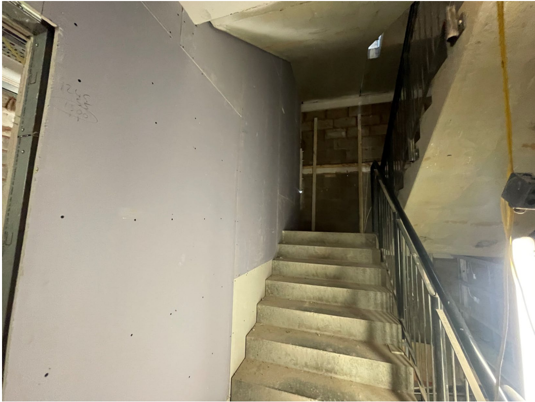
Staircase partitions installed