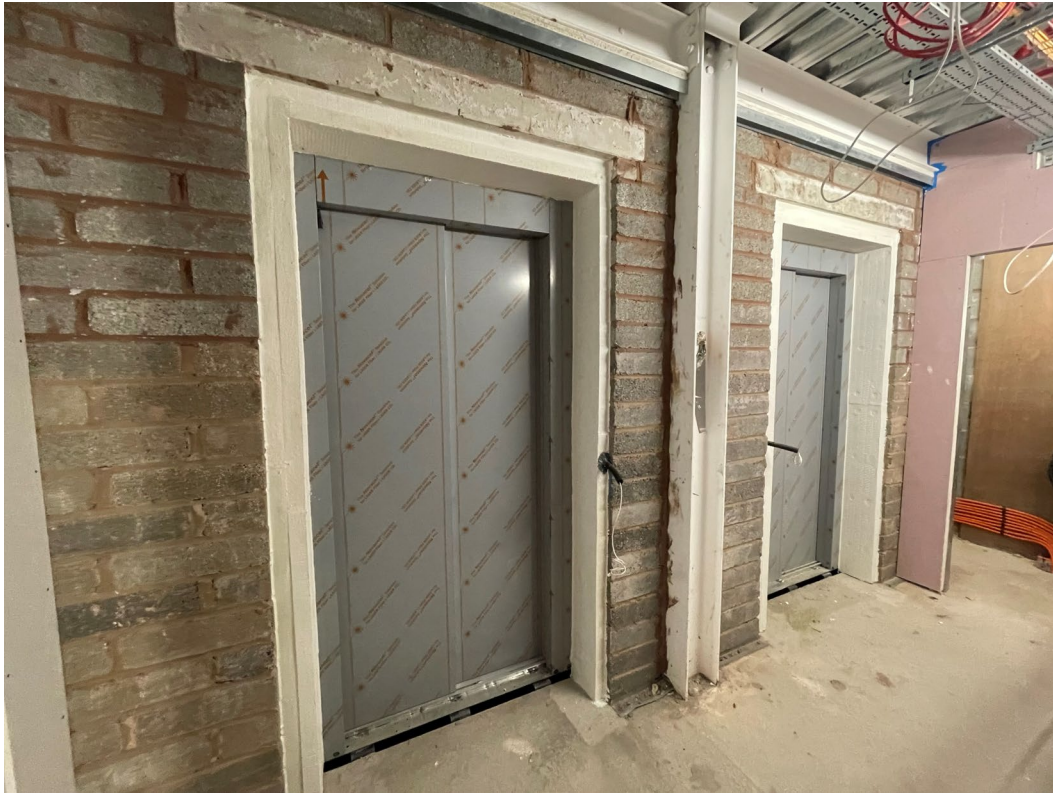
Lift installation complete