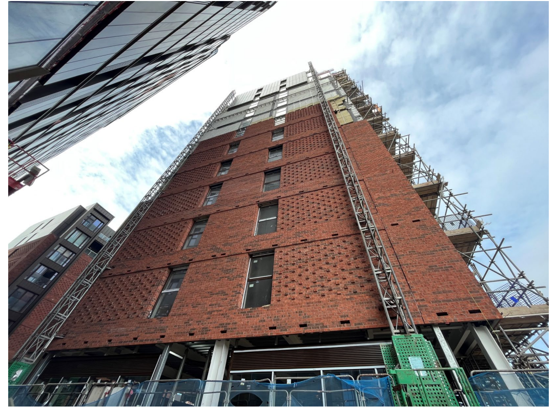
Block B – Viewed from Block C