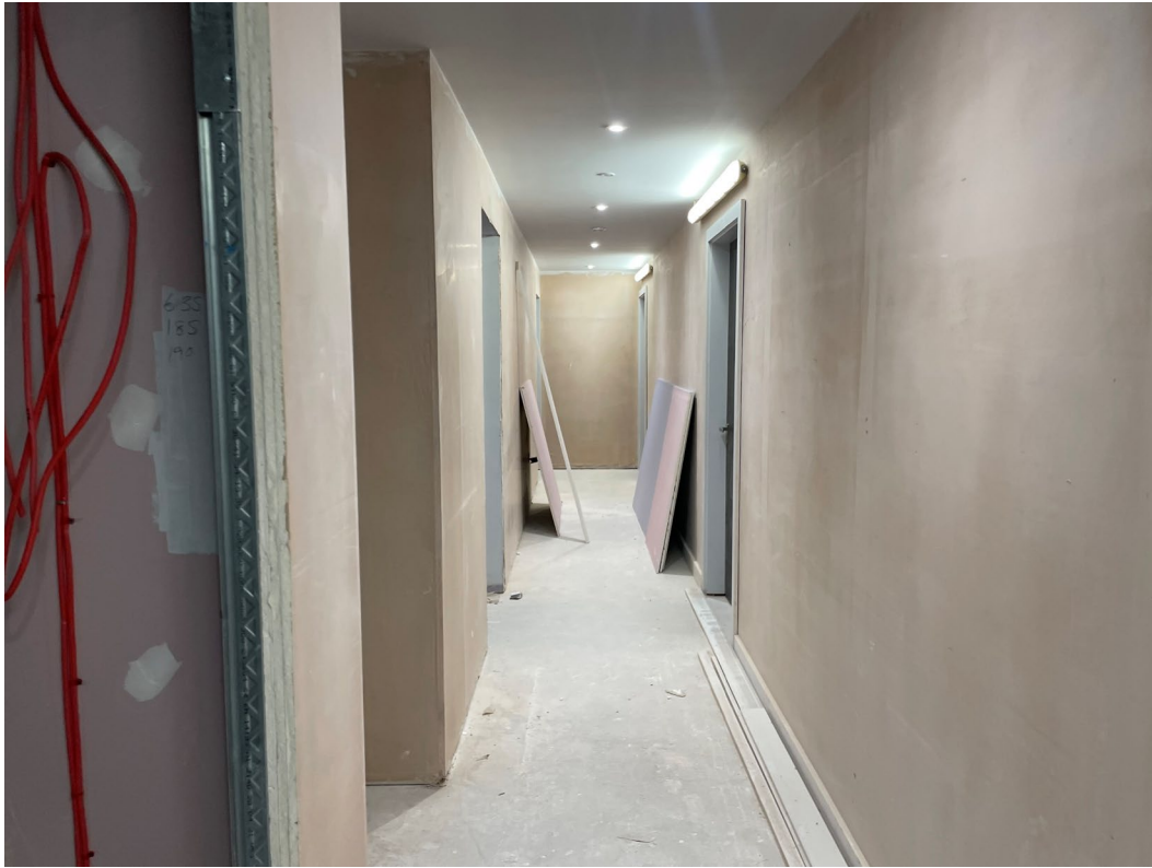
Circulation areas plastered