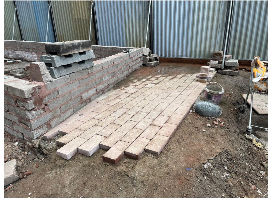
Podium build-up installation