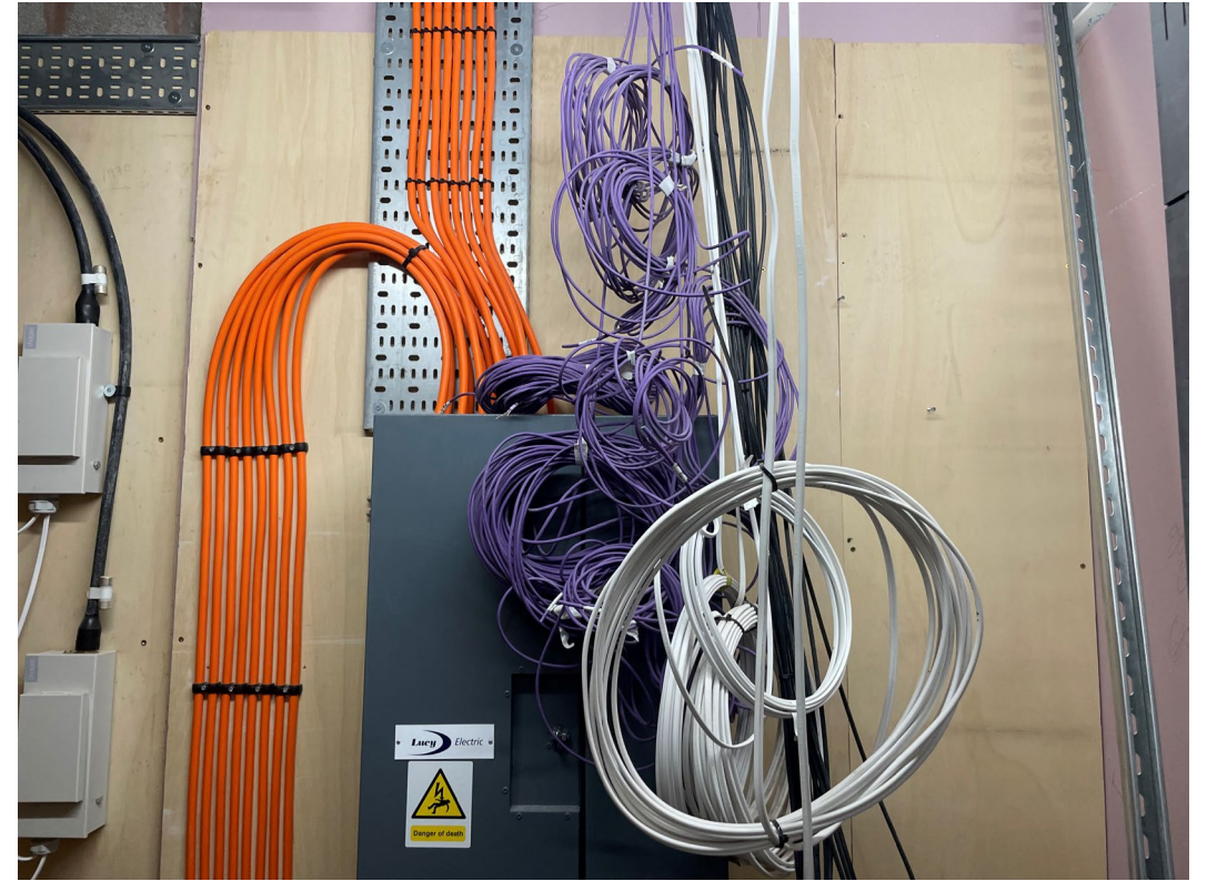
Electrical distribution board installed