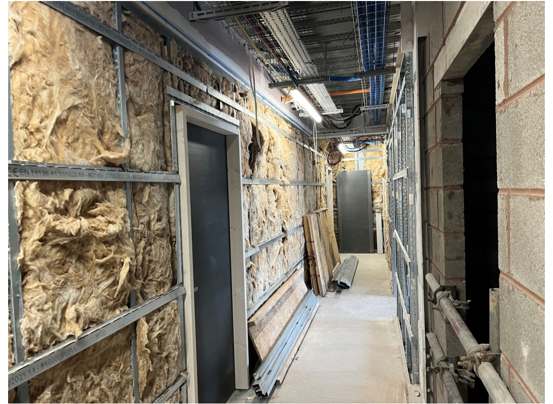
Partition insulation installed