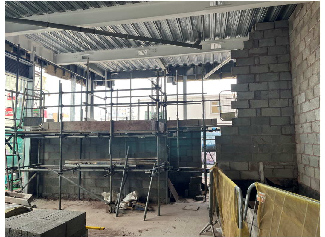
Staircase masonry wall installation ongoing