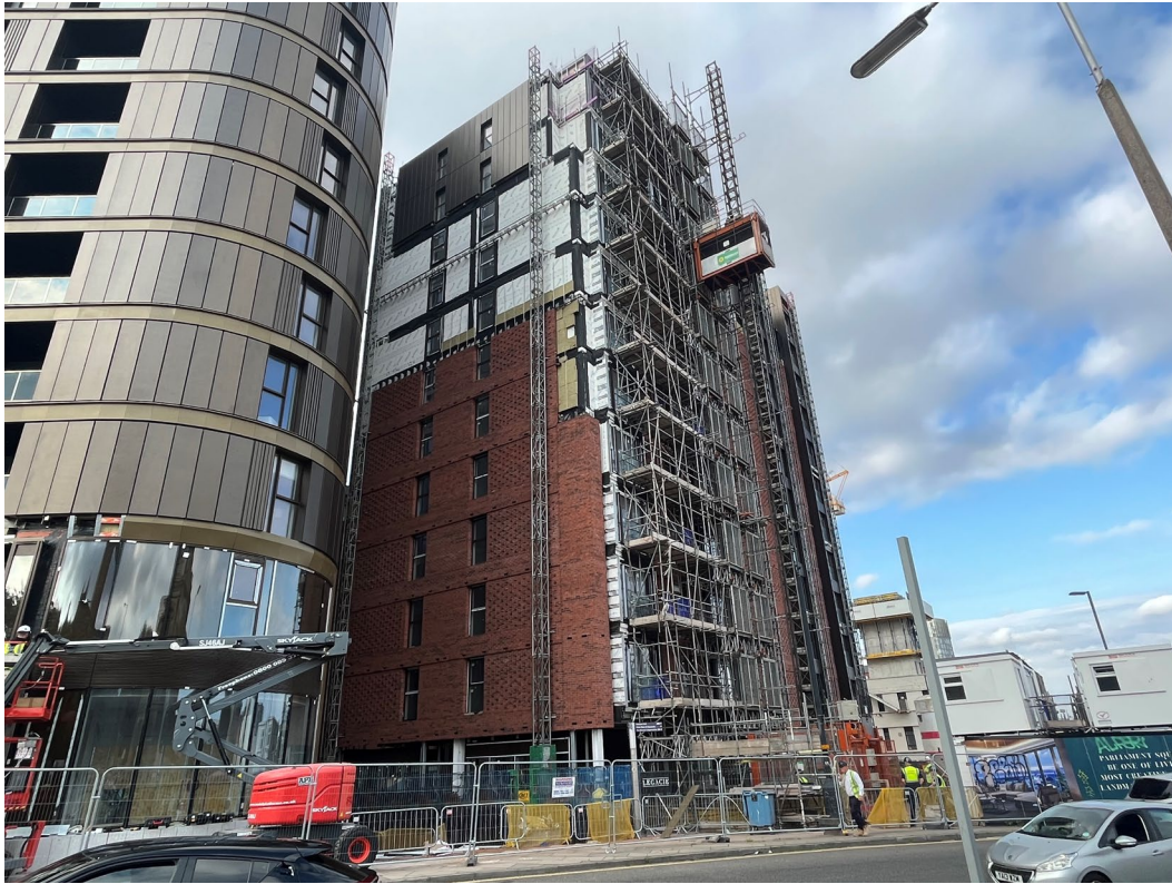
Block B – Viewed from Great George Street