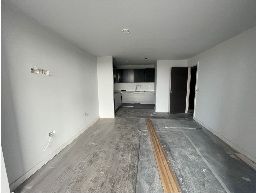
Laminate flooring installed