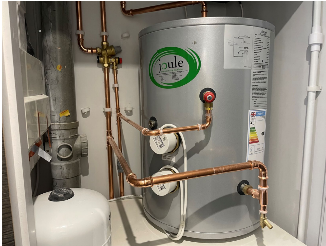
Water cylinder installed