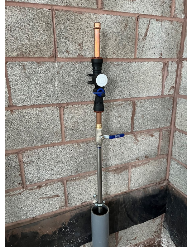
Water installation to commercial units