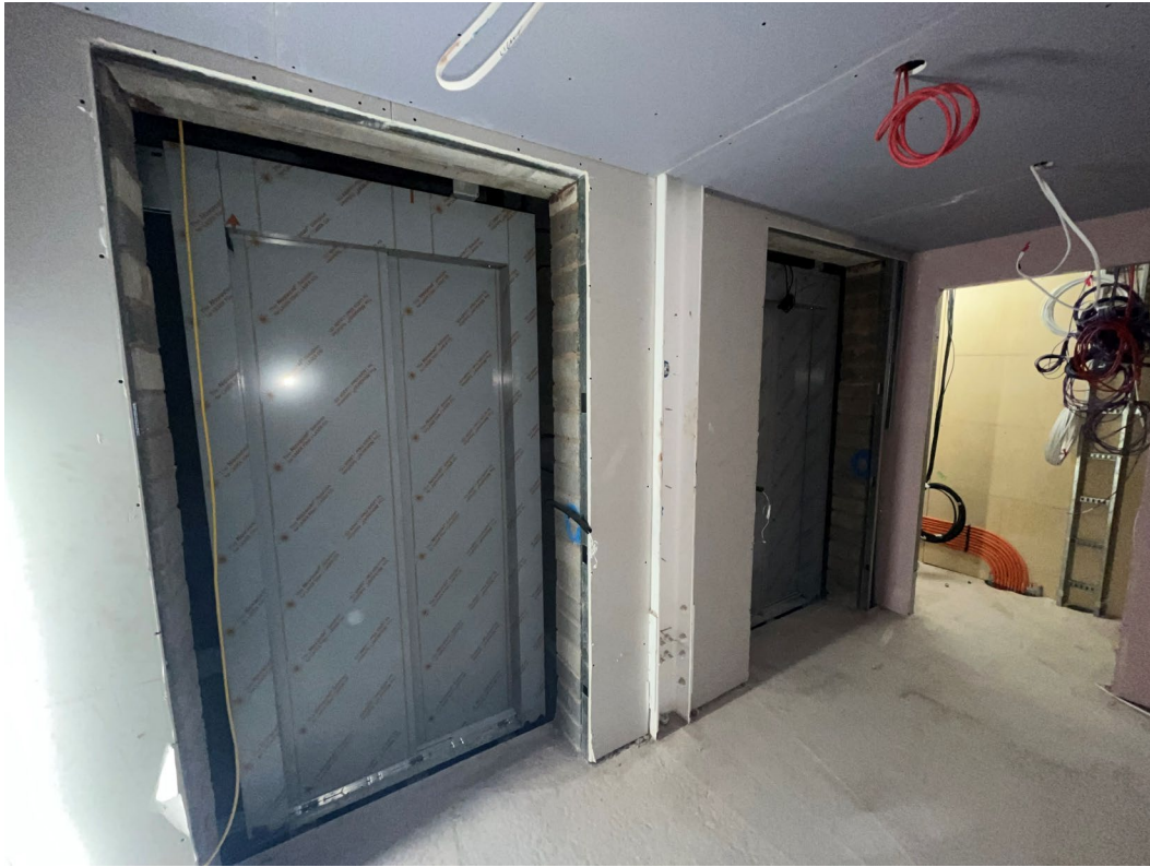
Lift installation complete