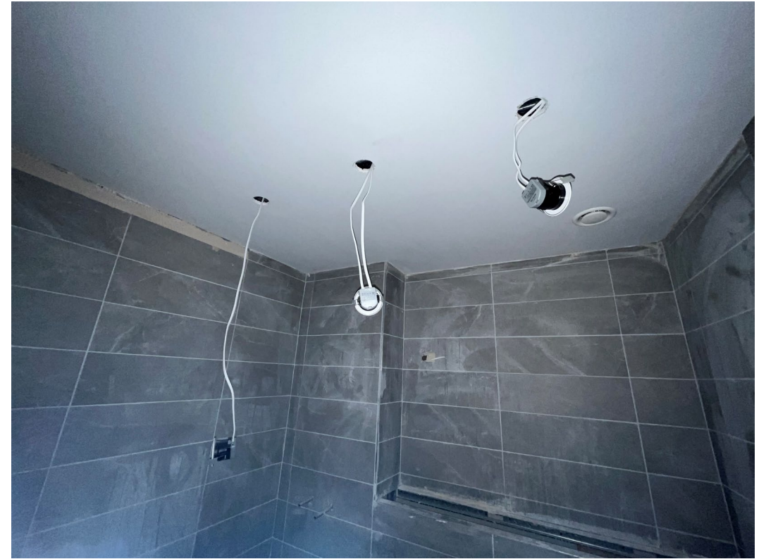
Bathroom light fittings