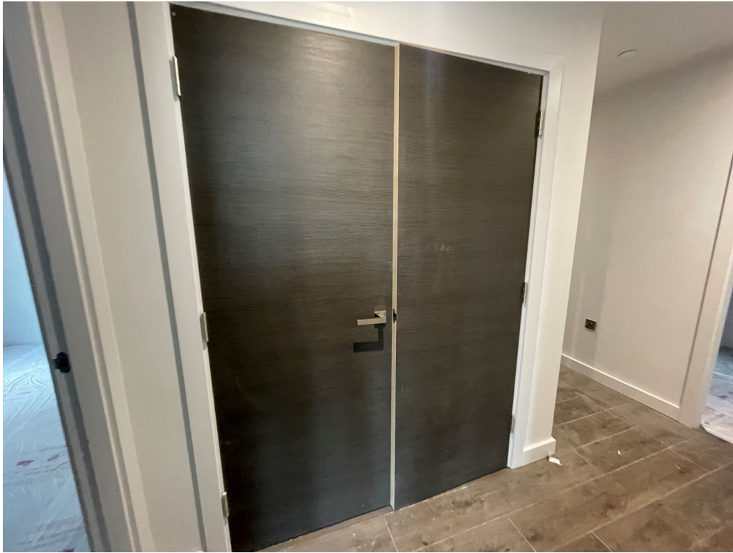
Apartment doors installed