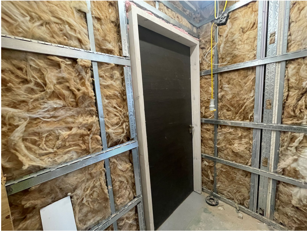
Apartment door and frame installed