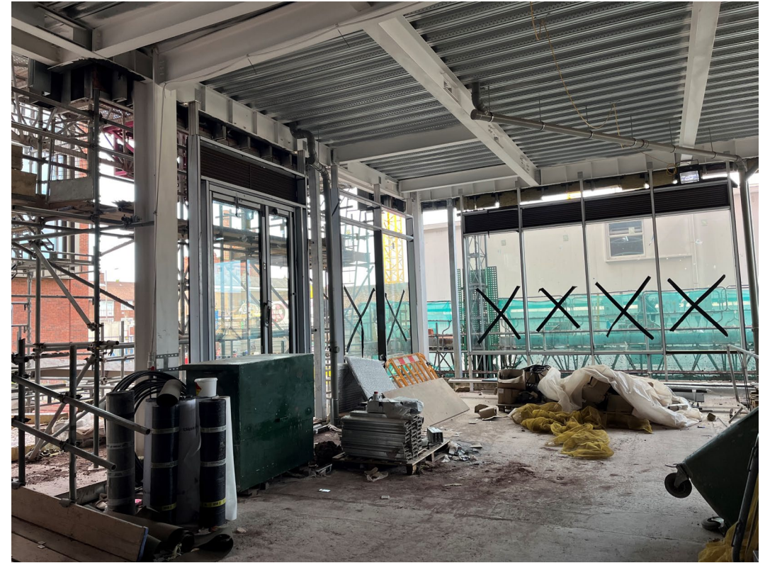
Curtain walling installed