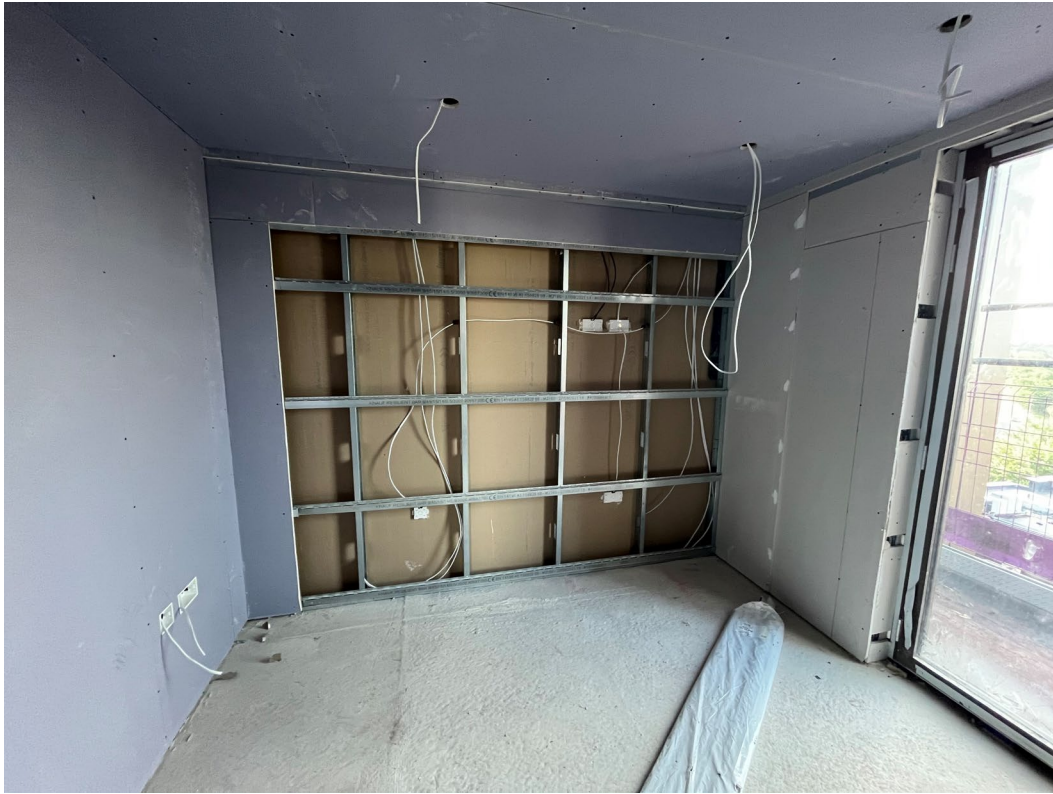
Apartment partition build-up