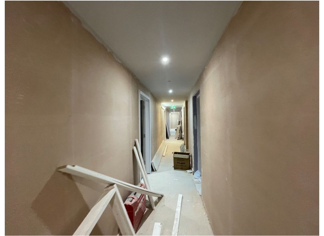
Circulation areas plastered