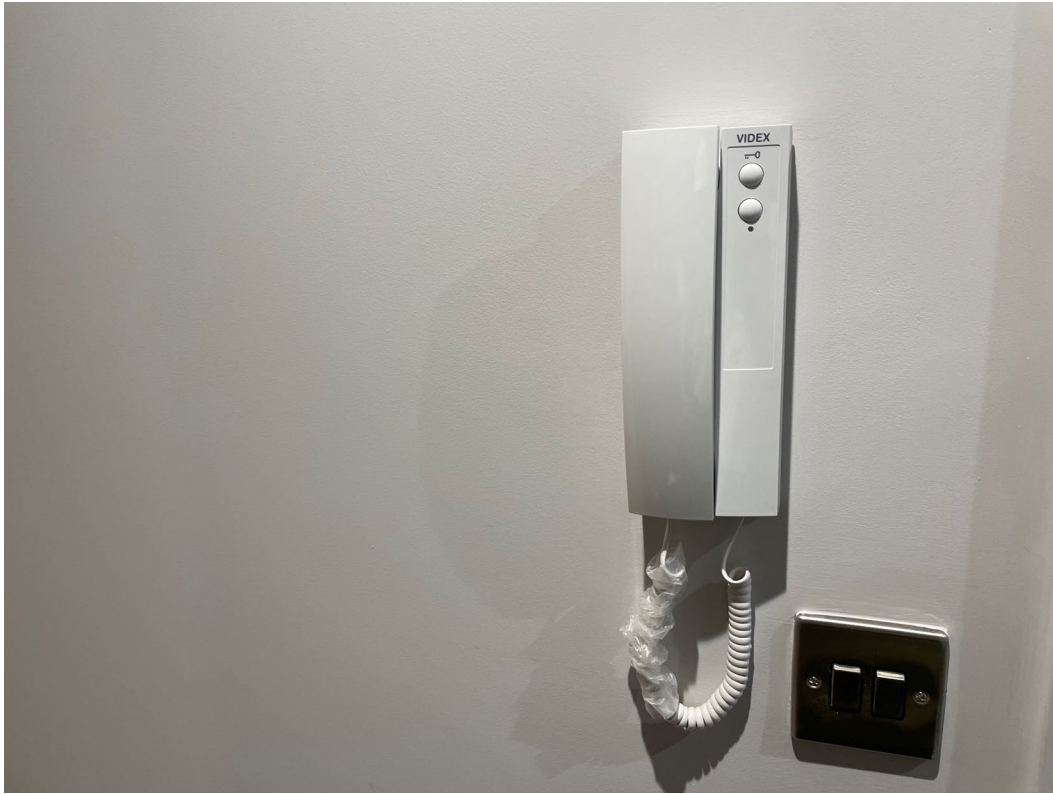
Apartment intercom handset installed