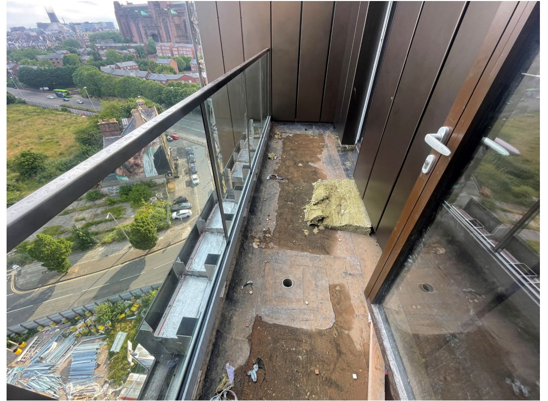
Terraces ready for paving