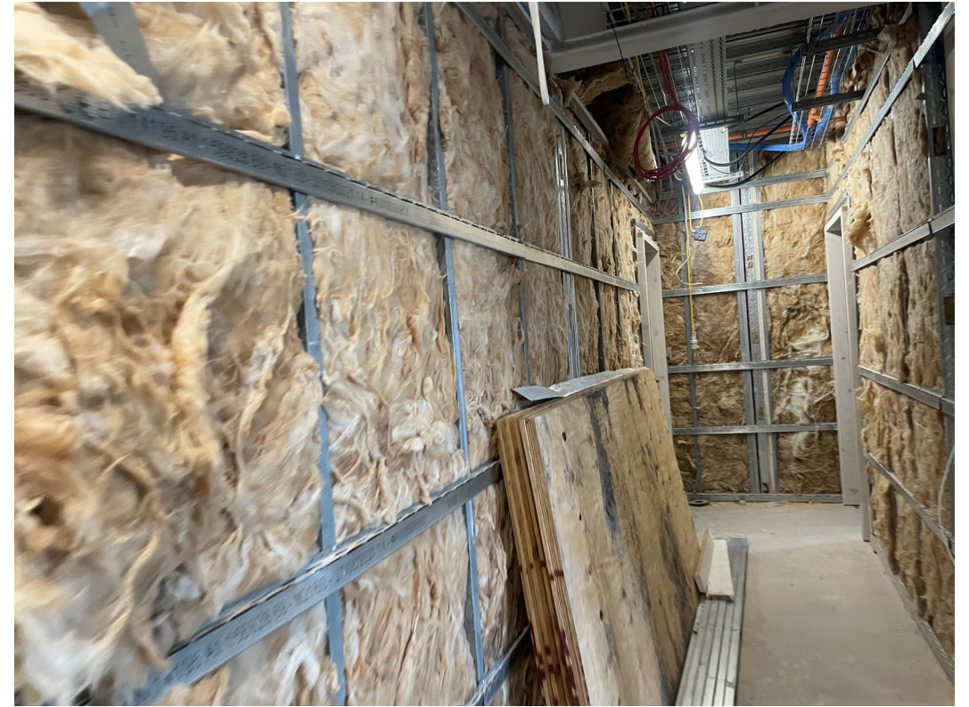
Partition insulation installed