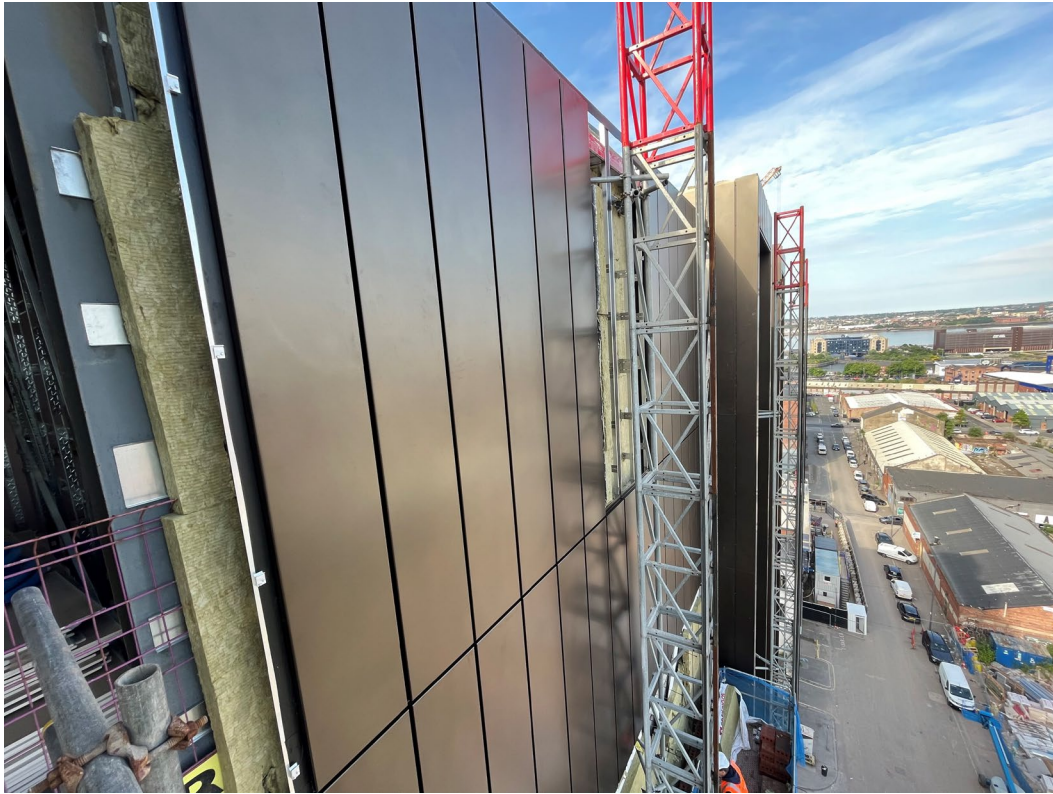
Cladding installation ongoing