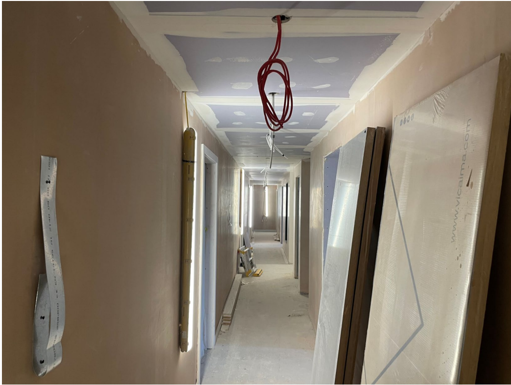
Circulation areas plastered