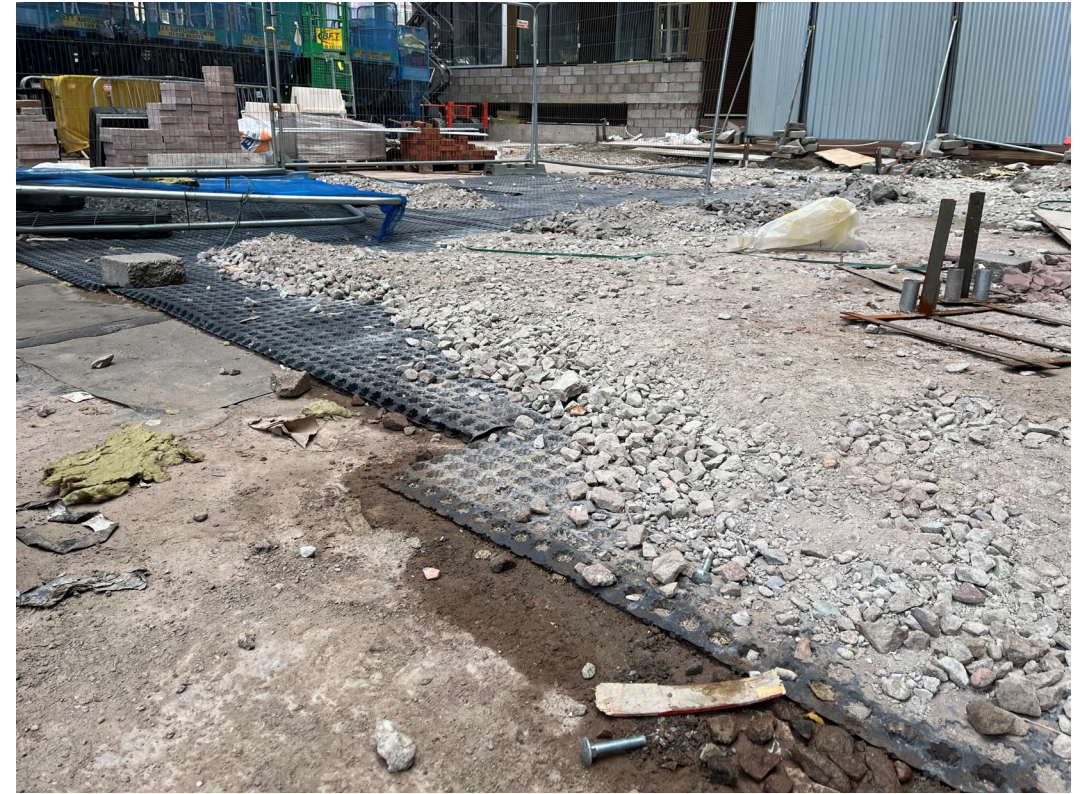
Podium build-up installation ongoing