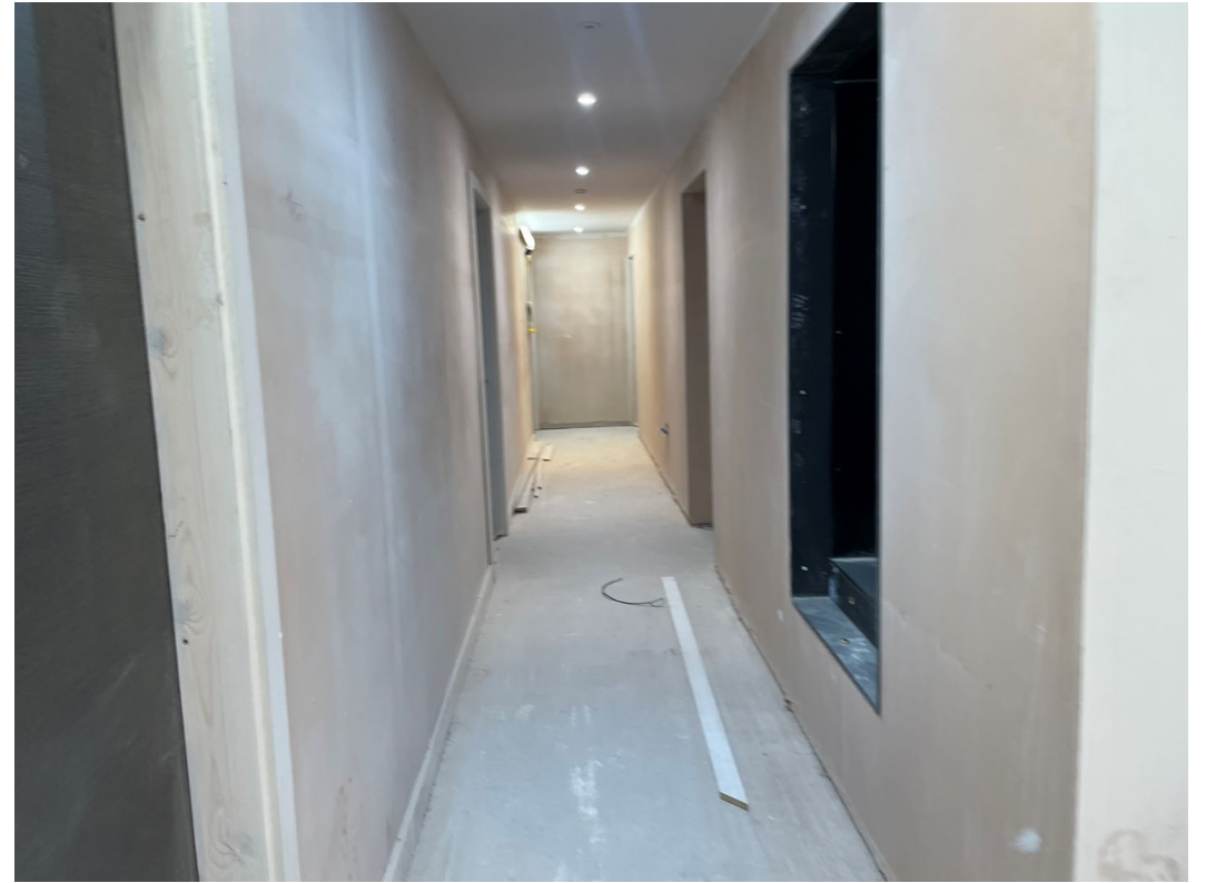
Circulation areas plastered