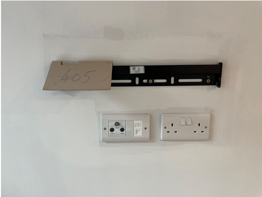
TV bracket installed