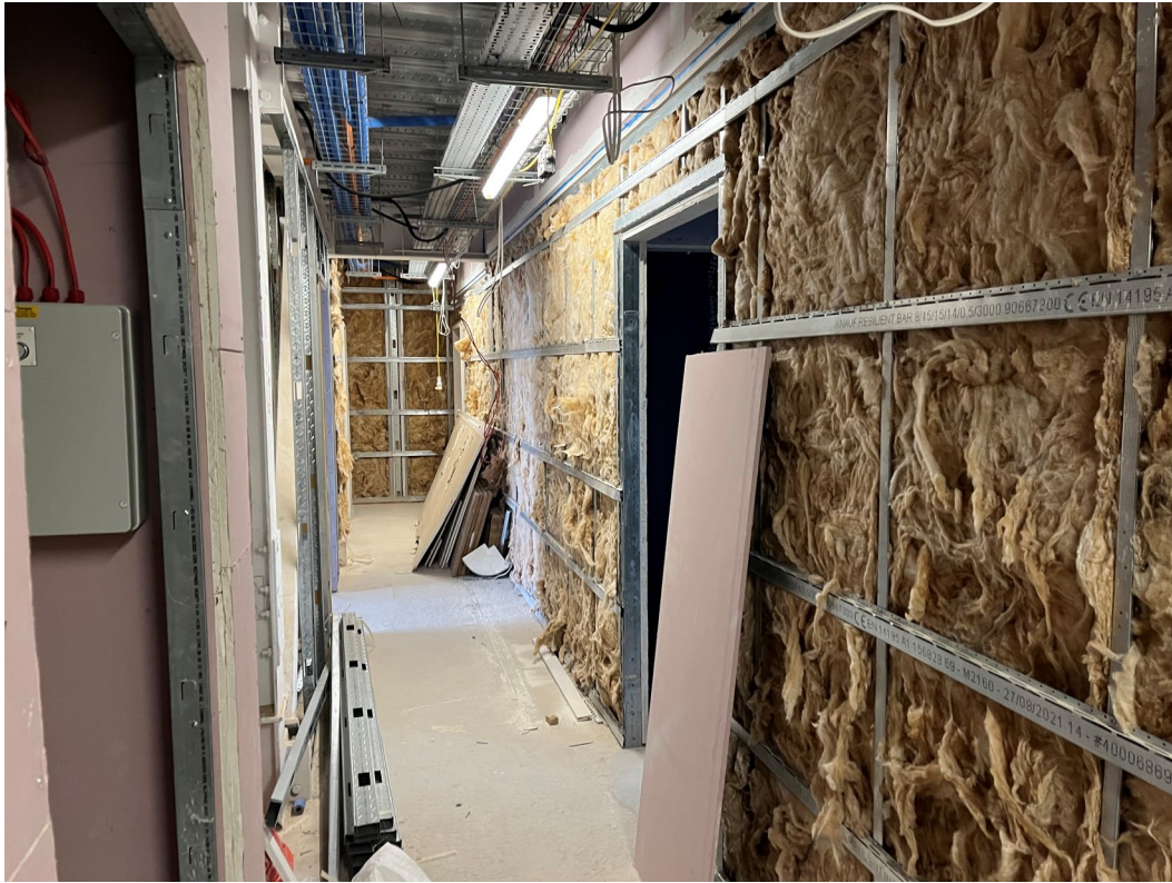
Partition insulation installed