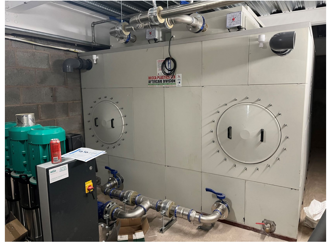
Water tank installed