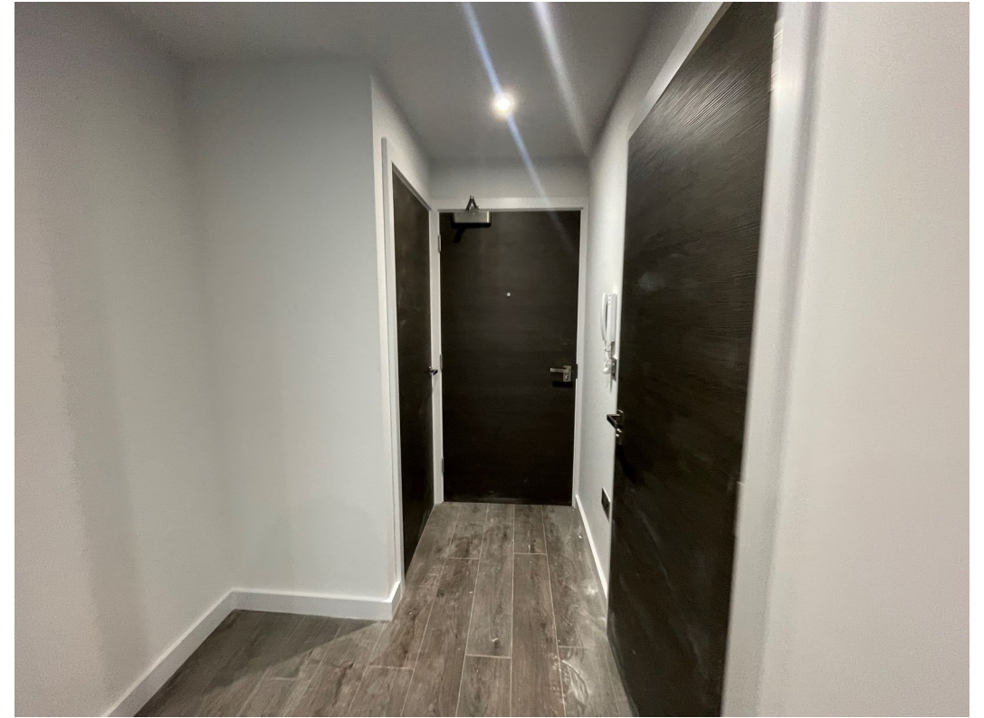
Apartments doors installed