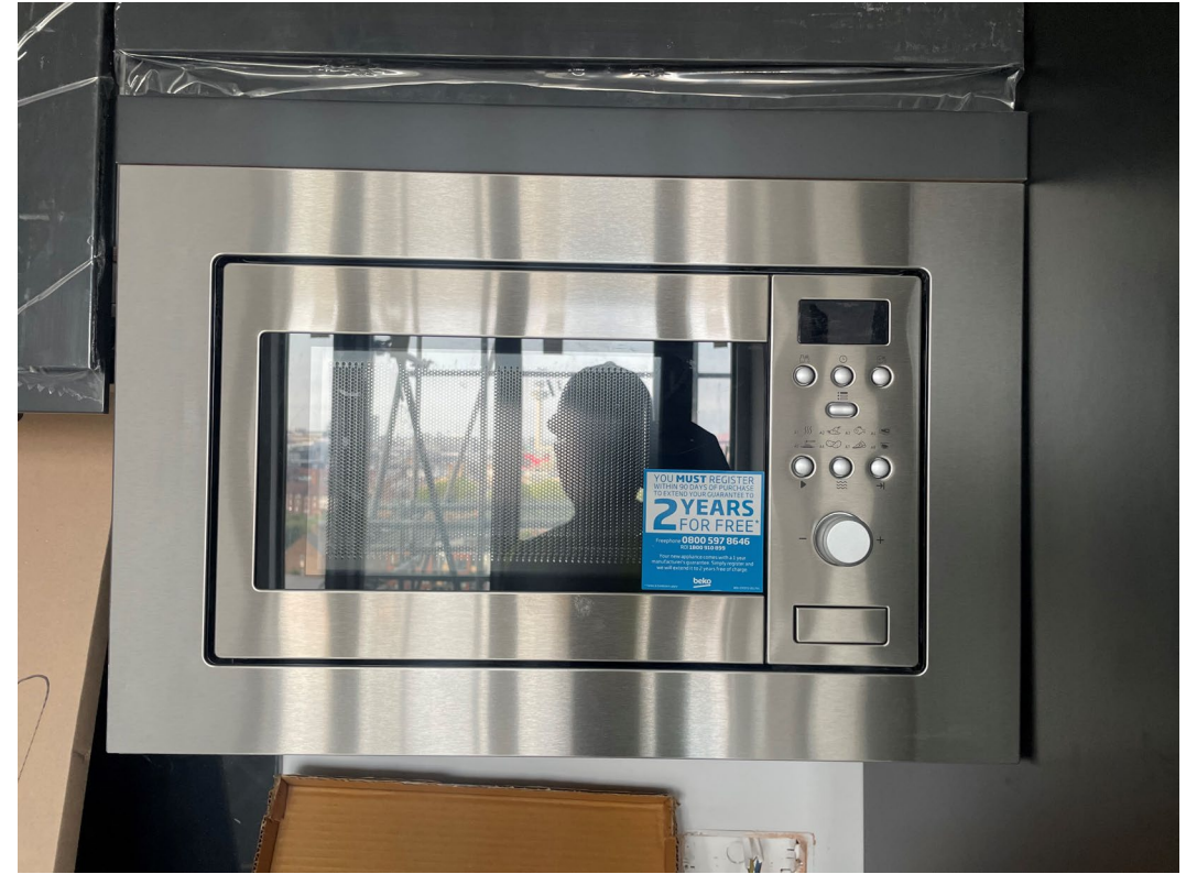
Integrated microwave installed