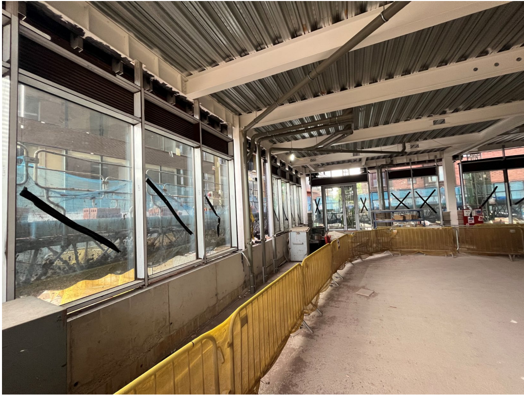
Curtain walling installed