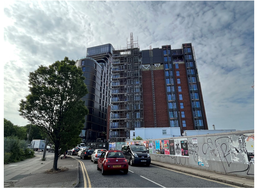
Block B – Viewed from St James Street