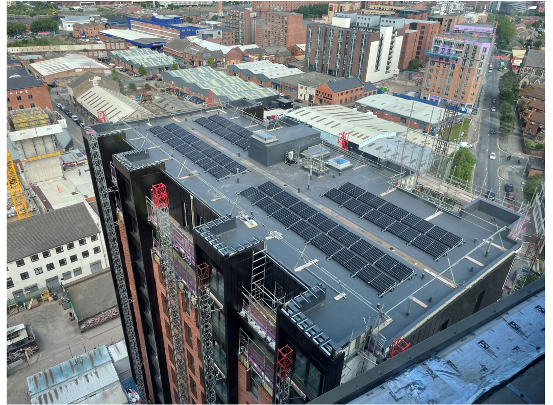
Block B – Viewed from Block C