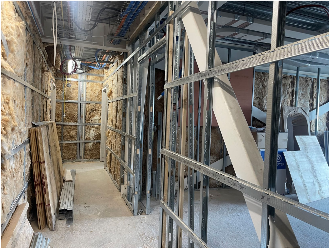
Metal partition frame to circulation area