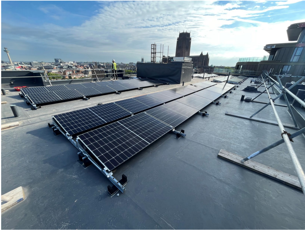
Solar panels installed