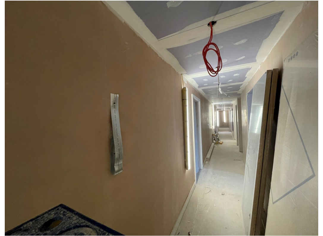
Circulation areas plastered