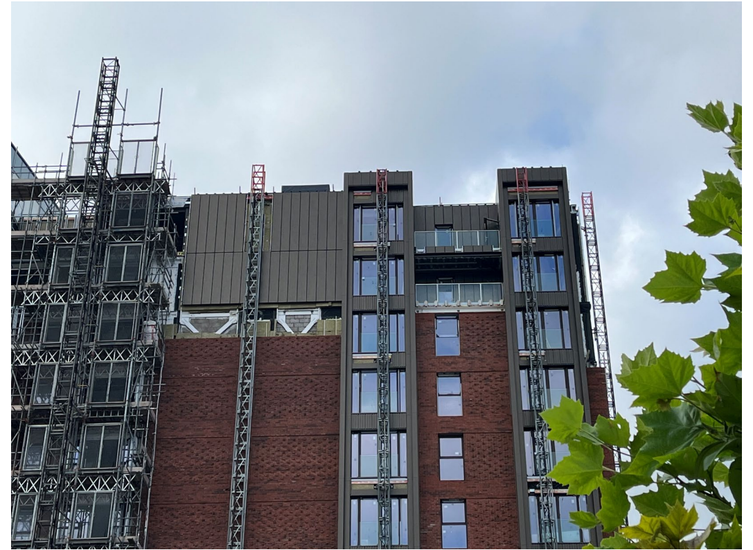
Cladding installation ongoing