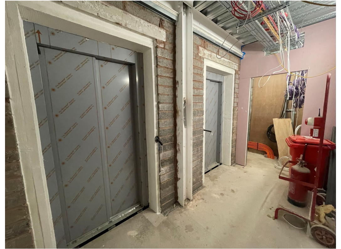
Lift installation complete