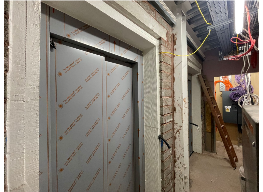
Fire stopping installed to lift opening