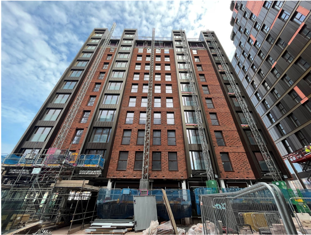
Block B – Viewed from Podium