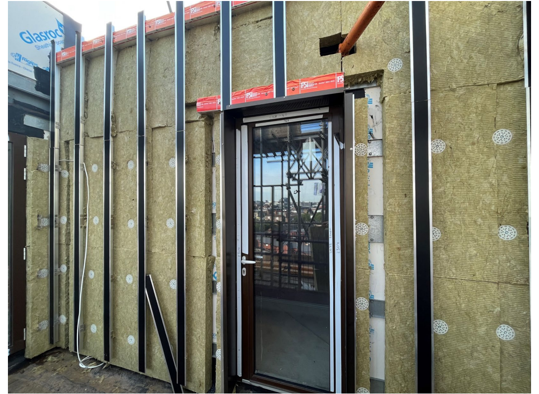
Cladding installation ongoing