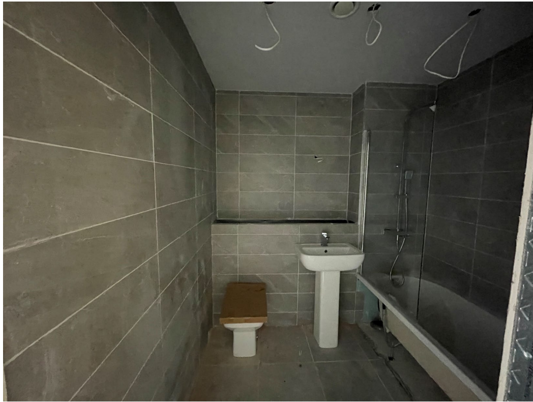
Bathroom appliances installed