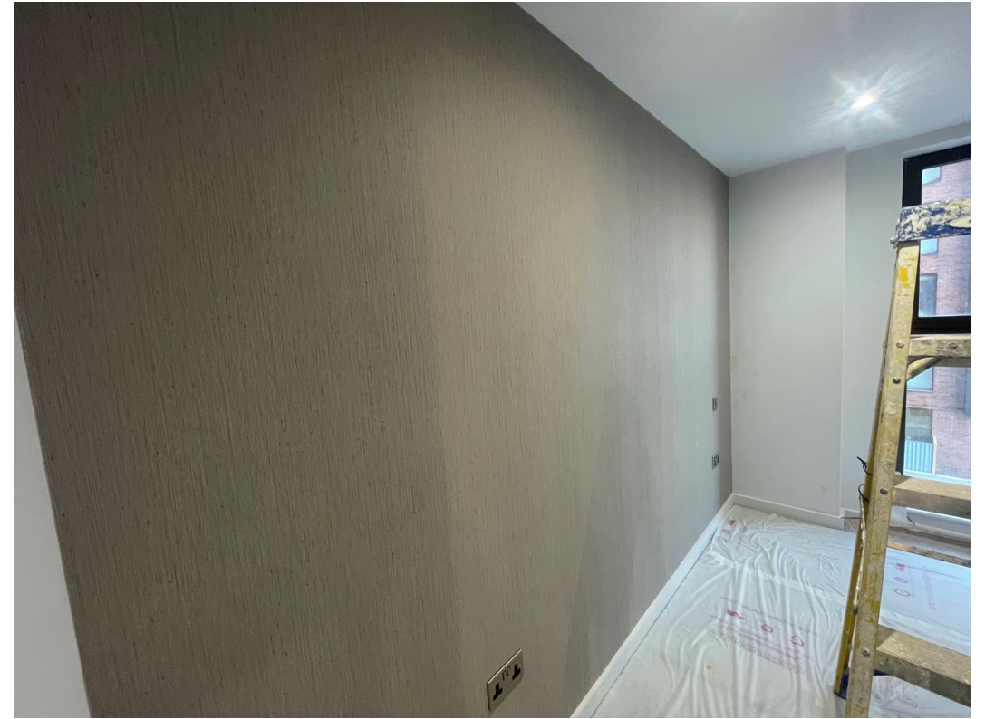
Wall coverings installed to bedroom