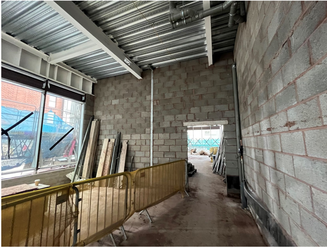
Masonry wall installed to Commercial Unit