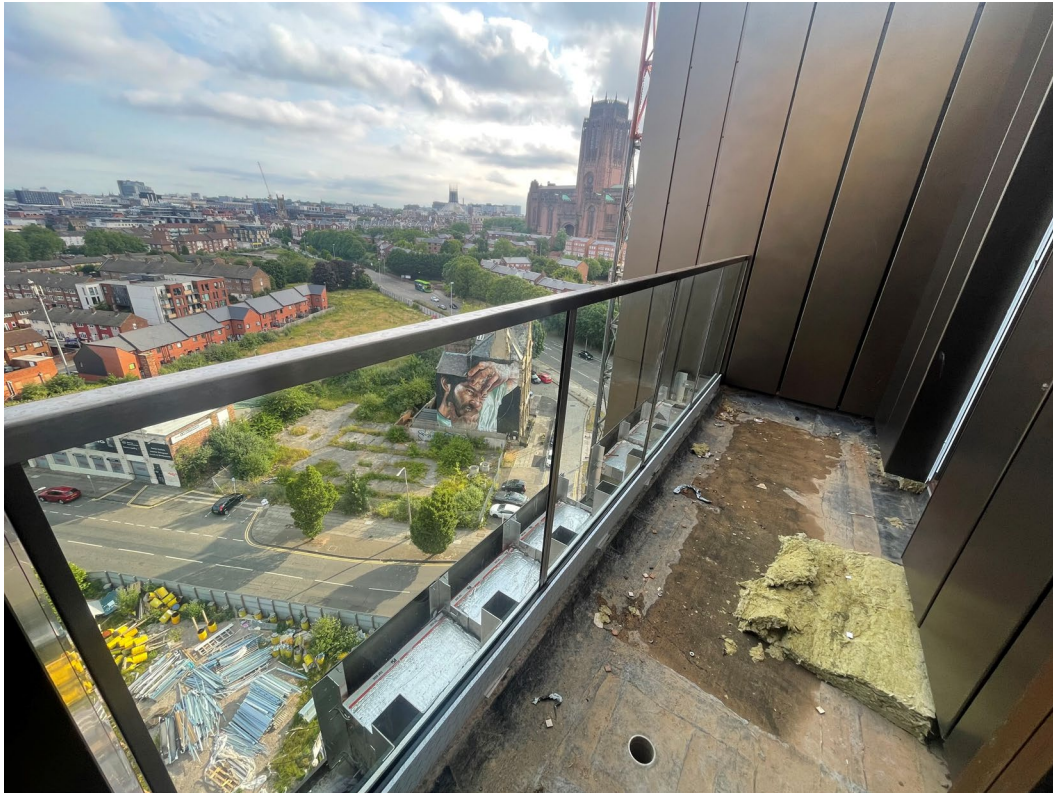
Terrace balustrades installed