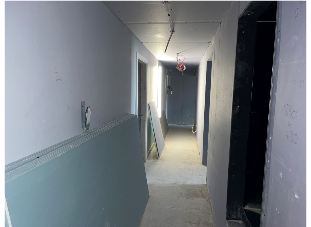
Circulation areas boarded