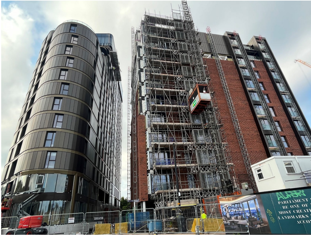
Block B – Viewed from St James Street