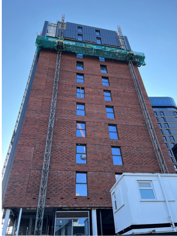
Block B – Viewed from Crump Street