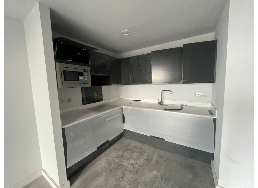
Kitchen installed and protected