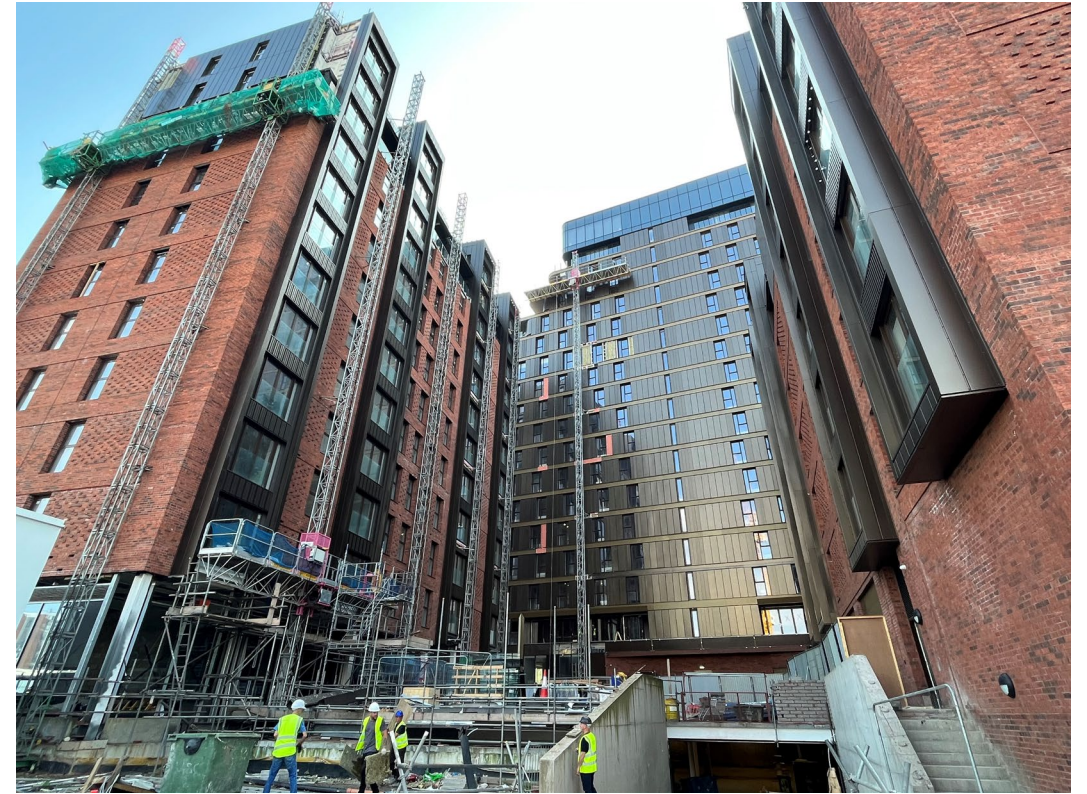
Block B – Viewed from Crump Street