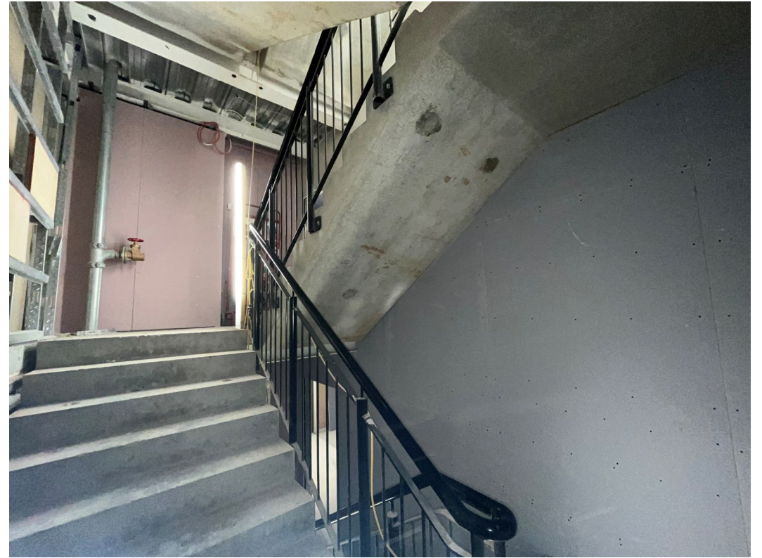
Staircase balustrade installed