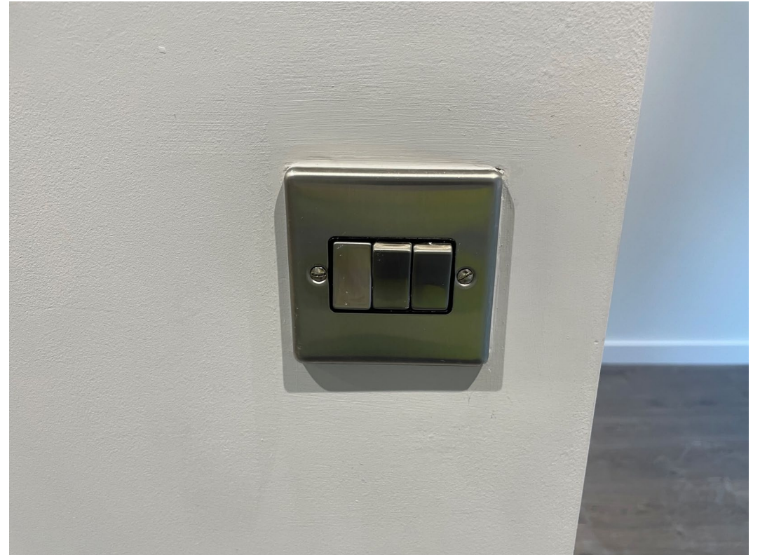
Light switch installed