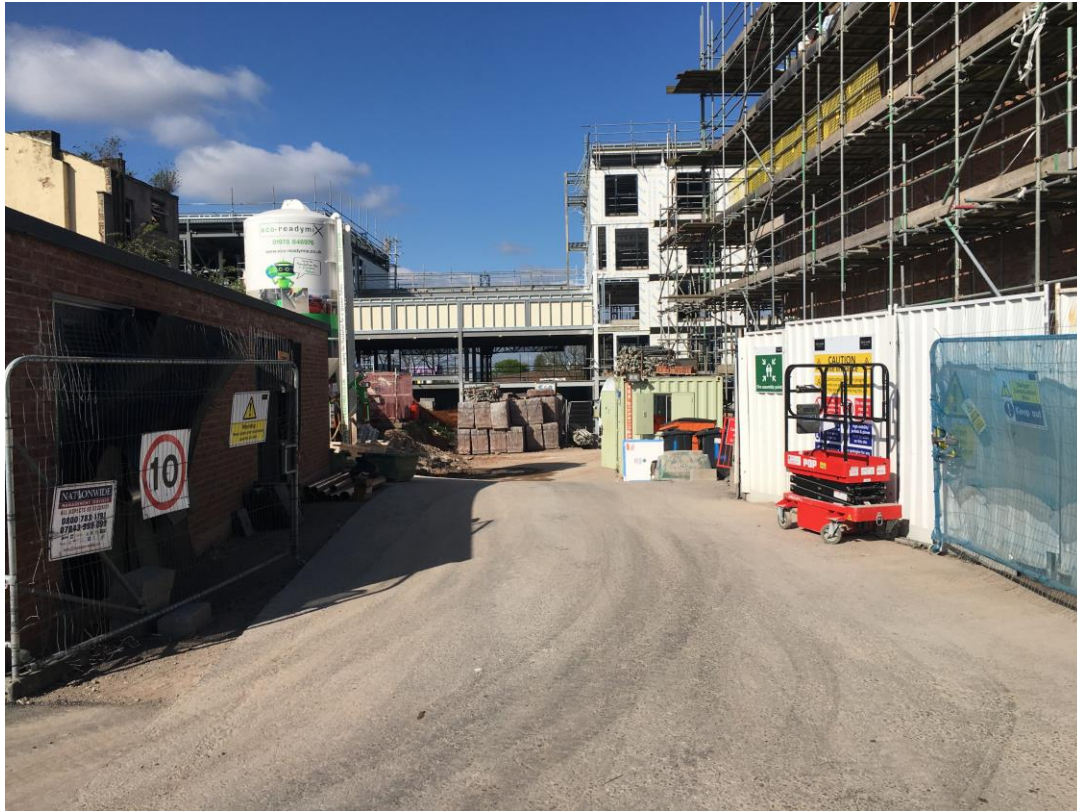
Secure site access for plant and deliveries