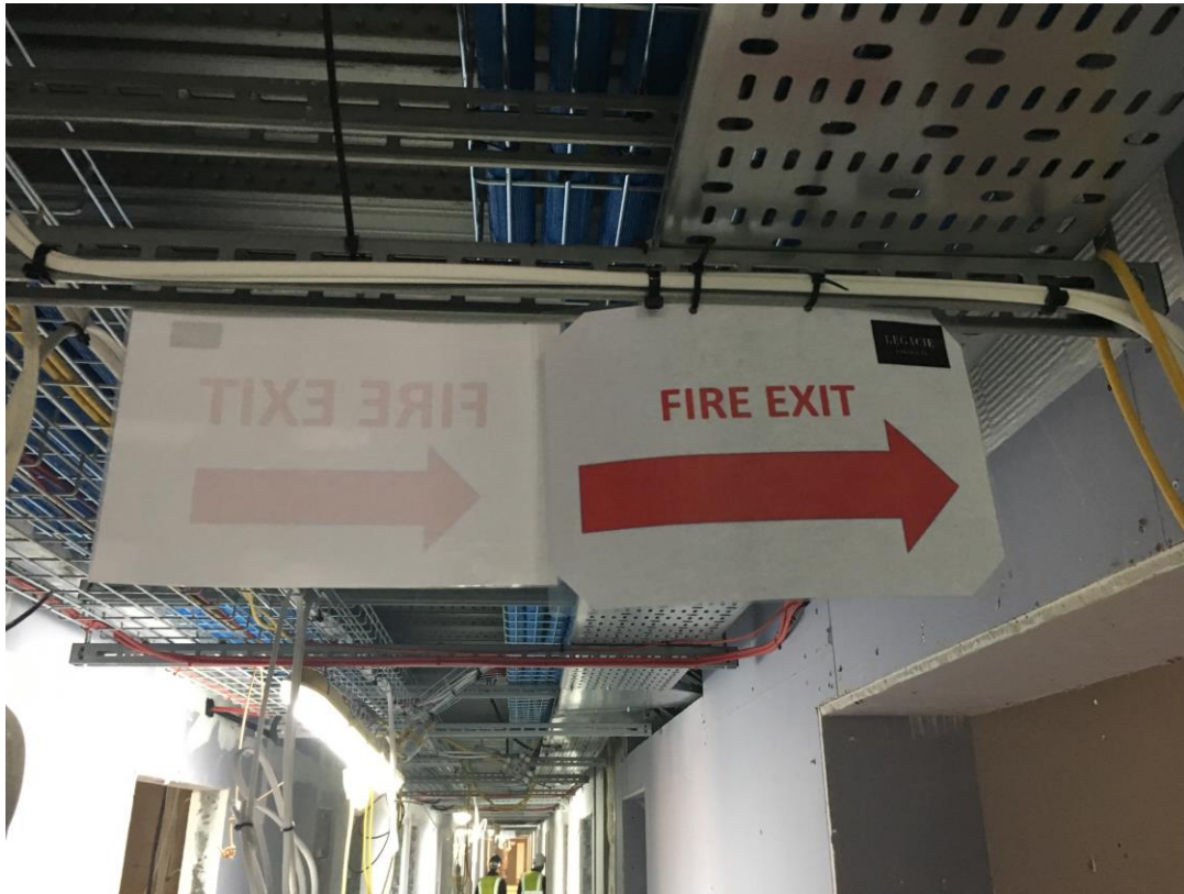
Directional fire exit signage