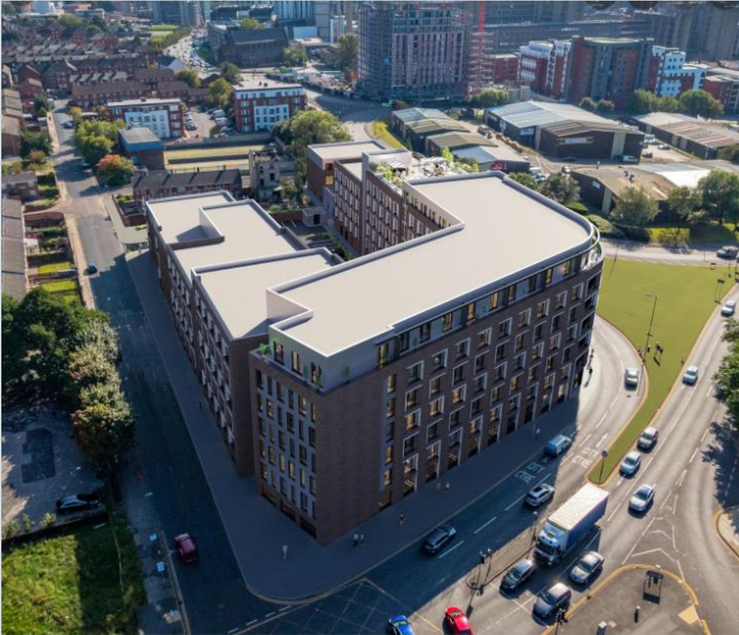
Land at Corner of Low Hill and West Derby Road, Liverpool L6