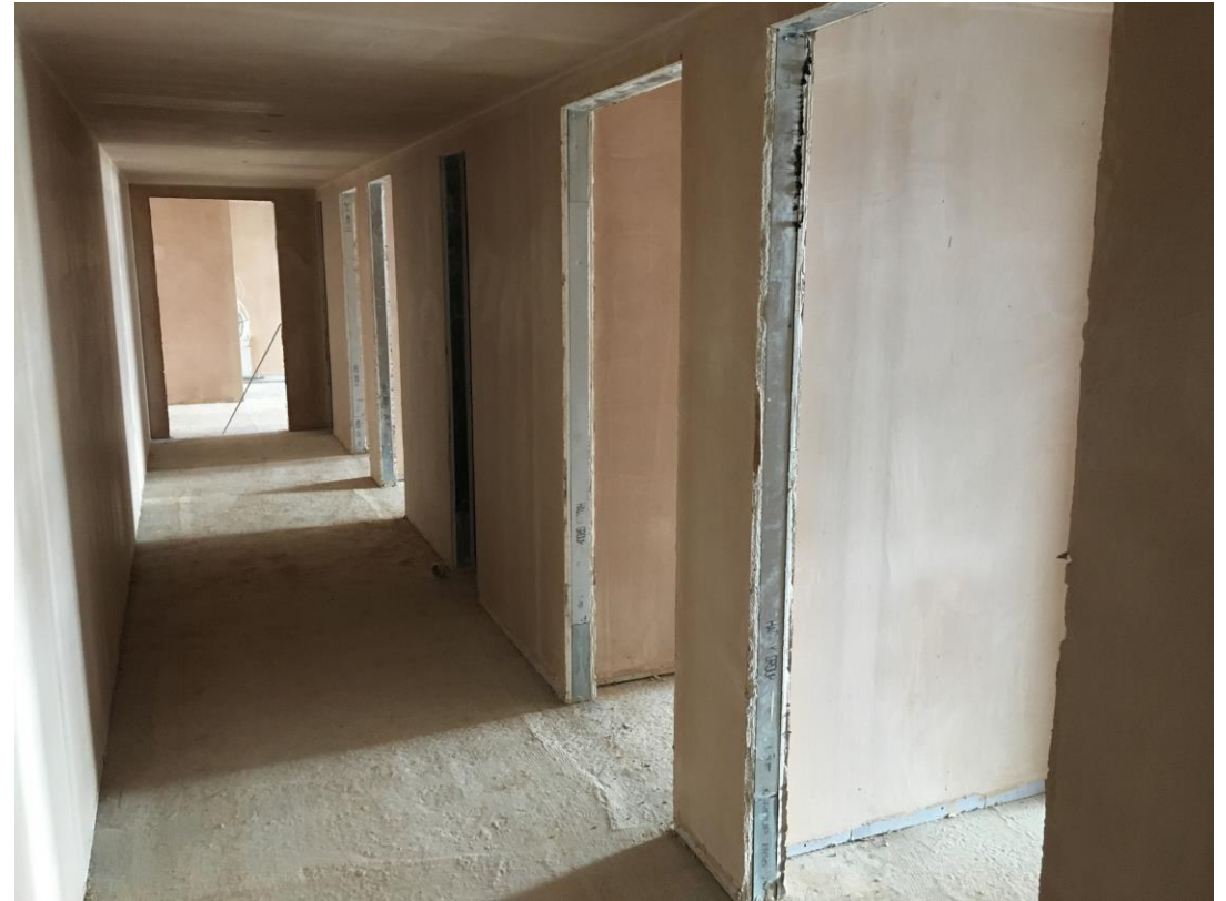
Student wing – Drylining & plasterwork