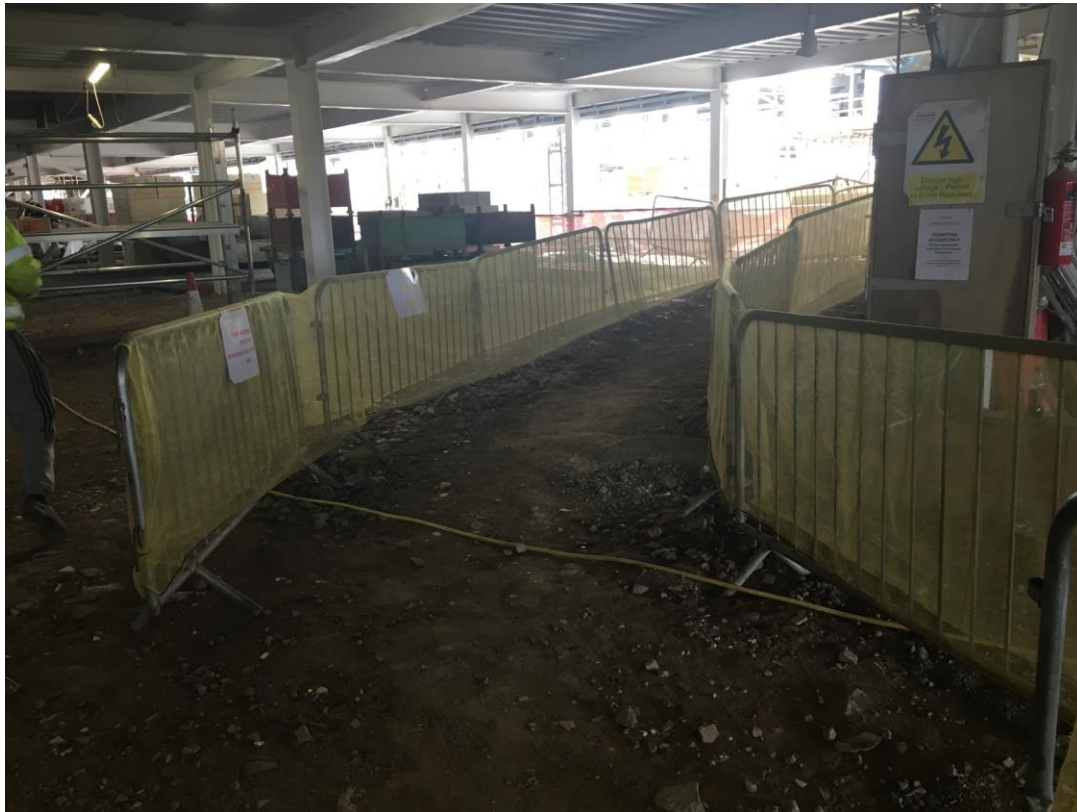
Site barriers being utilised