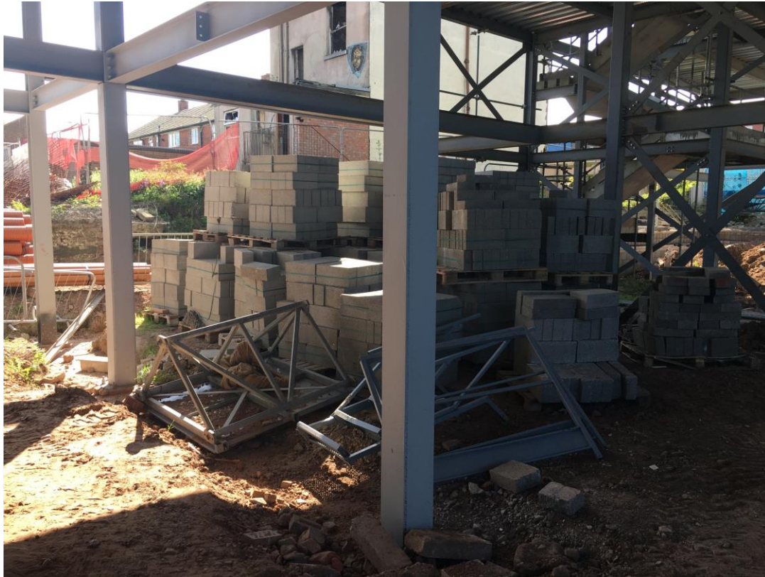
Material storage – concrete blocks