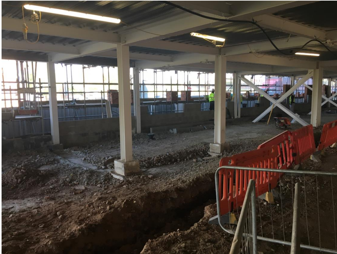
Ground floor - Under ground drainage and ground floor beams