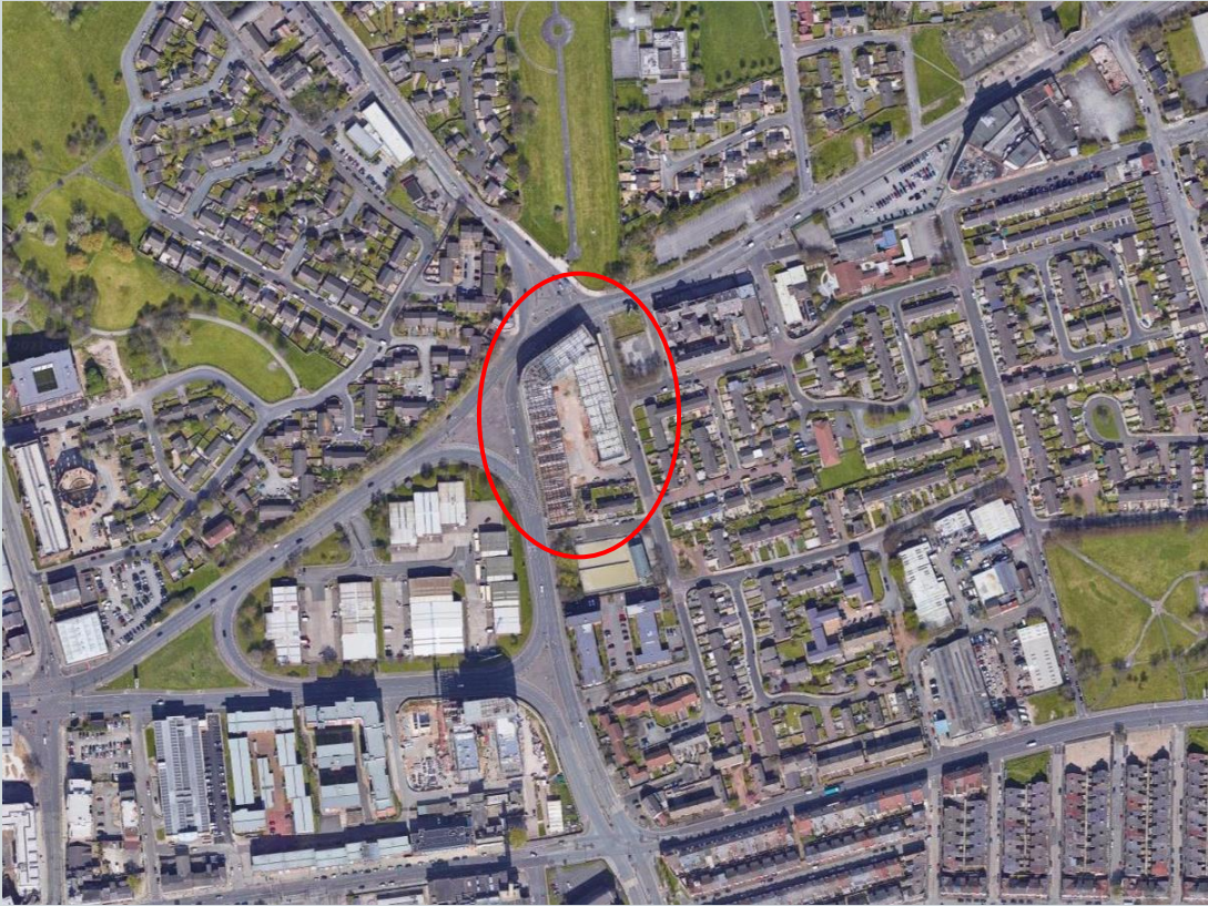
Aerial view of Element – The Quarter site location