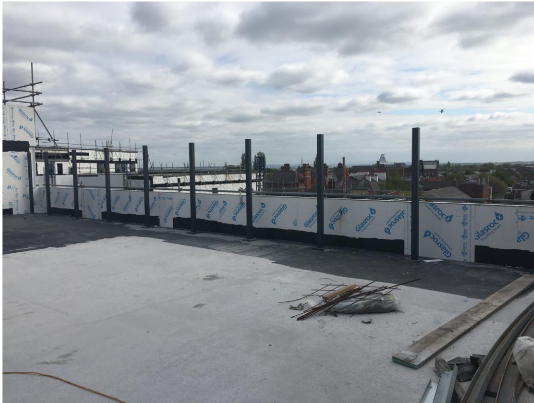
Terrace – Glass balustrade commenced