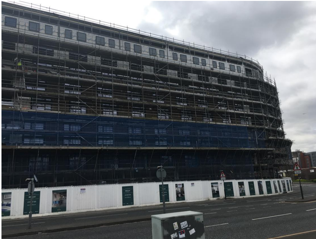
West Derby Road - Site view