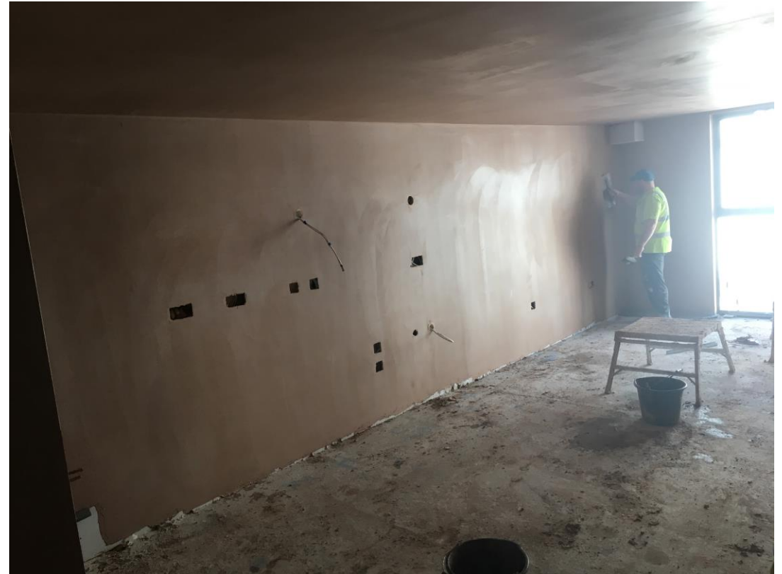
Student wing – Drylining & plasterwork