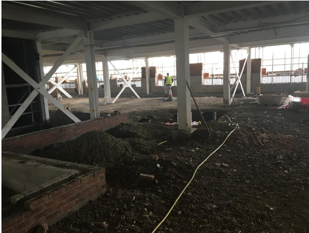
Ground floor - Under ground drainage and ground floor beams