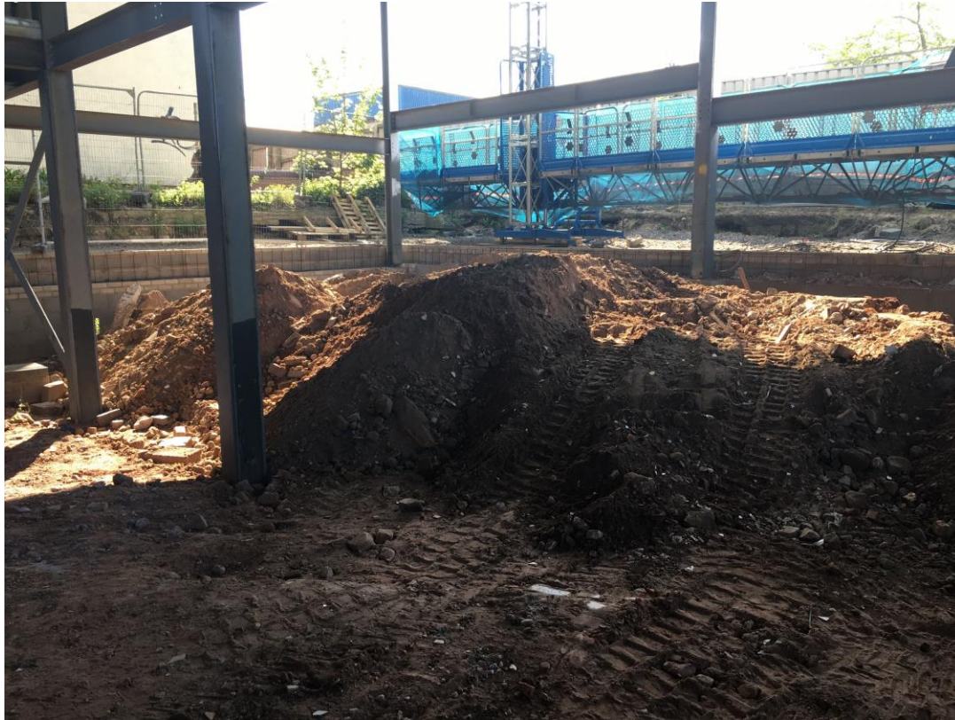
Commercial block – retaining wall back fill