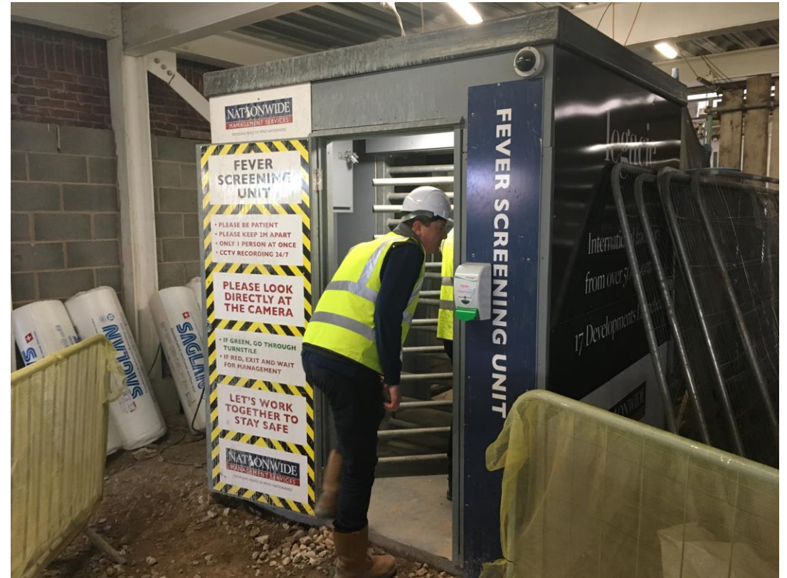
Turnstiles being utilised