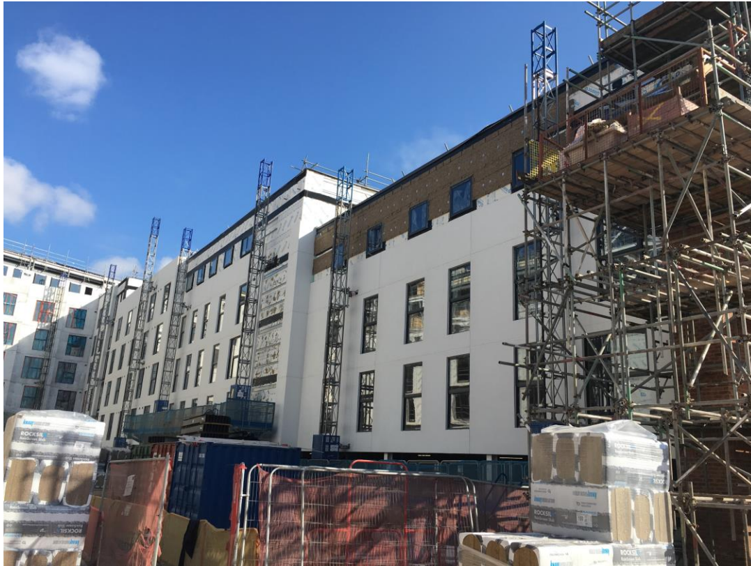
Student wing – Mast climbers, external insulation & render progress