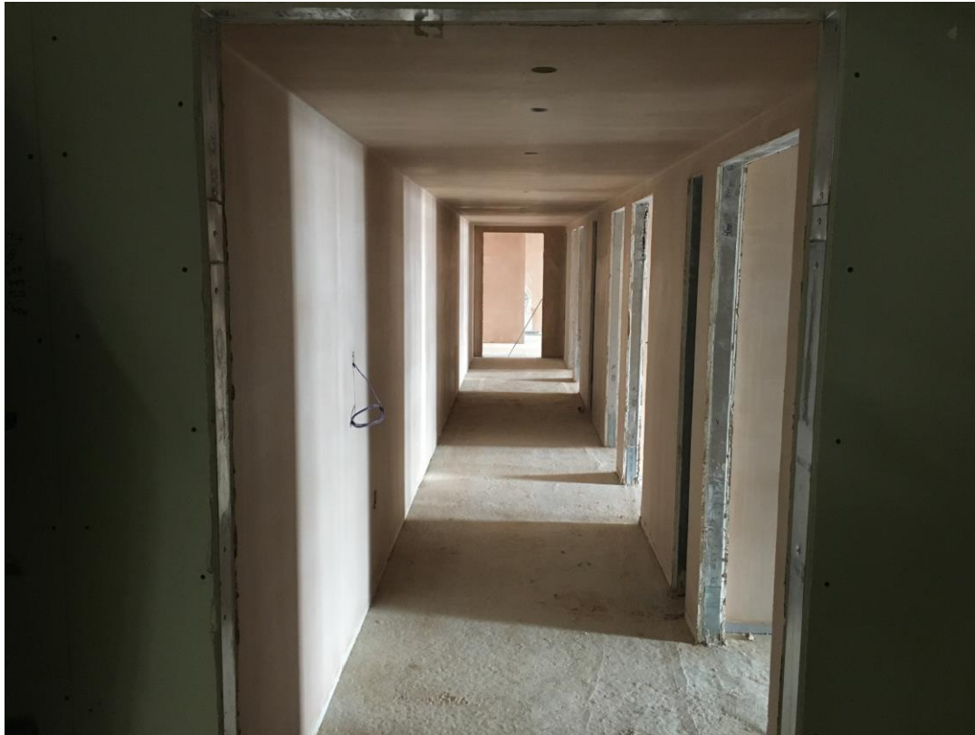
Student wing – Drylining & plasterwork