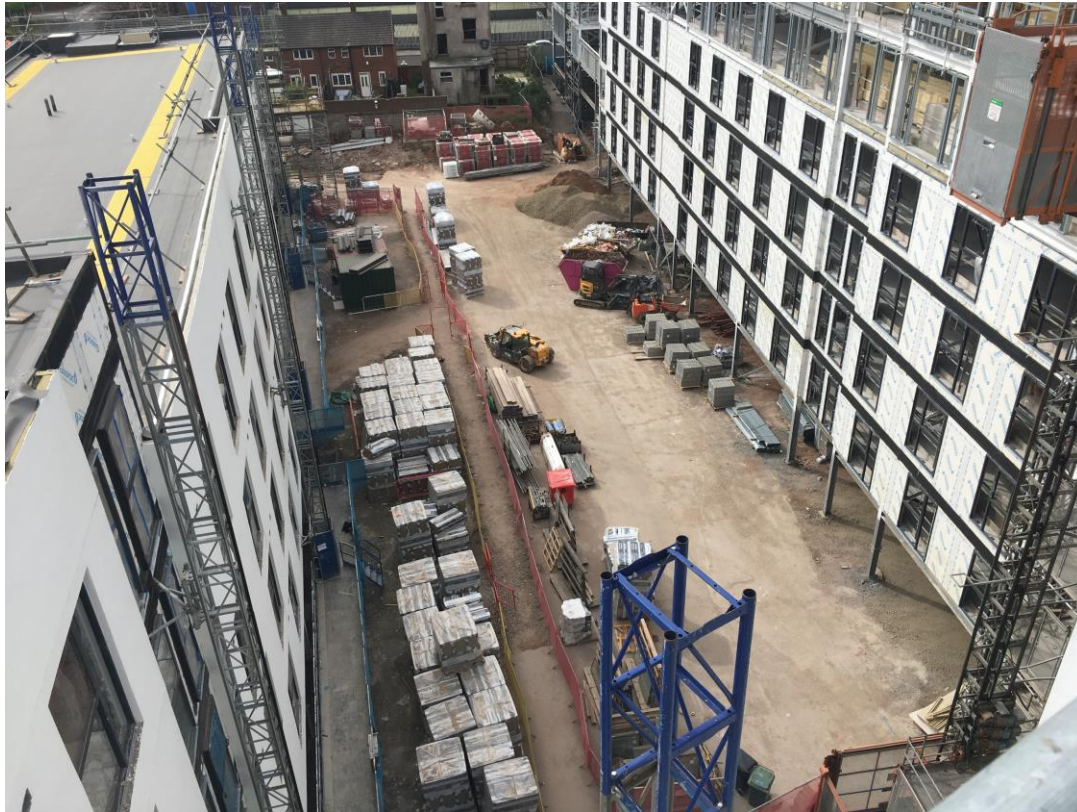
Inner courtyard – General site activity