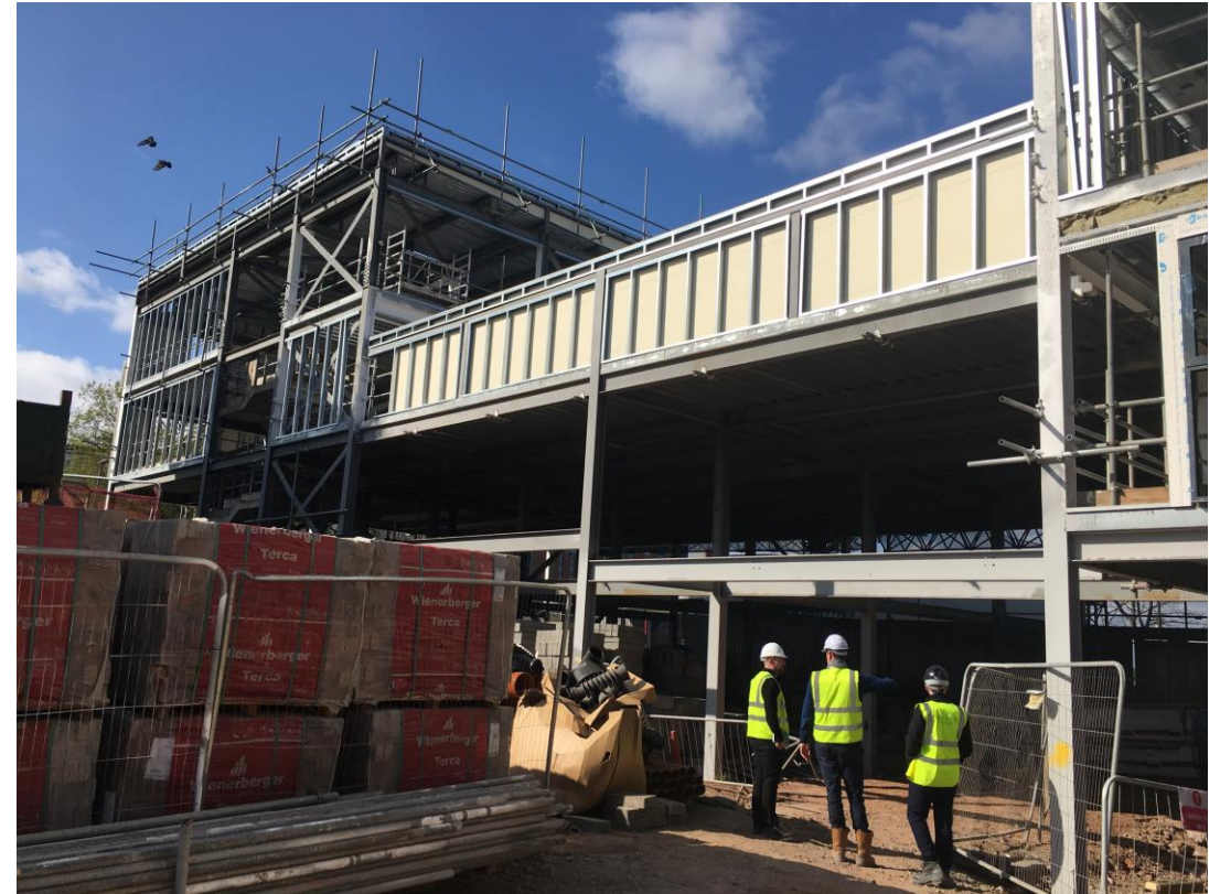
Inner courtyard view – Commercial Block