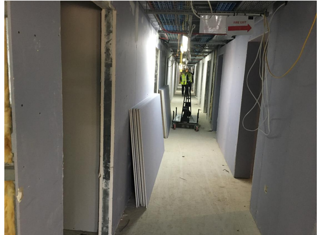
Student wing – Drylining