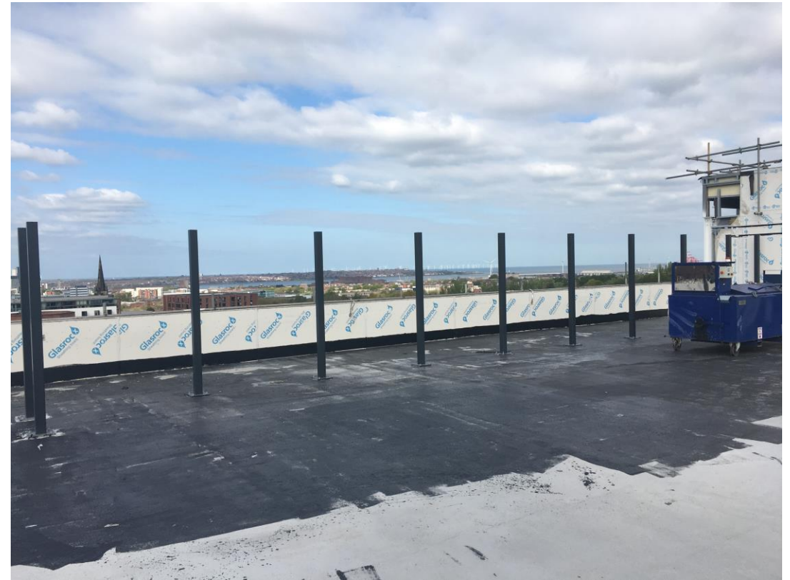
Terrace – Glass balustrade commenced