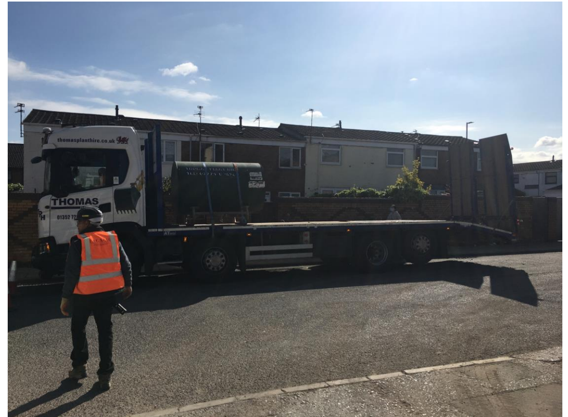
General site activity