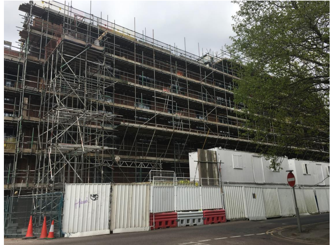
Walker Street - Site view