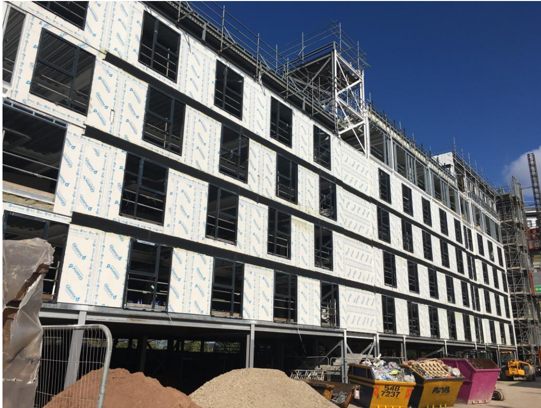
Residential wing - Steel frame structure, SFS & weatherboard and windows