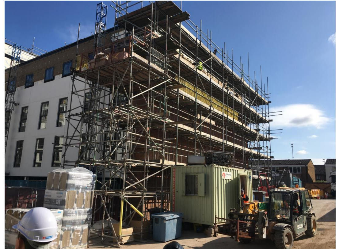
Student wing – Gable wall brickwork