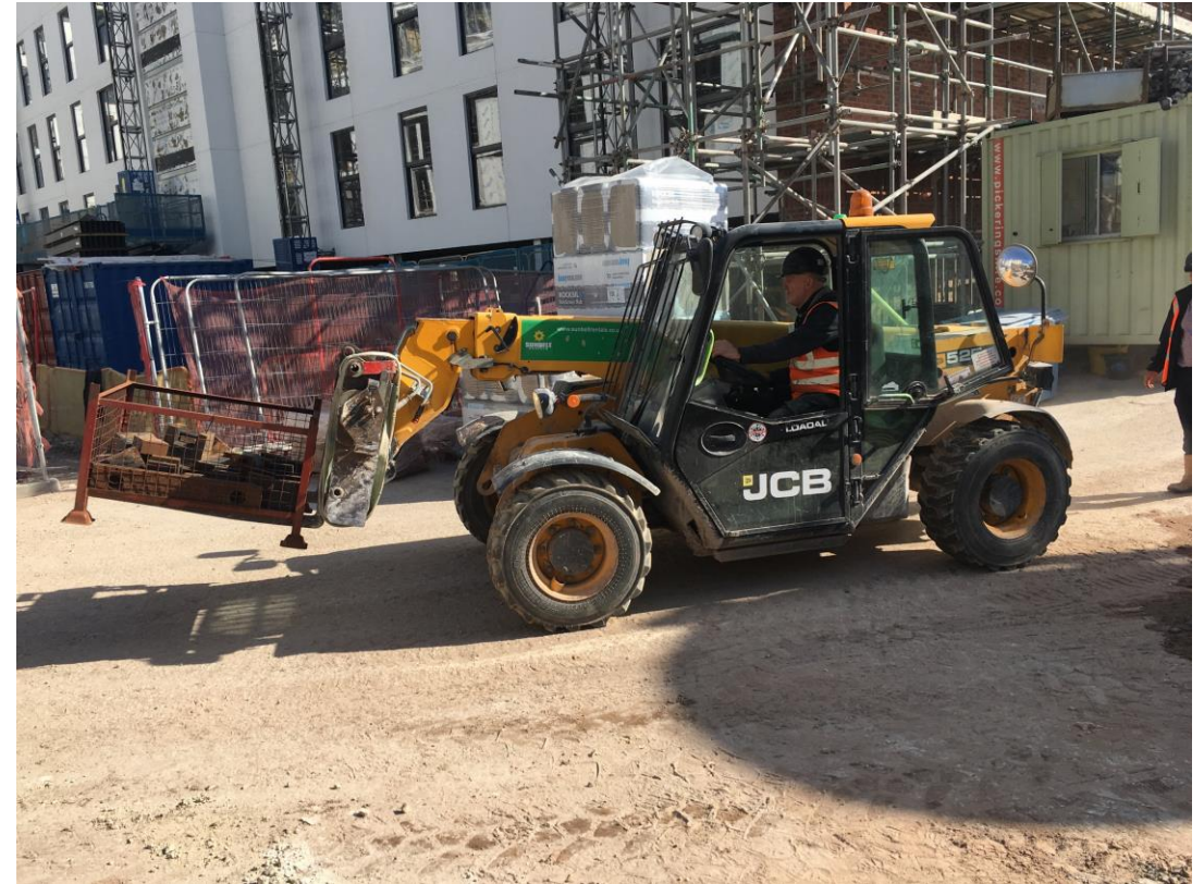
General site activity