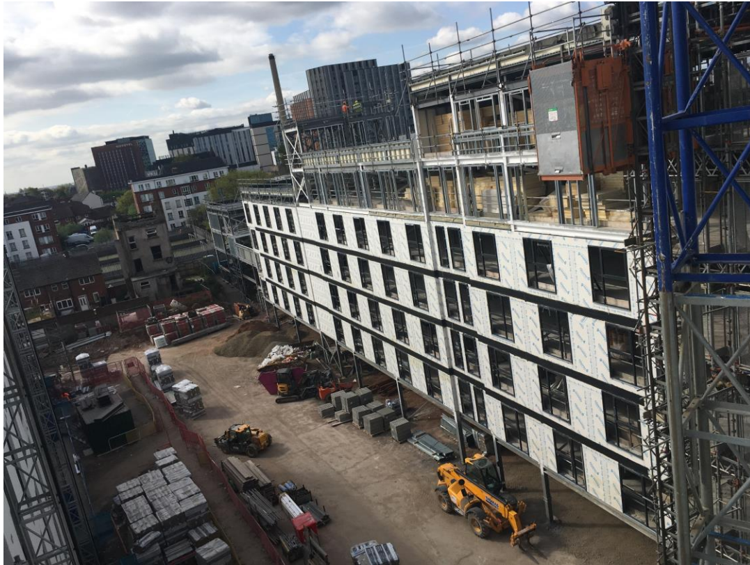
Residential wing - Steel frame structure, SFS & weatherboard and windows