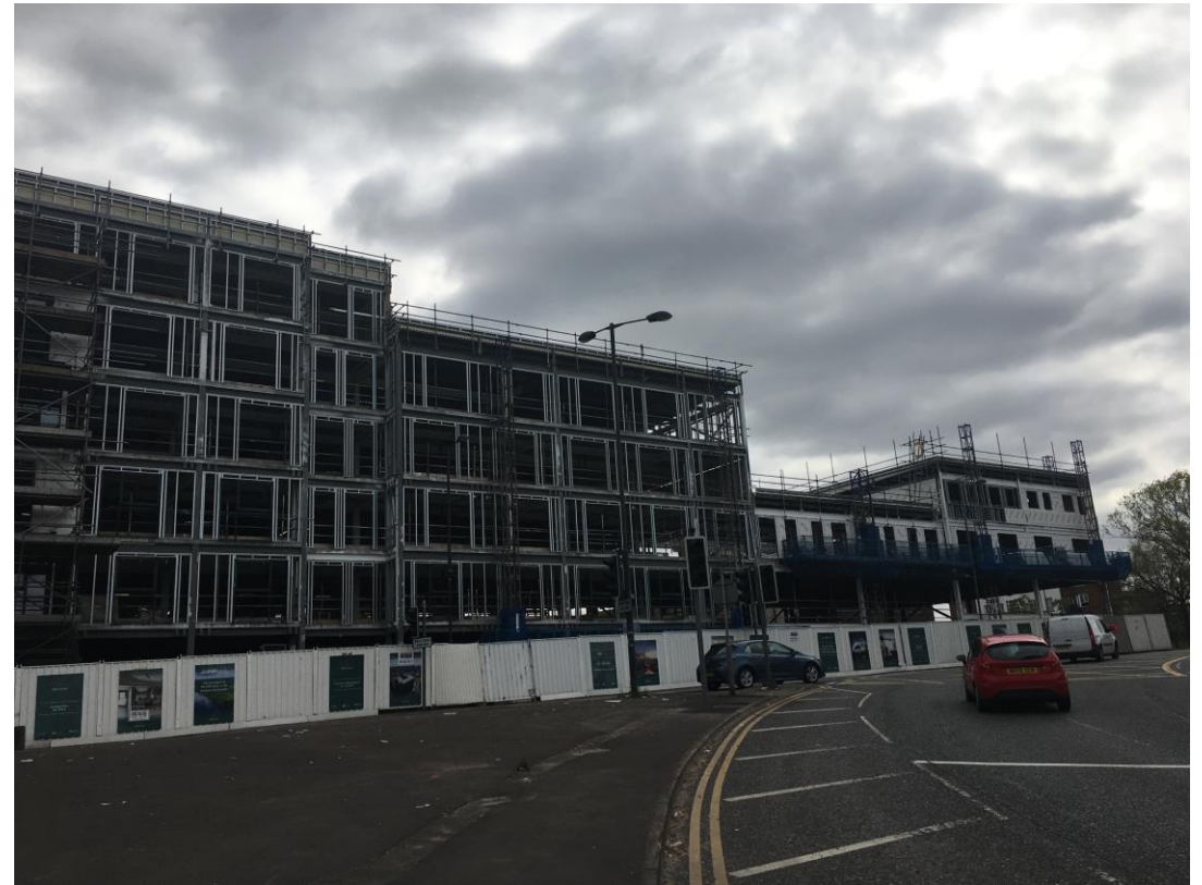
Brunswick Road - Site view