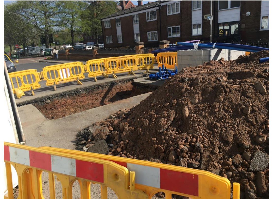
Walker Street - Final Mains Connection