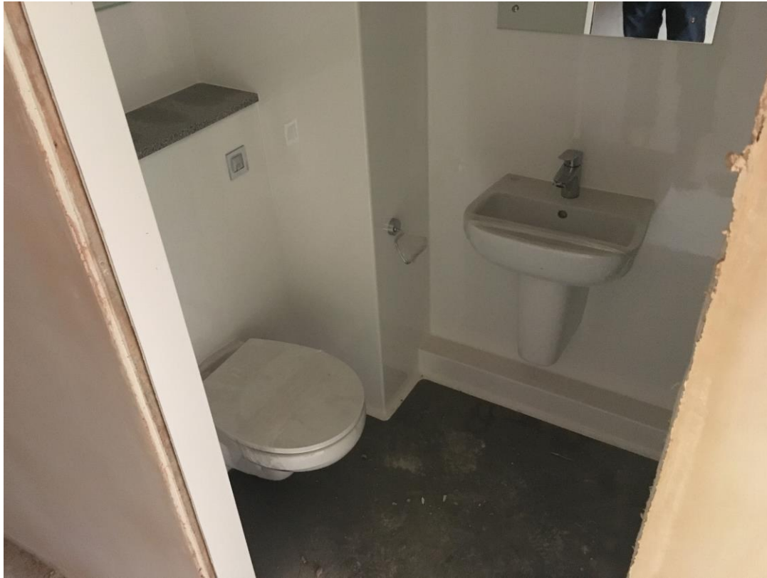
Student wing – Bathroom pod