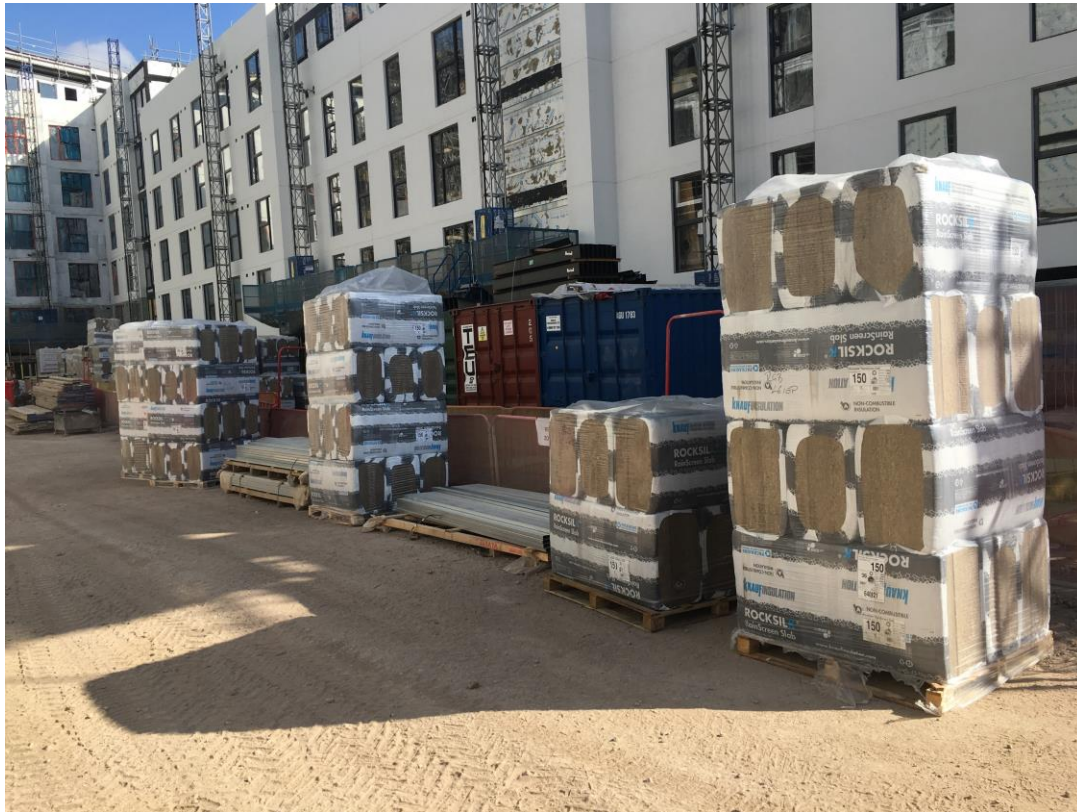
Material storage – Insulation