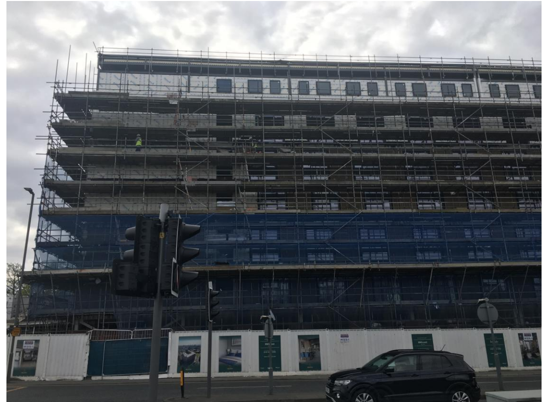
West Derby Road - Site view