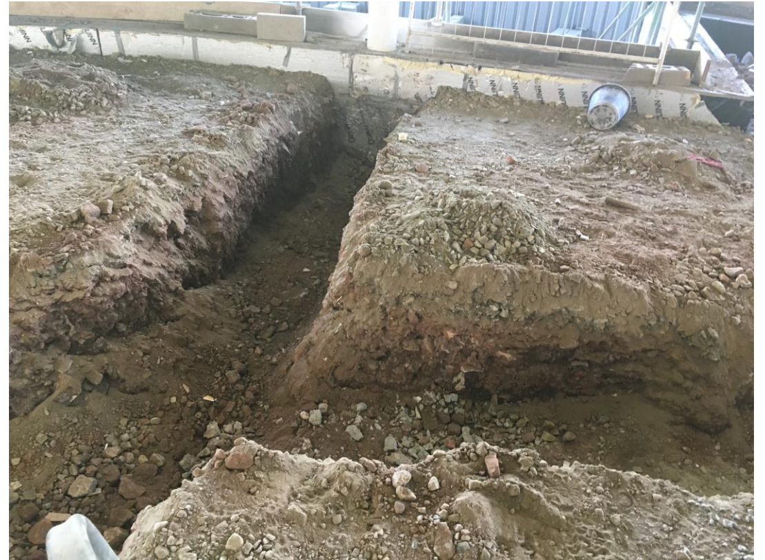
Ground floor - Under ground drainage and ground floor beams