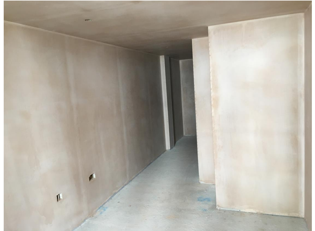
Student wing – Drylining & plasterwork