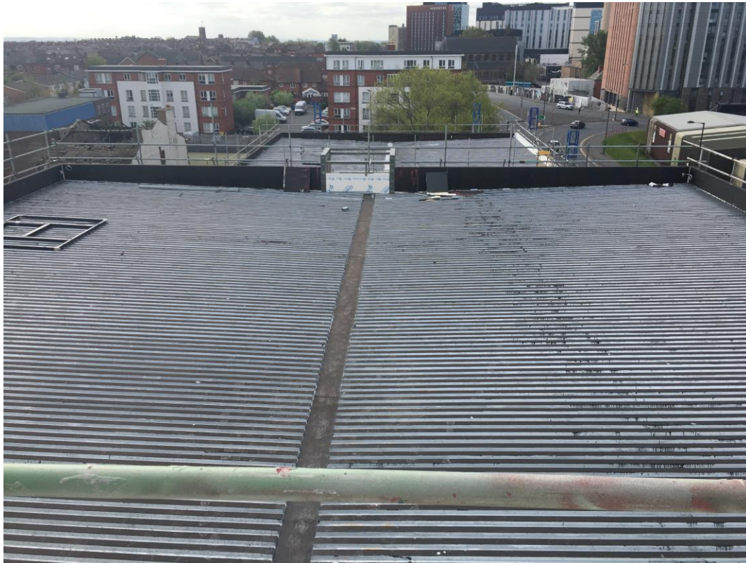
Commercial Block – Metal decking structure