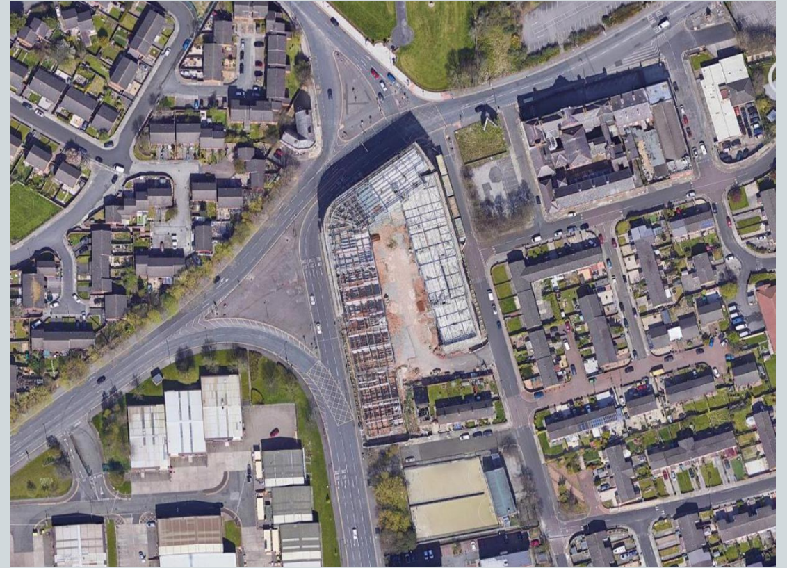
Aerial view of Element – The Quarter site location