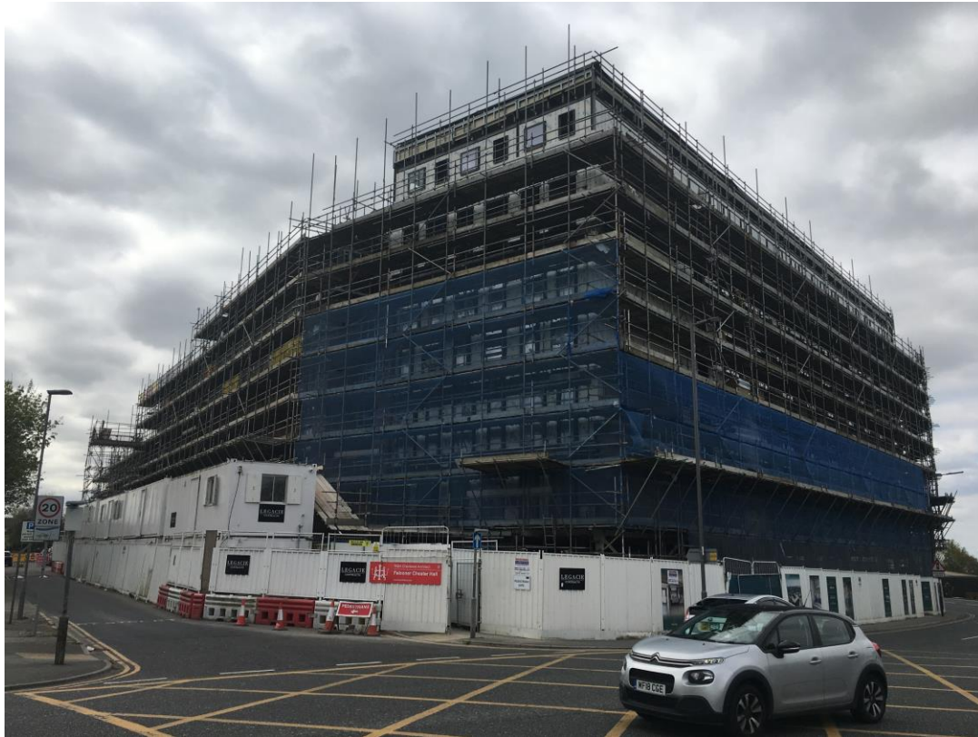
West Derby Road - Site view