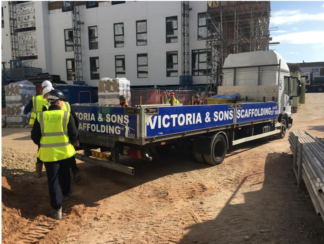
General site activity