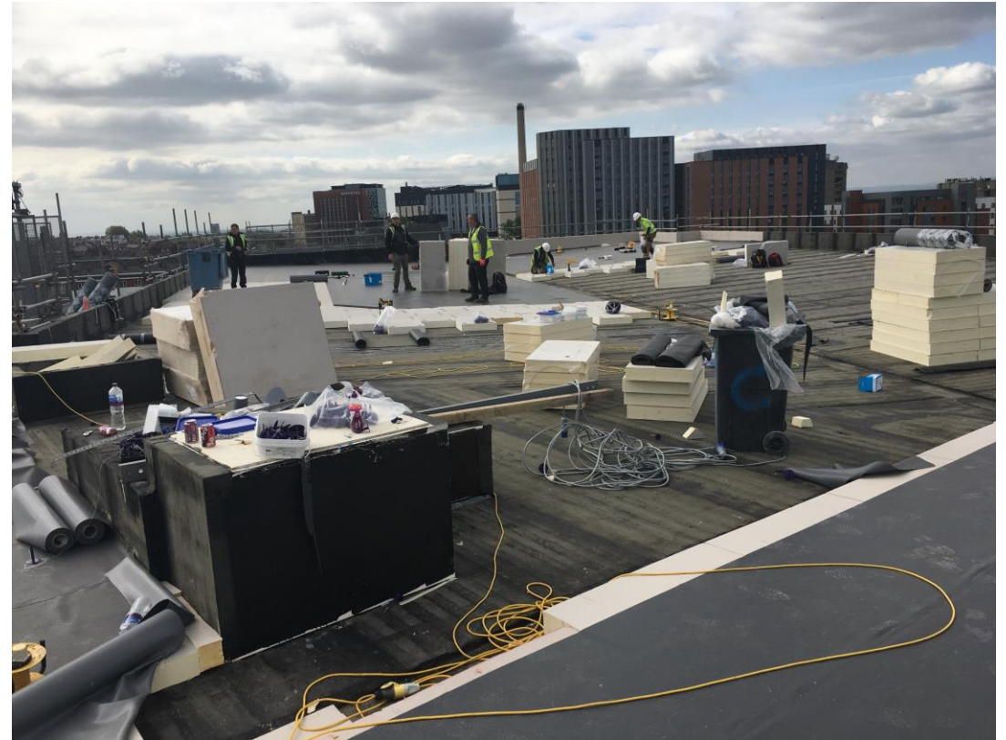
Residential wing – Flat roof coverings progress