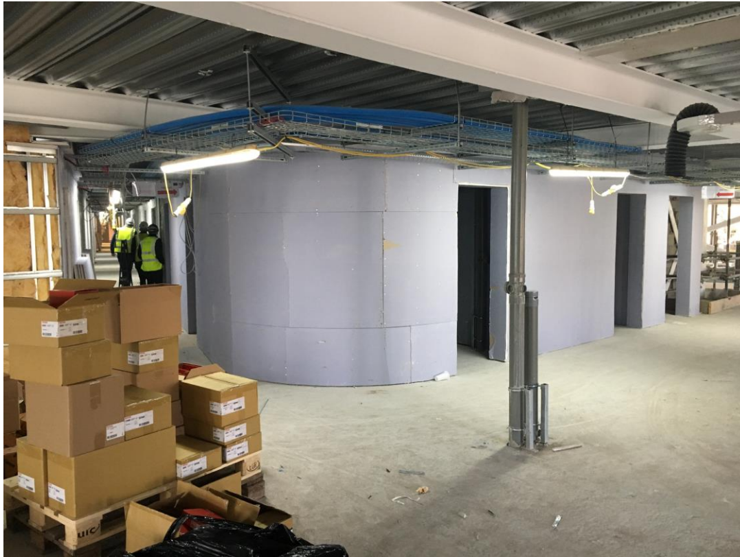
Student wing – Drylining