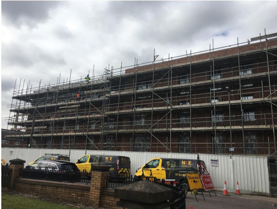
Walker Street - Site view