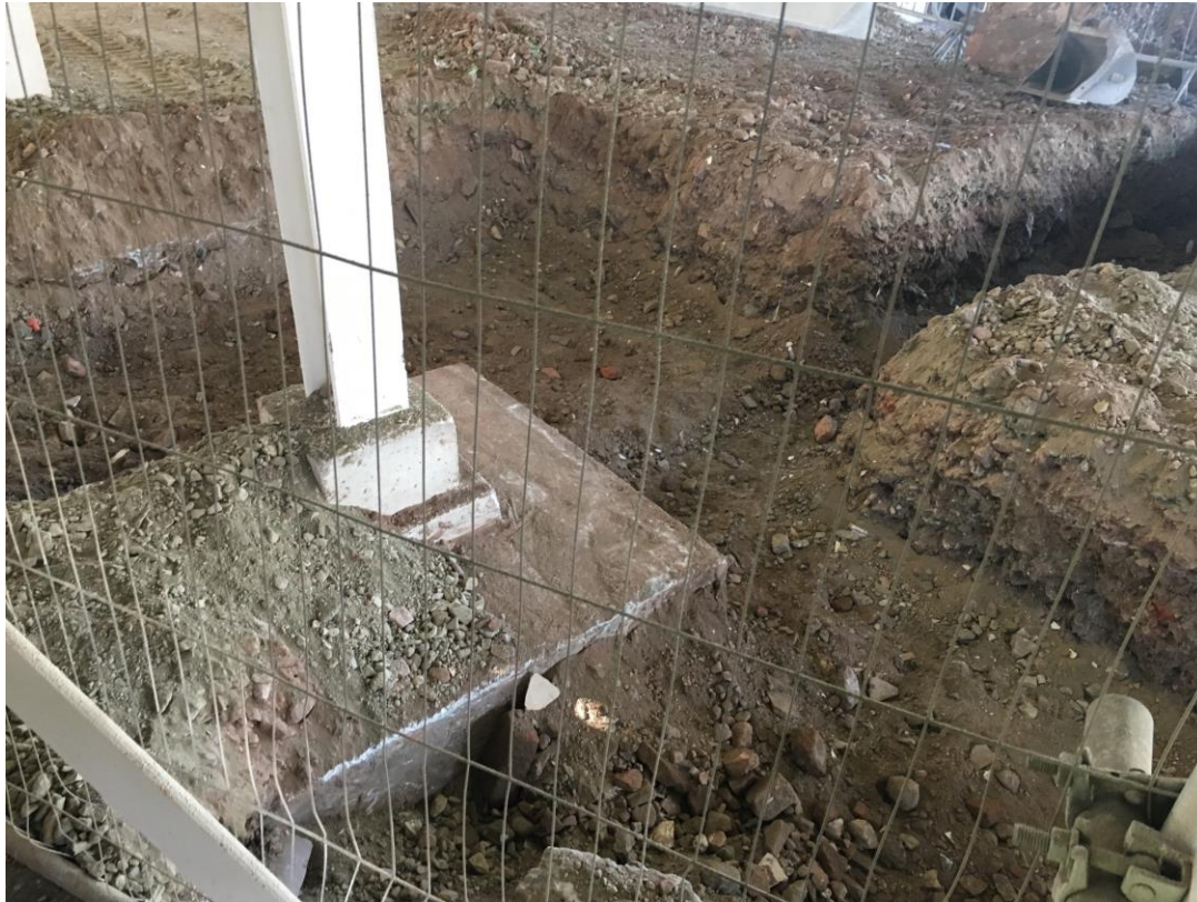
Ground floor - Under ground drainage and ground floor beams