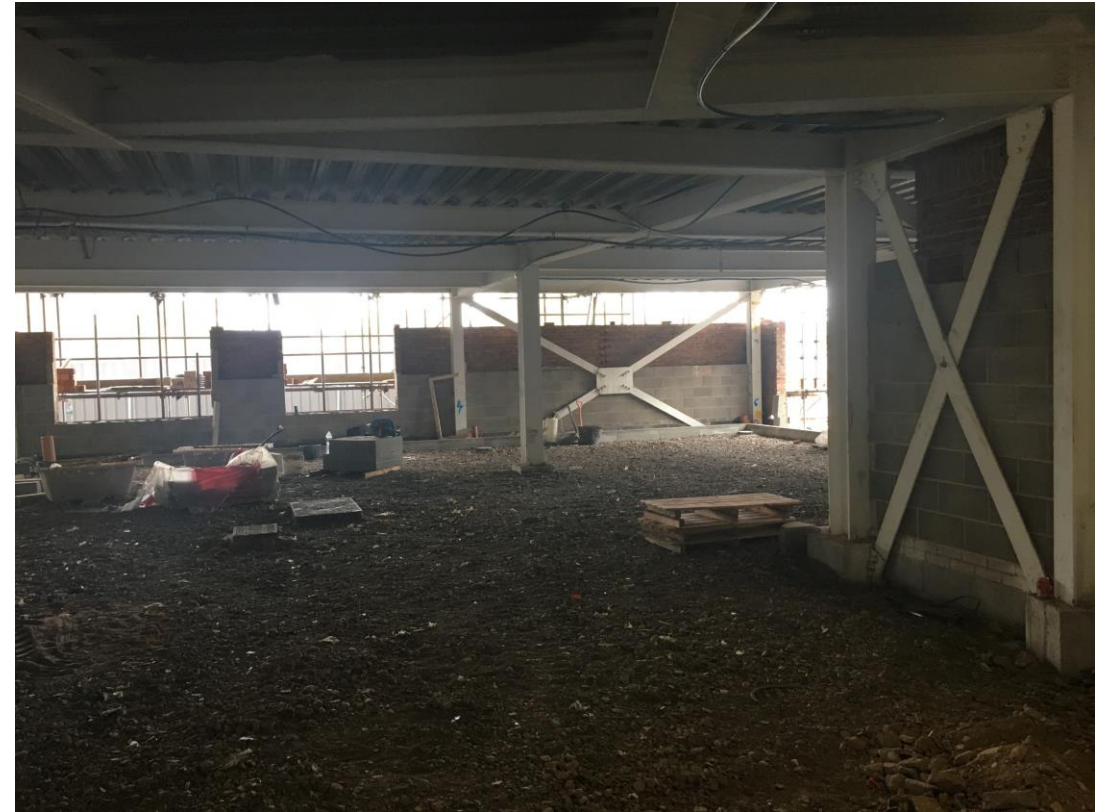
Ground floor - Under ground drainage and ground floor beams