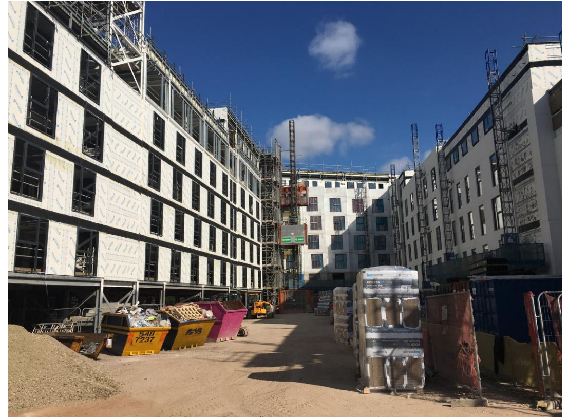
Inner courtyard view – General progress photo