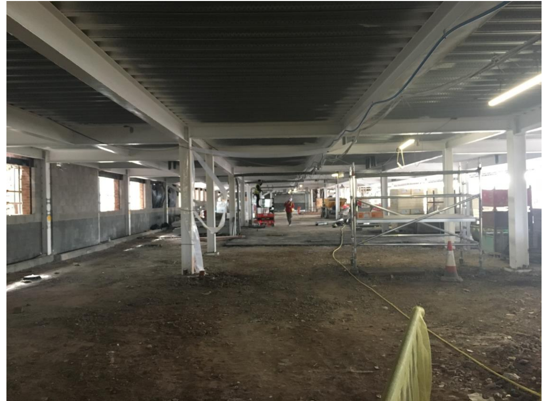
Student wing – Undercroft parking progress