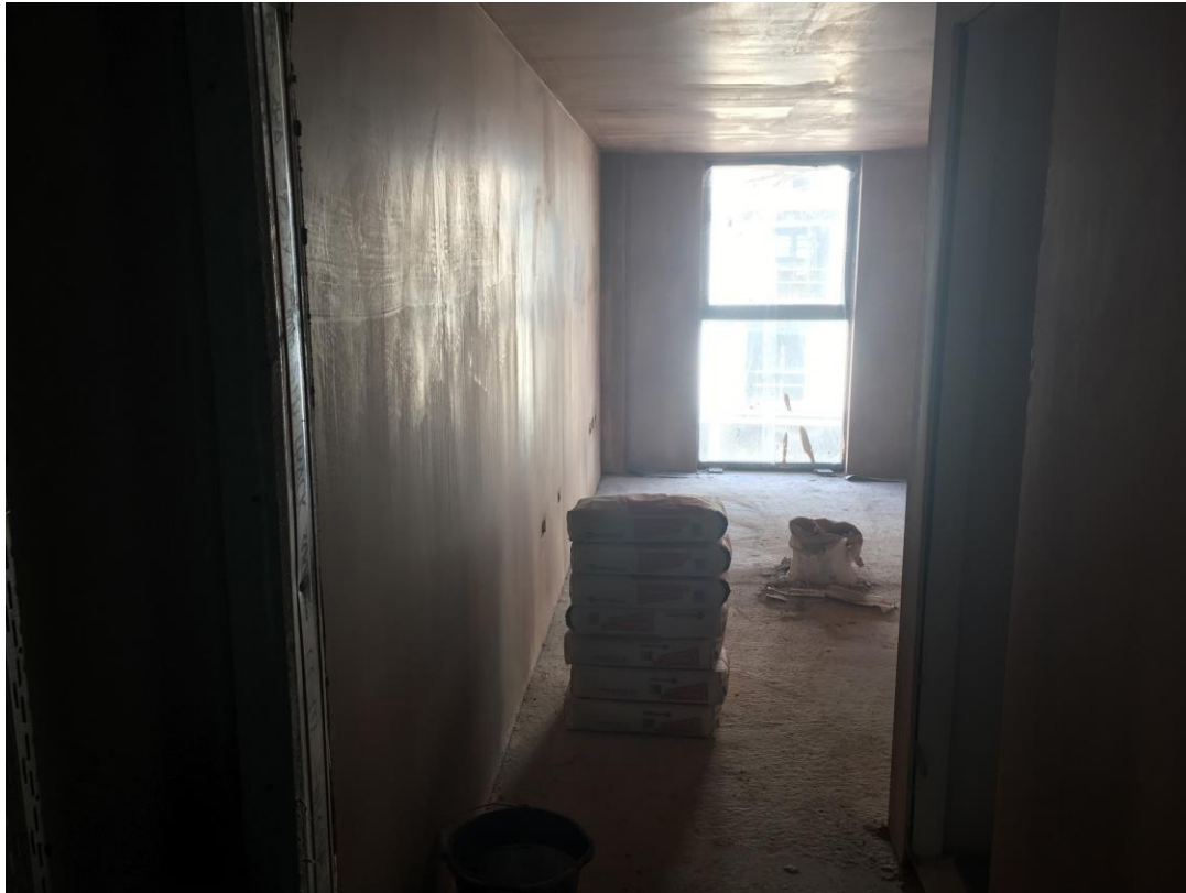
Student wing – Drylining & plasterwork