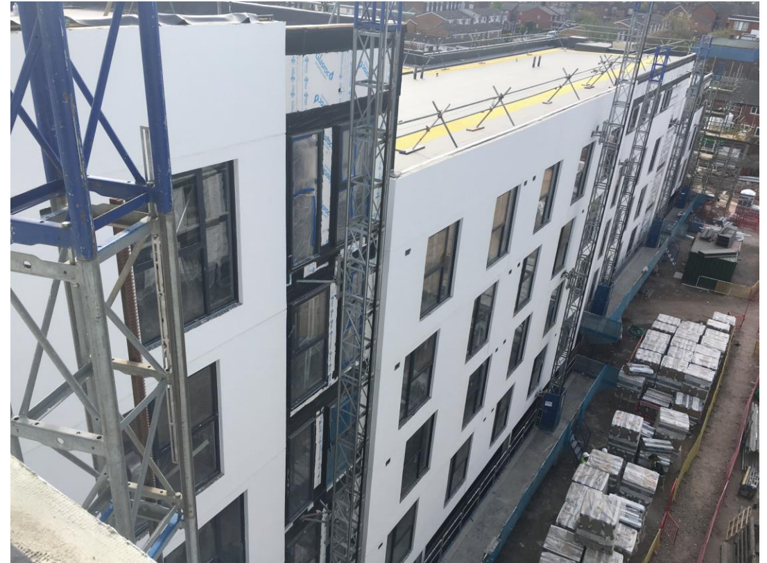
Student wing – Render progress