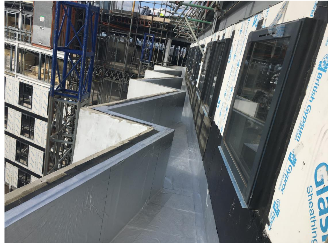
'Zig zag elevation' - External insulation, windows and weatherboard