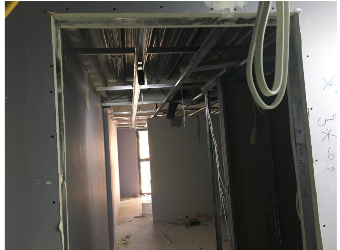
Student wing – Metal framework to ceilings and drylining