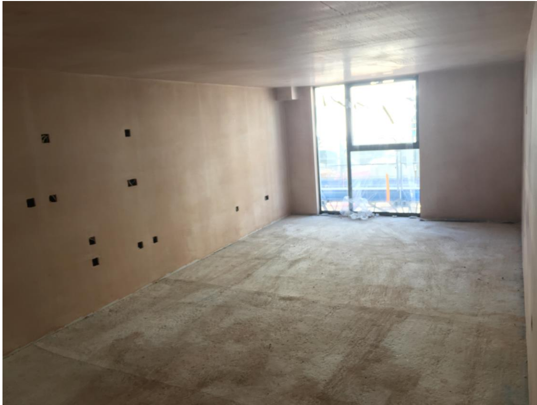
Student wing – Drylining & plasterwork