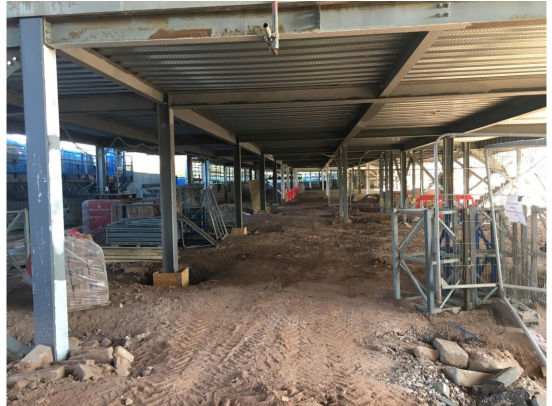
Residential wing – General progress photo