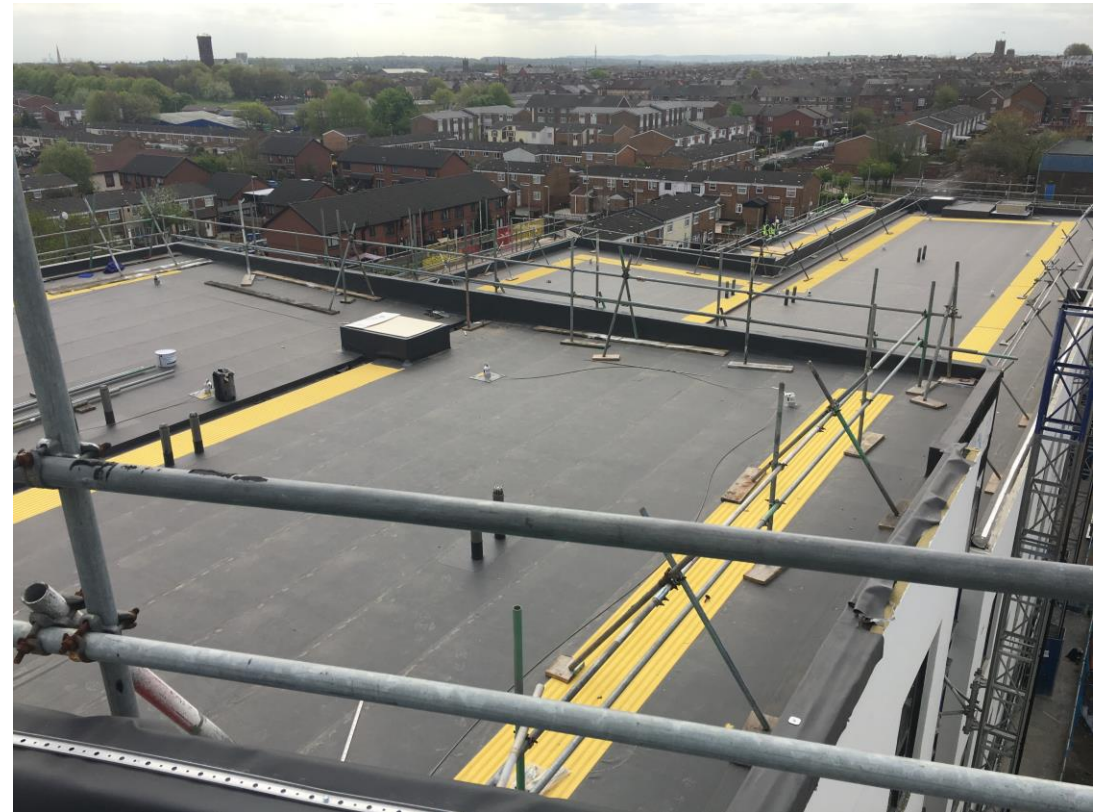
Student wing – Flat roof coverings, walkway matting & mansafe system