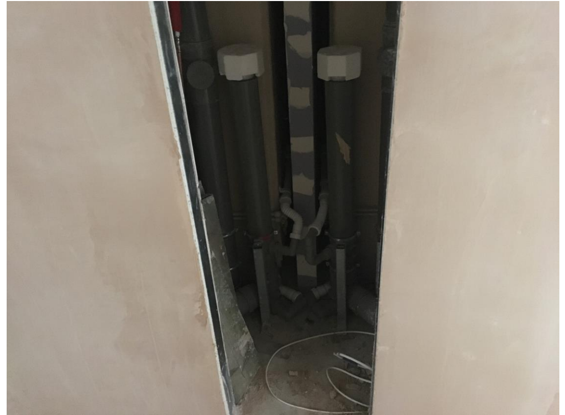
Student wing – Maintenance access hatches