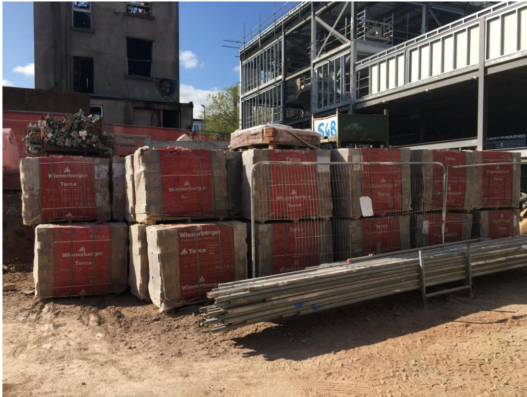
Material storage – Red brick