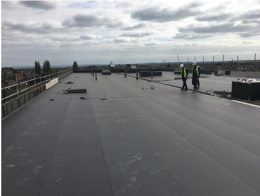
Residential wing – Flat roof coverings progress