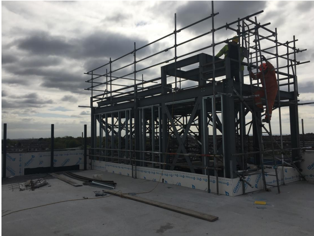
Terrace – Final steel alterations