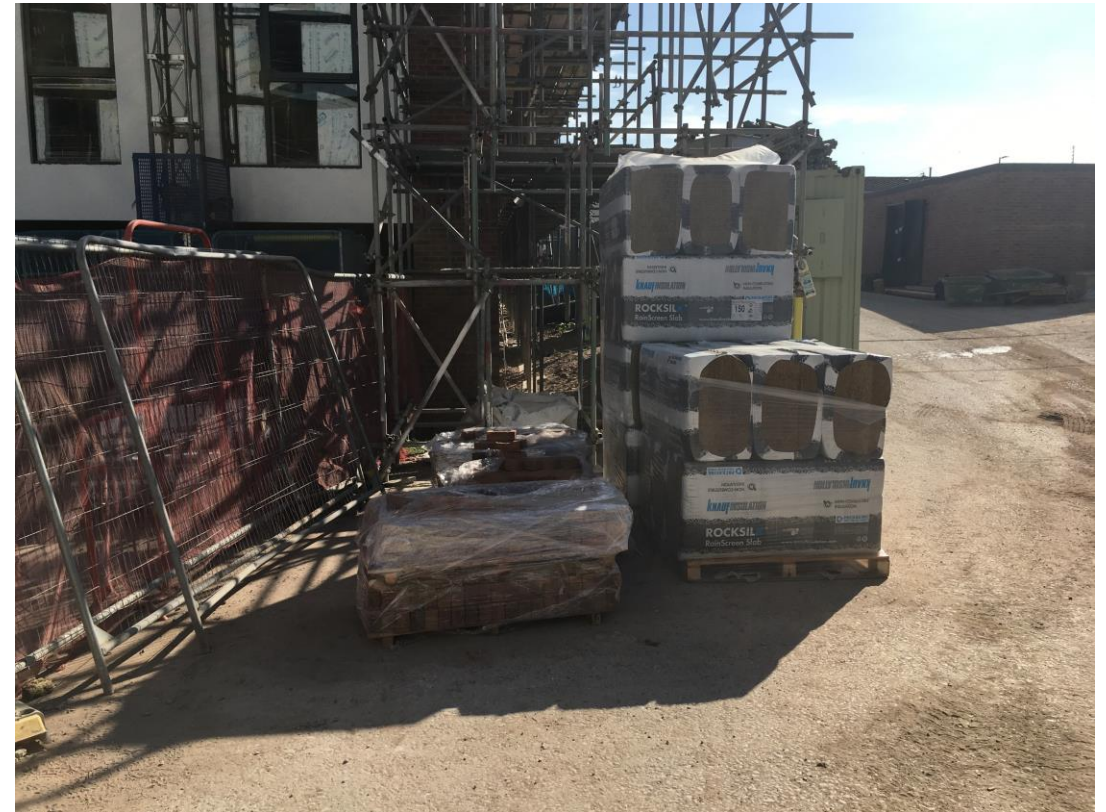
Material storage – Insulation