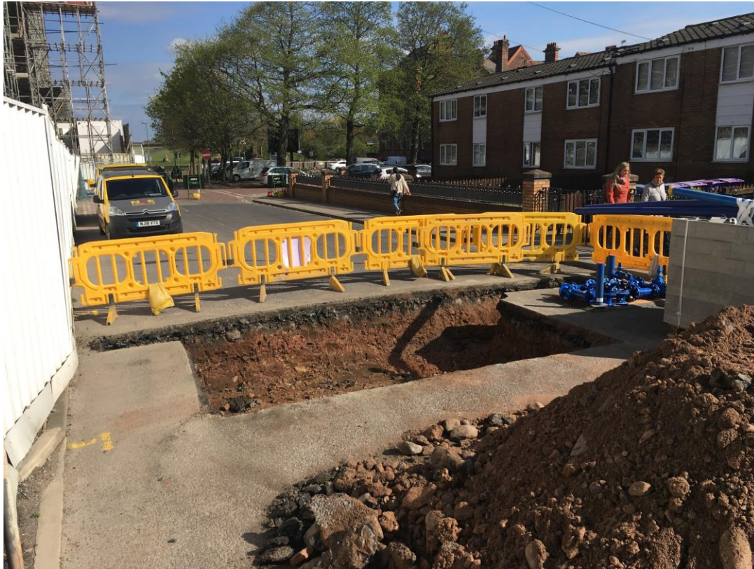
Walker Street - Final Mains Connection